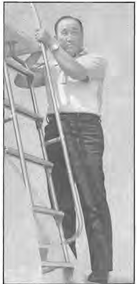
Father aboard the 'New Hope'

Your thoughts and actions must be found in the heart of God. We must pierce right through the heart of God. From this you will learn love for all mankind. What would you like to possess? God. You want to possess the essence of God, which is the heart of love. So God needs someone to love and to be loved by. Where you find love, that is where you want to stay. The Messiah to you is the ideal parent, the ideal husband, brother, teacher. Our goal is to reach the heart of God. We must resemble him. You should ask God to let you be responsible for the world—tell God to relax and take it easy, you'll finish the job. If you become that kind of person, God will love you so much. You must think: "All by myself I can fill Yankee Stadium." We need that kind of determination.