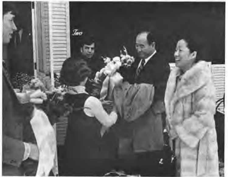
Father and Mother are presented with flowers upon arriving in New Hampshire.