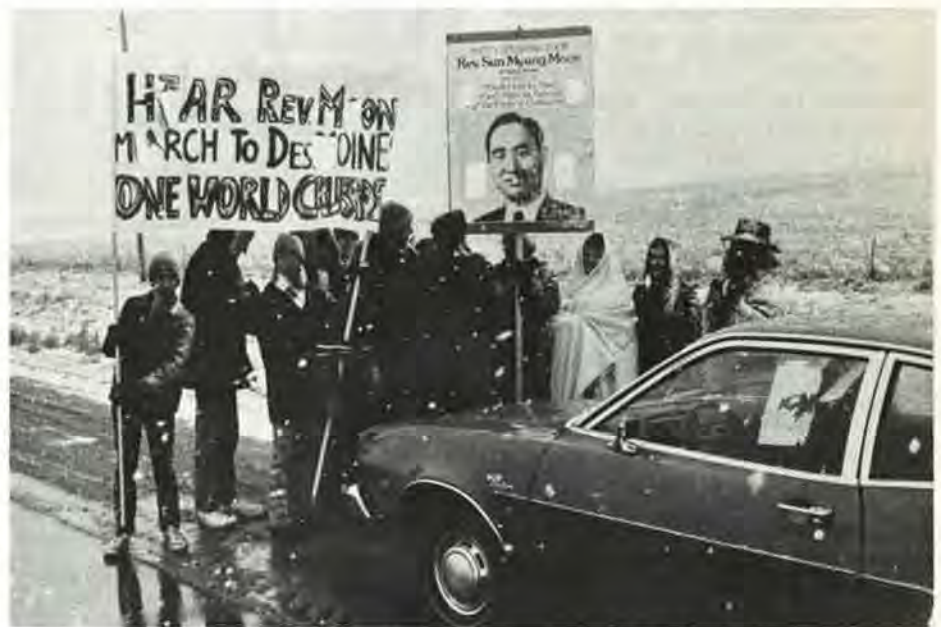
Omaha Family on Highway 6 just outside Des Moines.