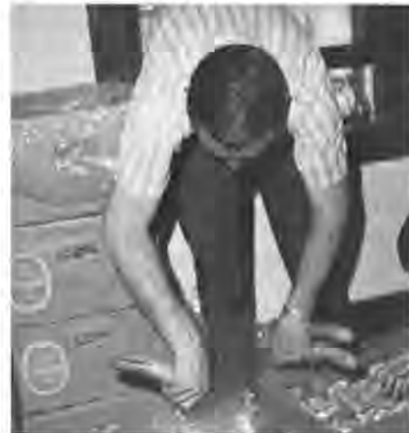
Wrapping literature around one ton of bananas in Omaha.