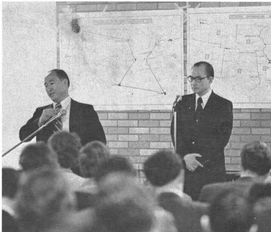
Father addresses conference participants. For details of his address and conference proceedings see conference summary, pages 4 through 9.

After more than five hours of electrifying and inspiring meetings lasting