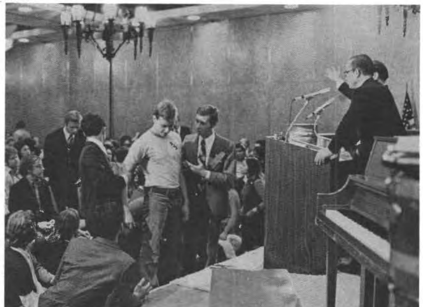
Heckler escorted from Albuquerque speech by Unification Church members.