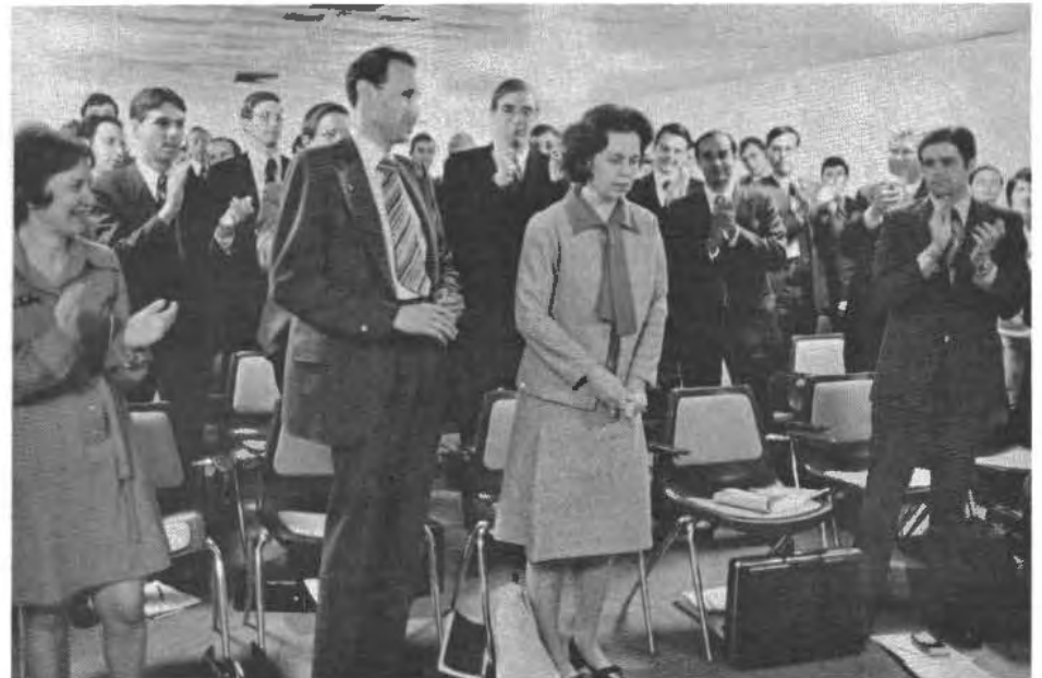
Conference participants applaud winning commander.

Father said the walls will be inscribed with the history of 1973-1974, listing each member and his records. Unification Church members from all over the world will come to visit this shrine, and our grandchildren will seek out the names of their grandfather and grandmother and take photographs of themselves there, and these pictures will become the most precious family heirlooms.