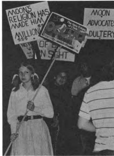
Protesters picket Albuquerque speech.