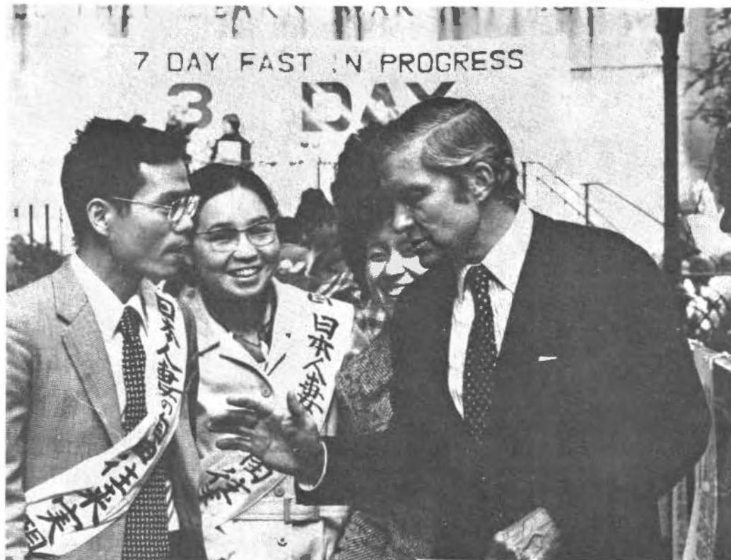
Left: Father greets fasters as end draws near.