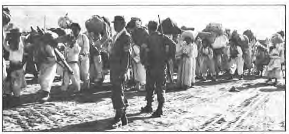
Korean refugees heading south.

Father had special will-God's will to fulfill. For an ordinary man with ordinary strength it would have been impossible to carry him. Father had real strength,