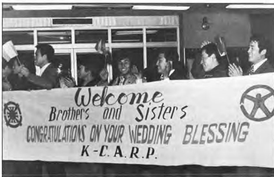
Korean members warmly welcome the Western members at the Seoul airport (below).