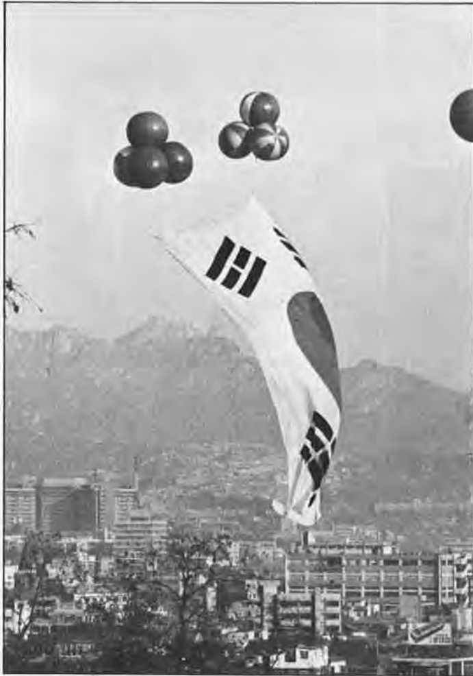
Korean flag is hoisted by balloons high above the Changchung gymnasium on the clear, 18-degree morning of February 8th. Also afloat was a flag with the church symbol and a number of other decorations.

one-third of the resources involved in VOC work, so that the other two-thirds could be easily mobilized for VOC work if necessary. "As a minimum defense line, at least 30,000 Unification Church workers are necessary," he said. However, since we can't wait for 30,000 members, "an unusual method" is necessary to have an equivalent impact. "We need one big blow or attack; an explosive method," he said. This is the intention of the Yankee Stadium and Washington Monument crusades.