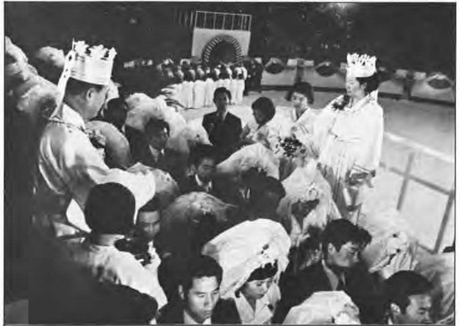
Crossing a platform, members walk two couples abreast between our Parents. The ceremony, lasting several hours, also consisted of congratulatory remarks, the marriage vows, and a prayer by Father. 108 Western couples participated.