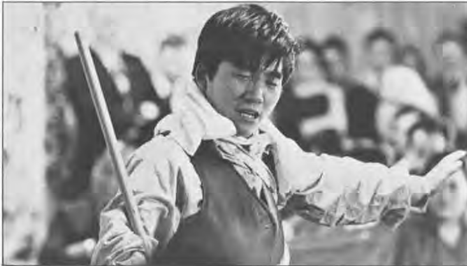
The entertainment, won by a Samurai play, was thoroughly enjoyed by our Parents and their family.