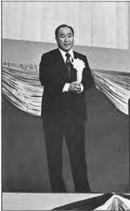
Father at the Budokan (above). Crowds await the hall's opening (below).

Tokyo's Nippon Budokan Hall, the "Japanese Madison Square Garden," had people standing in the aisles to hear Rev. Sun Myung Moon speak on "The New Future of Humanity" on February 13. The 15,000 seat auditorium, used mainly as a sports stadium, was jammed with 16,000 spectators, according to eyewitness reports. Father's sermon was delivered in fluent Japanese.