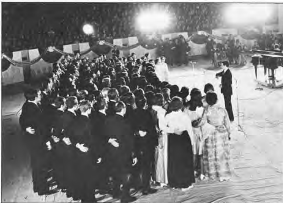
Western couples sing "Arirong," "Tongil," and "Come and Go With Me to that Land" for the entertainment at Changchung Gymnasium on the 8th. Also entertaining were professional performers, representatives of the Korean and Japanese churches, and, as a finale, the Little Angels.

The biggest miracle, of course, was Father's selection of our mates on February 3. Before the matching began, Father spoke to the candidates on why we call our marriages a "blessing." He said that the original purpose of God's creation is the four position foundation; therefore, God's primary goal for mankind and the primary purpose of the Messiah is to establish the true family. In the four position foundation, the vertical love coming from God to the children is subject, while the horizontal love between the mates is object. Therefore vertical love is most important in the marriage. "In the Orient," Father said, "husband and wife tend to