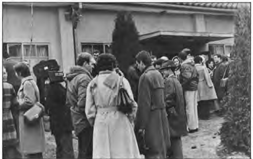
Newly-matched Western couples waiting outside the dining room at the training center. Present and filming is NBS news.

park, was donated by the government, and the Center promises to be a major cultural center for visiting foreign dignitaries when it is completed.