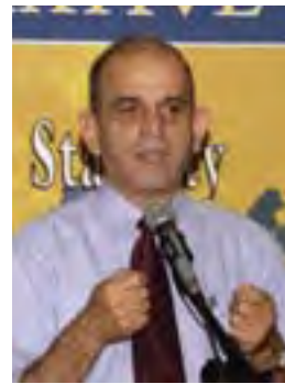
Ran Cohen, Member of the Israeli Knesset