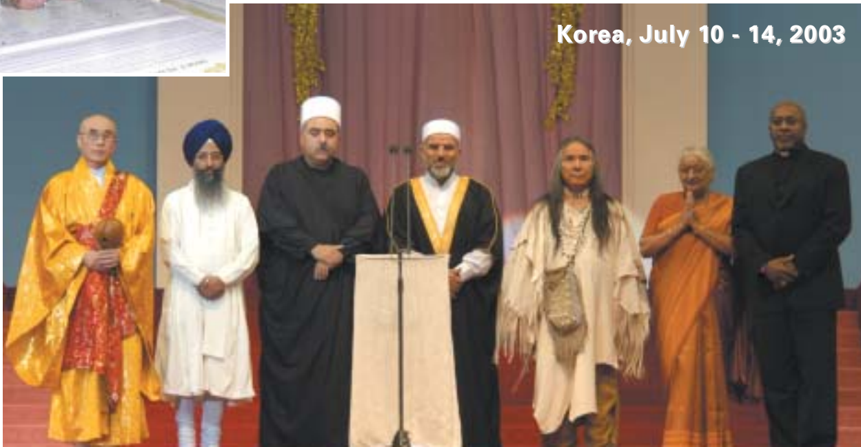
Korea, July 10 - 14, 2003

Component II: seeks to establish recognition of accountability to a “higher” source—one to whom all are equally accountable. By recognizing past grievous actions on all sides, what becomes most critical is that each person commits to constructive, self-giving preventive actions rather than resentment and revenge. To accomplish this phase quite literally requires each person to