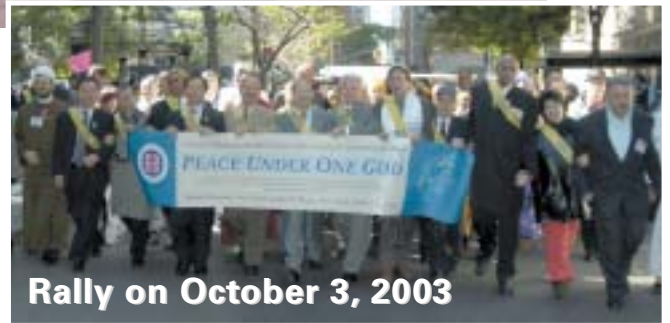
Rally on October 3, 2003

Component III: builds solidarity to strengthen the tenuous “new beginning” of the first two phases. Actions will take the form of interreligious and international cooperation guided by the needs of the “larger good.” In other words, we will start to see the emergence of one “family of Abraham” seeking the greatest opportunities for peace and prosperity for all in the region.