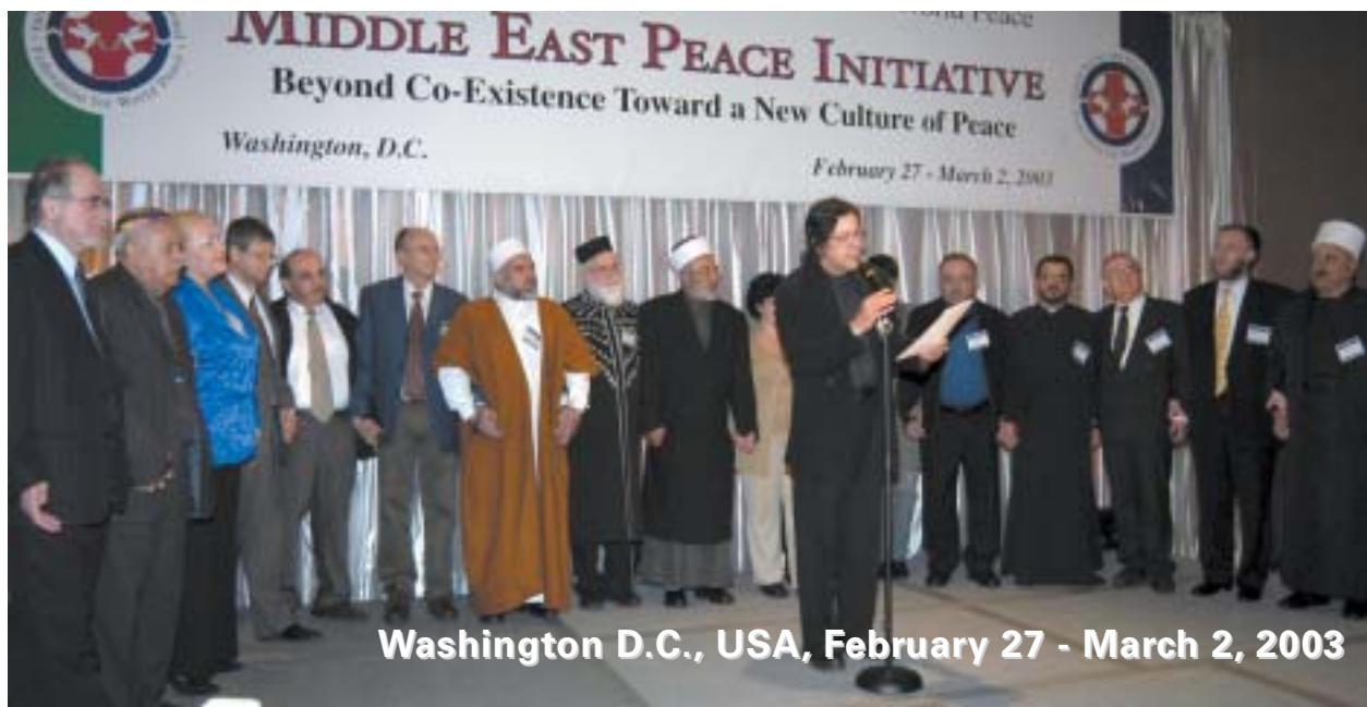
Washington D.C., USA, February 27 - March 2, 2003

On this foundation, the IIPC is using all its resources for a major peace effort in the Middle East, which will include nationwide rallies for peace in Jerusalem, Tel Aviv and Gaza. It is hoped that these events will be the catalyst for a major new endeavor to bring peace to the troubled region. These efforts can further encourage other civil society initiatives such as the Geneva Accord and the new US "National Interreligious Leadership Initiative for Peace in the Middle East" that is encouraging the White House to make "more active and determined" efforts for peace in the Middle East.