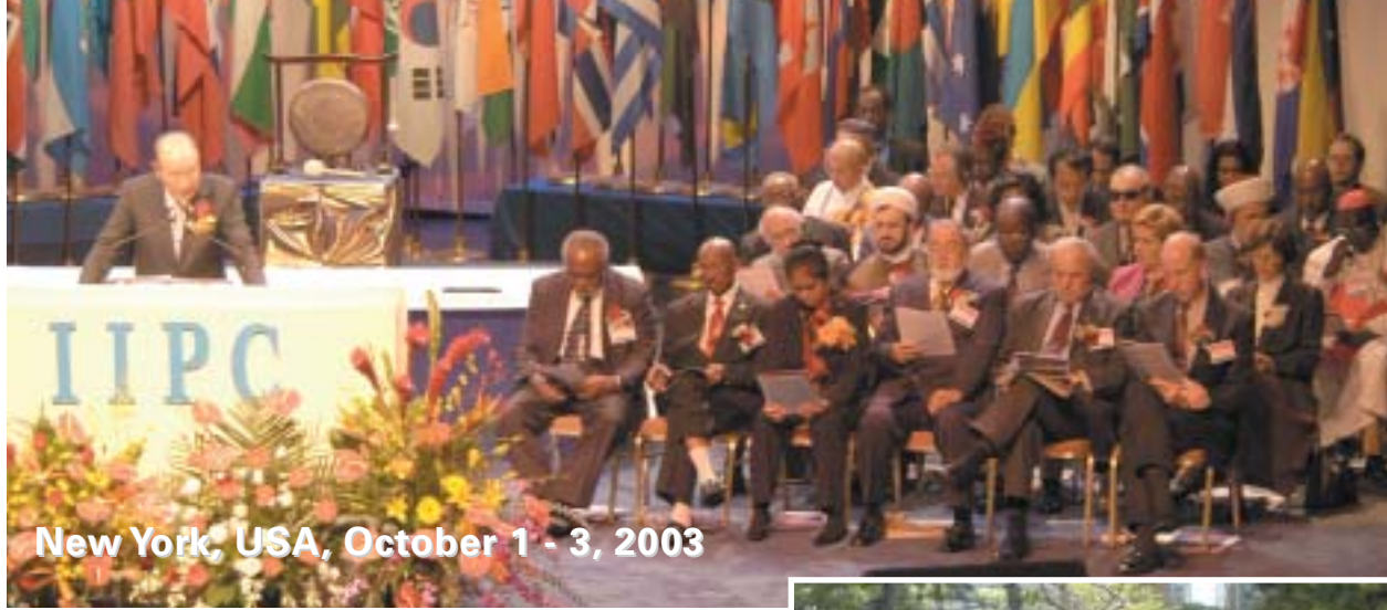
New York, USA, October 1 - 3, 2003

genuinely turn and face their God. Then to seek and adopt that point of view as their own, as a sign of submission to, or faith in, or obedience to Him.