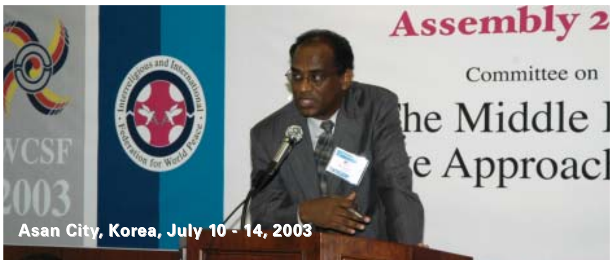
Asan City, Korea, July 10 - 14, 2003

IIPC's approach to this global crisis is innovative. Perhaps what speaks loudest about this approach is that in September of this year the Al Aqsa' Mosque hosted the first international