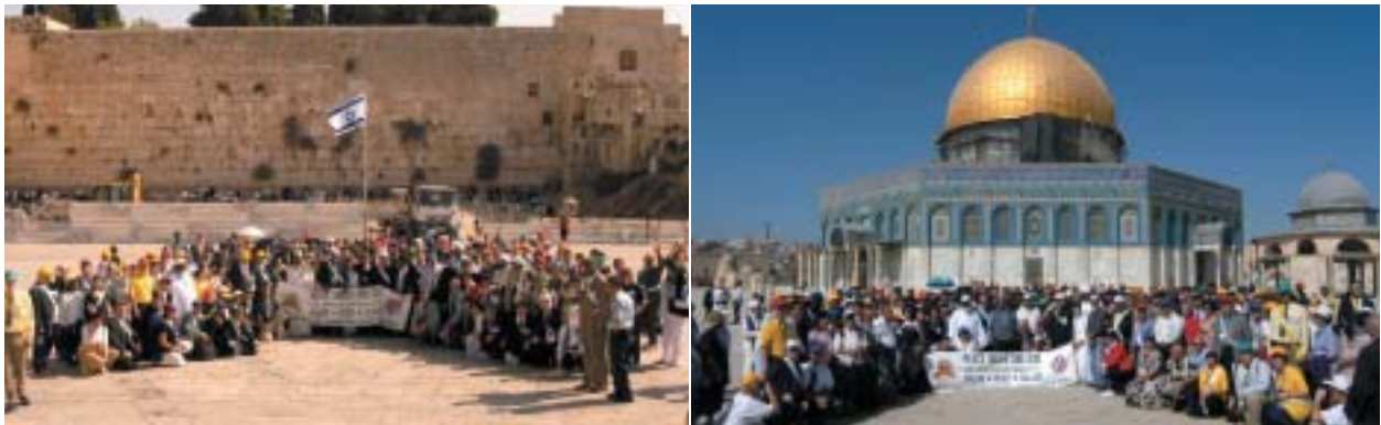
September 16-24, 2003

Much of the preliminary work of the MEPI has been to create the necessary international support system and foundation for the overall IIPC strategy. Without this tremendous level of support from outside, those in the region will not be able to take the necessary, life-threatening steps to peace. The support that comes from “outside” must be a total