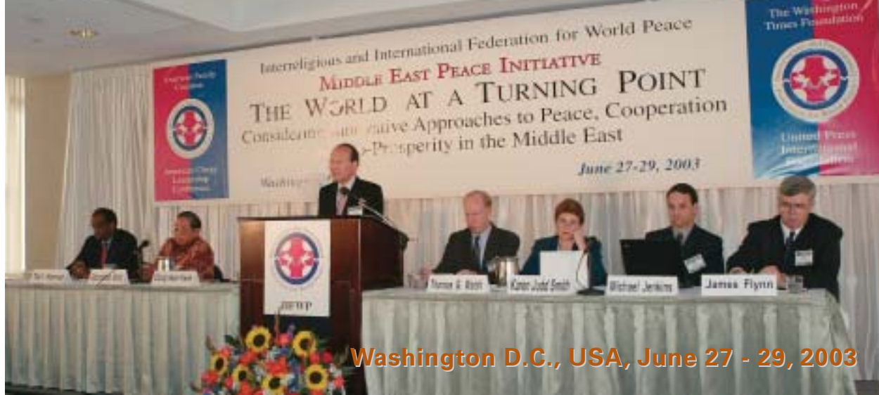
Washington D.C., USA, June 27 - 29, 2003

October 1-3, 2003 , IIPC Inauguration and Peace Under One God (Peace March and Rally) , Dag Hammarskjöld Plaza, New York