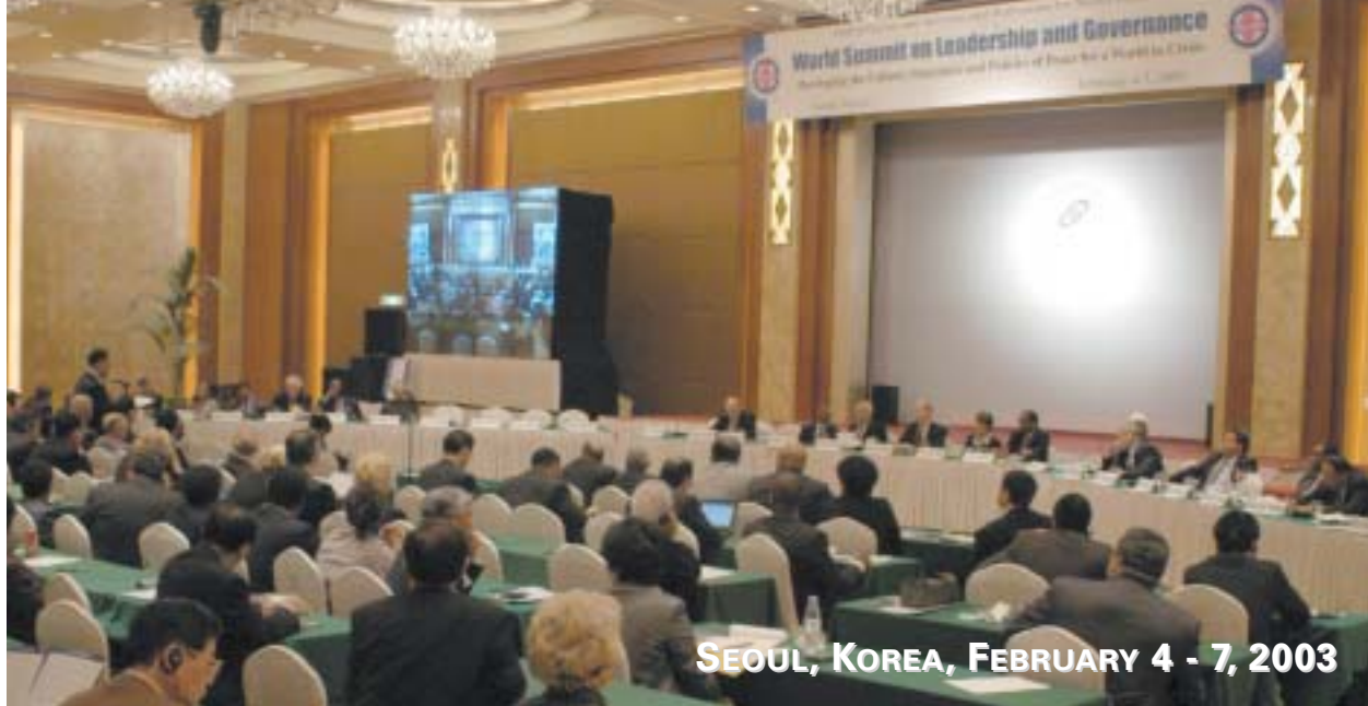
SEOUL, KOREA, FEBRUARY 4 - 7, 2003

The IIPC's affiliated organization, the American Clergy Leadership Conference, the largest interfaith clergy organization in America, spearheaded these early efforts, bringing large groups of Christian, Jewish and Muslim clergy to the Middle East despite the personal challenges and dangerous environment they faced. They expressed love and support for both Jews and Muslims and a commitment to the cause of peace. They walked the streets of Jerusalem and Gaza. Many of these clergy are veterans of the American civil rights movement and carry with them the legacy of Dr. Martin Luther King, Jr. Their dedication, activism and perspectives on peacemaking have been instructive to both sides.