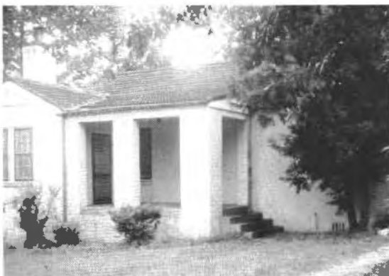
Columbia, South Carolina Center