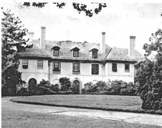
Belvedere Estate's Main House