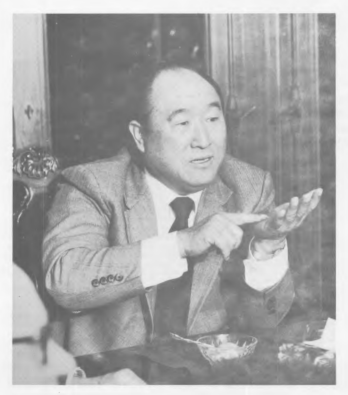
The purpose of 6,000 years of history is consummated in Father.