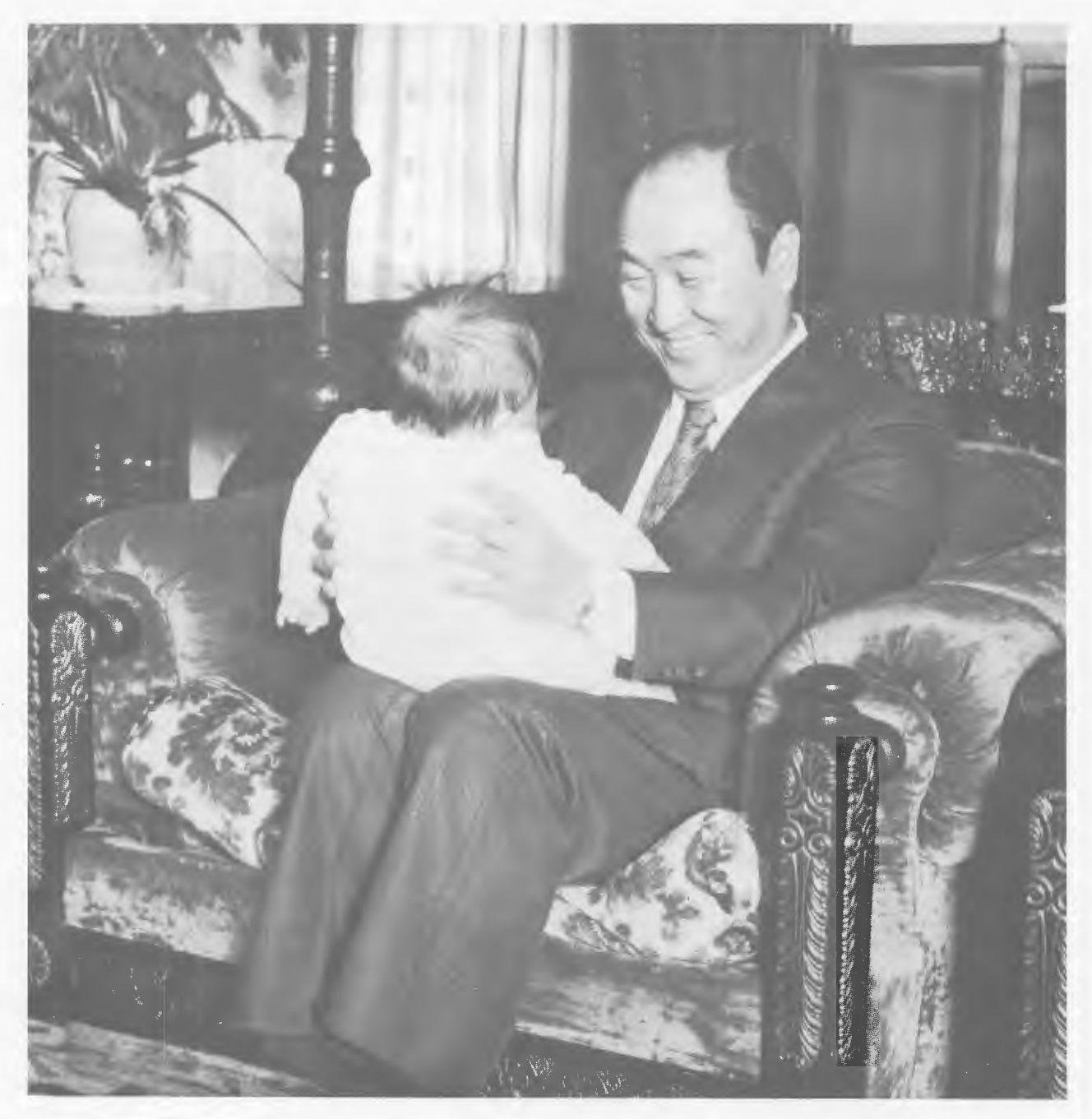
The mightiest person is the one who is moved by the impulse of love.