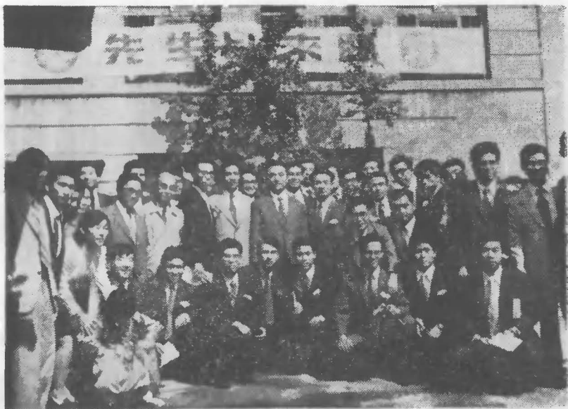
Directors of the Japanese Unification Church visit Taegu Church during their tour across the country.