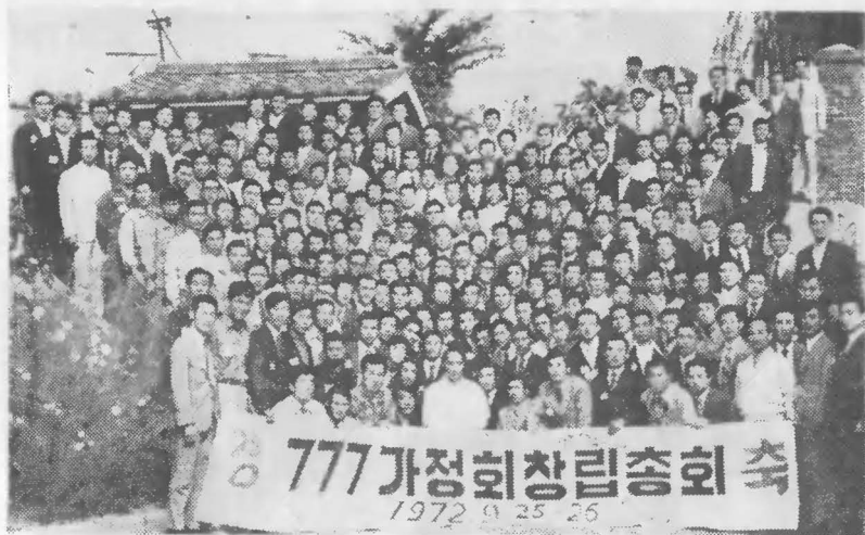
The Founding Meeting of the 777 Blessed Couples Association was held for two days between Sept. 25 and Sept. 26 at the Training Center, Seoul.