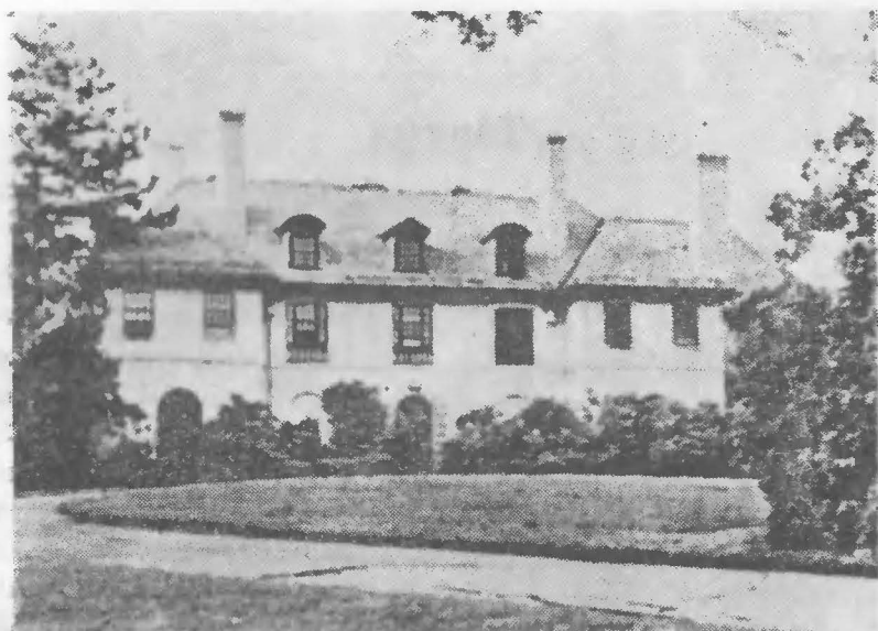
Belvedere Estate's Main House in New York. This estate will be an international training place for family members.