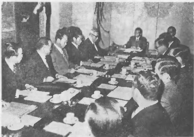
President Park Chung Hee, center at the head of the table, presides over a session of the Extraordinary State Council at Chong Wa Dae on October 27th when the council passed the new Constitution draft.

The President is, under the revision draft, to be empowered