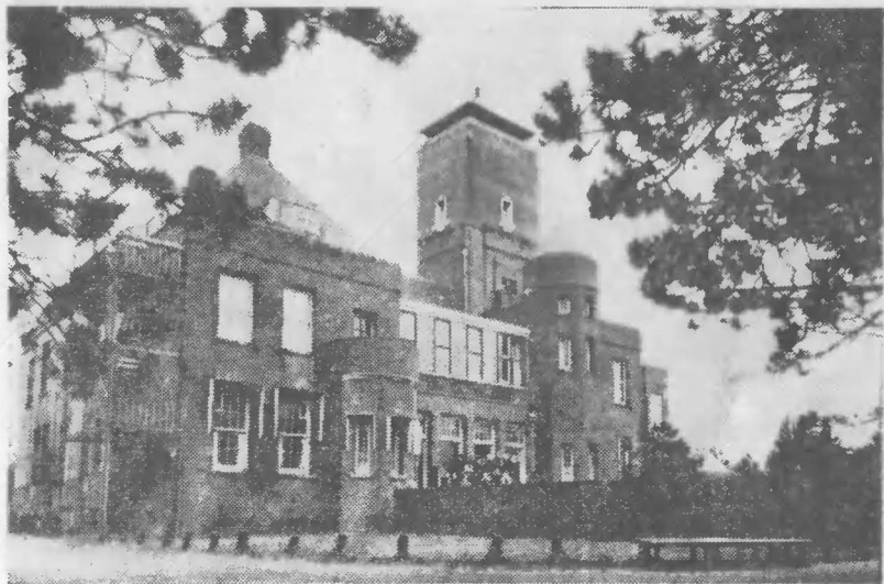
"Russenduyn" becomes a new center for the Unified Family members.