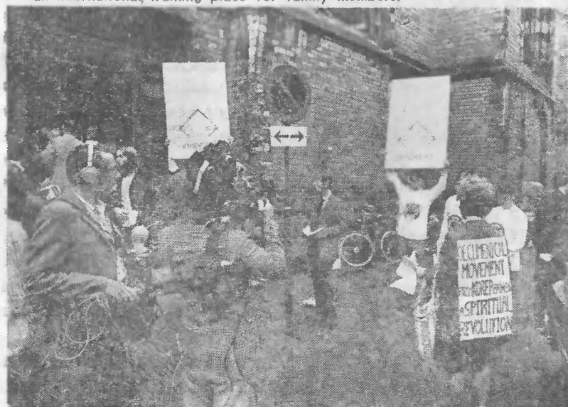
"Witnessing on the Street" in Amsterdam. T.V. camera has conveyed this scene all over Europe.