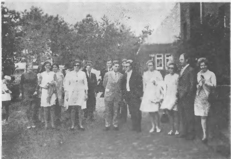
The European Family members visit at the new center of "Glory" in Holland.