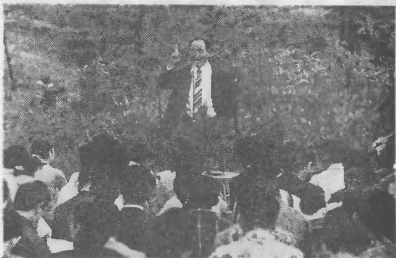
Master speaks at the Open-air Service on October 14th in the vicinity of the Training Center, Seoul.