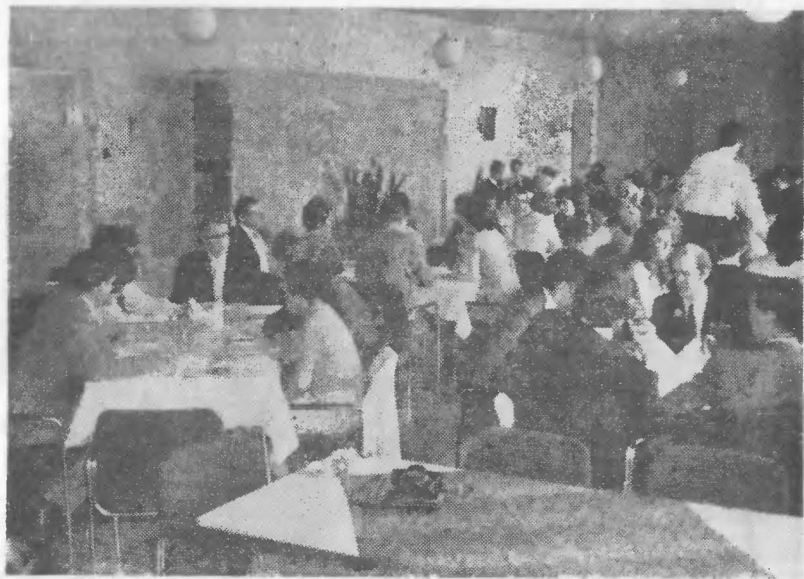
Fellowship and meal at the Conference.