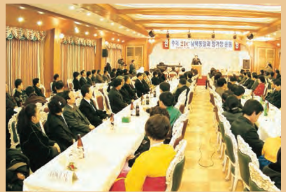
A presentation on "North-South Unification and True Family Movement for the 21st Century" at Yosu in the far south of the peninsula, Jan. 28