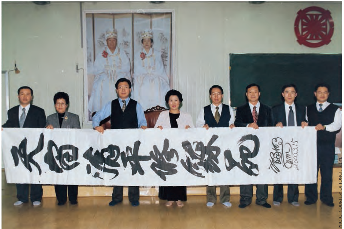
Chong Pyong staff hold Father's calligraphy in the main auditorium at Chong Pyong

Although the Chong Pyong Heaven and Earth Training Center is on earth, through True Parents' blessing it has become a special training center for the salvation of people in both the earthly and spiritual realms. Through its connection with Heung Jin Nim's training center in the spirit world, Chong Pyong Heaven and Earth Training Center has a new position in the work for the salvation of all people on earth.