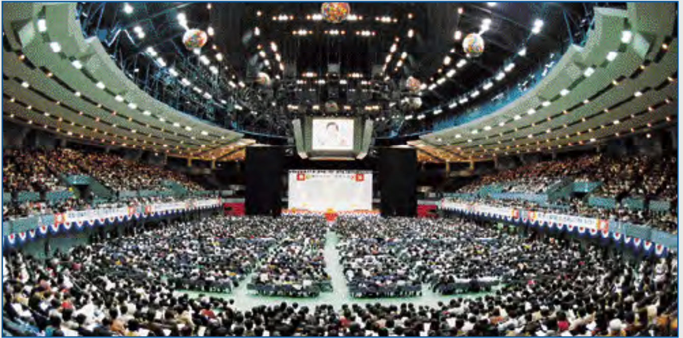
Photos: Facing page, True Mother in Nagoya; this page above, the March 8 rally at the Hiroshima Sports Center; below, left to right, Mother speaking in Nagoya; Father and Mother are connected by video phone for the celebration following Mother's speech in Fukuoka; Mother chooses numbers for the winners of pure love rings; True Parents gives a donation for the care of the elderly (Tokyo); Mother receives a special gift from an artisan in Tokyo