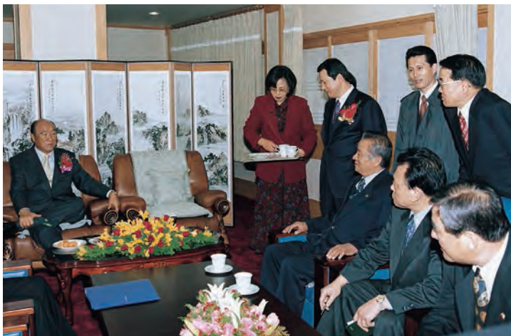
Behind the scenes Father met with local dignitaries in each region of the country; below, Father and the Mayor of Incheon greet each other (March 3)

and put aside your husband, or wife, or parents, or children, or whatever, for the sake of the nation. Otherwise, we cannot establish the nation that embodies our hope. When that nation is established, you will find your parents at the same time. If you can't establish that nation, you'll have to sit and see your parents shedding their blood, your wife shedding her blood, your children spilling their blood. Is there anything worse than that kind of situation? Therefore, before we find that nation, we cannot love our wives, we cannot love our parents, we cannot love our children. This is the path that Christians need to go, the path that the Unification Church needs to go.