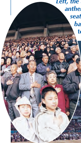
Left, the audience stands for the national anthem; below, many seek a comfortable seat on the turf in front of the stage. The balloons are arranged to read "Nam buk tong il" (South-North Unification)

However, throughout the history of the providence of restoration, there has been no one who has actually practiced these words. If there were people who could love their ene-