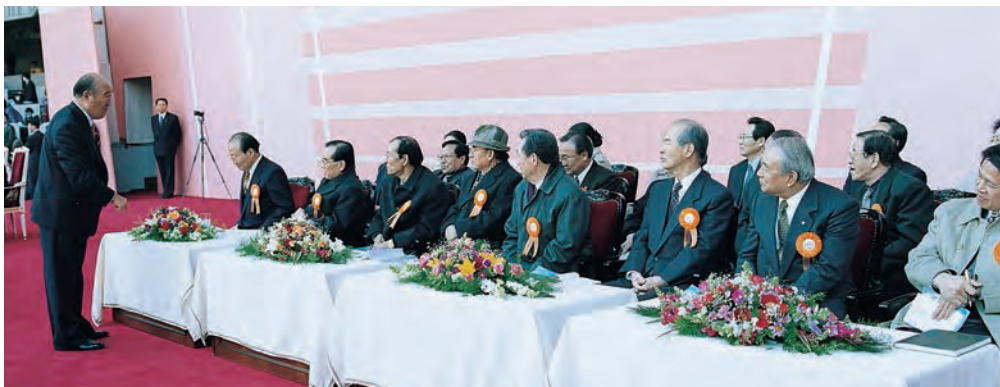
Top, Father turns to the VIPs on stage and challenges them to lead by example; bottom, a security brother helps remove celebration streamers covering the stage

of the world think I am pretty ugly. But God loves me the best. Even if the world thinks that I am a terrible fellow, God recognizes me, so I can go at this world from a bold and open position.