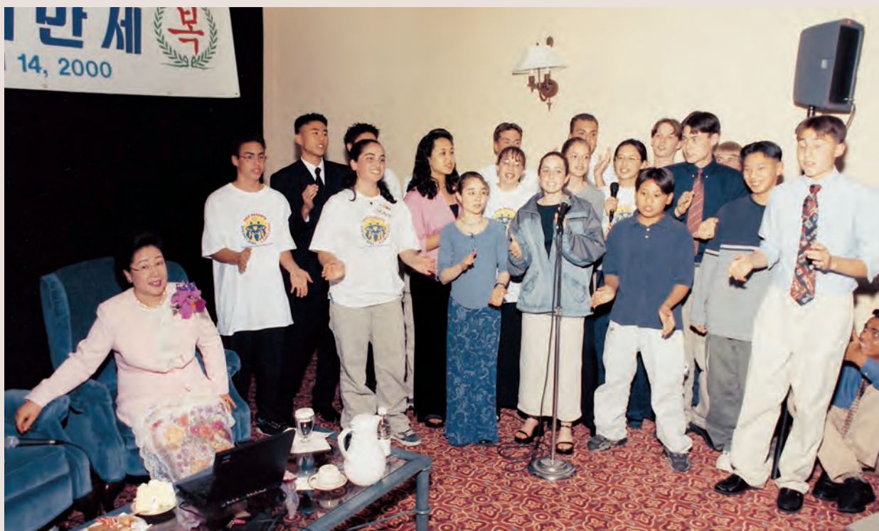
True Mother listens to a second generation group song in San Francisco following her speech there on April 14

This is the time when the Parents and children who have been long-separated meet again. It is an age when there is free communication between the spirit world and the physical world, and when God's Kingdom is established in Heaven and on Earth.