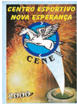
CENE's logo is the same as Il Hwa's

Football is the most prominent sport in Brazil. Prior to the creation of CENE, the nearest team of comparable level was about 250 kilometers away. Launching a team for this popular competitive sport in Jardim has thus brought new life to this town, as well as to surrounding communities. Crowds of several thousand regularly attended home games this past sea-