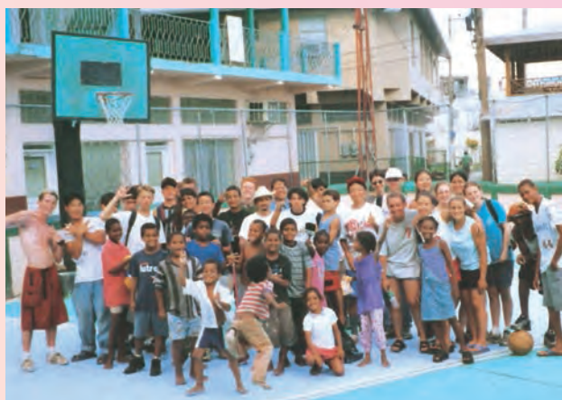
Honduran children join the painting crew that restored the beauty of this local basketball court