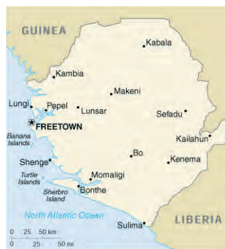
Sierra Leone and neighbors

Why do they fight each other so intensely and brutally? Because of the diamonds. You can see fallen human