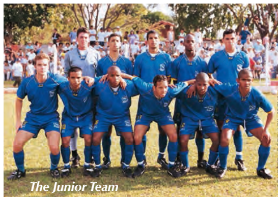
The Junior Team