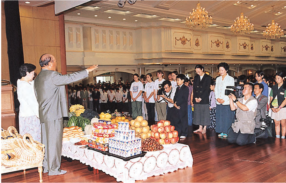
Father and Mother pray at the "Transition of the Three Ages Realm of Oneness Unification Blessing Ceremony"

should learn this by heart and create a unified realm between the physical and spiritual worlds. When a father goes to the spirit world, he becomes an elder brother to his son and the son becomes a younger brother to his father. Therefore, a father and his son can equally call God "Heavenly Father." What it means is that both fathers and sons are sons before God. Do you understand? [Yes.]