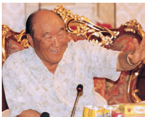
True Parents' arrival at Hannam-dong residence, September 21