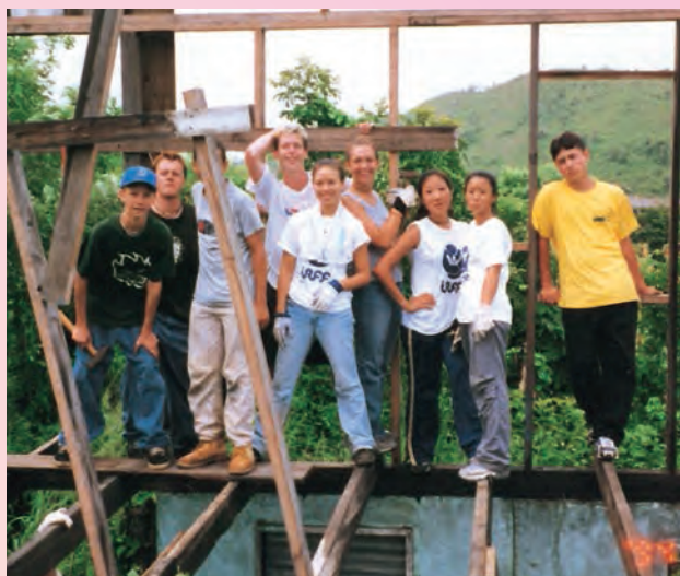
A divine demolition squad poses in the ruins of a house it is about to tear down

not doing hoon dok hae or other inspiring things to grow internally. I have two younger sisters that look up to me very much, so I sacrifice a lot to be a good example. If anything bad happens to