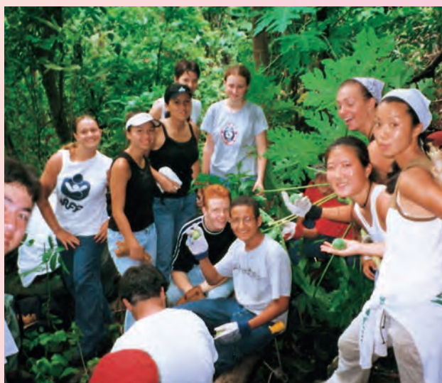
Hanging out and eating fruit in the jungle