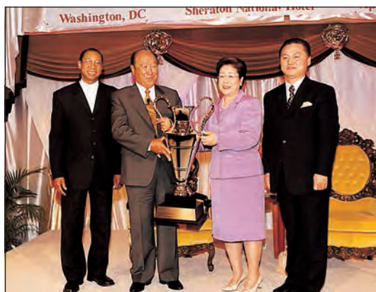
The 42nd Anniversary of True Parents' Holy Wedding April 28th, Washington, D.C.