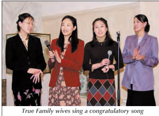
True Family wives sing a congratulatory song

gather people one by one. I will have to educate them one by one, again. You should not think you are going there all together with me. Do you want to go to the spirit world with me or without me? I don't want anyone to come with me. Haven't you hurt me enough in this world? Haven't you broken my heart enough? When I asked you to work, you said, "You didn't feed us enough to work. You should feed us, first." That was how you reacted. Think about how you have been to me. What if I said to God that I couldn't carry out the mission He wanted me to do because I was too hungry? It was as if I had to cross mountains, tens of thousands of feet