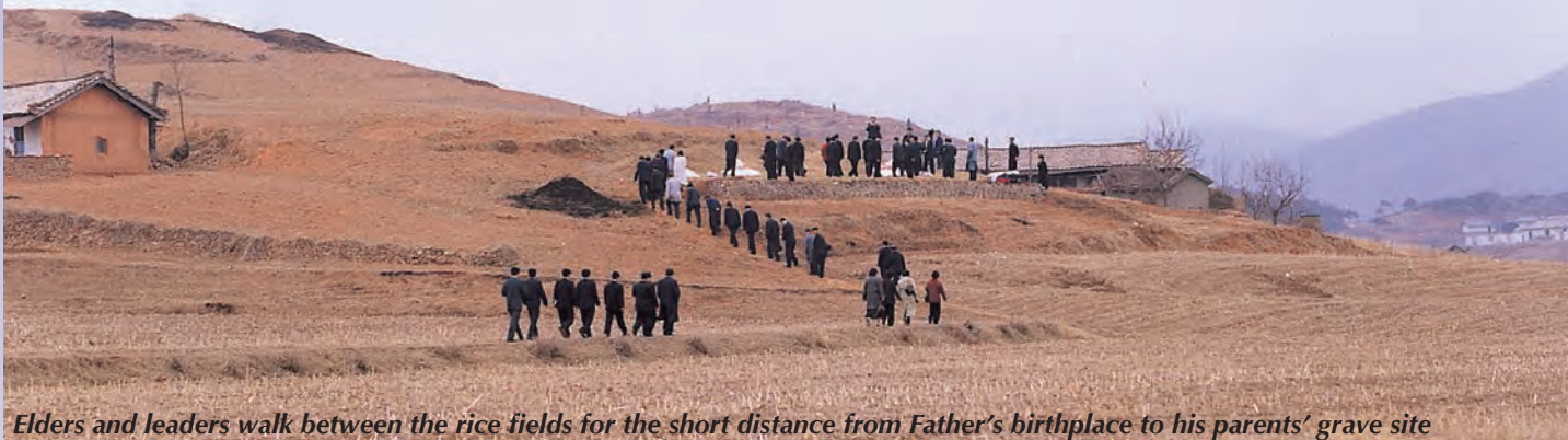
Elders and leaders walk between the rice fields for the short distance from Father's birthplace to his parents' grave site

Father's cousin visits their hometown in the North