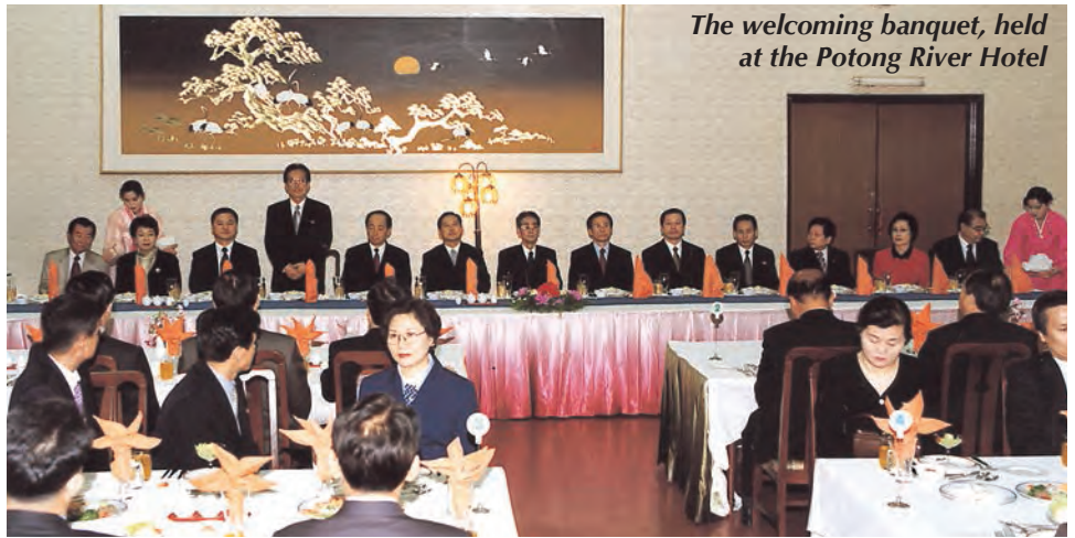
The welcoming banquet, held at the Potong River Hotel

the most advanced scientific age, the 21st century, such a feudalistic nation as North Korea exists. People can travel around the entire globe in a day; the world is becoming a global community. Only North Korea resists taking its place in that community. I don't understand how they have the nerve to say that they can live in their own way, by themselves. It's an enigma to me.