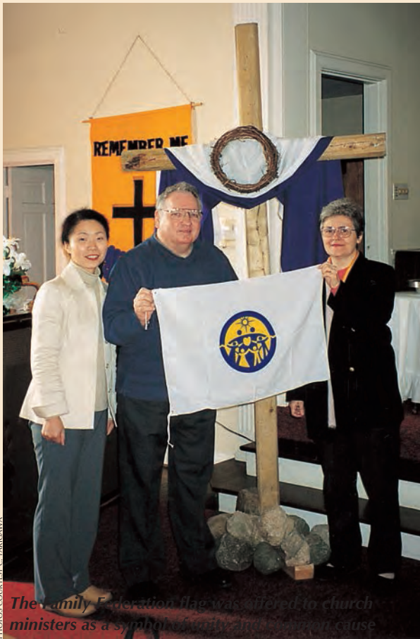
The Family Federation flag was offered to church ministers as a symbol of unity and support cause

One pastor, whose pride seemed a little hurt, commented, "So you are missionaries to America!" (It is a kind of irony in a nation that has sent so many missionaries out to the world.) Then he shook his head and said, "I guess we need it."