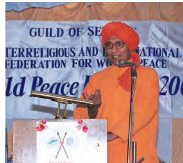
The Blessing Ceremony at the Guild of Service: Notably, the participants represented the complete social spectrum of India, and mingled freely; right, one couple from a poorer community who received the blessing