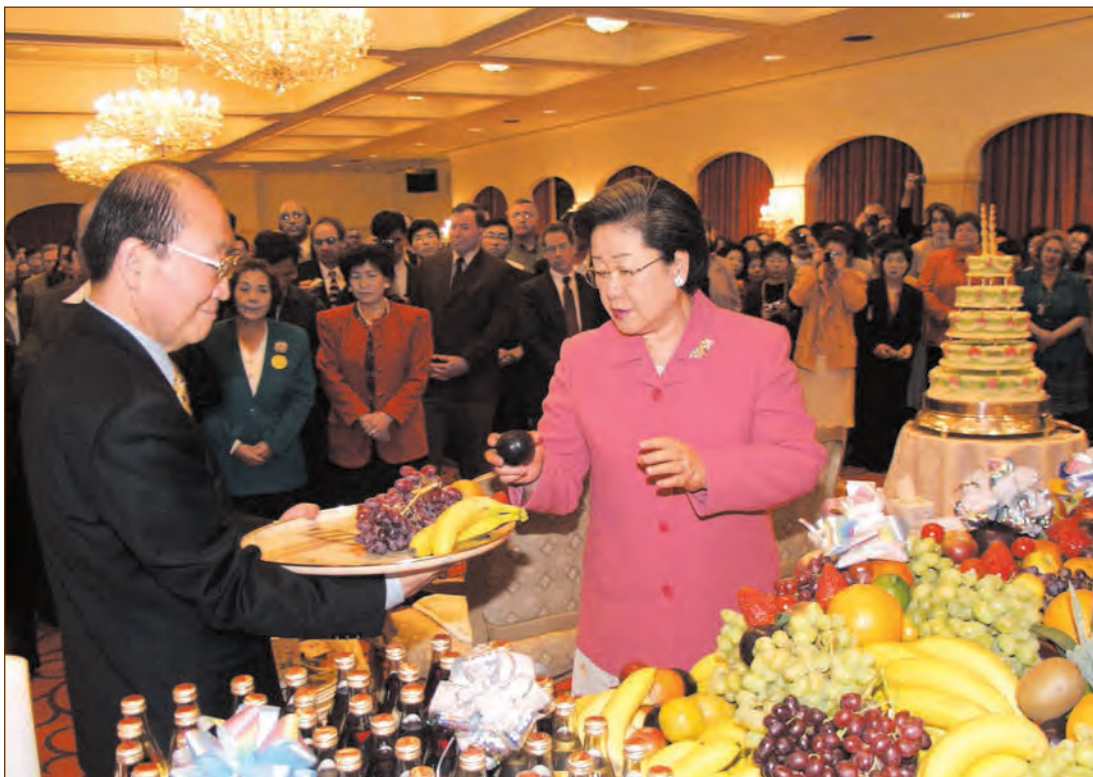
After Father's prayers and the cutting of the congratulatory cake, Mother gave trays of fresh food and drinks from the offering table to four teams of people (one Korean, one Japanese, one American). These they took to the northern, eastern, southern and western boundaries of East Garden and scattered there in accordance with True Parents' instructions.

The virgin married couples are the center. That is why the central families of the 36-couple blessed families are the Jacob type families. Those couples who were already married represented the Old Testament Age. Those who had had just some of the conditions of marriage represented the New Testament Age and the virgin couples represented the Completed Testament Age. However, neither the already married couples, nor the engaged couples nor even the virgin couples could establish families with God's blessing on earth on their own. True