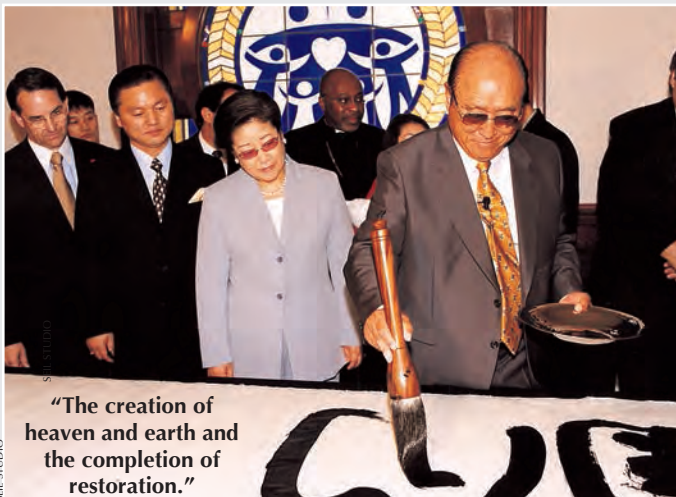
"The creation of heaven and earth and the completion of restoration."