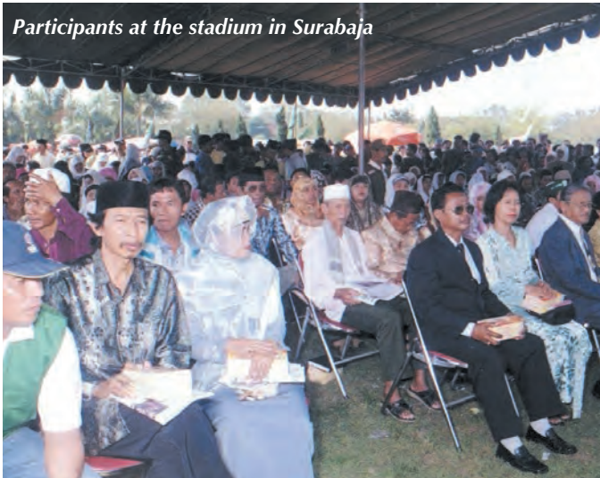
Participants at the stadium in Surabaya