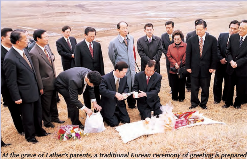
At the grave of Father's parents, a traditional Korean ceremony of greeting is prepared

grave was, the whereabouts of my big brother, his wife, and some of my cousins. Although I still had more to ask, I couldn't ask any questions that might put her into an awkward position. It was so heartbreaking.