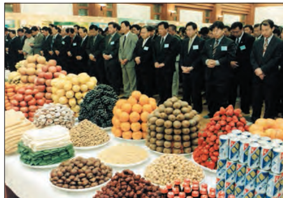
A parallel ceremony was held at Cheong Pyeong at the same hour (earlier due to the time difference)