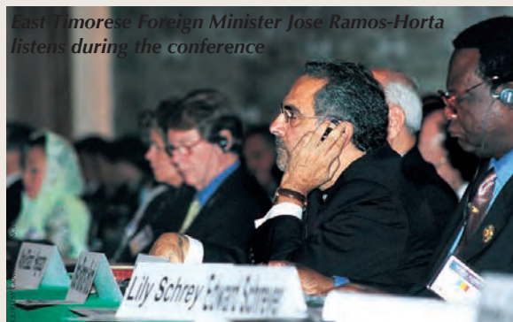
East Timorese Foreign Minister Jose Ramos-Horta listens during the conference