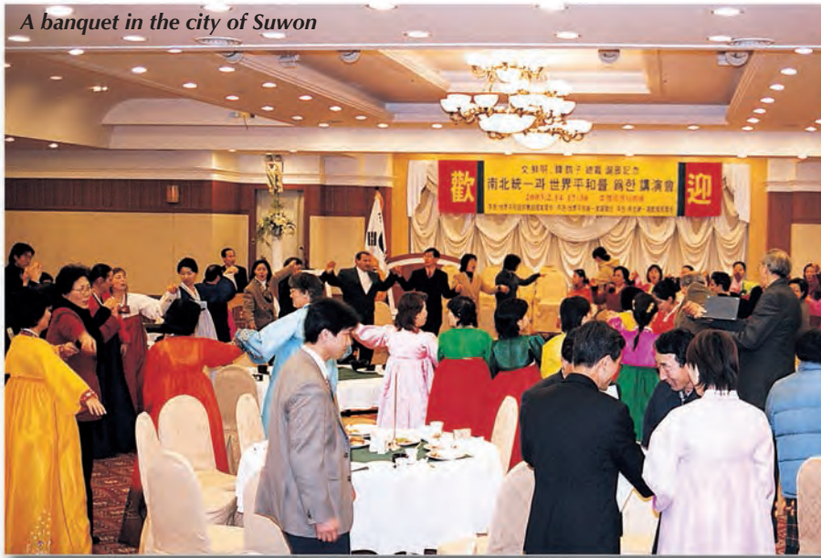
A banquet in the city of Suwon