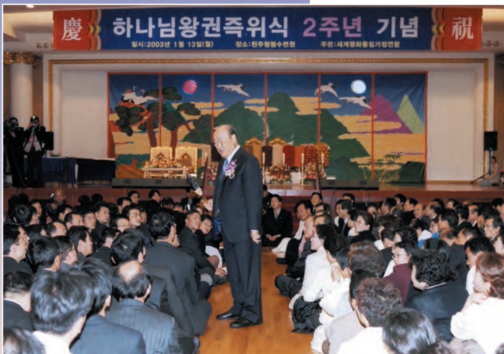
CHEONSEONG WANGLIM PALACE KOREA