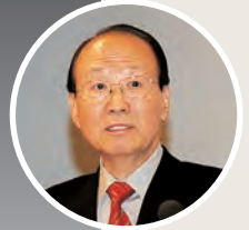
Newly appointed Ambassadors for Peace