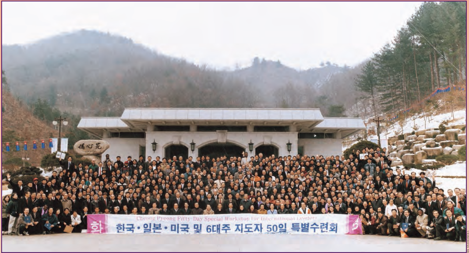
The conclusion of the fifty-day workshop: Its participants represented the worldwide leadership of FFWPU, CARP and the Second Generation

What I teach is not based on any teachings of man. I do not educate people by giving moral lessons or in any other conventional way. I am instructing you by speaking frankly, with words of life, based on God and the heavenly way. If God has given the mission of True Parents to me, you should understand that the relationship you have established with me today is both precious and meaningful. Please keep the things I've said today deep within your hearts.