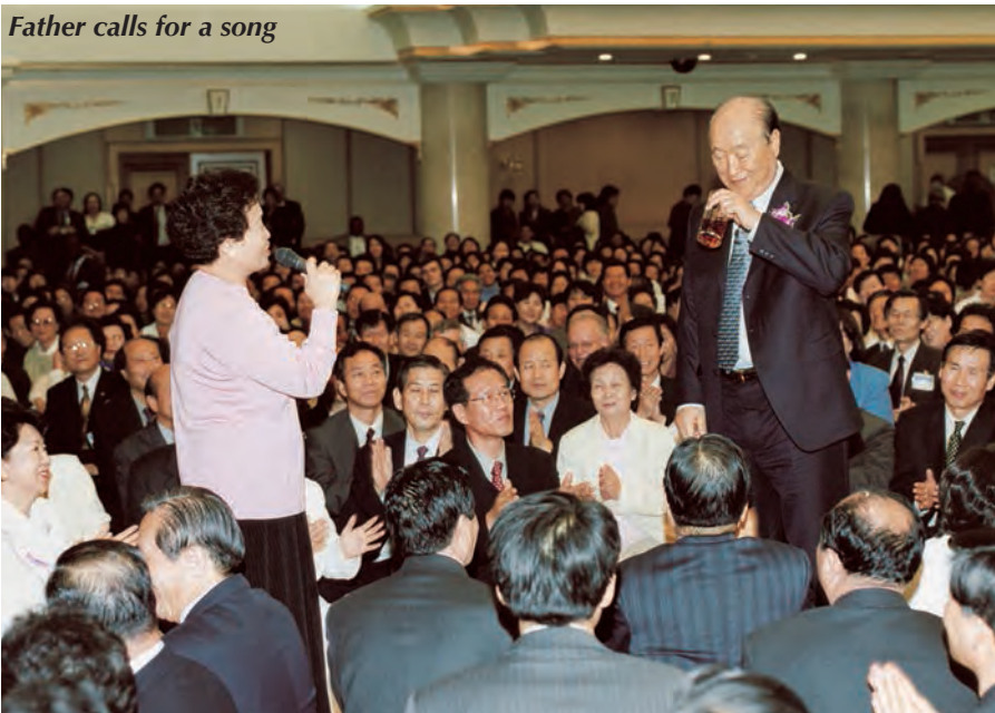
Father calls for a song

right; and front, middle and back; the middle is the center of all these. That's why now is an important time. Do you understand?