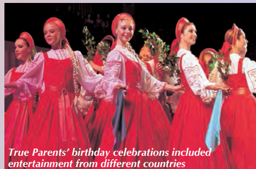
True Parents' birthday celebrations included entertainment from different countries