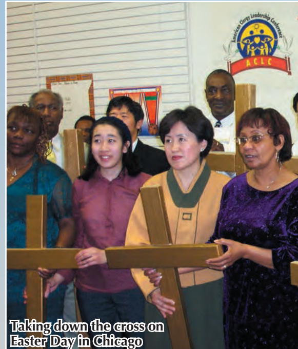
Taking down the cross on Easter Day in Chicago