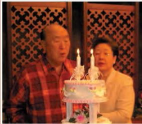
True Parents' Day: left, Father and Mother cut the celebration cake. below, leaders celebrate the holy day with True Parents at East Garden