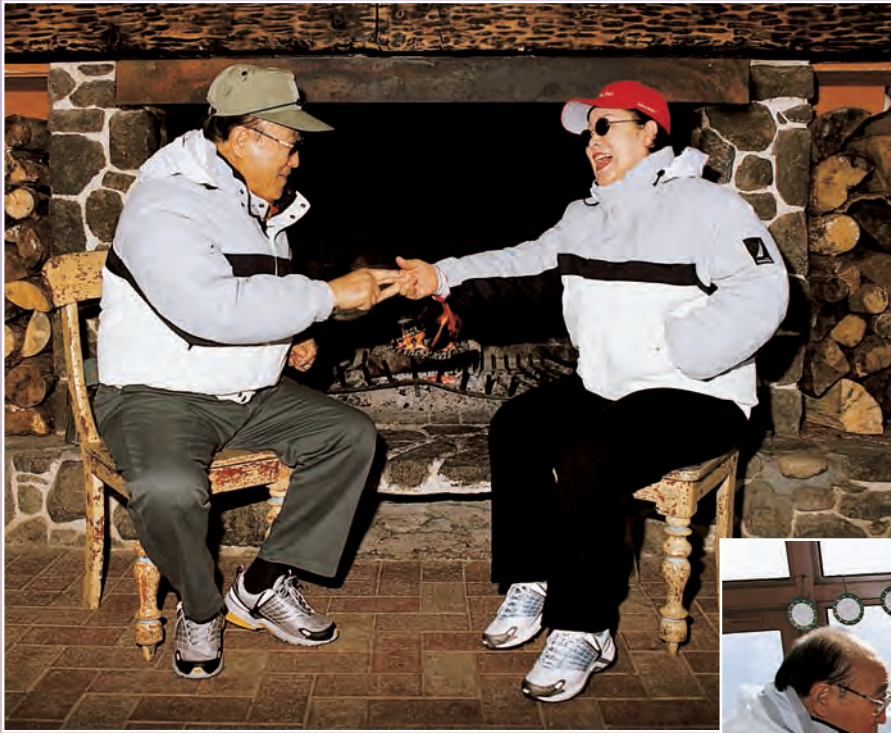
Father and Mother at Yong Pyong Ski Resort in March. They held a meeting at the hotel there with the leaders of providential organizations