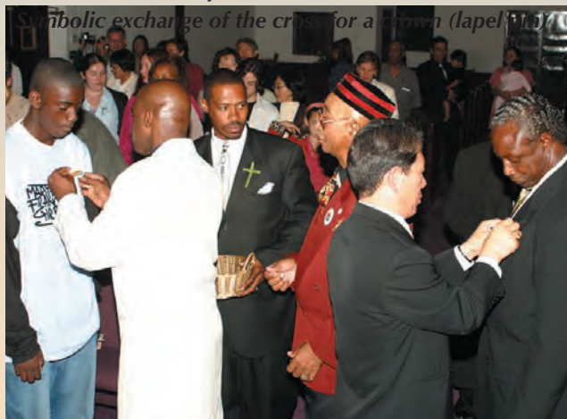
Symbolic exchange of the cross for a crown (lapel pin)

The one who has overcome is here. Let us be bold and confident to proclaim the good news. ♦