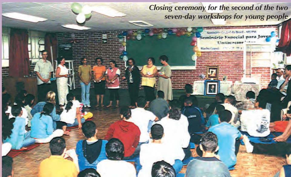
Closing ceremony for the second of the two seven-day workshops for young people