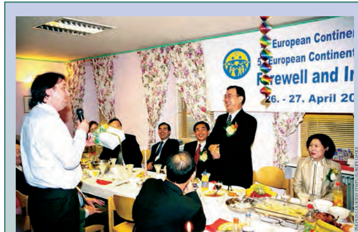
Farewell and Inauguration Ceremony 26. - 27. April 2003, Schmitten, Germany

We must renew ourselves and have conviction that matches the providence. We are the ones who are daring and adventurous. We are a unified people with the same belief. I sincerely pray that we will become a community that will take responsibility for the new providence in this new era. ♦