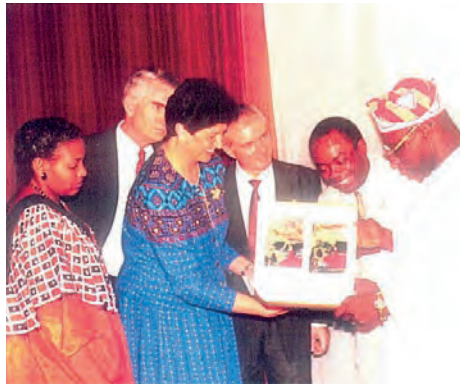
FFWPU representatives explaining the program to President Obasanjo of Nigeria

school year. Funding that will allow us to mobilize more volunteers has been made available by several national and international institutions. At the same time, we have made progress in learning from our past experiences and from the work of other NGOs in the field who are networking through WANGO and through our interfaith foundation, which has been established through