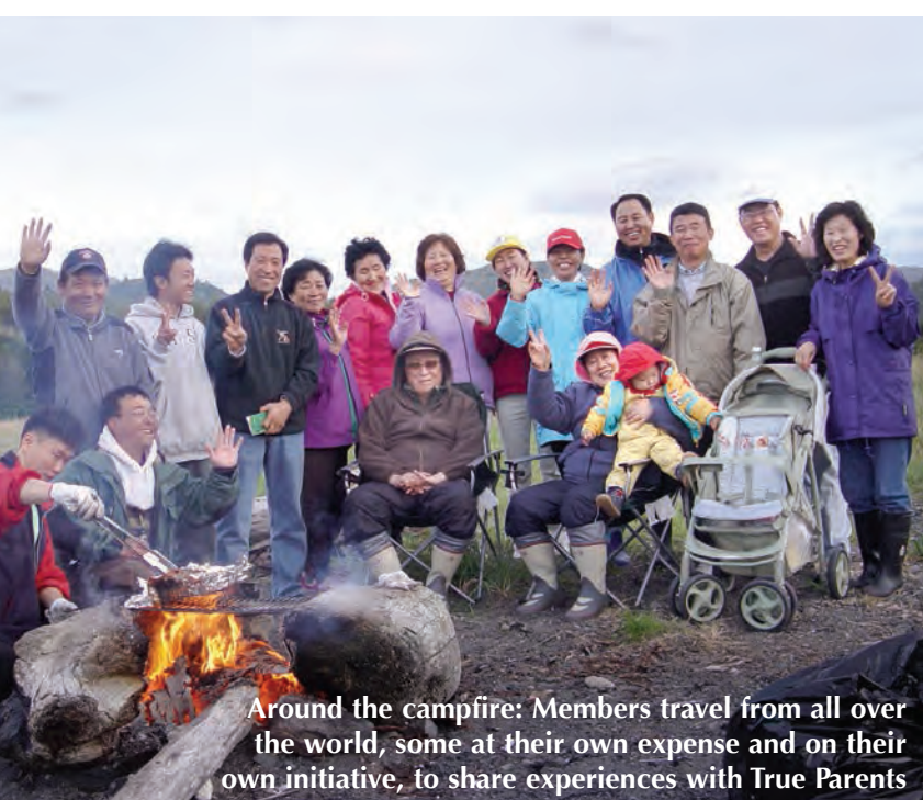
Around the campfire: Members travel from all over the world, some at their own expense and on their own initiative, to share experiences with True Parents

Manhattan, next to Central Park.] We should give a lecture in that place. [Father, when you first came to America...] Yes, I spoke in that very place.