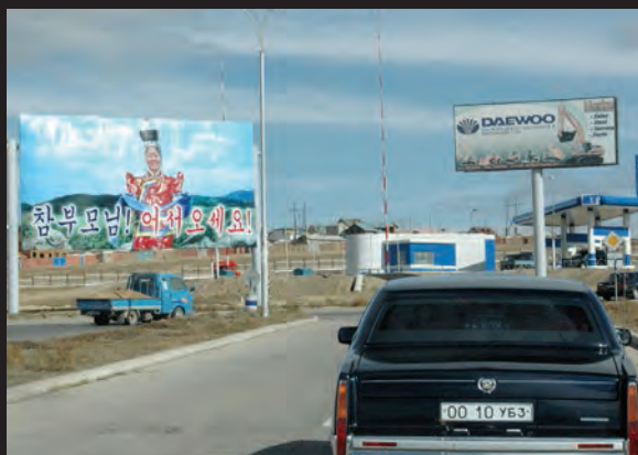
Above Mongolia welcomes True Parents in a big way—the billboard reads "Welcome, True Parents" in Korean