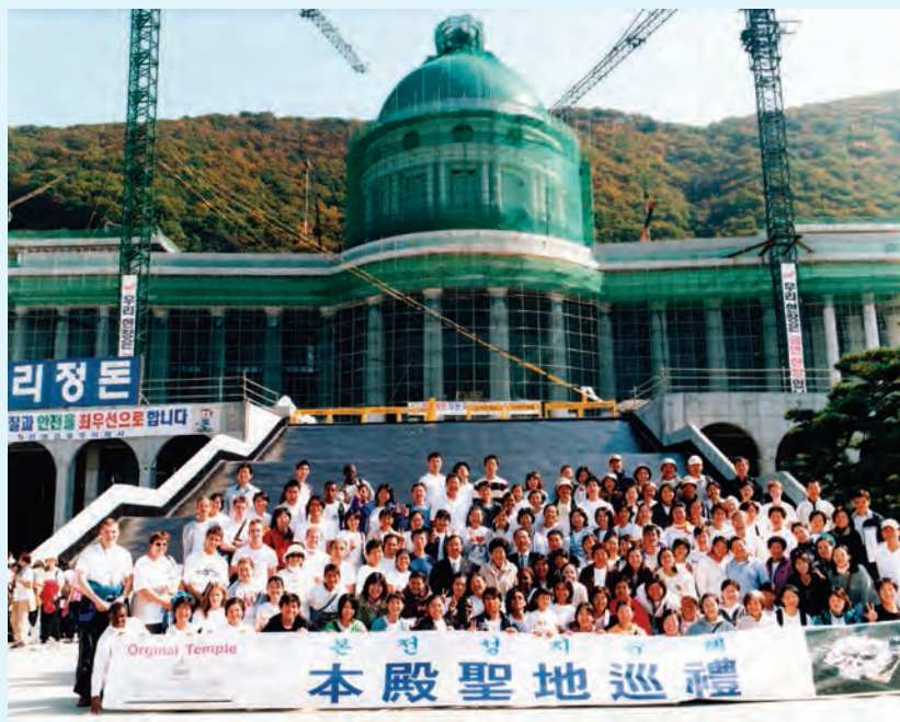
People at Cheongpyeong to attend the 99 th forty-day workshop pose for a photograph in front of the palace dome

When True Parents enter the Original Palace and live there, the spirit world and the earth will be completely different. It will be a time when amazing things occur in the spirit and in the flesh and when God's existence and His omniscience and