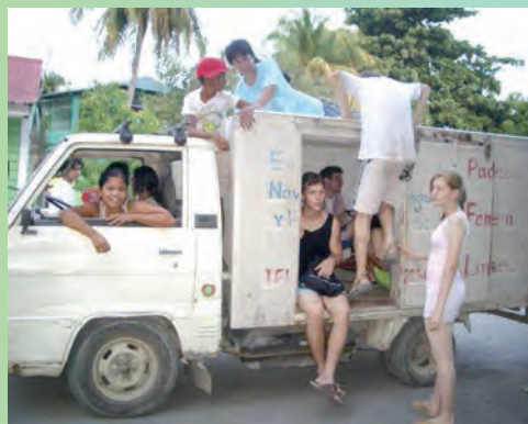
It was amazing how many of us we could fit into our truck (Don't try this at home)