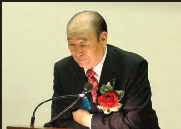
Above: A moment of contemplation in Abuja, Nigeria Right: Receiving flowers in Tirana, Albania