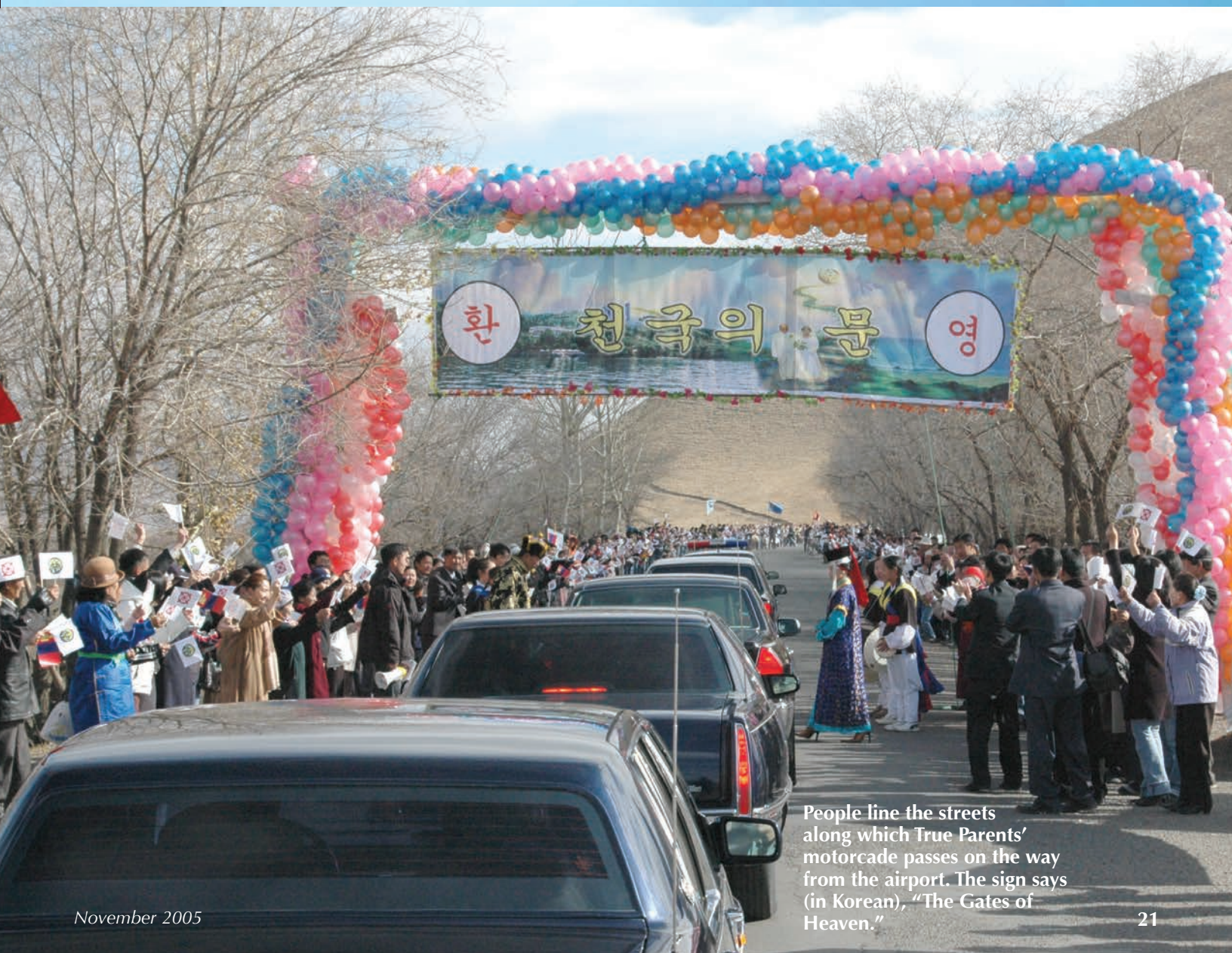
People line the streets along which True Parents' motorcade passes on the way from the airport. The sign says (in Korean), "The Gates of Heaven."

That afternoon, evening and the next day I cried a lot. I was reminded of what Jesus said during the Last Supper: "No longer do I call you servants, for the servant doesn't know what his master is doing. I call you friends, for all that I have heard from my Father I have made known to you." (John 15:15) For the first time, I understood something deeper about why True Parents are doing this tour. Father is working harder than anybody else in this world, pouring out all his love and energy to meet people worldwide, looking for those who can understand him, follow in his footsteps, and continue his work.◆