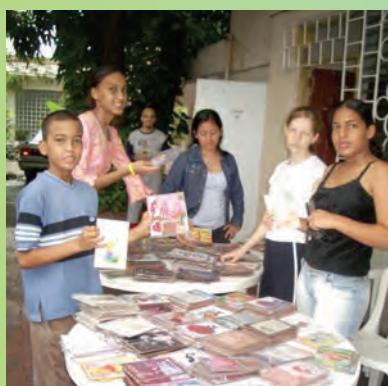
Finally all the fund-raising products are ready