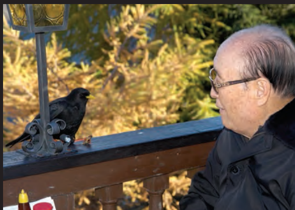
Above: The dominion of love over the creation; Overlay: Sharing headphones at the speech in Estonia