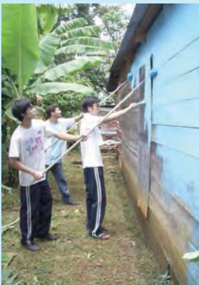
Hearts develop through service