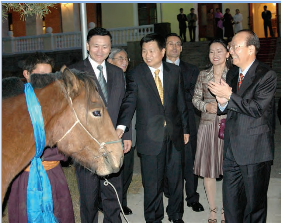
Known for their endurance, surefootedness and dependability, the Mongolian horses presented to True Parents were a good omen at the beginning of the international swing of a global tour that called for stamina and tight coordination

I stood at the podium and conveyed True Parents' message for about twenty minutes. Then I told everyone there to stand up to receive a gift that I had brought. Saying this, I held the holy wine ceremony and blessed them all, including the governor's wife and the wives of government ministers.