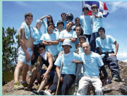
Atop Pico Duarte: No one in the whole Caribbean is higher than we are