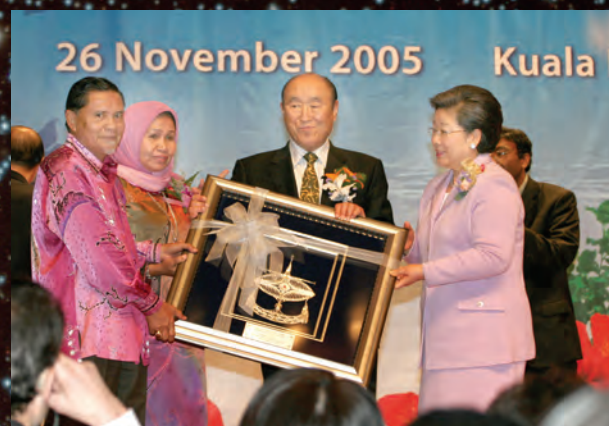
November 26: In Kuala Lumpur, Malaysia, there was gratifying response from the Muslim majority