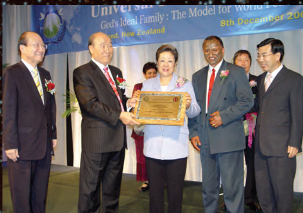
December 8: In Auckland, New Zealand, the emcee spoke in two languages, English and Maori