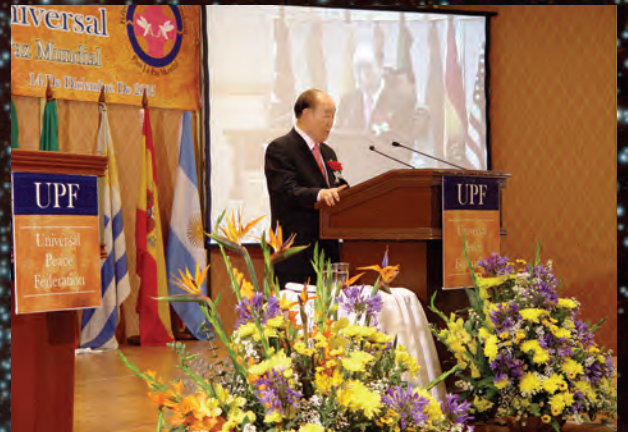
December 14: In Lima, Peru Father spoke until midnight