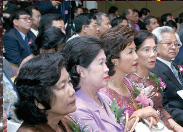
November 27, Phnom Penh, Cambodia, where a group of 400 delegates arrived from Thailand for the event