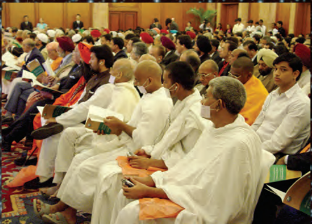
November 23: New Delhi, India, at the Taj Mahal Hotel, Jains, practising ahimsa, listen attentively