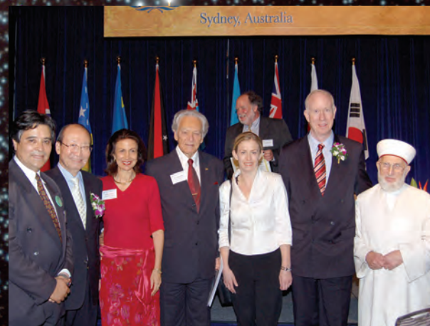
December 7: Sydney, Australia: The Morning Herald described it as a gathering of "500 peace activists"