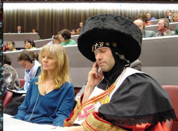
November 17: Geneva, Switzerland—people of every religious stripe came to see Father during the tour