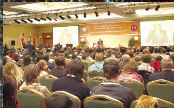
November 19: Copenhagen, Denmark