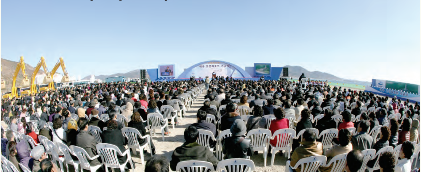
A view of the stage at the groundbreaking from the back row

The ceremony proceeded as scheduled. Prior to the main ceremony, we held a reception that lasted half an hour, for it was, after all, a groundbreaking ceremony. This event was very well prepared, with the idea that the guests would be welcoming True Parents. The cost was split fifty-fifty between us and the city authorities. When participants, including the main officials, came in and found me at the event, they asked me, "Where is President Moon?" It was something like a greeting, putting me at a loss as to how to reply, as Father's coming had already been advertised widely. But the mayor of Yeosu answered on my behalf to such inquisitive greetings, saying "Sun Myung Moon is still in the middle of his speaking tour to countries all over the world; he is unable to make it here today."