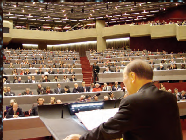
November 17, Geneva, Switzerland

"At the same time, you definitely do get a sense of how Father comes alive when he's teaching or in hoondokhwae 5 . He can sit for two hours listening to hoondokhwae and you can see that he's engrossed in it. Or he can look a little bit weary, but as he begins to speak you'll begin to see him come to a new level. A lot of times he'll say that he was born to educate, that that's his mission and calling in life. I think that's what he's done his entire life and he still feels that's his mission—to educate the entire world before he dies. I think there's some truth to that. Father only wants to do his mission. He doesn't want to retire. He doesn't want to step back. There's still too much work to be done."