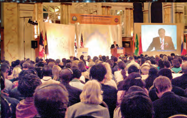
November 5: In London, England, there was evident elation at having Father back after 27 years