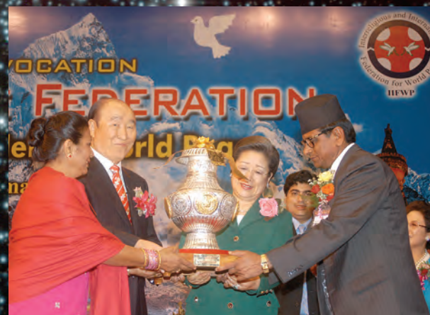
November 22: In Kathmandu, Nepal, 3,000 members greeted them. Banners of welcome dotted the city.