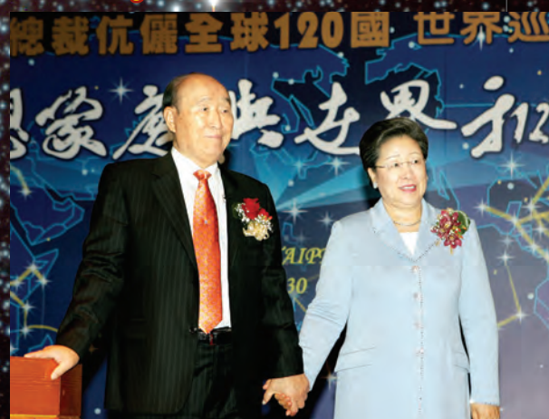
November 30, Taipei, Taiwan, where Father spoke at the Chiang Kai Shek Cultural Center