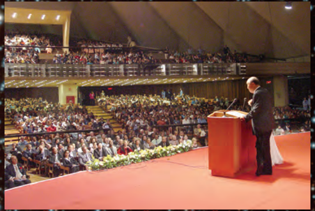
December 12: In Sao Paulo, Brazil a choir sang Handel's Messiah to warm up for his coming

In President Nkurunziza's inaugural address he announced his government's plan to do away with the previous schooling fee of U.S. $4.50 per year. In such a poor country, this has resulted in elementary school enrollment increasing to 1.25 million pupils from last year's total of less