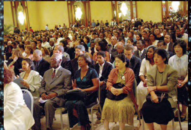
December 19: In Santo Domingo, Dominican Republic, 1,300 filled the Fiesta Hotel