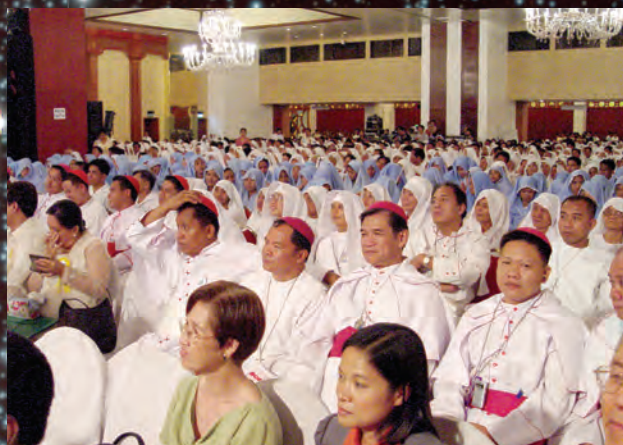
December 1: In the Philippines Catholic priests and Muslim woman—a sea of the faithful