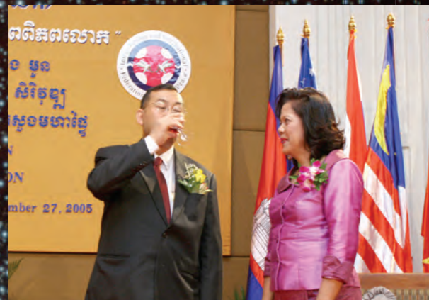
November 27: Phnom Penh, Cambodia—The Holy Wine Ceremony was held in cities all over the globe