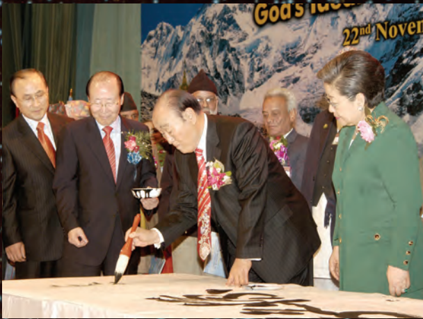
November 22: Kathmandu, Nepal—True Parents were there during a three-month ceasefire