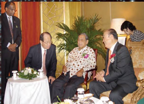
November 25: with Abdurrahman Wahid, president of Indonesia (1999–2001)