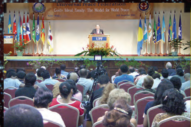
December 2: In Koror, Palau 2.5% of the nation's population came to hear Father's message