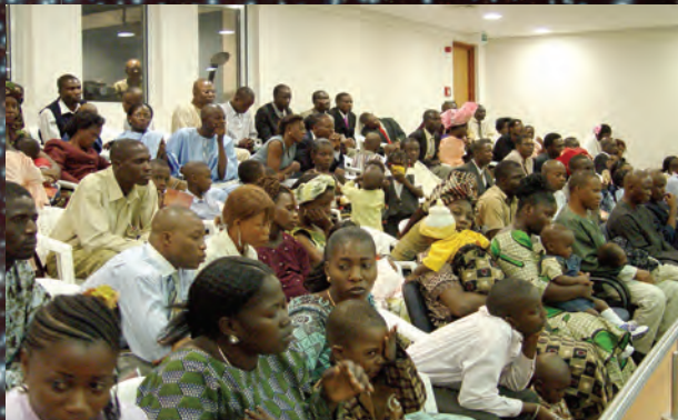
November 7: In Abuja, Nigeria, Father told 700 guests no one could compete with a united Africa