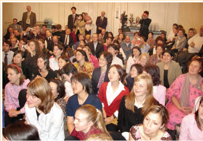
Top: Father speaks to a large crowd in Bucharest; Here: The Four Romanian families and many loving helpers attended hoondokhwae

At 9:00 the procession of cars was formed once more and at 9:30 we were at the airport, where everything, both in the waiting room and outside, was as efficient as at the arrival; boarding procedures took just a few minutes. True Parents boarded their airplane more serene and happy than when they arrived. ♦