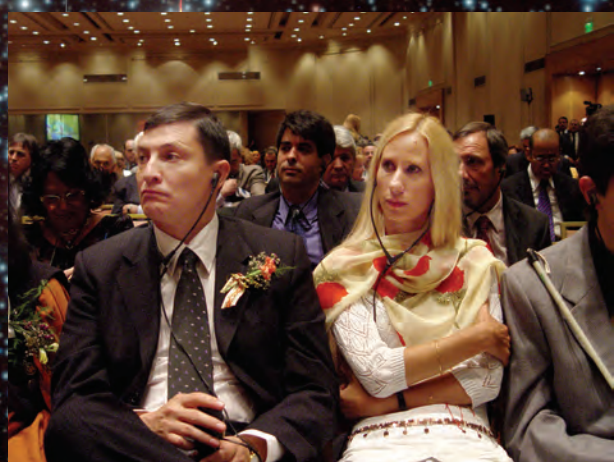
December 11: Buenos Aires, Argentina—The couple who offered flowers, listening intently

you know what these two chairs are doing on stage? Let me tell you. Here we have Father and Mother Moon—pointing to the seats. The audience applauded and ululated. He said that God is using Rev. Moon to create lasting peace in the world. Finally, he led a choir of more than 300 people who had gathered for the event in singing to Father and Mother Moon of “joy that endures forever and ever, wonderful joy and peace.”