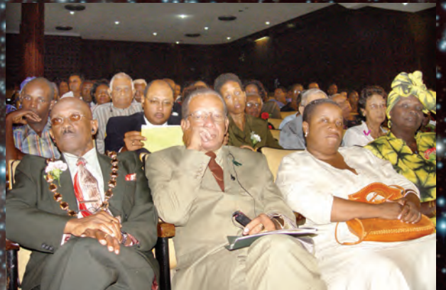
December 17: In Georgetown, Guyana Father gave a "Christmas donation" of $50,000 to an orphanage