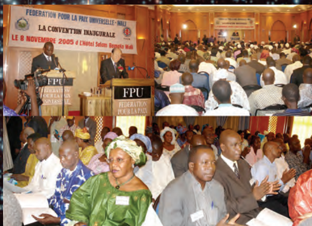
November 8: In Bamako, Mali, Amadou Toumani Touré called Father's presence a blessing

nations are helping each other, where national messiahs are working together with the Japanese volunteers and people who have some connection to a given nation have just shown up to help, all working together."