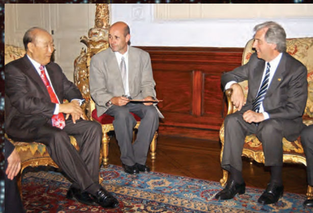
December 10: with Uruguayan President Tabaré Vázquez, who was elected last March