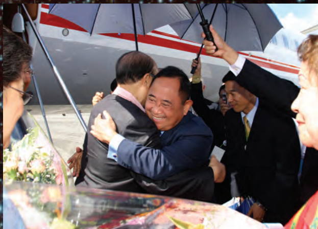
December 1: The Philippines—Jose de Venecia welcomes Father; later they met President Arroyo