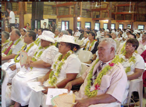
December 5: In Apia, Samoa, civic and religious leaders joined in embracing a message of peace