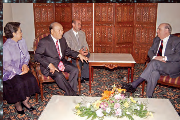
December 10: with Julio María Sanguinetti Coirolo, Uruguayan president (1985-'90, 2000-March '05)