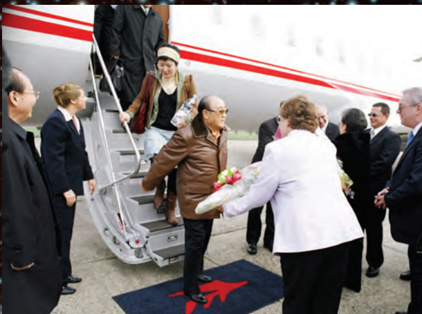
November 5: In Great Britain, Yeon-jin nim disembarking behind Father at an airport near Chislehurst, just outside London