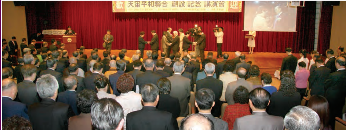
From March 25–April 3, on 9 occasions dubbed Rallies for the Restoration of the Homeland, Father will deliver a public speech, after which True Parents will conduct a blessing for the audience. The third event was held on March 27 in the main hall of the National Library in the National Assembly complex. Top: True Parents lead the audience through their vows Lower Left: The National Assembly Building Right: True Parents' prayer with select couples

This presented an enormous challenge to IIFWP. We were called to work to develop a global organization that was, on the one hand, very much like the United Nations in terms of the comprehensive scope of its mission, and yet very different in many other respects. The task was made even more challenging by its being undertaken by representatives of civil society rather than by governments.