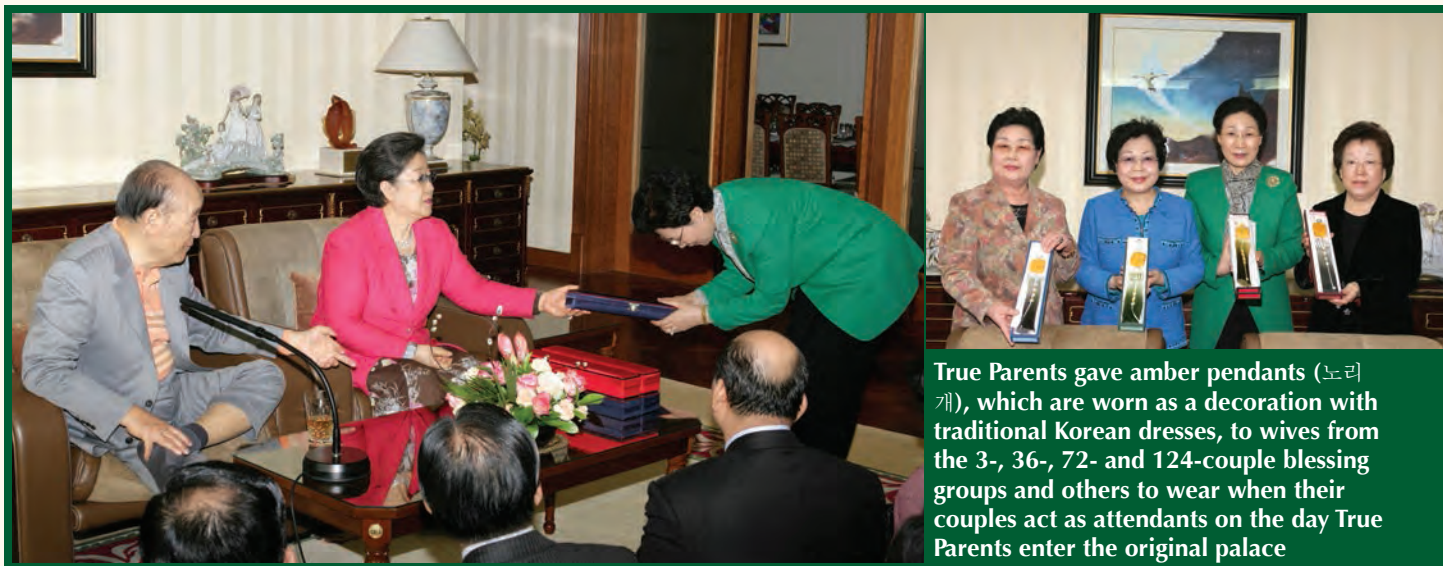
True Parents gave amber pendants (노리개), which are worn as a decoration with traditional Korean dresses, to wives from the 3-, 36-, 72- and 124-couple blessing groups and others to wear when their couples act as attendants on the day True Parents enter the original palace

tual values. Governments must end their prejudice against religion. There is nothing to fear, and much to be gained.