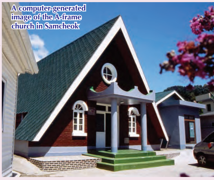
A computer-generated image of the A-frame church in Samcheok

I built an office on the church property. With a decent office, I was set. The deputy mayor visited my office twice a week. He told me that he didn't know much about worldly affairs, because he had been a government official for thirty years. I gave advice to City Hall on thirty different issues, such as where to build a road, where on roads to install digital display panels, where to have driveways and such. I sent