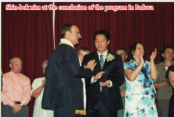
Shin-bok nim at the conclusion of the program in Padova