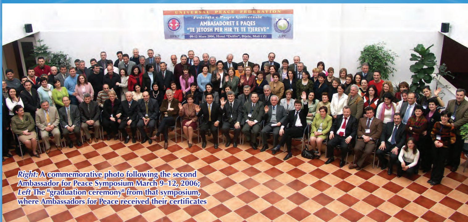
Right: A commemorative photo following the second Ambassador for Peace Symposium March 9–12, 2006; Left The "graduation ceremony" from that symposium, where Ambassadors for Peace received their certificates