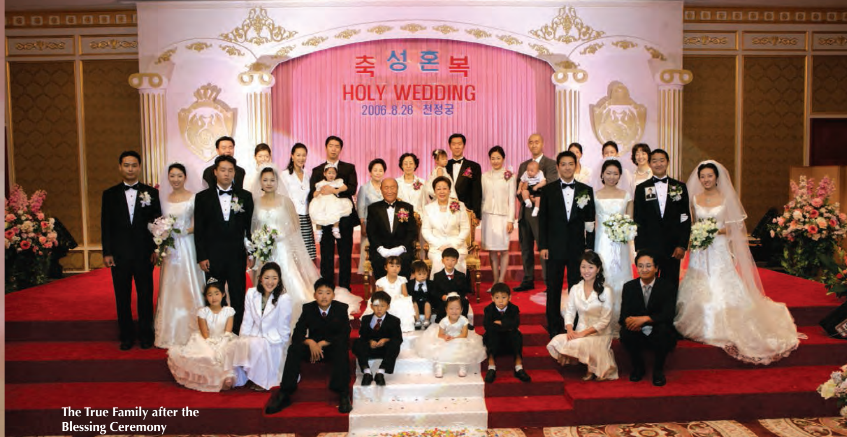
The True Family after the Blessing Ceremony

A grandmother even fights with herself, and a grandfather even fights within himself. God cannot stay where fighting is going on. Know this clearly, and remember it: Those who are engaged in fighting cannot bring God to dwell with them, or be with them, so they can neither establish the kingdom of heaven nor enter it.