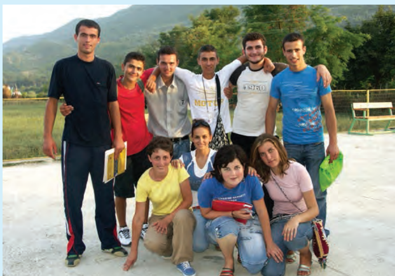
A fund raising team from one of the 15-day workshops