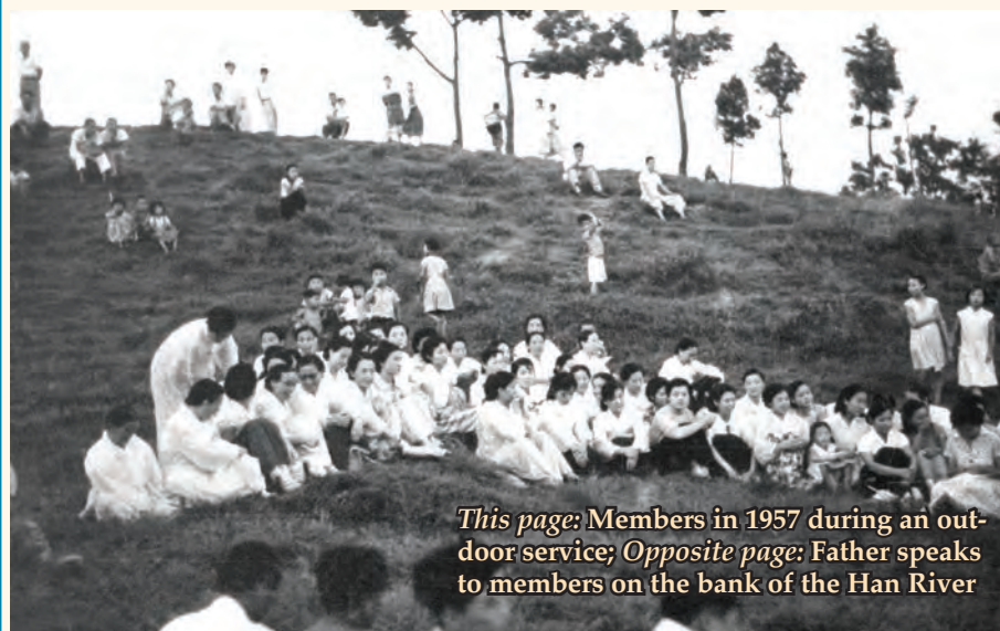
This page: Members in 1957 during an outdoor service; Opposite page: Father speaks to members on the bank of the Han River

I came to this church from the Ilsan church on June 1, 2001. This church suffered because the church leader and his wife got so involved in network marketing that they abandoned the mission. Because of the difficulties the members here were going through the regional leader asked me to take over this church. I took what he suggested as the word of God, and even though I feel inadequate to take on this mission, I thought I should fol-