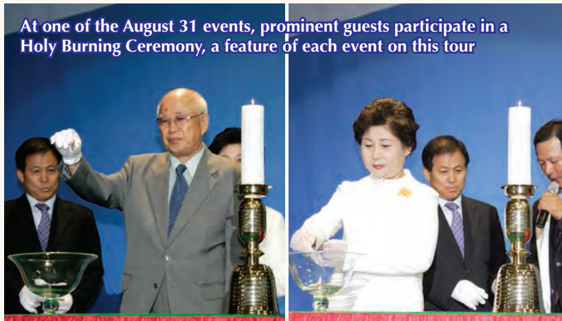
At one of the August 31 events, prominent guests participate in a Holy Burning Ceremony, a feature of each event on this tour

Without mother or father, there cannot be lineage. Don't you want to be filial sons and daughters? Come up here if you don't. You don't understand this, and so you have become good-for-nothings treating True Parents and God thoughtlessly. You need to understand that only when you