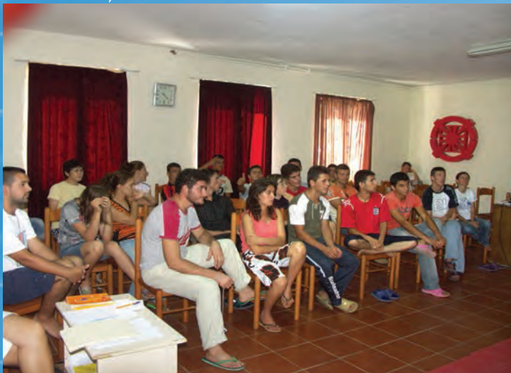
Top: On the second UPF tour, True Mother, Kook-jin nim and Ji-yea nim at Congress Hall in Tirana, Albania's capital, on July 7, 2006; Below Left: There is a demand for continual lectures; Below Right: A group photo at the end of the 15-day workshop

The Albanian language is unique. It has thirty-six letters. Albanians tend to be able to speak other languages. For example, eighty percent of our young people can speak Italian because they watch Italian TV.