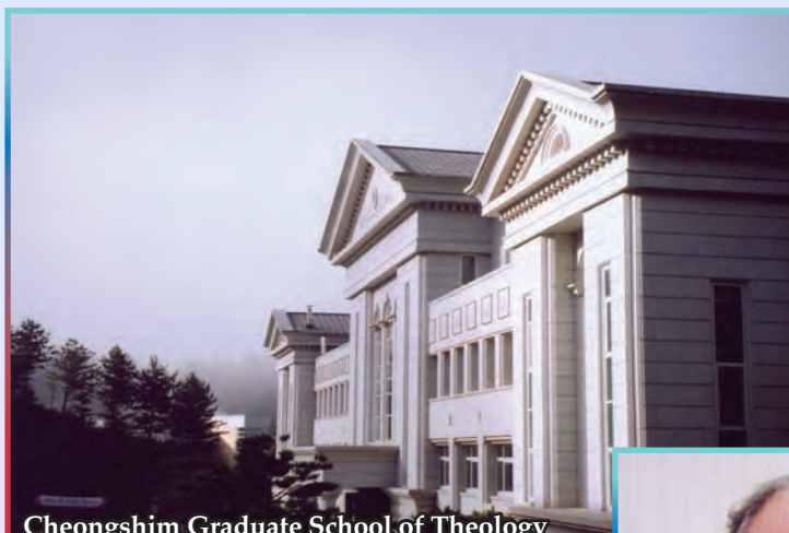
Cheongshim Graduate School of Theology

Pursuing special studies to enhance mission effectiveness