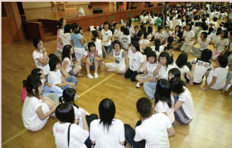
Blessed children attend a summer Divine Principle seminar from July 26–August 9 in Cheongpyeong. Father spoke to them during the first week.

We must understand that this all began with the declaration of the ideology centered on the heavenly father [천부주의], and has continued to this day.◆