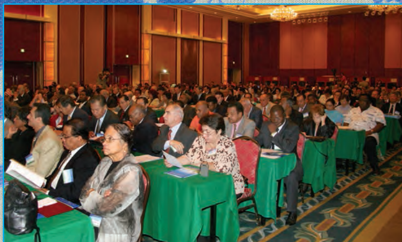
Left: Participants sign a resolution on the anniversary of the founding of UPF Right: Participants at the assembly on September 11, 2006, at the Lotte World Hotel in Seoul