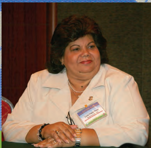
Congresswoman Fidelia Pérez Dominican Republic