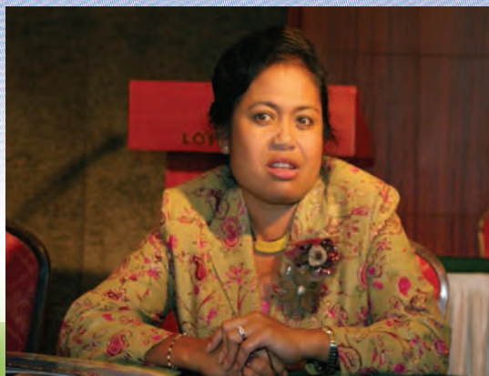
Mrs. Debbie Remengesau The First Lady of the Republic of Palau

The first anniversary of the inauguration of the Universal Peace Federation and its third Assembly—September 10–14, 2006