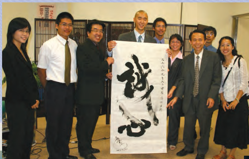
God's Ideal Family & the Kingdom of the Peaceful, Ideal World Cameron Highlands, Malaysia 23 September 2006