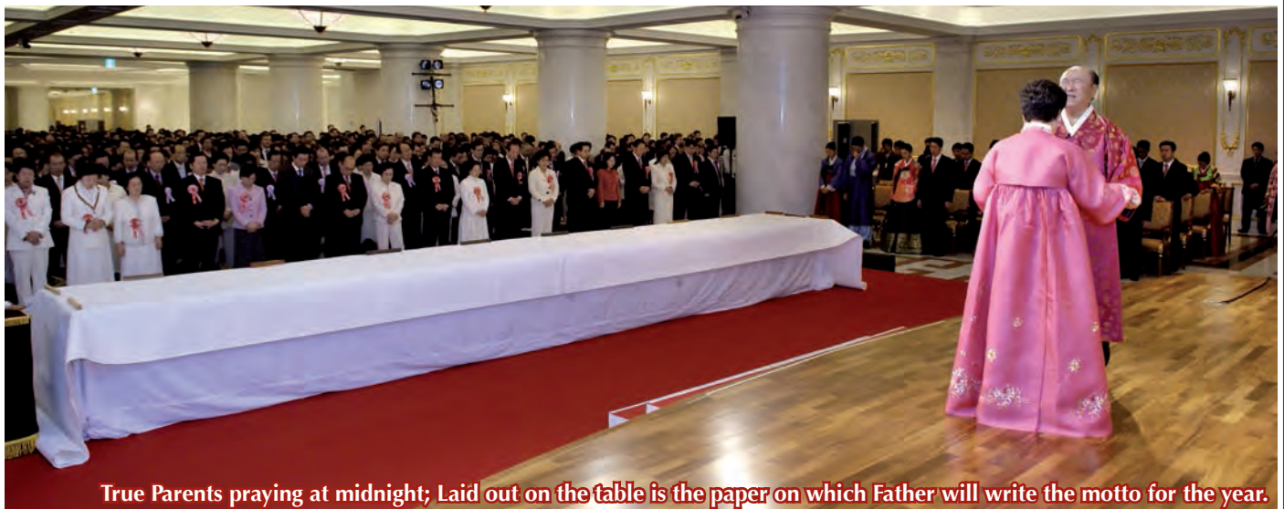
True Parents praying at midnight; Laid out on the table is the paper on which Father will write the motto for the year.

liberation and complete freedom. As the nation at the center and core of the Cheon Il Guk federation of the cosmos, this will lead to the liberation of the homeland that will enable us to declare the complete liberation of all nations and the complete release of the entire universe. Furthermore, we can now designate and proclaim the day of declaration enabling the liberation of the cosmos and surrender of the realm of heart of the world of the 4th Adam to be brought together from this point on and mobilized again.