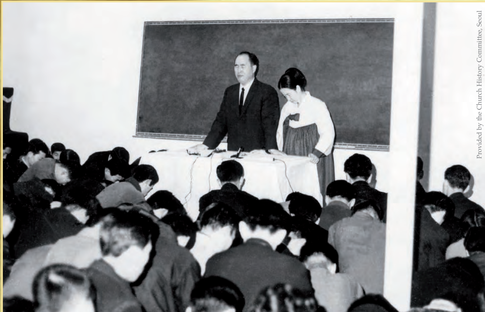
True Parents pray on the first God's Day, in 1968, which came on the foundation of their first seven-year course

traditional churches, because of the disputes and divisions in those churches, and because their doctrines are illogical.”