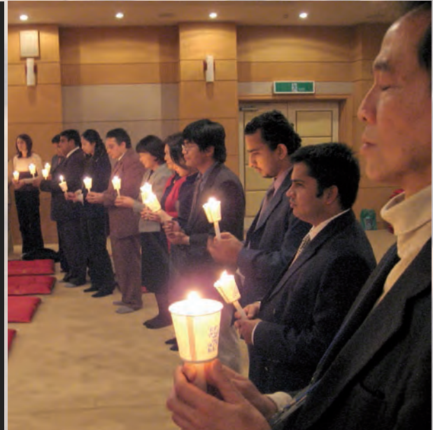
Above: Graduating from the seminar involved a candlelight prayer ceremony and photos with the instructor; Below: As a microcosmic exercise in mind-body unity, during meditation, participants stave off all thoughts and concentrate only on their breathing and cultivating a feeling of gratitude.

You cannot just know something and that's the end of it. We have to change society; we have to help the diseased and the poor. We are very practical in terms of our theology. We have tried to be engaged socially. We have done big activities, but how focused are we on the central tasks we have to fulfill within the