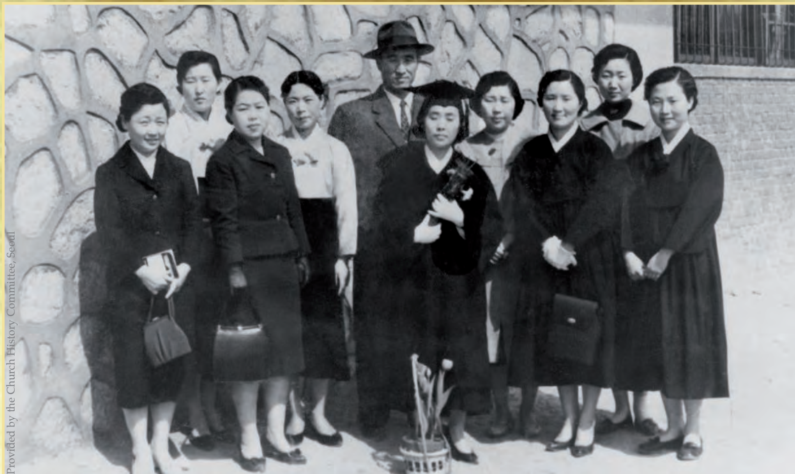
In 1955, Ewha Womans University [sic] expelled professors and students for attending the "Tong-il Church." This woman (center) transferred to another university. Father and her fellow "Ewha members" pose with her on graduation day.

conesses she'd surveyed were going to church only "as a matter of form."