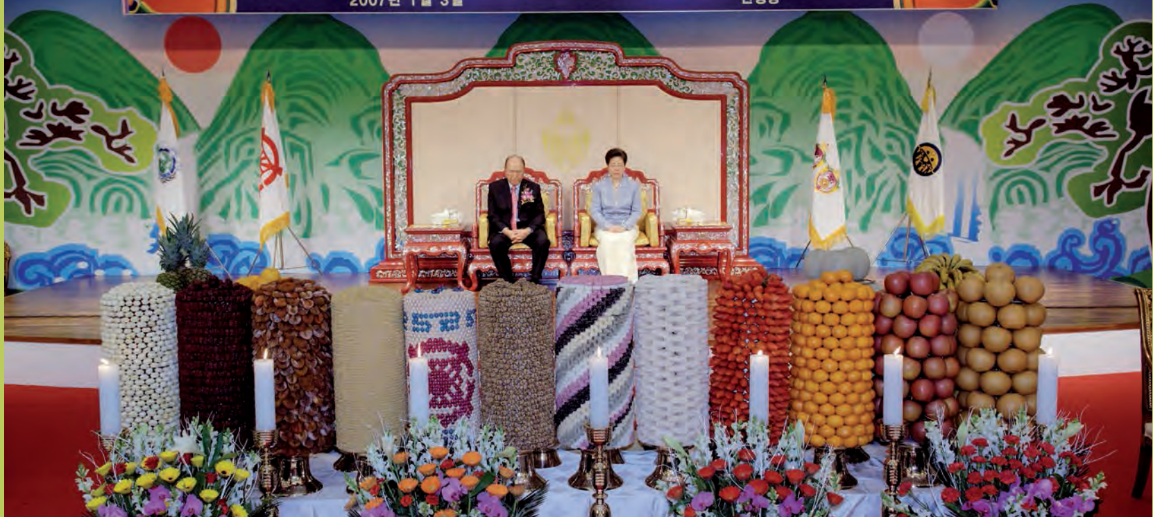
True Parents at Pledge Service on the 6 th anniversary of the Coronation Ceremony for the Kingship of God on January 3, on which day Jesus' birth was also honored. Father had asked the headquarters to prepare one offering table for all the ceremonies from True God's Day to January 3. The preparation of items takes 3 days. On site, one team of 15–20 men and women do the stacking. White chestnuts (symbolizing God; first stack on True Parents' right) are the most difficult to deal with. A second team of people prepare the holy food that True Parents will eat. True Parents touch the food with their chopsticks, allowing God to eat.