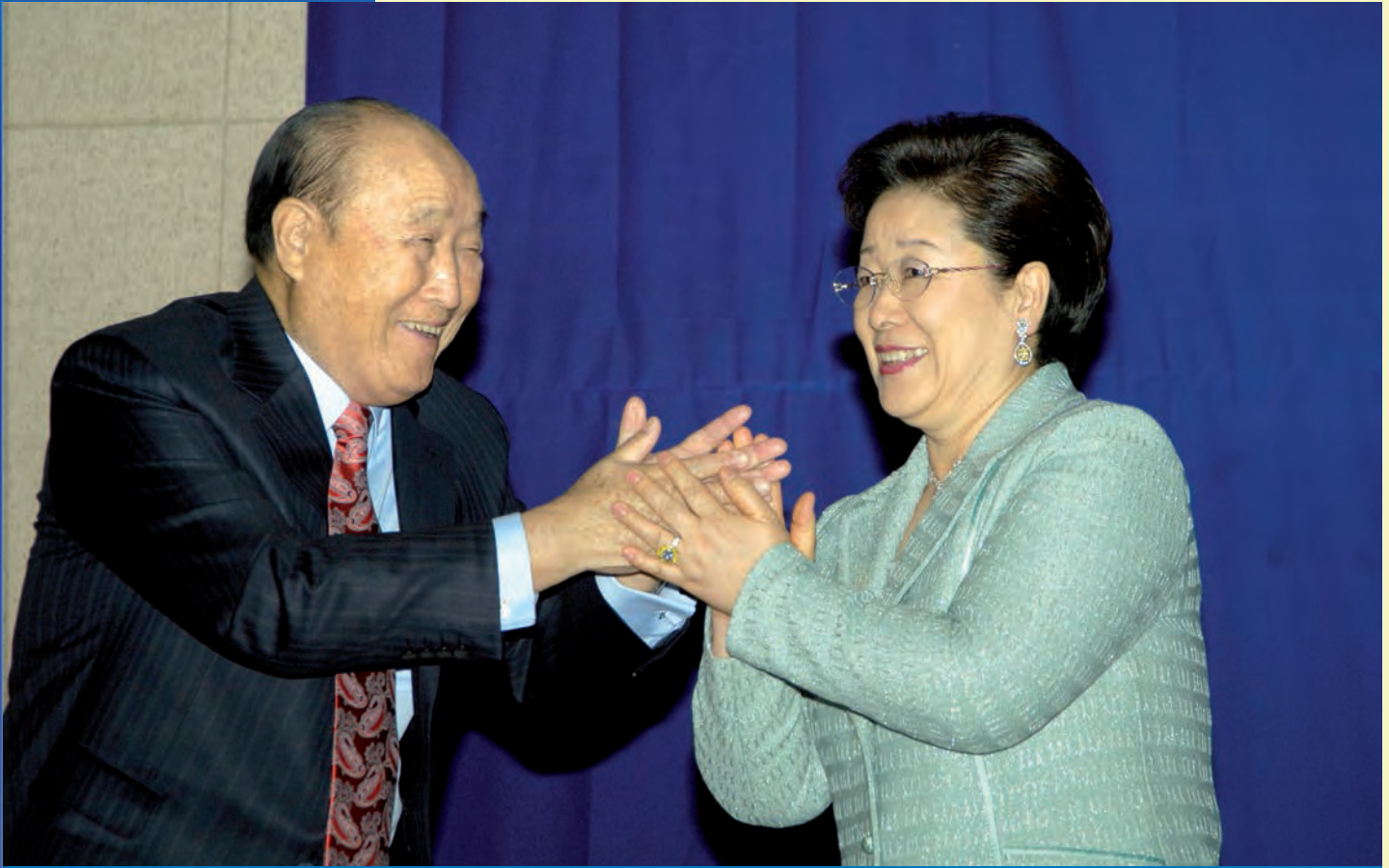
Father gave the following speech at the opening of the Cheon Il Guk Leaders Assembly (photo: True Parents during the speech)