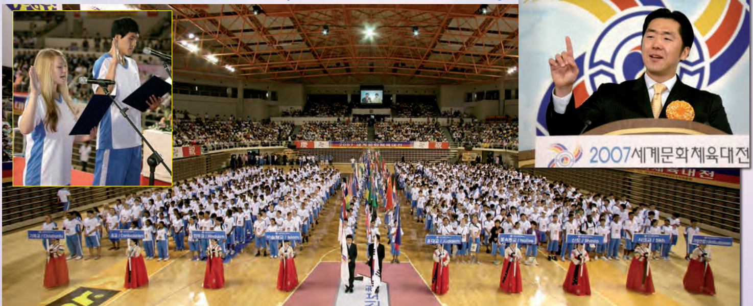
The Opening Ceremony of the twelfth World Cultural and Sports Festival on July 4 at Yoo Gwan Soon Stadium in Cheonan, Korea; Inset: Representatives recite the Athletes' Pledge

Humanity has endeavored throughout the ages to create a world of lasting peace, yet peace has eluded us. To live in a world without war has been the dream of every good man and good woman since the beginning of time. You who have gathered here today, who have come to compete and contribute, are being tasked with the responsibility of developing your character, along with your athletic skills and intellect so that you may be the peacemakers of tomorrow.