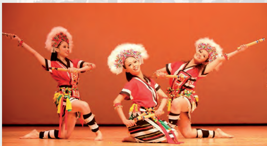
Thailand, Taiwan and Sri Lanka sent talented dance troupes to take part in the International Night of Friendship and Peace on July 6 that also featured a performances by a symphony orchestra and two professional singers.