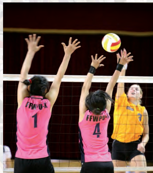
More than a thousand athletes participated in IPSF 2007, representing their countries and religions.