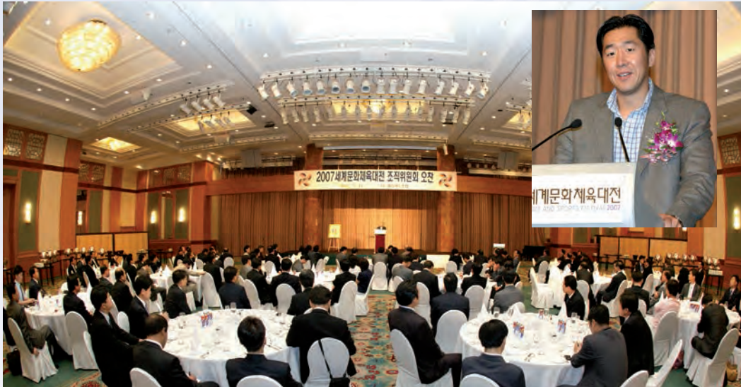
Hyun-jin nim reflects on the course of the 2007 World Culture and Sports Festival at an evaluation meeting for its organizers

I want to commend all of you for your dedication and your hard work and your participation in these events. We hope that you can be ambassadors for this festival when you go back home to your respective countries, so that you can bring the message of peace and the culture of living for the sake of others that you've experienced in this festival to your homes, your neighborhoods, your communities and your nations, so that we can truly build one family under God. ♦