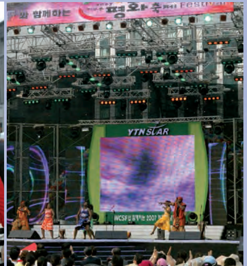
Left: At the Global Peace Festival, Stanislav Shushkevich, former chairman of Belorussian Supreme Soviet, presents gifts to a Japanese mother and her four children, whom she has raised alone for ten years following her Korean husband's death; Middle: Hugs all round mark the finale of the festival; Right: An African dance troupe whose members are resident in Korea performs; to gauge the success of the event see our back cover photo of the crowd that came to take in the festive atmosphere and enjoy listening into the late evening to more than twenty top Korean music stars.

unjustly imprisoned six times for his beliefs and for his conviction to realize the dream of building one family under God.