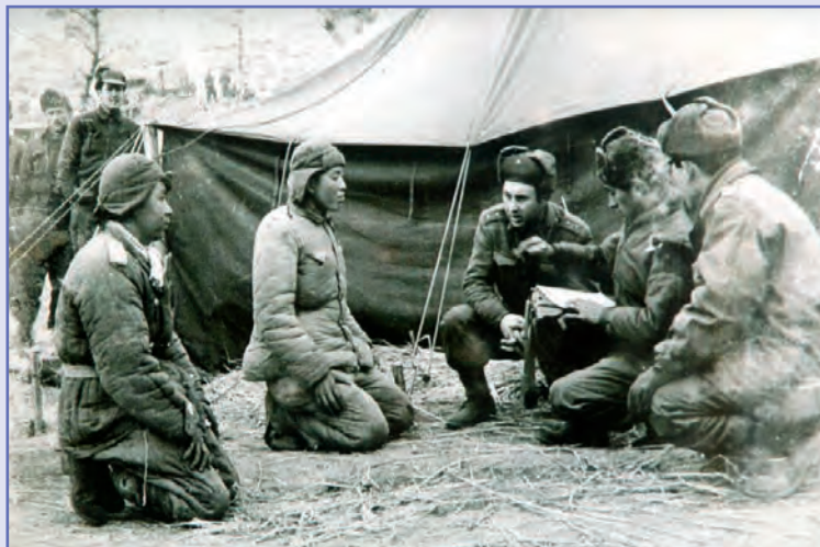
Turkish soldiers interrogating prisoners during the Korean War

I pray that God's comfort and blessings be upon those who made the ultimate sacrifice. Thank you very much.◆