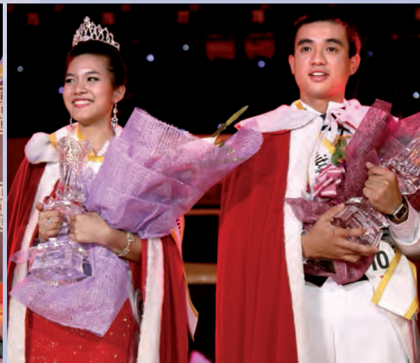
Indian competitors greet the audience at the twenty-ninth Mister and Miss University International, at the Seoul Fashion Art Hall, on July 8; The winners (right) were Mr. Malaysia and Miss Thailand.