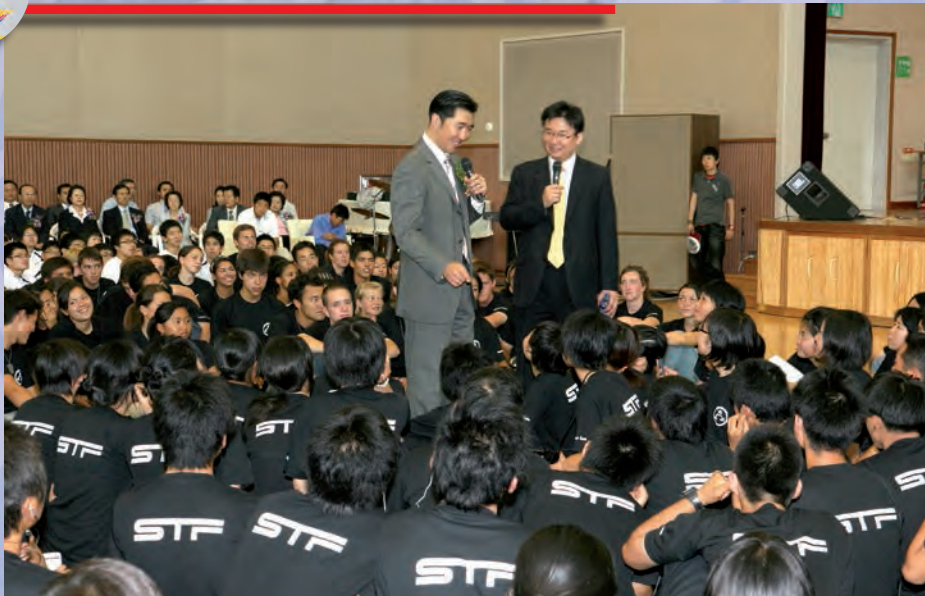
Enthusiastic STF members at the Youth and Student Leaders Rally on July 8, at Cheongpyeong Youth Center

especially our international brothers and sisters — have come to celebrate this vision of peace based on true love and the creation of true families. We have come as one family, stripping ourselves of our pretensions and evoking the spirit of harmony, unity and peace that only comes from the divine love of God, which we know to be true love, expressed in living for the sake of others.