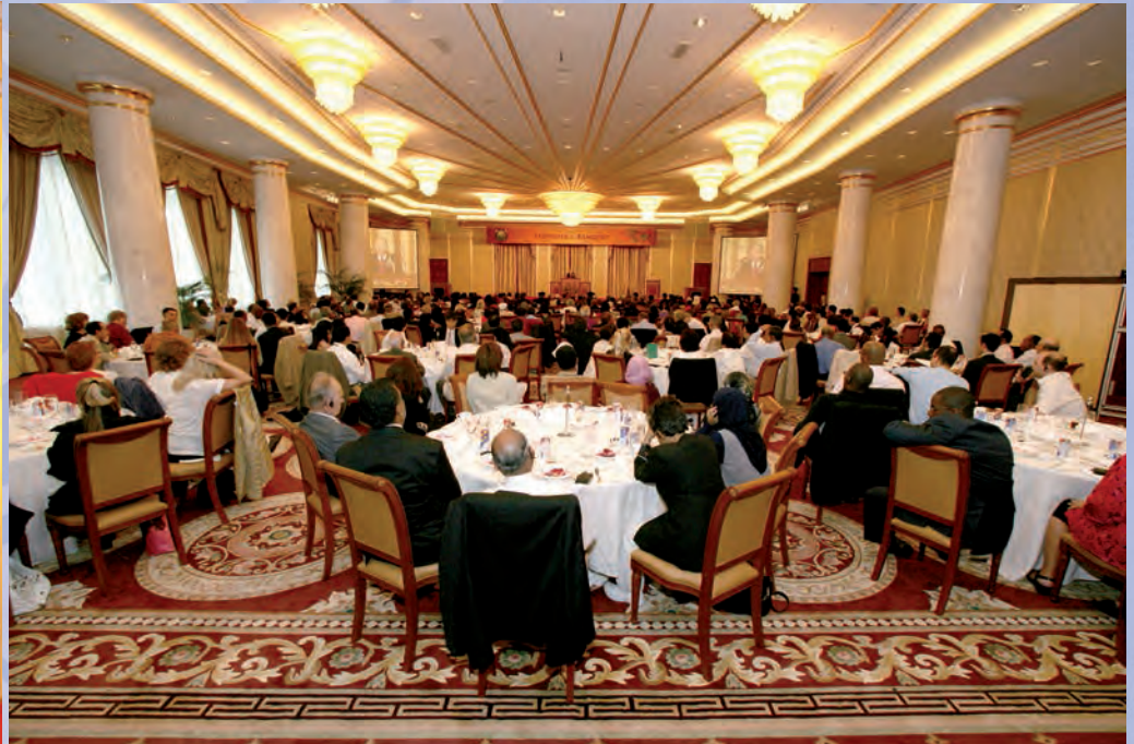
On July 19, participants (from the U.S., UK and France) of the July 17–21 International Leadership Conference in Seoul visited Cheon Jeong Peace Palace at True Parents' invitation. A similar ILC is scheduled for people from Japan, Germany and Italy.

During the Seoul Olympics in 1988, my father proposed the holding of a World Culture and Sports Festival. He envisioned a global festival that included sports, the arts and culture, academic conferences, and an interreligious and international celebration of marriage and family.