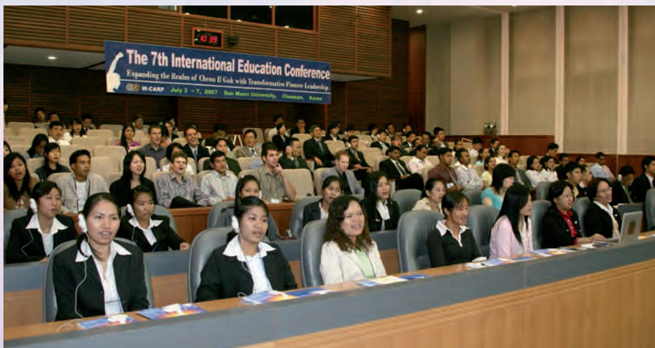
Left: World-CARP's seventh International Education Conference, held at the Cheonan campus of Sun Moon University; Right: Dance performance at the sixteenth World University Students Assembly, July 10