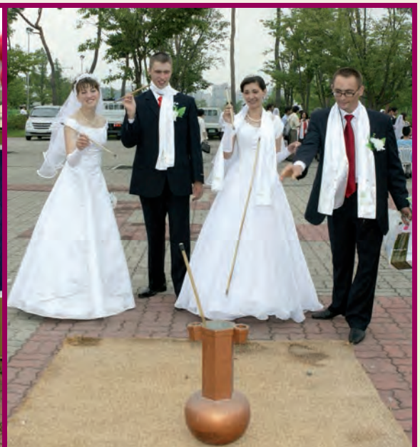
Traditional clothing brightens the Global Family Culture Festival after the Blessing Ceremony; newly blessed couples play a traditional Korean throwing game, tu-hoh .