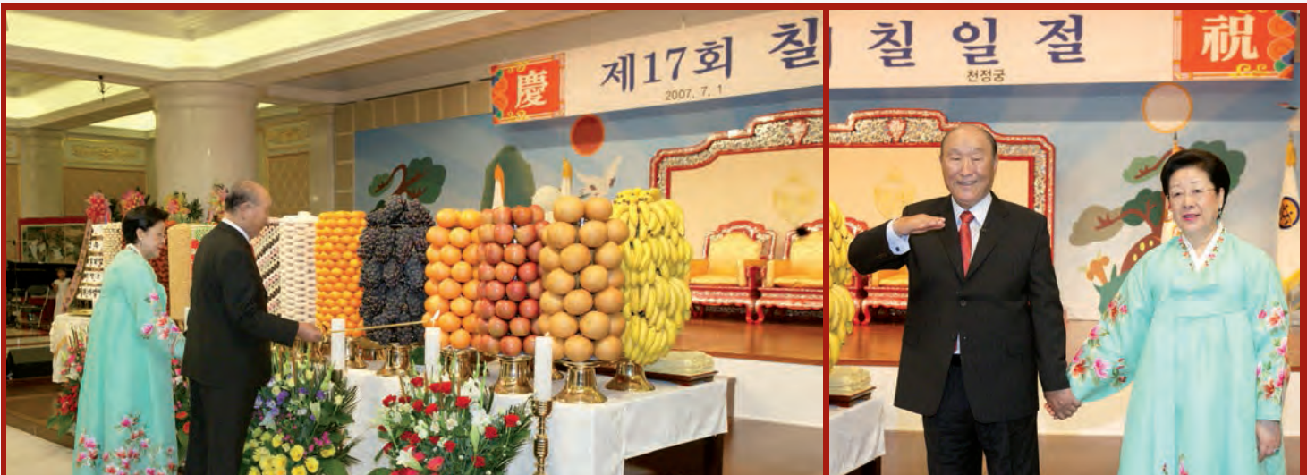
The seventeenth Chil Il Jeol, also known as the Declaration Day of God's Eternal Blessing, being celebrated on July 1 at Cheon Jeong Peace Palace; though he had been matching couples until late the night before, Father spoke extensively.