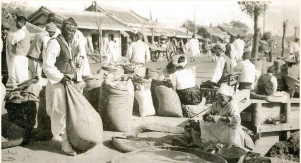
An outdoor market in the days of Father's youth, in Sinuiju, the capital of North Pyong-an Province, where Father's hometown is located

Furthermore, Heaven took away all my closest friends. In this way, those friends were actually blessed by Heaven. Heaven got rid of everything, and cut me off from everyone in the world I could trust and rely on. Some of them were from North Pyong-an Province and some of them were from Hwanghae Province. Heaven took away my closest friends. God was concerned that I, who was to take the will of God upon my shoulders, would share the situation with them. So,