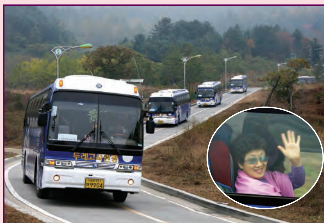
Seventeen buses carrying seven hundred WFWP members leaving the Cheongshim Youth Center for the border with North Korea

We started the WFWPI annual convention at 11 AM in a huge gymnasium in the Youth Center, where we listened to field reports from around the world of all the national and local WFWP activities. These women have made ground-breaking efforts to bring enemy factions together, provide well water and food to starv-