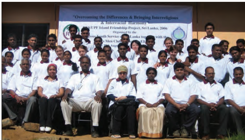
RYS Sri Lanka, September 2007

peace and peace in their communities is possible.