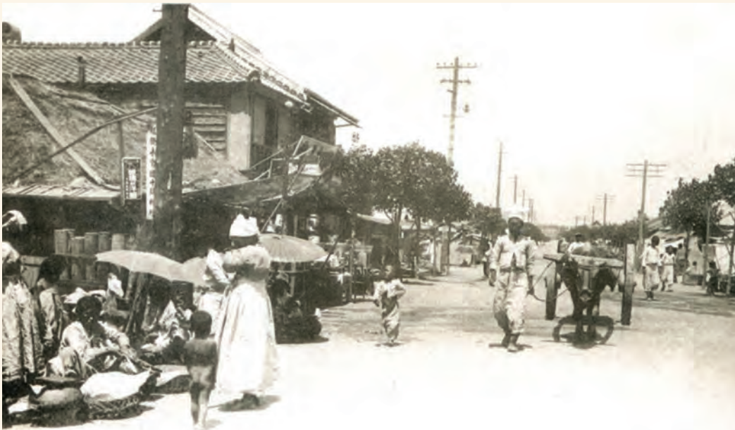
A street scene in northern Korea around the time Father was a boy

You may not know how much I thought before I started down this road. I have shed sweat and blood in order to go this way. I have prayed and devoted my life—risked my life—in order