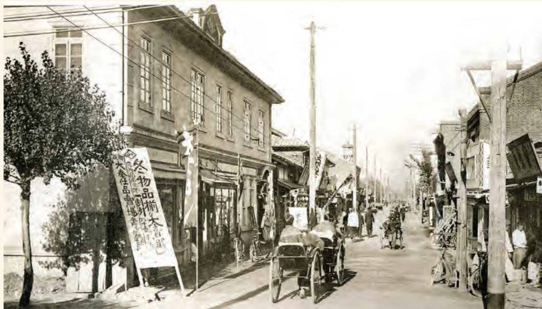
Rickshaw traffic on a street in Sinuiju; There was greater use of Chinese characters in Korea then than currently; the sign at left is advertising winter clothing for sale at a 10 percent discount.

April 17 is the day, two thousand years ago, when Jesus resurrected. Since that time, there have been many Christians.