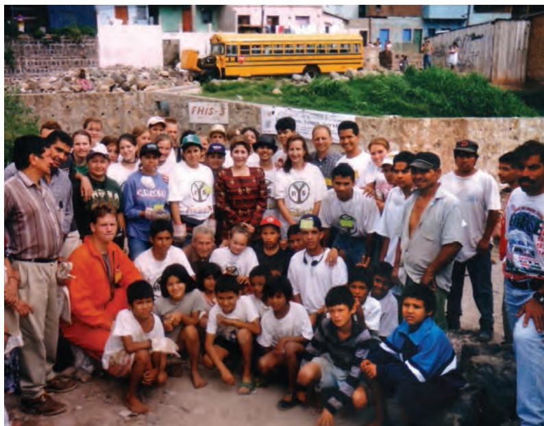
RYS participants at a work site in the capital of the Republic of Honduras, Tegucigalpa, with its mayor (standing, first row, center) in 1999

And that's really cool. Check us out online: www.rys.net ♦