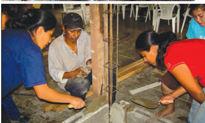
Top: RYS participants in a group-building exercise in Guyana, July 2005, Second: Foot-washing ceremony in Malaysia, June 2006, Third: Mixing concrete in Guatemala, July 2006 Bottom: Building a kitchen in Honduras, August 2007