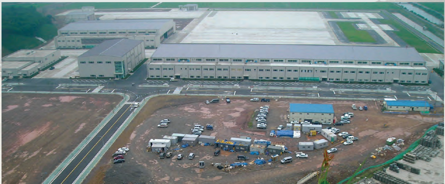
A bird's-eye view of a portion of the Gimpo Aerospace Industrial Complex

Following the official ceremony, guests of honor were taken on a tour of the facilities.