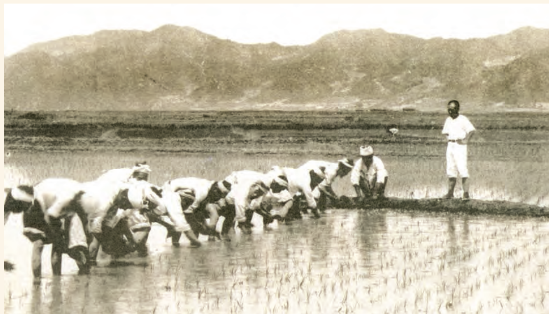
Food riots in Japan during the 1920s resulted in increased rice cultivation in Korea for export only.

that there are many tearful crossroads behind the Unification Church tradition. In retrospect, they have become points of resolve for resurrection and revival that cannot be blocked. I have gone through the era under Japanese rule, I have been through North Korea, I have been through South Korea, and through America; I have journeyed throughout the world. Having learned why the road to Heaven is accompanied by so much persecution, I can only be grateful to You that You have had me walk that road throughout my life. For this, I offer You my gratitude once again. ♦