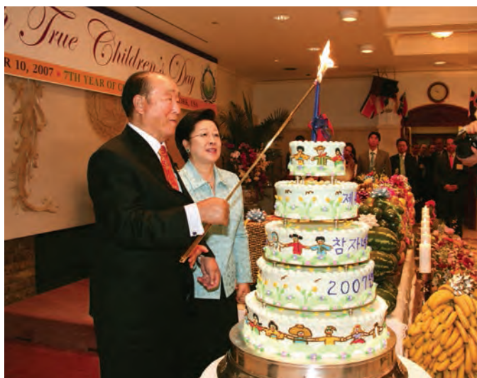
The 48 th True Children's Day was celebrated at East Garden, New York, on November 10, the day before True Mother's tour began in Los Angeles.

From this point on, when God controls or stands as master over a situation, he can achieve what he wishes. This is