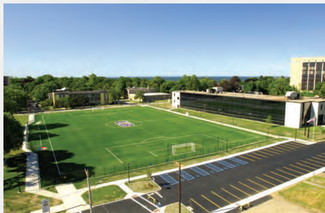
The UB campus is 60 miles northeast of New York City.