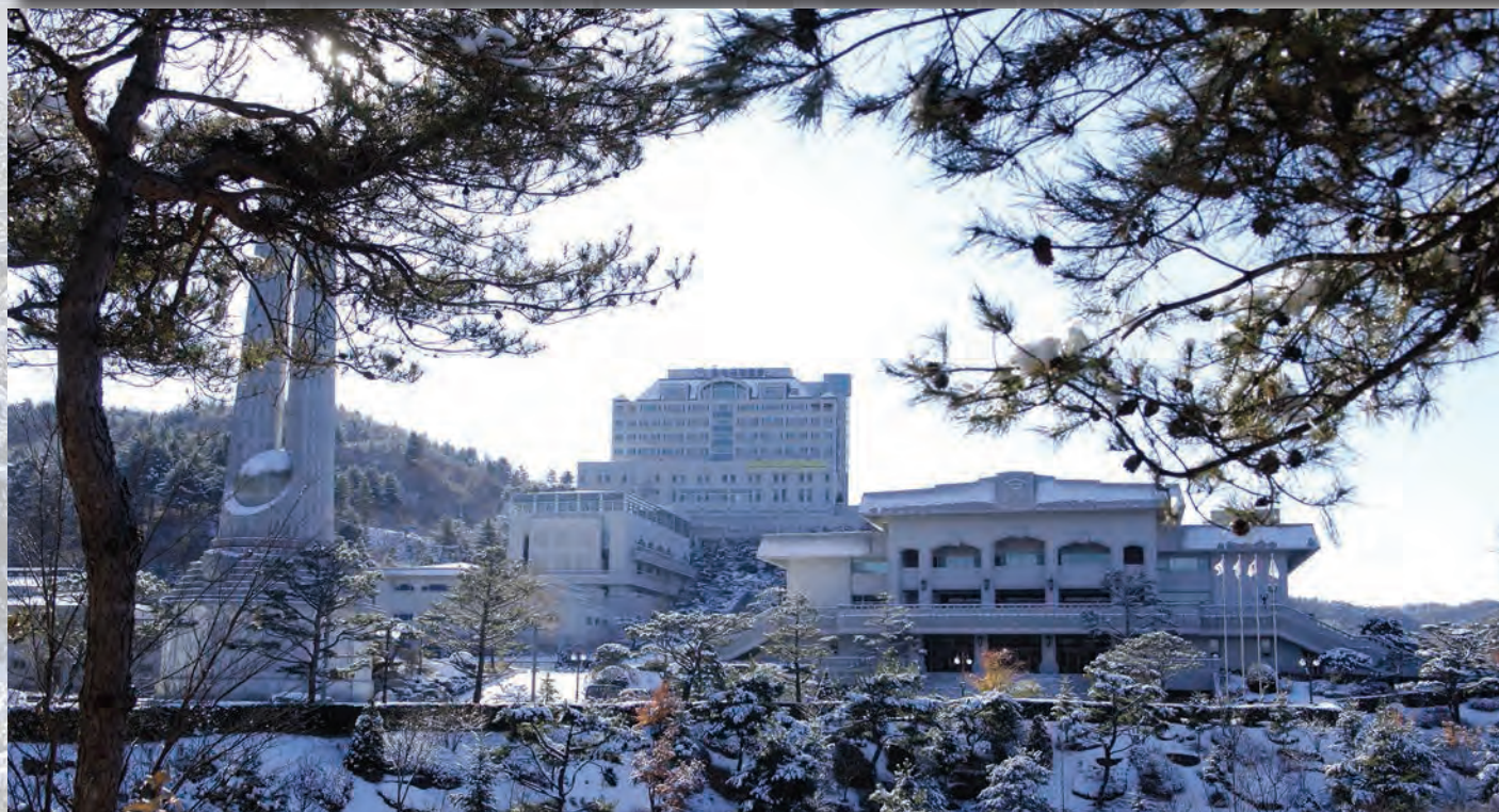
The Cheongpyeong Heaven and Earth Training Center with Cheongshim Tower in the left foreground, the main hall on the right, minor halls on the left and Cheongshim Hospital in the background