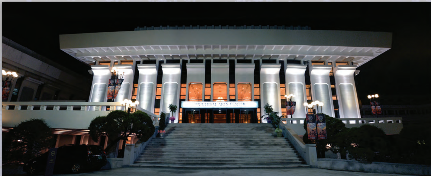
Universal Arts Center was built as The Little Angels Performing Arts Center in 1982 and renamed after renovations in 2007

create a trilogy of Korean ballets that express values that True Parents uphold and teach. Shim Chung expresses filial piety, the story of Chunhyang is about chastity, loyalty and true love; and Heungbu-Nolbu is about brotherly love.