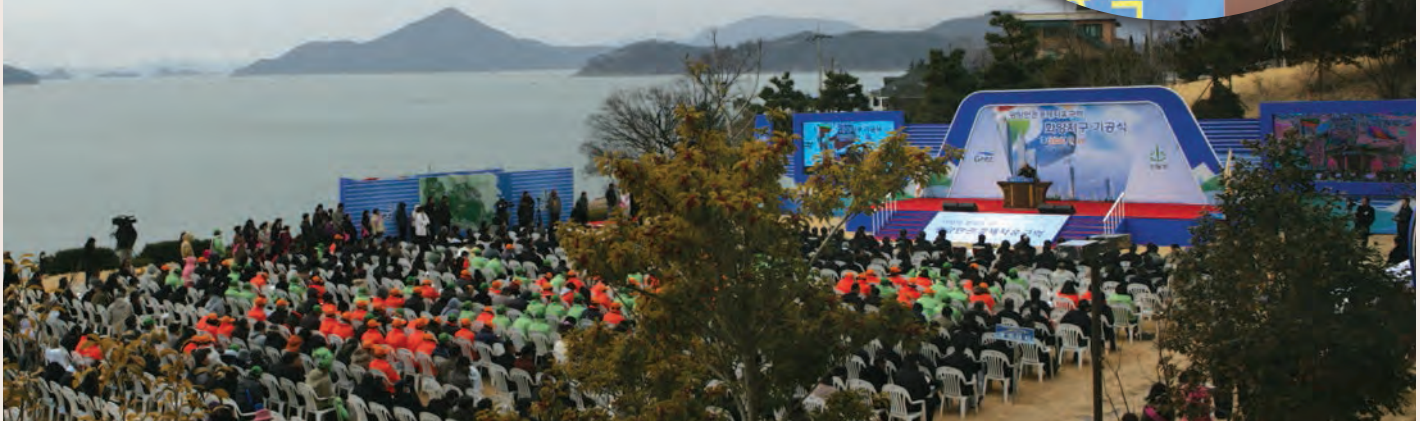
Father spoke at the January 29 Groundbreaking Ceremony for the Hwayang Free Economic Zone (FEZ); Korea is developing FEZ to increase both manufacturing and trade. The Hwayang FEZ in Gwangyang Bay is being developed as a global marine leisure complex and was a key component in nearby Yeosu's successful bid to host Expo 2012.

work on furthering my understanding of the Principle. Yet, in the early days we failed to link the ideals expounded in the Principle with the blessing ideal. In the beginning, we did not think Father would bless thirty-six couples. The first thing we expected Father to do was select his twelve disciples. I personally did not even dream I would be included; I'd gone there thinking it would be interesting to watch my elder brothers being matched but I ended up receiving that grace myself.