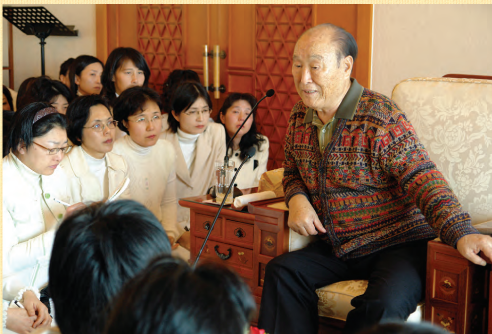
Among those at hoondokhwae on January 4 at Blue Sea Garden were Japanese women living in Korea with their husbands, who are in Yeosu for 40-day workshops that mainly consists of on-the-sea training

When you return home, what will you have received through your prayers? The time has come to ask. All sorts of things should be written down as if in a diary where nothing is hidden. As in Cheon Seong Gyeong , your history should radiate from the pages. I am now allowing you to introduce your history to your descendants as you embrace and unite with all the content used for heavenly hoondokhwae, including Cheon Seong Gyeong , Pyeong Hwa Hoon Gyeong , and the Family Pledge.