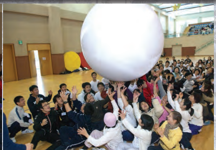
On January 13, participants of the 121 st forty-day Cheongpyeong workshop enjoyed a sports day at the Youth Center.