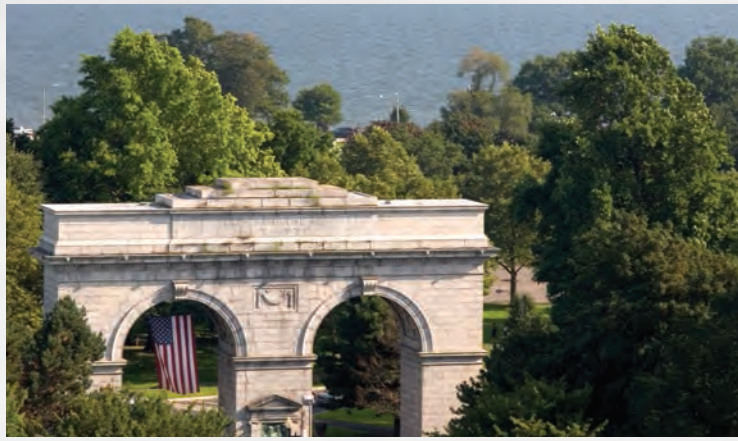
Many student recreational activities take place at nearby Seaside Park, which abuts the Atlantic Ocean; seen here, the 100-year-old Perry Memorial Arch.

UB's International College has received national