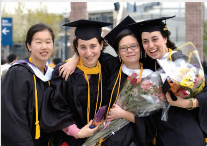
Right: Happy University of Bridgeport graduates Left: The April 15 th International Festival featured 14 performances and 26 food booths