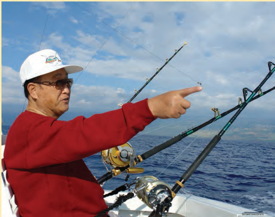
At 88 years of age, Father still regularly goes to sea

ents' Day? True Husbands' Day? True Wives' Day? True Married Couples' Day? Unification Church blessed families know about those. People who have not received the blessing would not know, but people who received the blessing know those things.