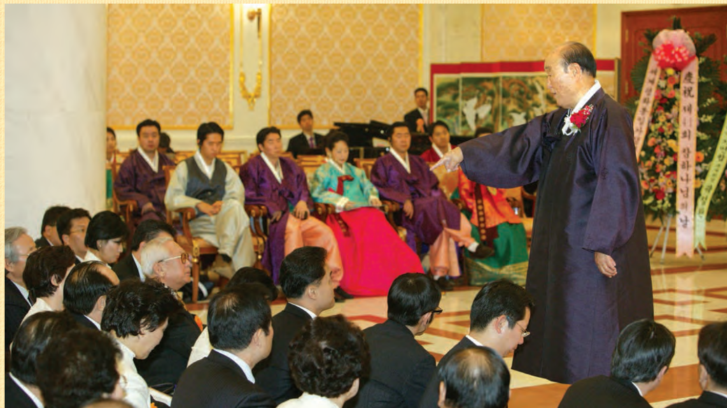
True Children, ambassadors for peace (seated on the floor) and members start the new year off by listening to Father's speech.

True Parents by themselves are all that's needed, so why are there so many other terms attached? What's the relationship between the True Parent and the Savior, or Messiah? Jesus died two thousand years ago, so what connection do I have with him that I am called the returning Lord? He is the Lord who had to accomplish what he had set out to do by coming again.