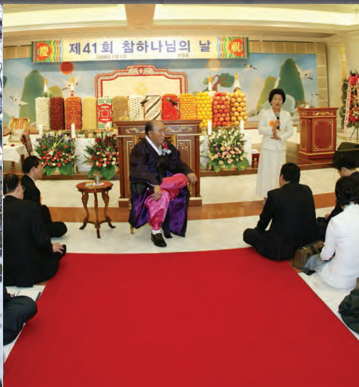
Left: Jeongshimweon (literally, place of pure heart), the Cheongpyeong prayer hall, amidst the glory of nature Right: True Father listening to Dae-mo nim as she reports about the spirit world on January 1