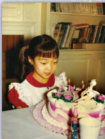
Above: Six years old, with a ballerina on her birthday cake; right: As a member of the Little Angels, around age 10

I started lessons, with my younger sister, at McLean School of Arts. It was in one of those old, little wooden churches where the pews were taken out to make a dance studio. The fact that my first ballet school was in a church is quite meaningful because through all the difficult moments in my dance career it was my faith that sustained me.