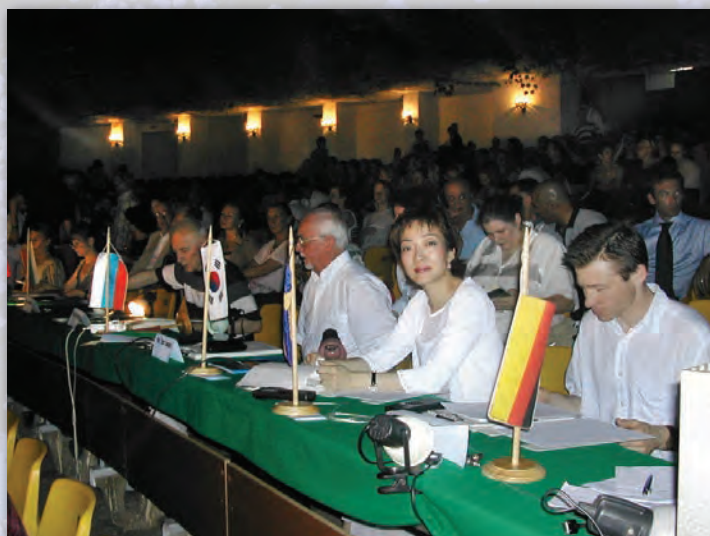
In Bulgaria, serving as a member of the jury at the 2002 Varna International Ballet Competition. Established in 1964, the Varna IBC is the oldest international ballet competition.