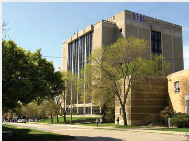
The Magnus Wahlstrom Library; its book collection comprises more than 270,000 titles.