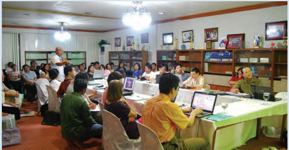
A National Steering Committee meeting, like the one pictured here, was the first step taken toward GPF 2007.