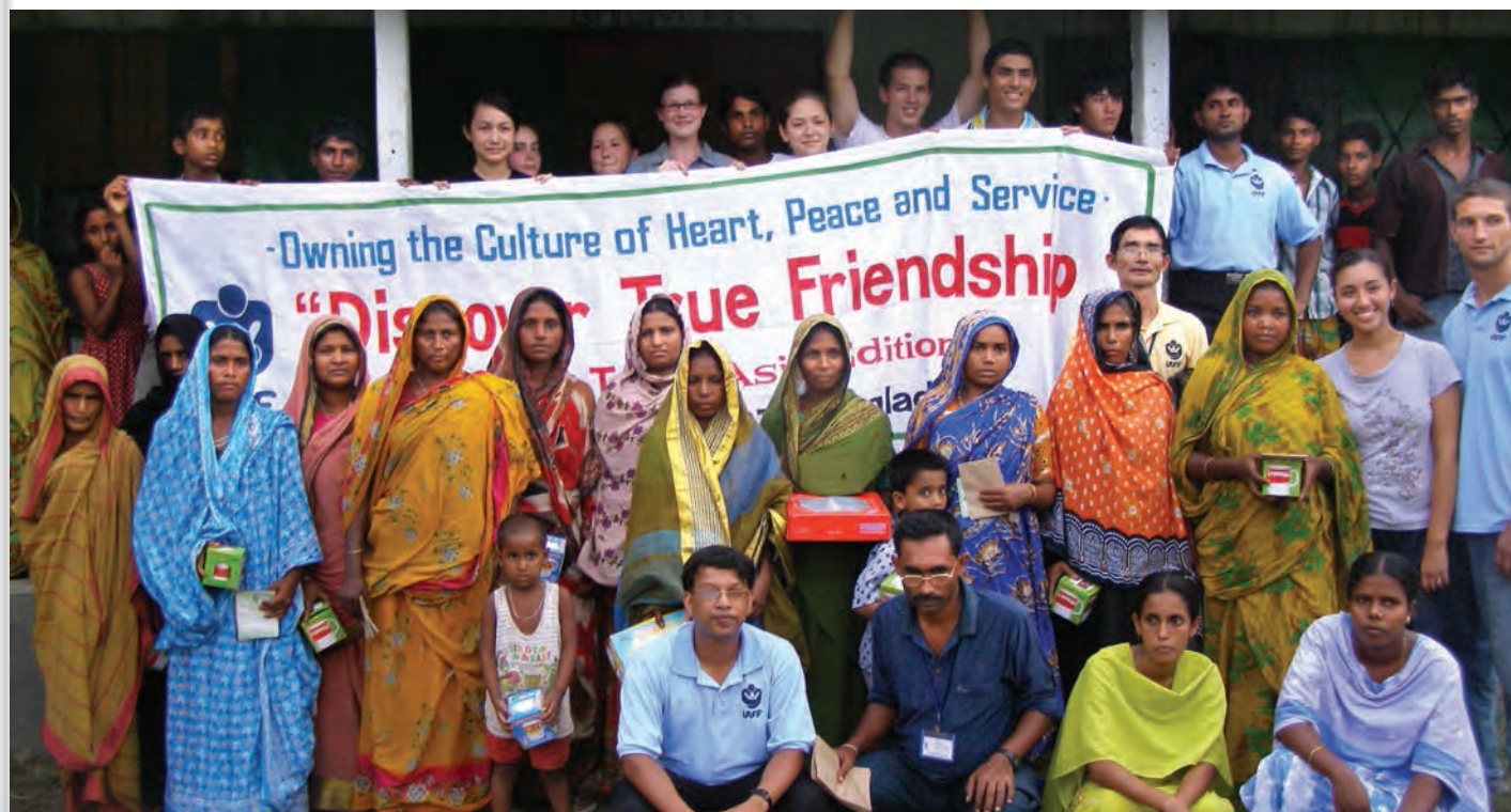
Project volunteers and IRFF officials with Bangladeshi woman recipients of microfinancing loans

Bangladeshi students also participated in last year's project. Two of them, a boy and a girl, had graduated from Jaigeer School ten years earlier. Today, the boy is at the top level in a university