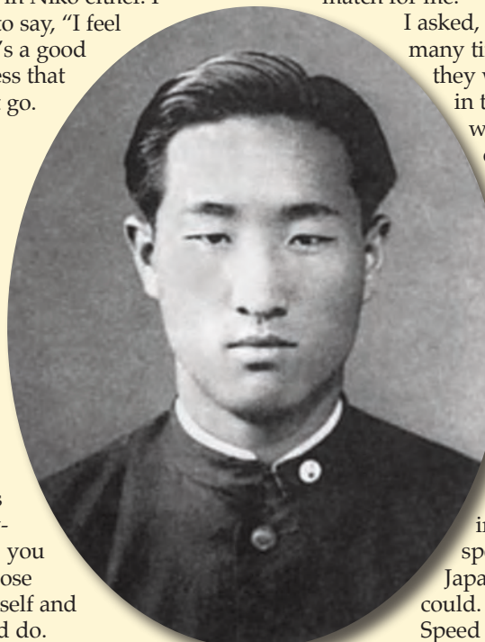
Father as a student in Japan

I was the champion wrestler in high school. I was good at running and jumping. I even boxed. I could hit a bad person—Pow!—and he would go flying. Why did I do this? It was not in order to fight. In order to realize a great revolution, in order to put this world back on the right path according to heavenly law, in order to make a peaceful world, I needed a strong, healthy body.