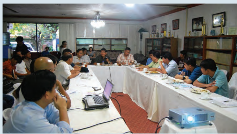
A meeting of the Global Peace Festival Security Committee; Top: A banner advertising GPF 2007