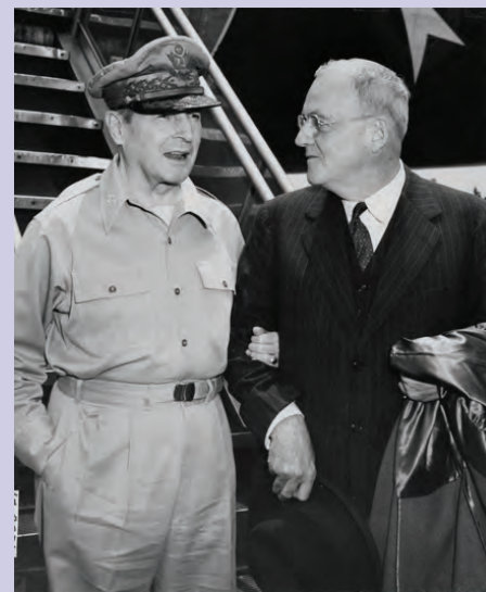
Gen. Douglas MacArthur meeting John Foster Dulles at Haneda Airport, Tokyo, on June 21, 1950. Dulles, then a U.S. State Department consultant, had arrived from Korea, where war broke out four days later.

5 Similarly, some U.S. government policies in the Japanese Occupation had been overturned by business-related lobbyists.