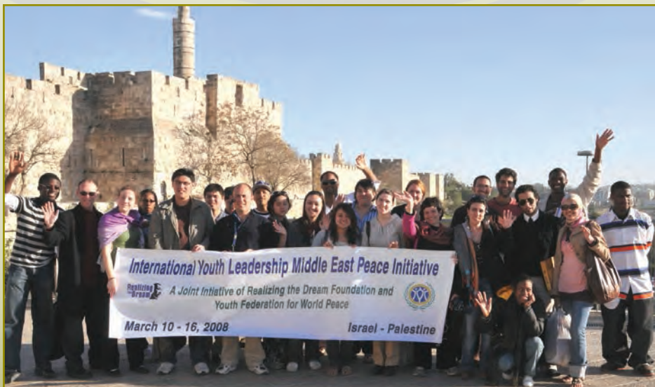
Participants pose in front of the Old City of Jerusalem