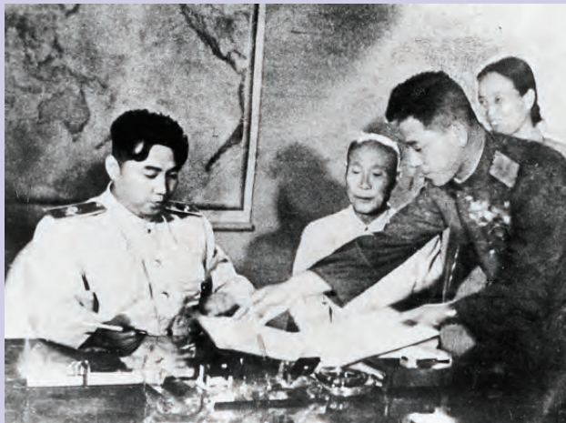
Lt. Gen. Nam Il presents the Armistice Agreement to North Korean Premier Kim Il-Sung for his signature. Kim had pushed Stalin for permission to launch the war but after three years of bloody warfare he welcomed the ceasefire.

Berlin was deep within the Soviet portion of Germany. The Soviets blocked all land transportation through their zone to the Western sectors of Berlin. This happened intermittently at first, but once the new currency was issued,