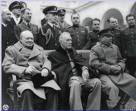
At Yalta, Winston Churchill, Franklin Roosevelt and Josef Stalin

the Europe-first policy were the more adamantly anti-communist and Christians who feared a focus on Europe would lead to Communist encroachment endangering their mission work in Asia. As it happened, the Europe-first policy had grave ramifications for Asia. The Chinese Nationalists (Kuomintang) would suffer its effects, as would the Koreans.