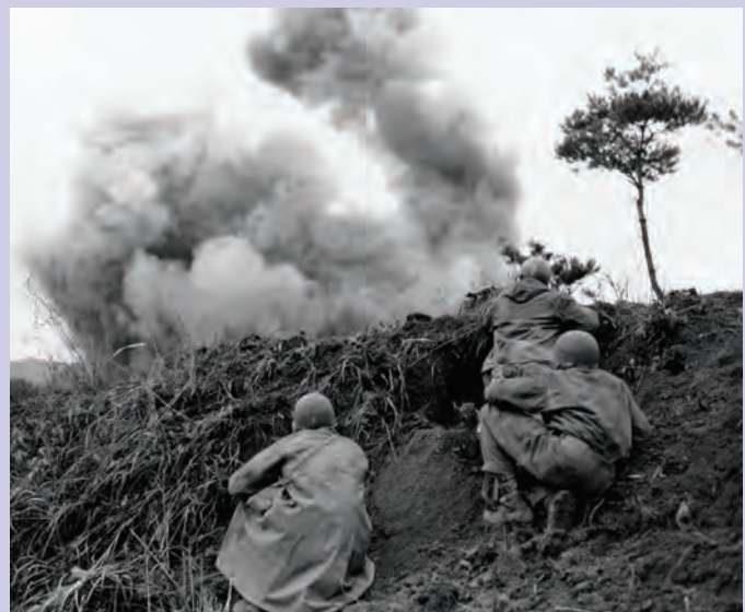
In the first 3 months of war, the U.S. Army had transported 100,000 people and 2 million tons of equipment to Korea

A government official who was at Yalta later explained that “Roosevelt and Churchill also conceded Stalin’s demands in the Far East, including...the