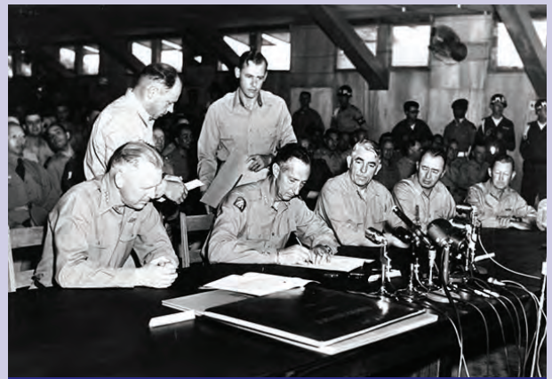
Mark Clark, Commander-in-Chief of the United Nations Command signs the Korean Armistice Agreement on July 27, 1953. As agreed, fighting continued for 12 hours more.

The Korean War broke out less than a year later. Rumors of Soviet involvement were rife. By the fifth day of the war, the U.S. Commander of the Far East Air Forces had to deny U.S. news reports that many of the North Korean fighter planes had Russian pilots.