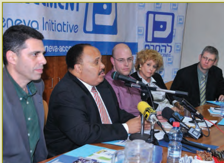
Martin Luther King III, who heads Realizing the Dream, speaking at the Geneva Peace Accord Institute

Knowing that service is a foundation for peace, participants invested their efforts in a number of community projects. The Ital-