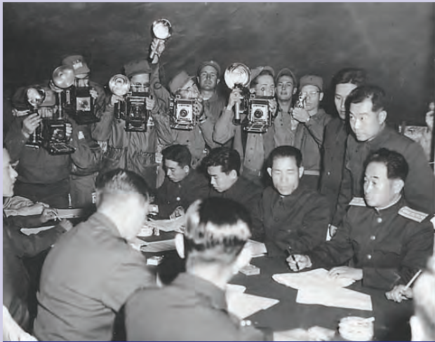
On July 10, 1951, armistice negotiations began in a tent near Kaesong, North Korea. That day, the Communist side barred newsmen, so the UN delegation walked out. Talks resumed 4 days later.

acquisition of a position in Manchuria that was tantamount to full control of that ancient Chinese province.”