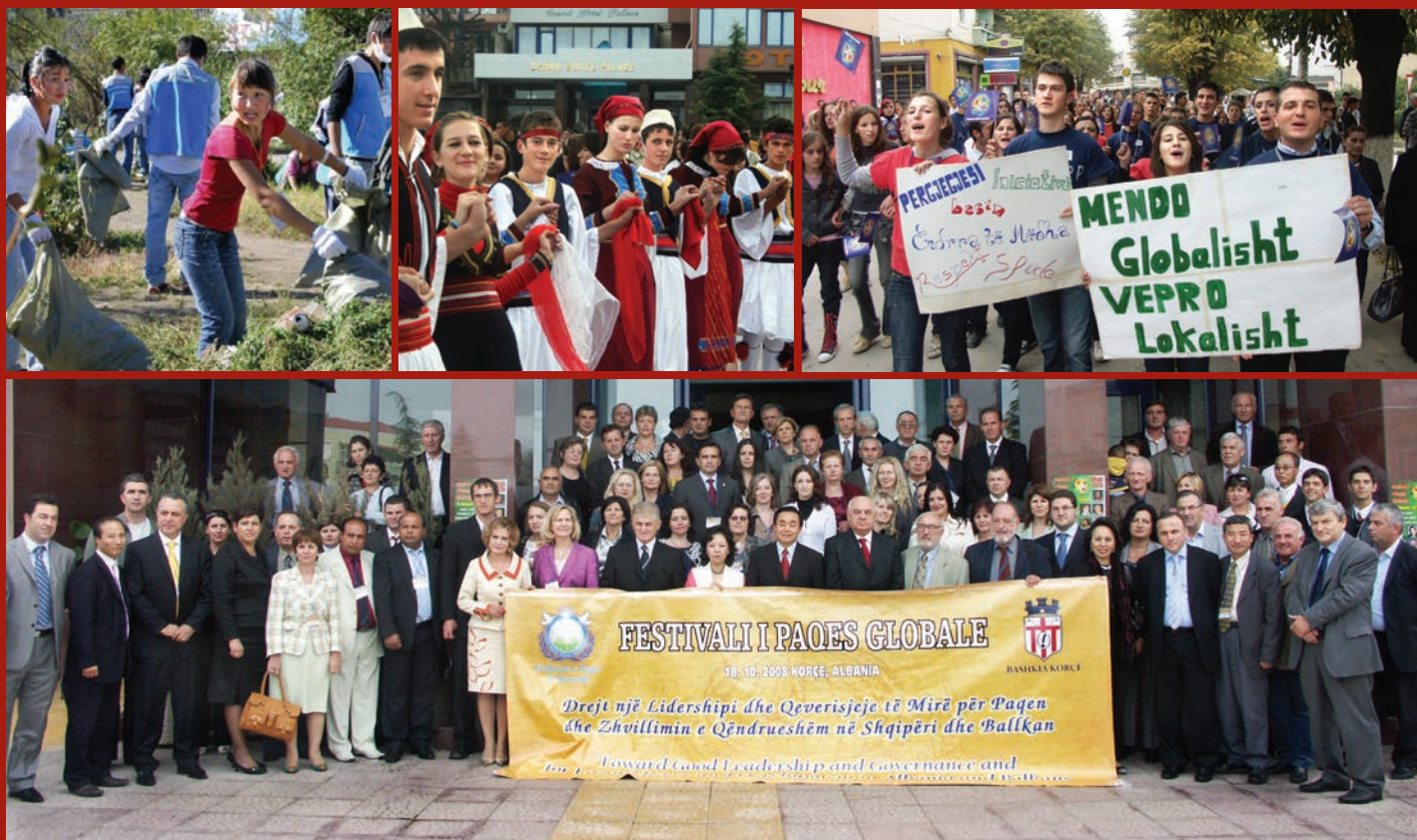
GPF in Korça, Albania, October 11-18, 2008

Everyone connected with the outreach to Christianity and the Global Peace Festival is feeling that somehow a corner has been turned, and God is harvesting the prepared hearts of His children. TW