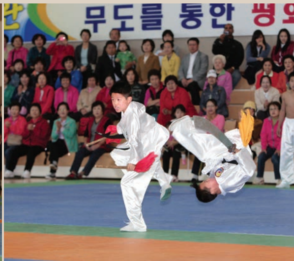
Young Chinese participants demonstrate fighting techniques