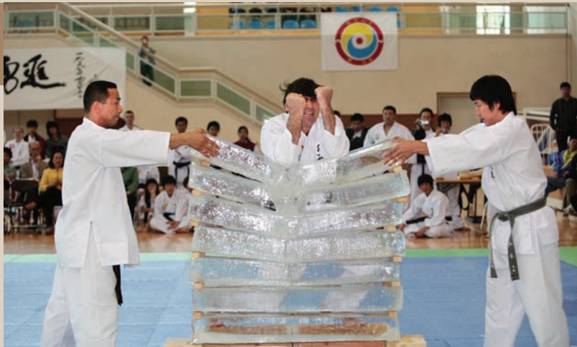
In front of True Parents, the author smashed all seven layers

Since 2001, we have been continuously expanding a renewed Tongil Moodo. I am responsible for South America and the Caribbean. Our international instructors have been