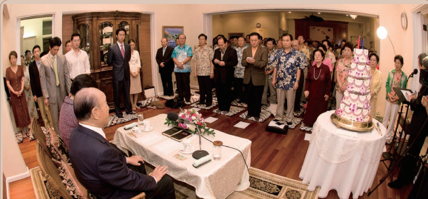
True Family members stood, as did the congregation, throughout Father's speech in Hawaii King Garden.

understand? This is a time of transition.