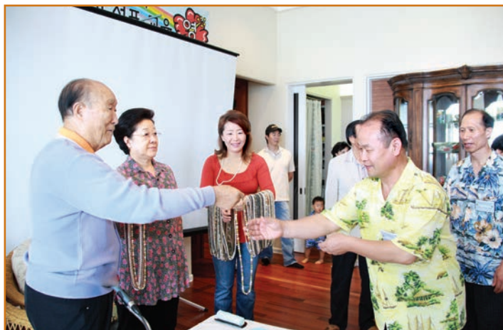
In-jin nim, Mother and Father distributing necklaces, gift-mementos of the workshop, on October 10

We planted trees in front of the King Garden house. Trees were planted to the east, west, south and north of King Garden. Father determined which trees should be planted to the east, west, south