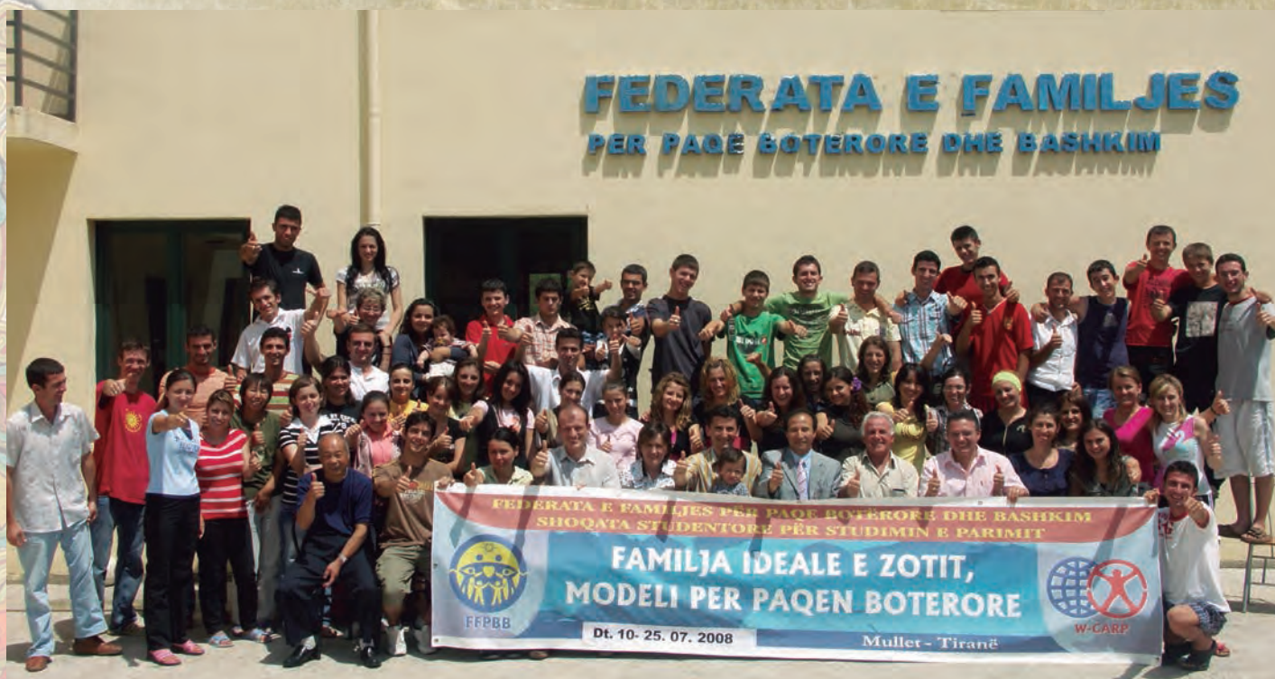
What better way is there to spend a summer holiday? Participants in a fifteen-day Divine Principle seminar in Albania in 2008 show their approval.

All people have the right to follow God. Understanding the fact that we are God's children doesn't lead to our sitting calmly at home. We want to go out. We want to