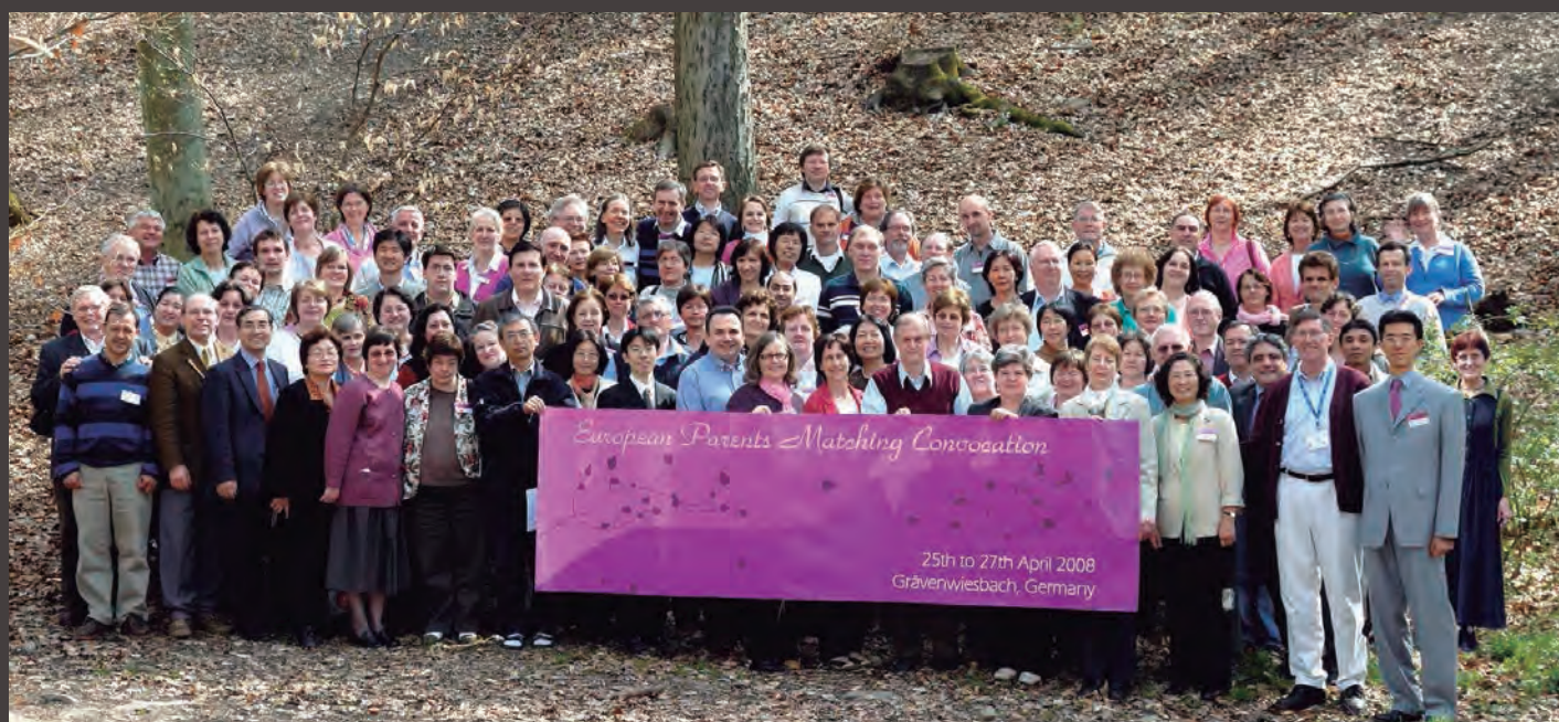
As the number of second-generation blessing candidates increases, parents are pursuing various means of networking.

Once you have agreed upon a candidate and made contact