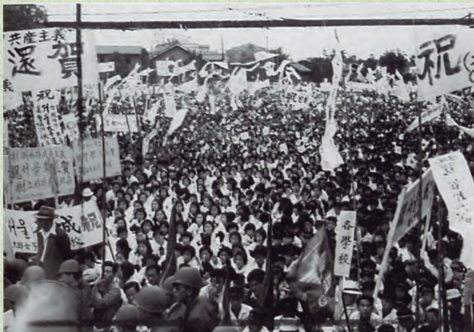
Three days into the war, North Korea captured Seoul; here, people, many of them refugees, in the city of Daegu celebrate news of Seoul's recapture by UN Forces in September 1950. North Korea's ally, China, took Seoul in January 1951 but relinquished it two months later.

radish leaf, you should first think of preserving it as historical evidence by filing it or taking a picture of it. These things will allow your children to inherit the very essence of our tradition without you preaching a word to them.