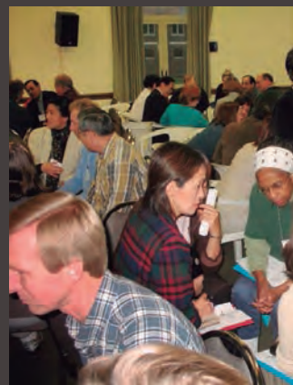
Help is available for parents who at first may find daunting the responsibility of suggesting an eternal mate for their child.