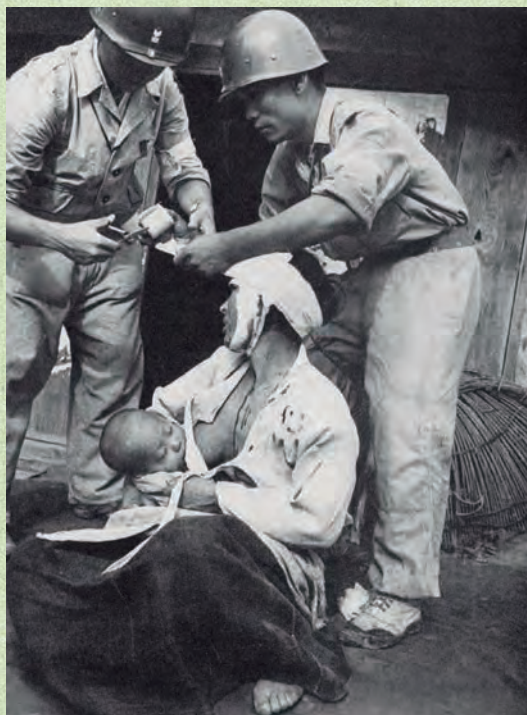
Around August 1950, South Korean soldiers tend to a head wound on a woman whose child's life depends on her survival.