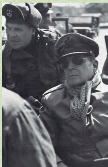
Gen. Douglas MacArthur during the Korean War

In this installment, the fourteenth to appear in Today's World, Father continues his account of experiences while imprisoned in Hungnam, North Korea, that he began in our last issue. The text is drawn from the third and fourth chapters of the second book of the series True Parents' Life Course (참부모님 생애 노정). The books are composed of excerpts from Father's speeches over many years, arranged more or less chronologically in the form of an autobiographical account.