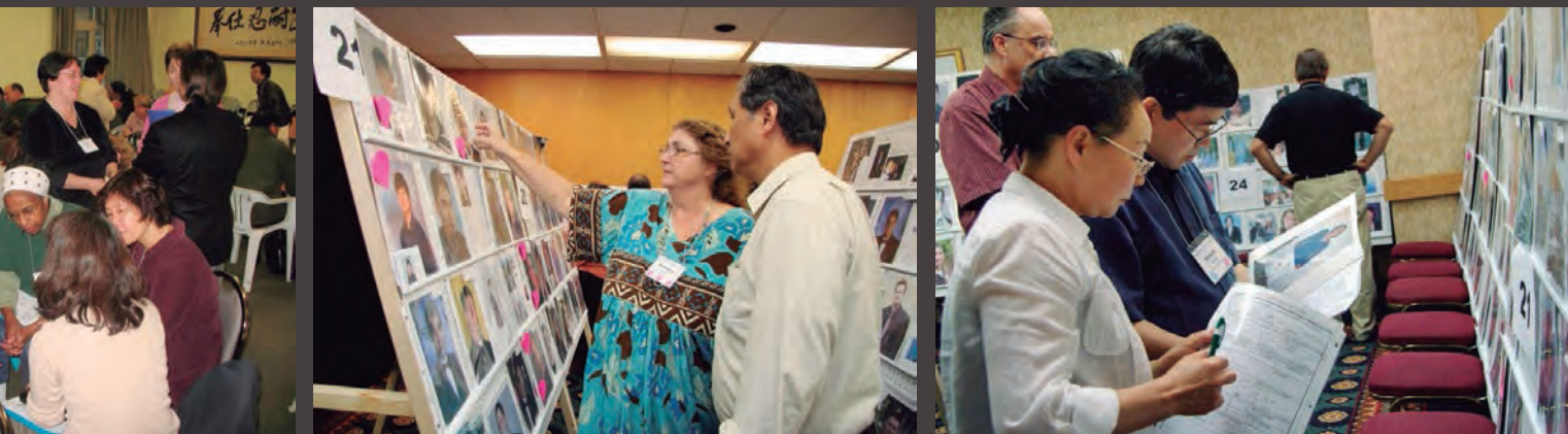
Parents looking at pictures of blessing candidates on viewing boards like those Father has used when matching people by photo.

There are plenty of opportunities for misunderstandings between parents, so it is wise to not become overexcited or rushed along by emotion, either yours or that of the other couple. It is advisable to thoroughly discuss the match with the other couple until you are all sure that everyone is happy to proceed. Only then should you inform the children. We need to understand that parents often have different approaches