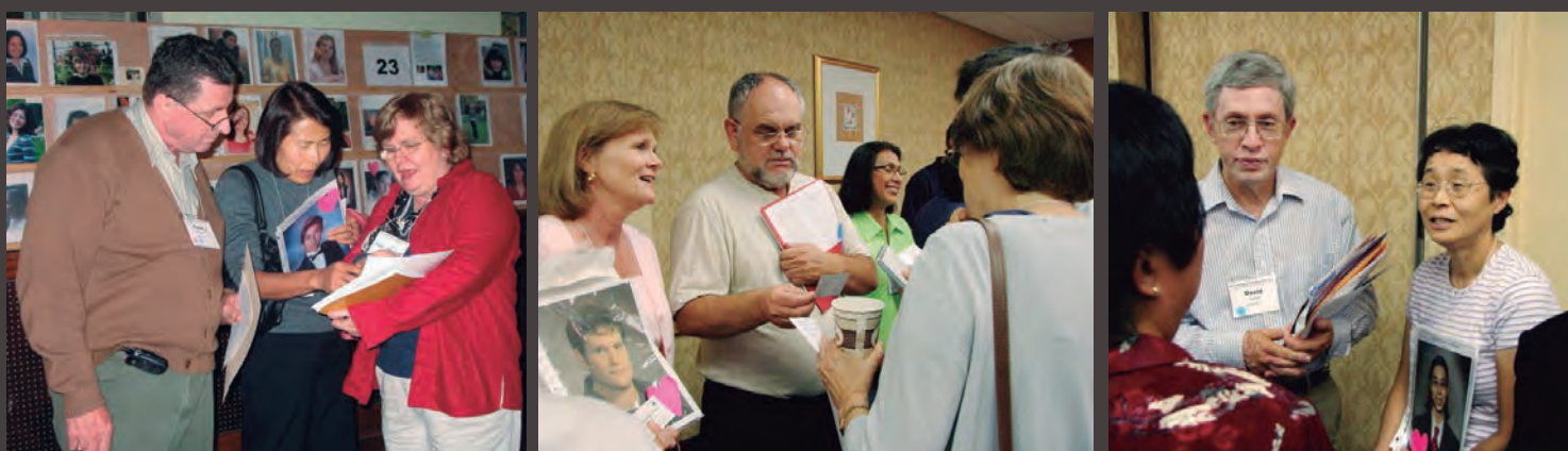
Often, discussions between sets of parents precede parent-child discussions and eventual discussions between candidates.

There are many ways to approach the matching of our child, when looking for the "right one." Matching web sites—Matchbook (found at www.blessedfamilies.org ) and www.bcmatching.org —can be a great help because you can see many candidates whose families you don't know. Be objective, discuss ideas, make lists, use your intuition and what you believe in. You can also use the support team.