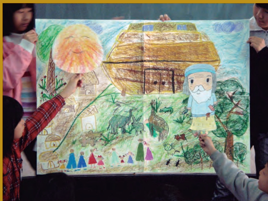
Using their own artwork, workshop participants give a simplified presentation of the Providence of Restoration in Noah's Family.