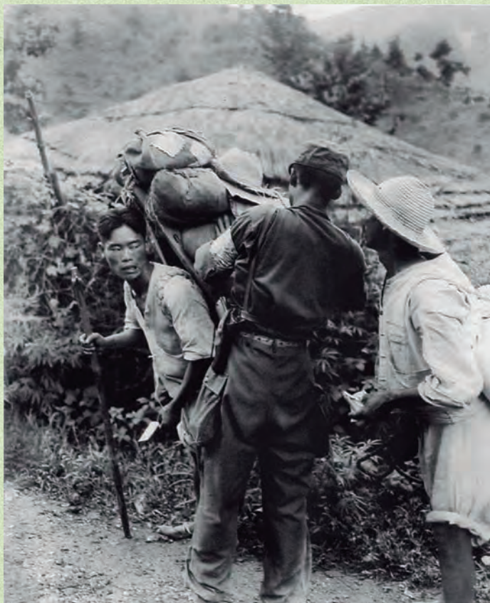
Suspicion of refugees prevails in a civil war. From Hungnam to Busan, Father would have gone through or skirted frequent North Korean and South Korean checkpoints like this one.