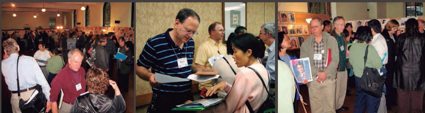
Decades after Father successfully matched them in an instant, parents cautiously navigate the process of matching their own children.

(contacting many parents at the same time) is another feasible method. But I believe that speaking to one set of parents is spiritually clearer. There is less likelihood of someone getting hurt through the process.