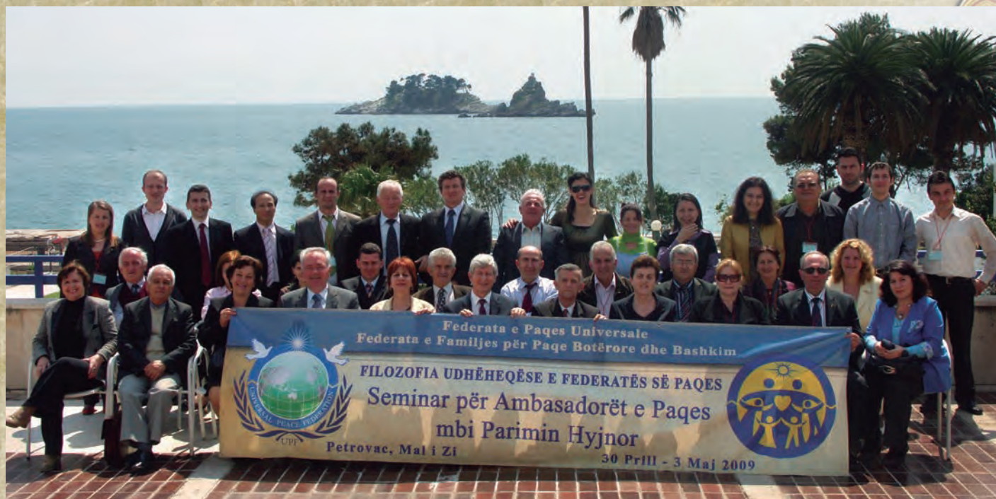
Albanian ambassadors for peace, like those pictured here at a three-day Divine Principle seminar in Montenegro in spring 2009, have been a good influence within the movement, sometimes attending Principle seminars alongside young members.

Of course, we take care of them while they are attending the lectures, but after Divine Principle seminars, they need a higher level of care, because as they increasingly understand the truth, the contrast between it and the present world becomes starker.