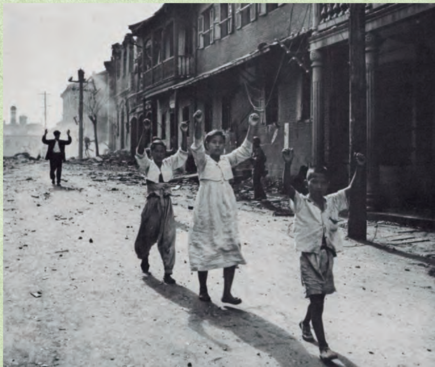
On the day UN Forces liberated Incheon, driving out the North Korean Red Army, civilians were still fearful and distrustful.

eight hundred prisoners, out of roughly a thousand, were ordered to march to a meeting point fifty kilometers from the prison. We marched out in obedience to the order from the central command for more soldiers for frontline combat.