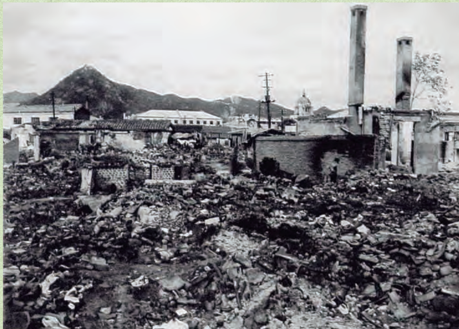
A view of the Chong-no borough, the central shopping area of modern Seoul, as it looked in October 1950

Despite being a family man with a wife and two sons, he was very devoted to me and after his release kept visiting me in prison, hoping for my release. After my release, I set out in a hurry to reach Pyongyang, but since I was passing his house, I felt obliged to stop by and greet his family. After we exchanged some greetings and said our goodbyes, I left to continue my journey. Suddenly, he ran out of his house and started following me. "Why are you coming with me?" I asked. He replied that he felt compelled to follow me. So he came along.