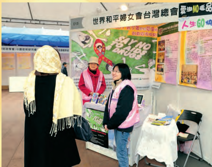
At a public exhibition of the Unification movement's organizations in Taiwan, Taiwanese members of the Women's Federation explain their work.

The seven deaths and resurrections theology completely