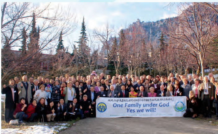
Activities for 2009 were set in motion at the European FFWPU Leaders Meeting in San Marino last February.

The blood in the system, which had been rather stagnant, is now beginning to circulate again. FW