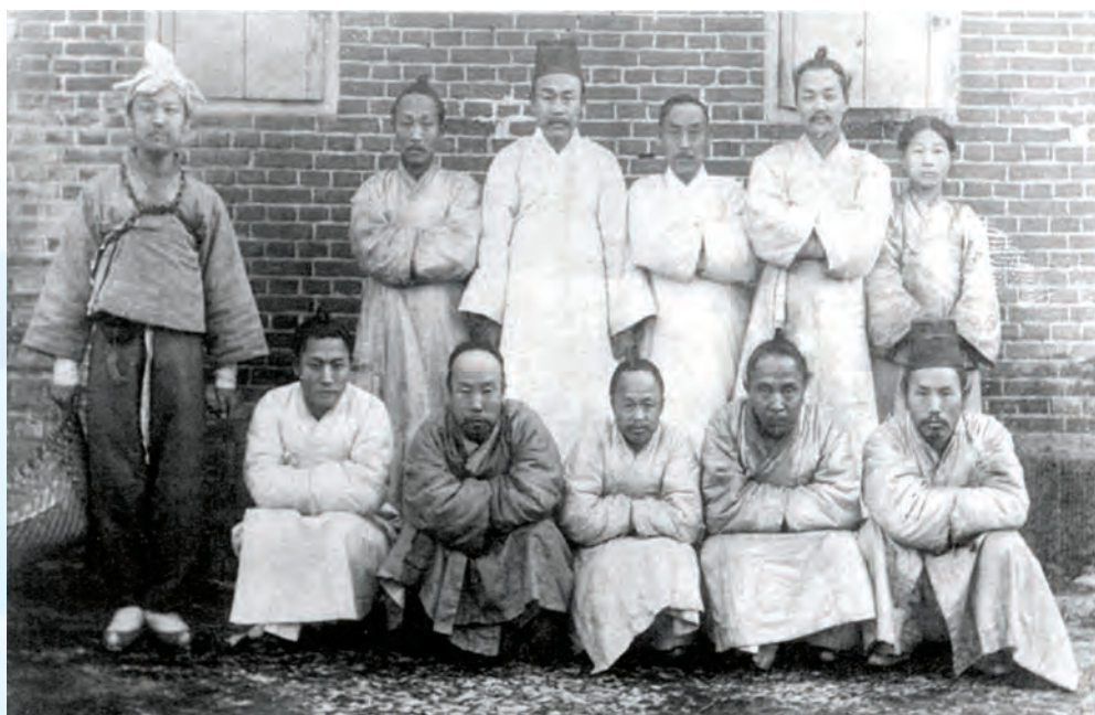
Future president of Korea Syngman Rhee (in chains) led protests against Korea's last king for allowing foreign meddling and was imprisoned in 1899 for more than five years. Father says Rhee should have played a key role in Father winning over America.

occurred in Korea because I tried to make that connection.