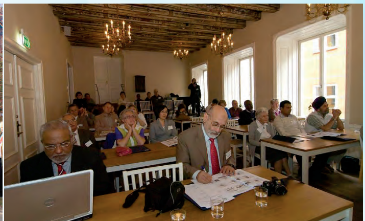
Ambassadors for Peace are among the participants in this May 2009 European Leadership Conference in Sweden.