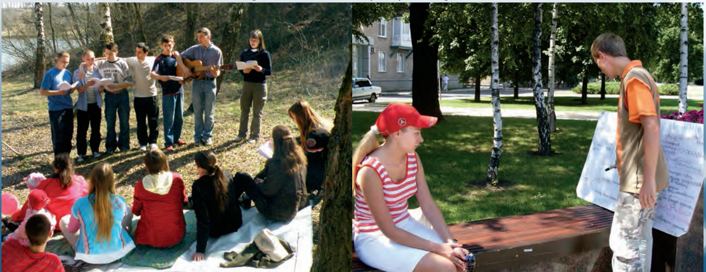
Left: A program to inspire 21-day workshop graduates to take the next step; Right: An introductory Divine Principle lecture in a park