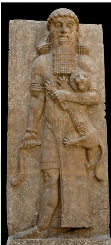
In the Epic of Gilgamesh, Enkidu, who was created by a god, found that after sexual union with a woman the gods had sent to him, he'd gained knowledge but lost his connection with nature.

If it's been a long time since you've studied anything seriously, you might want to try Wired Study Tips, which teaches aggressive study habits. It can be found in iTunes at Texas A & M University. Under "price," you'll see