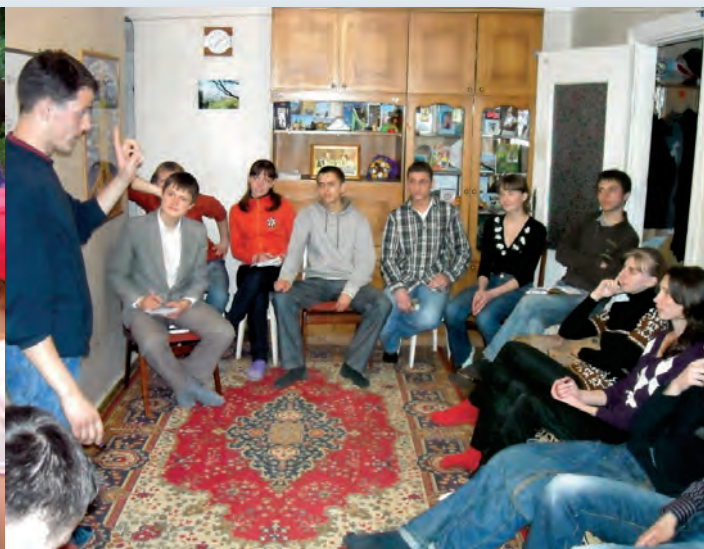
Left: Jeondo (witnessing) to people on the street; Right: A Divine Principle study meeting in progress at a church center