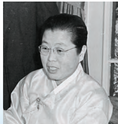
Kim Hwal-lan, who was the first Korean woman to earn a PhD (from Columbia University in the U.S.), could have been influential in supporting Father’s mission.