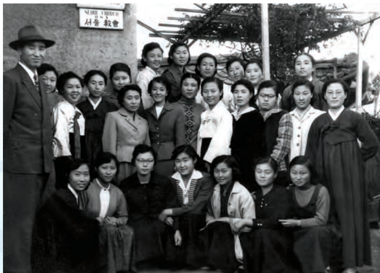
Father in front of the church with some of the professors who resigned and students who had been dismissed from Ewha University

would also have ended up being led by me. There was a big fuss. So the expulsions went ahead.