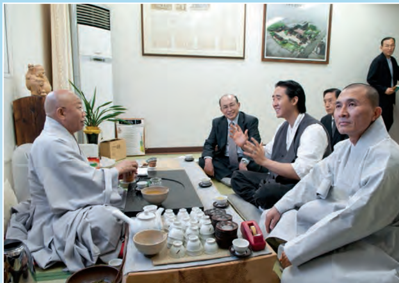
Hyung-jin nim shares his heart and his faith in many situations

The leaders that come out of such a group will be leaders that have nothing to do with bureaucracy. There will be no distance between these leaders and their members and they will bring results by teamwork. I always knew that teamwork was important conceptually, but it was only when I began