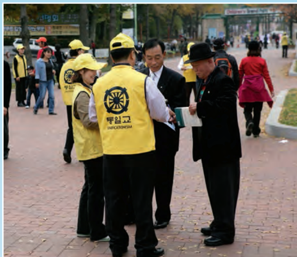
These members are not being shy about their faith

international president has taken the initiative in this; he went out witnessing first. I thought, "There's our president out there working hard; I really must go out too." I felt pain in my heart. It is we who should be doing this, but because we had been unable to get it going, our international president has been going out himself to set an example. I felt I could not just sit quietly. I decided to go out too. Many members think like this. There are many hard working senior sisters, in particular, woman leaders, who go out with our international president, witnessing on the street. They express their determination to do their best.