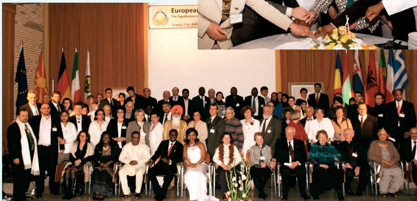
Participants of the European Leadership Conference and World Peace Blessing (January 21–24, 2010, in San Marino)