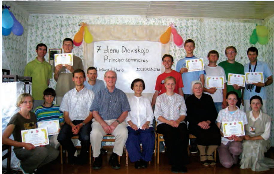
Participants and staff at the conclusion of a seven-day workshop in Vilnius, Lithuania