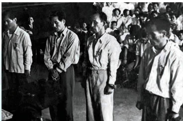
In court during their trial on July 29, 1955; despite the quality of the photo, Father is identified as the man at far right.

So, I told her, "I am not the kind of man who will just fade