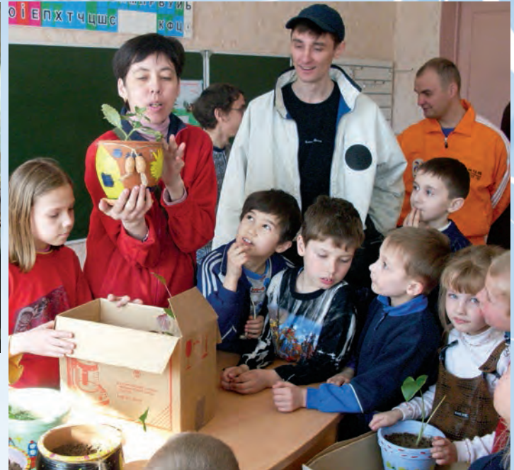
Blessed children prepare plants in pots they decorated themselves during a Divine Principle workshop. The plants are gifts for children in an orphanage.