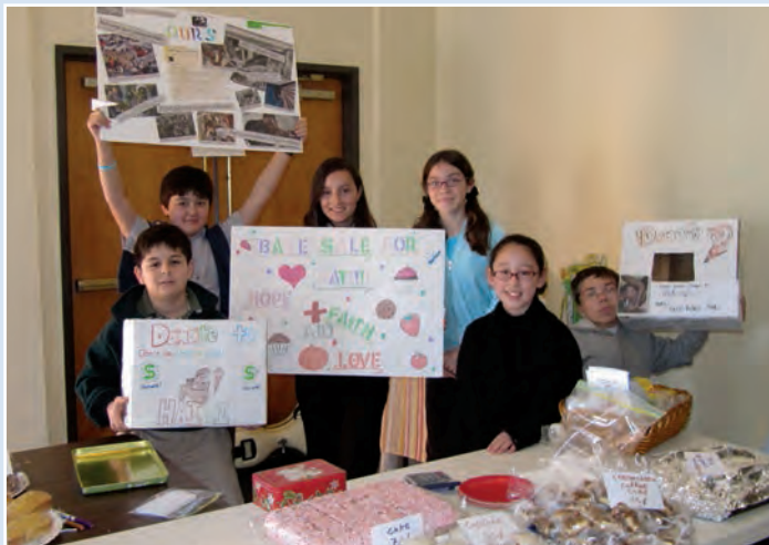
A January 24 bake sale initiated and run by blessed children in southern California raised $900 for our members in Haiti

We lost our church chapel, our home and the office we do our mission from. It will be difficult to restart, but we have hope. God knows everything; we are here to do a mission that is vital to keeping the nation of Haiti alive. TW