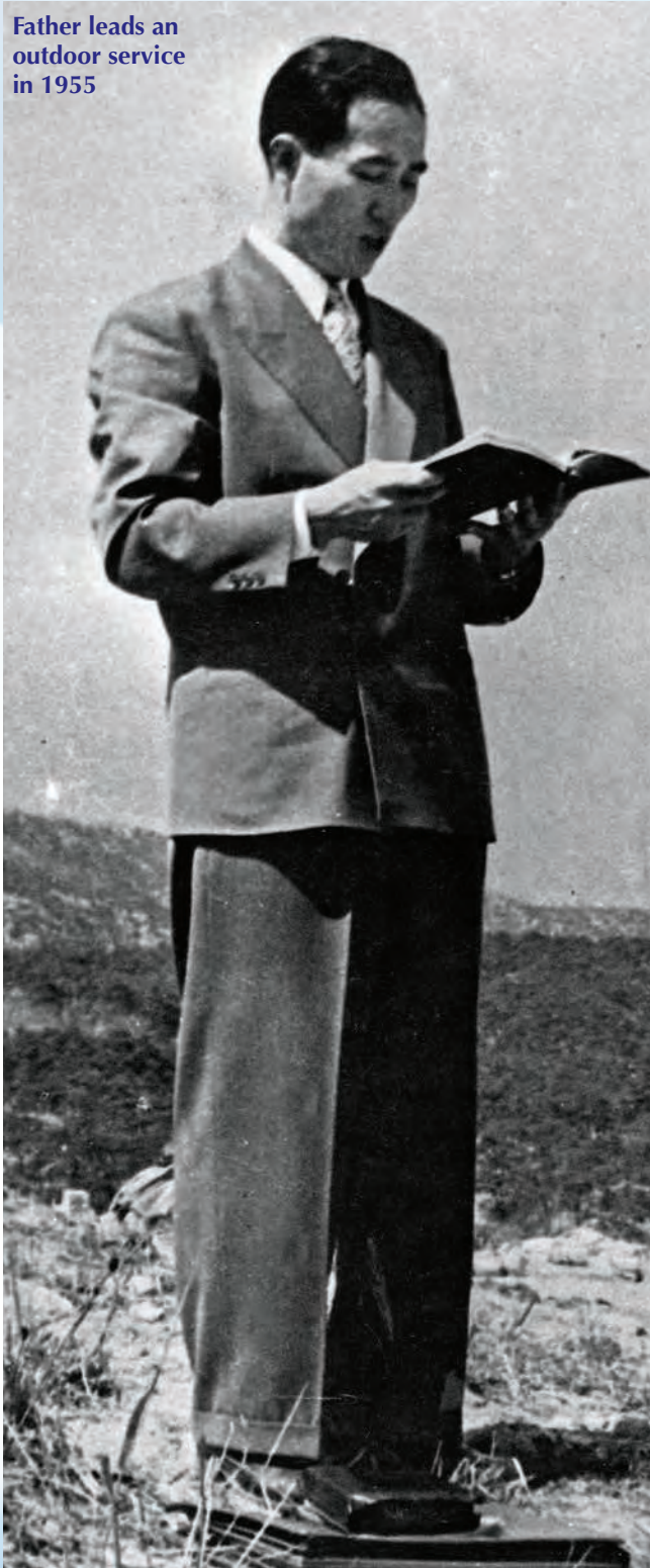
Father leads an outdoor service in 1955

In this installment, the twentieth to appear in Today's World, Father describes his incarceration in Seodaemun Prison in Seoul in 1955. Parts of the prison are still preserved as a museum that is open to the general public.