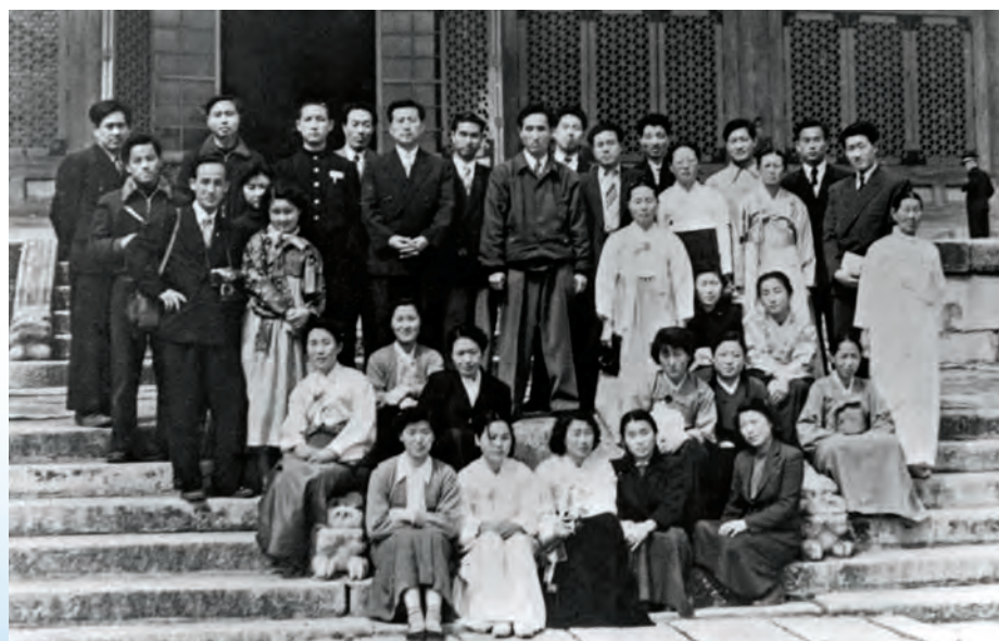
True Father with members at (the rebuilt) Chang Gyeong Palace on March 31, 1955

In serving and following God, I have never once thought about myself. I have always thought I should feel sympathy for Him. I felt like that even when I was dragged to the Seodaemun Police Station and found myself a prisoner behind bars. From the first step I took in following the path of the providence, I comforted God, saying "I am still alive, and for this