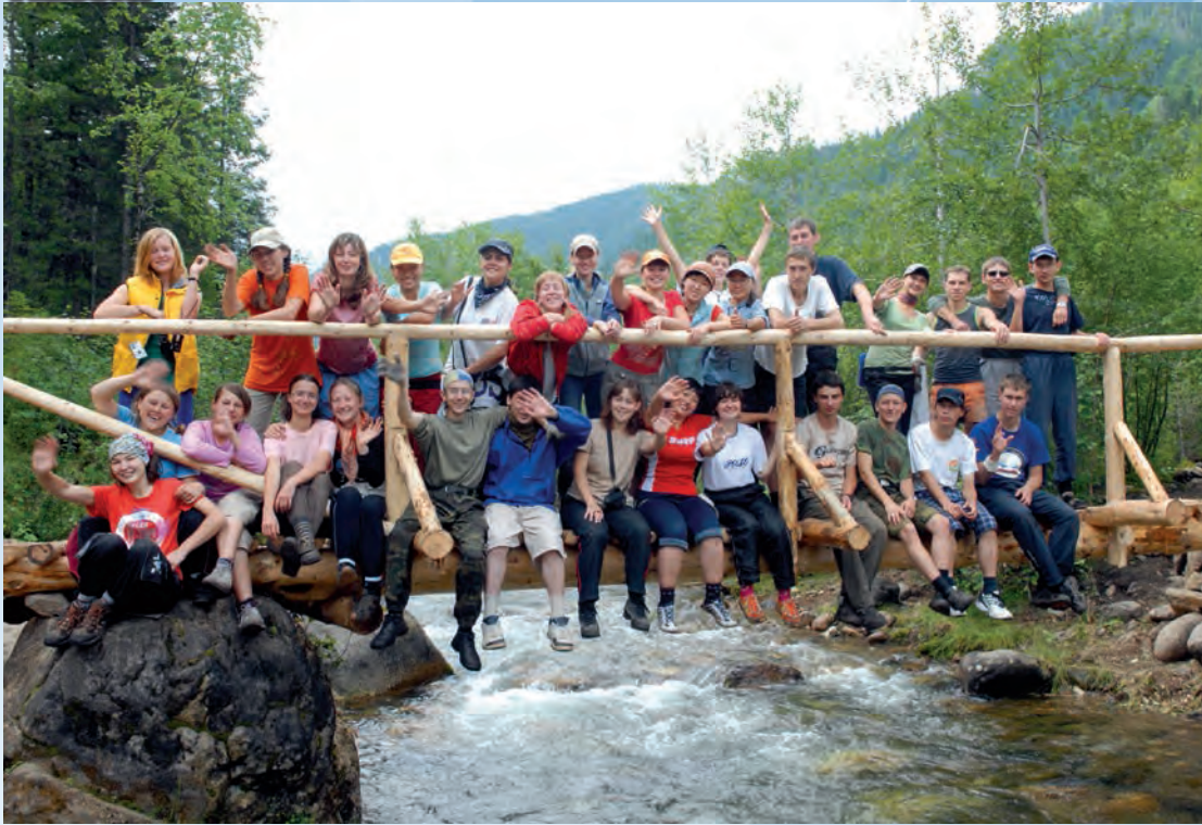
Participants in the 2009 Russian Unification Church summer educational program on the hiking bridge they built across the Slyudyanka River in the Lake Baikal region