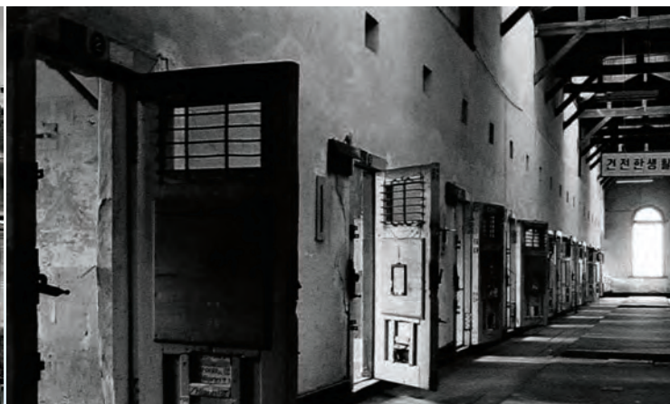
Built in 1908 by the Japanese in anticipation of an influx of prisoners once Korea was annexed in 1910, Seodaemun Prison held Father for three months in 1955. Left: The front entrance; Right: A cell block as it looks today.