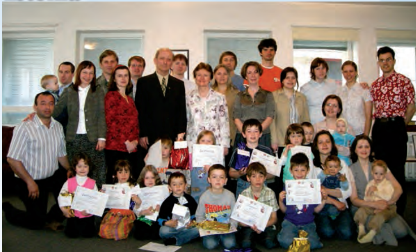
The first Baltic workshop for blessed children, in Tallinn