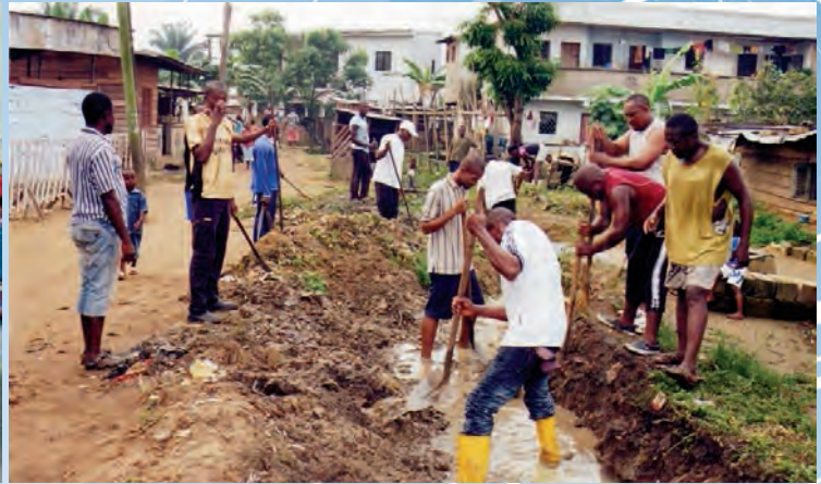
Left: Special workshop for the children of the Central Africa Region in Yaoundé, Cameroon, November 28, 2009 Right: Young members carrying out Service for Peace in Douala, Cameroon, November 23, 2009