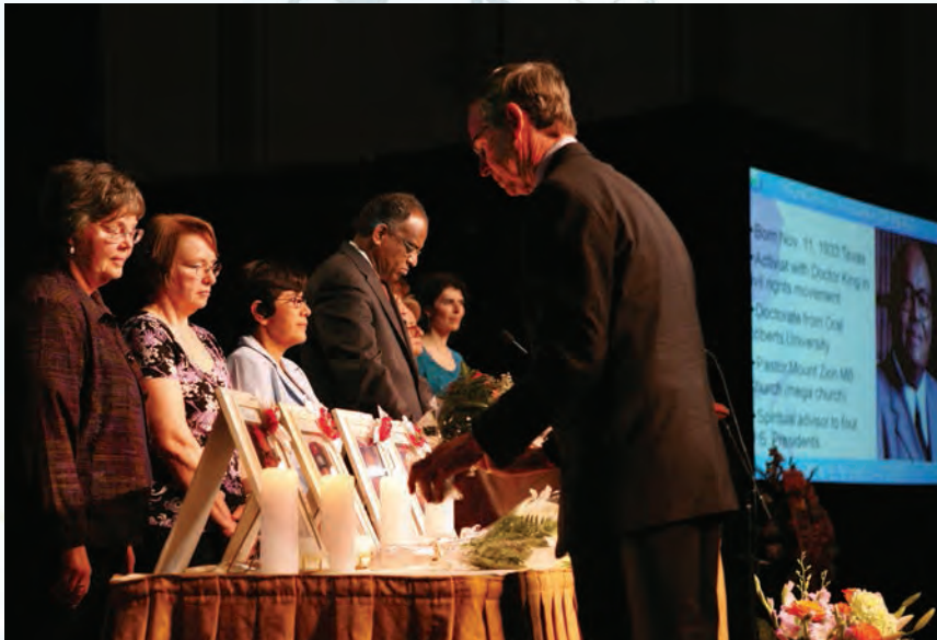
Placing flowers in front of the photos of those being honored, in Las Vegas