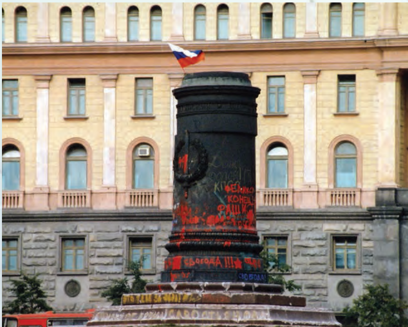
An Empty Pedestal: A statue of KGB founder Felix Dzerzhinsky was removed in the days when the USSR abandoned communism.

Another daily reality was what we called "food hunting." At that time the state-owned stores were almost bare, and it was often hard to find even the most basic foods. First, we had to search for places with something to sell. Then we had to stand in line in the hope that whatever was being sold would not run out by the time we got to the front of the line. With some items, like potatoes, we