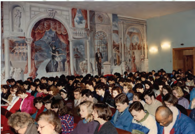
Participants at the winter 1992 workshop in Ukraine, on the Black Sea

There were moments when we were so frustrated with the difficulties, we felt like giving up. However, all we had to do to change our situation was to go to the airport and take the first plane out—our Soviet brothers and sisters did not have that option. Knowing that, and knowing the impossible path that Father had pioneered, we were determined to persevere and continue sharing our True Parents' love and truth with the Soviet people. Sometimes it was sad to see how a nation of such capable and intelligent people could be reduced to squabbling over life's daily needs. We knew that given the opportunity, these people would do great things for True Parents' providence.