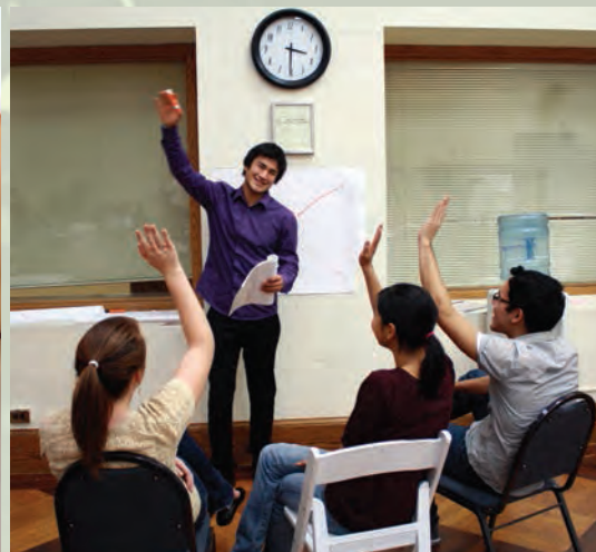
Lecture practice for young adults at the How to Teach Divine Principle workshop

for many years and who can help unravel it for them through dialogue and mentoring. It was such an exciting process.