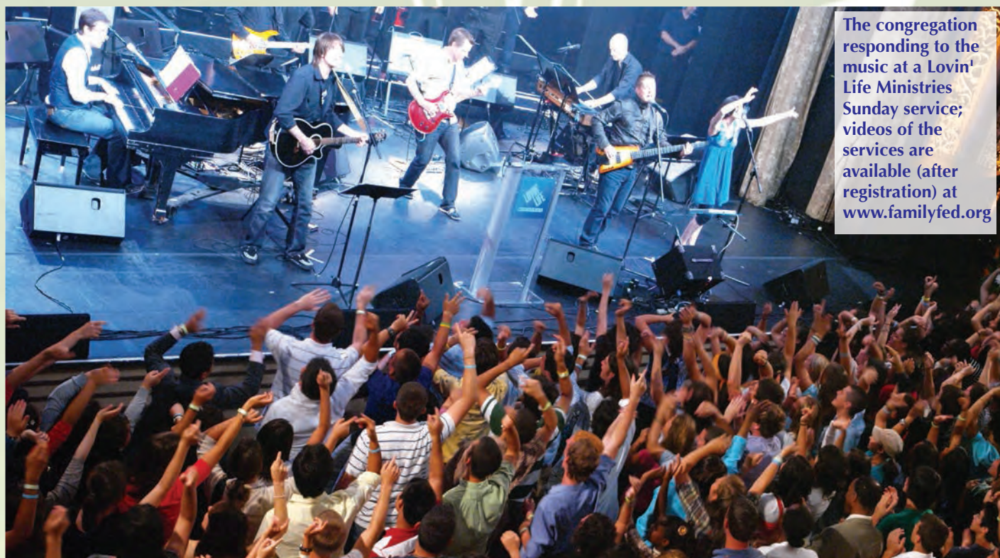
The congregation responding to the music at a Lovin' Life Ministries Sunday service; videos of the services are available (after registration) at www.familyfed.org