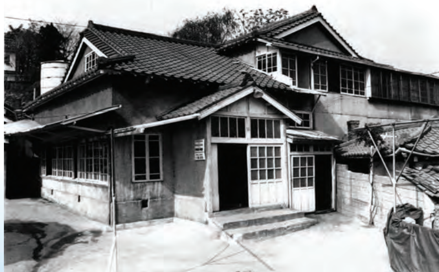
The former headquarters church in Cheongpa-dong as it looked in 1955

Anyone who knows the providence will find his way here, knowing it encompasses history. TW