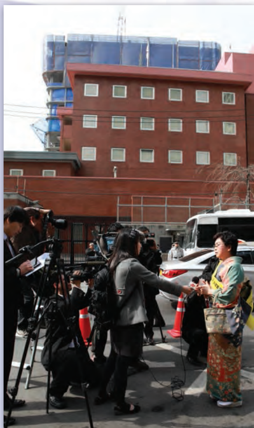
A television journalist interviews Mrs. Erikawa across from the Japanese Embassy

In the early afternoon of March 23, fifty Japanese women assembled on a side street in the Gwanghwamun District in Seoul. Across the road from where they stood was a stout five-storey brown building with only small square windows, of which every shade was drawn. In fact, the only sign of life associated with the building itself came from the Korean policemen who guarded its entrance. This was the Japanese Embassy in Korea, site of recent, sometimes violent protests by Korean citizens who had come to express publicly their seemingly inconsolable humiliation and rage triggered by a long-standing territorial dispute. 2010 marks a hundred years since Japan annexed Korea and sixty-five years since Korea's liberation. Nevertheless, as the expression goes, there remains a lot of bad blood between Koreans and Japanese.