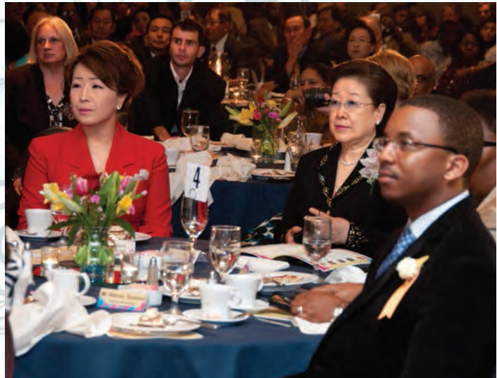
True Parents' table at the event in Arlington, Virginia