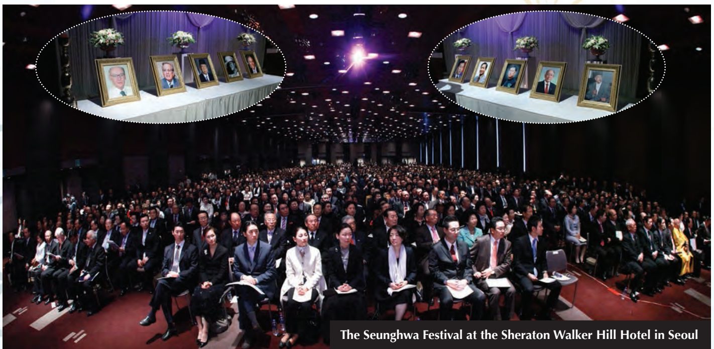
The Seunghwa Festival at the Sheraton Walker Hill Hotel in Seoul