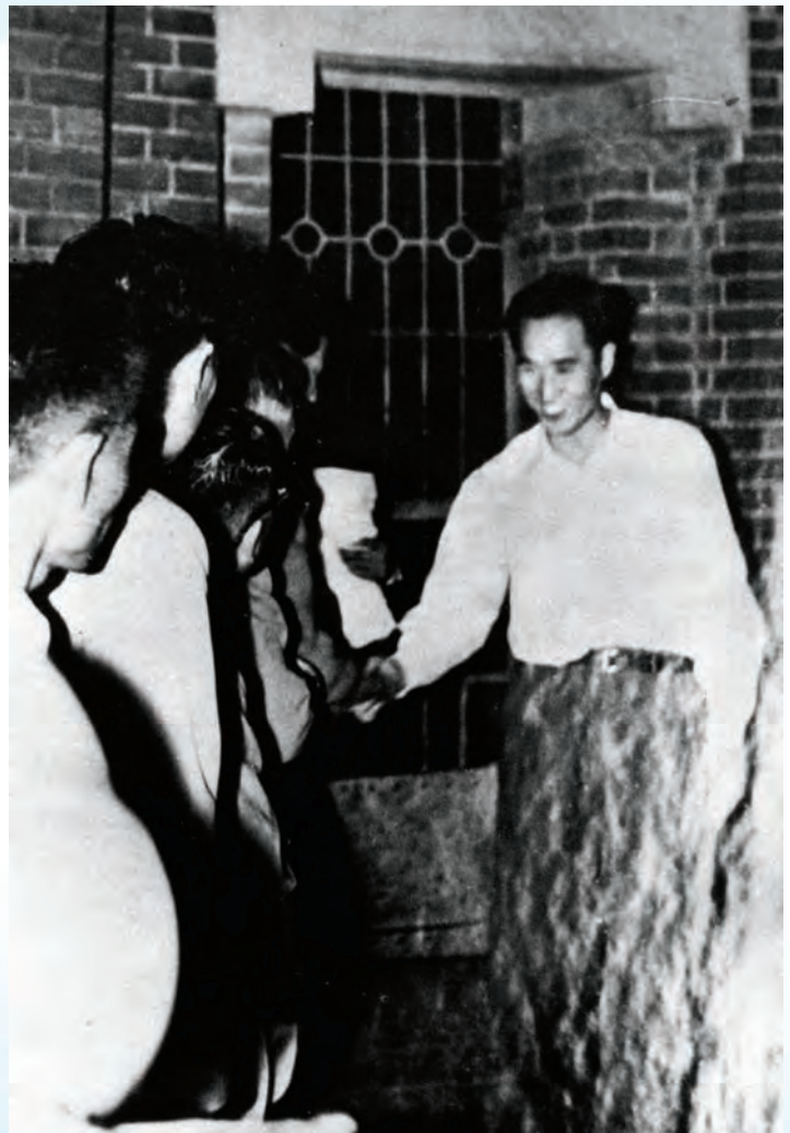
Father was acquitted and released from prison on October 4 1955. Here, members welcome him back to freedom.

Everyone, even higher-class people, such as professors and church leaders, took it to be the true that we had bought off the police. Pastors from various denominations spread bad rumors, even to my relatives and to every other person they met. No