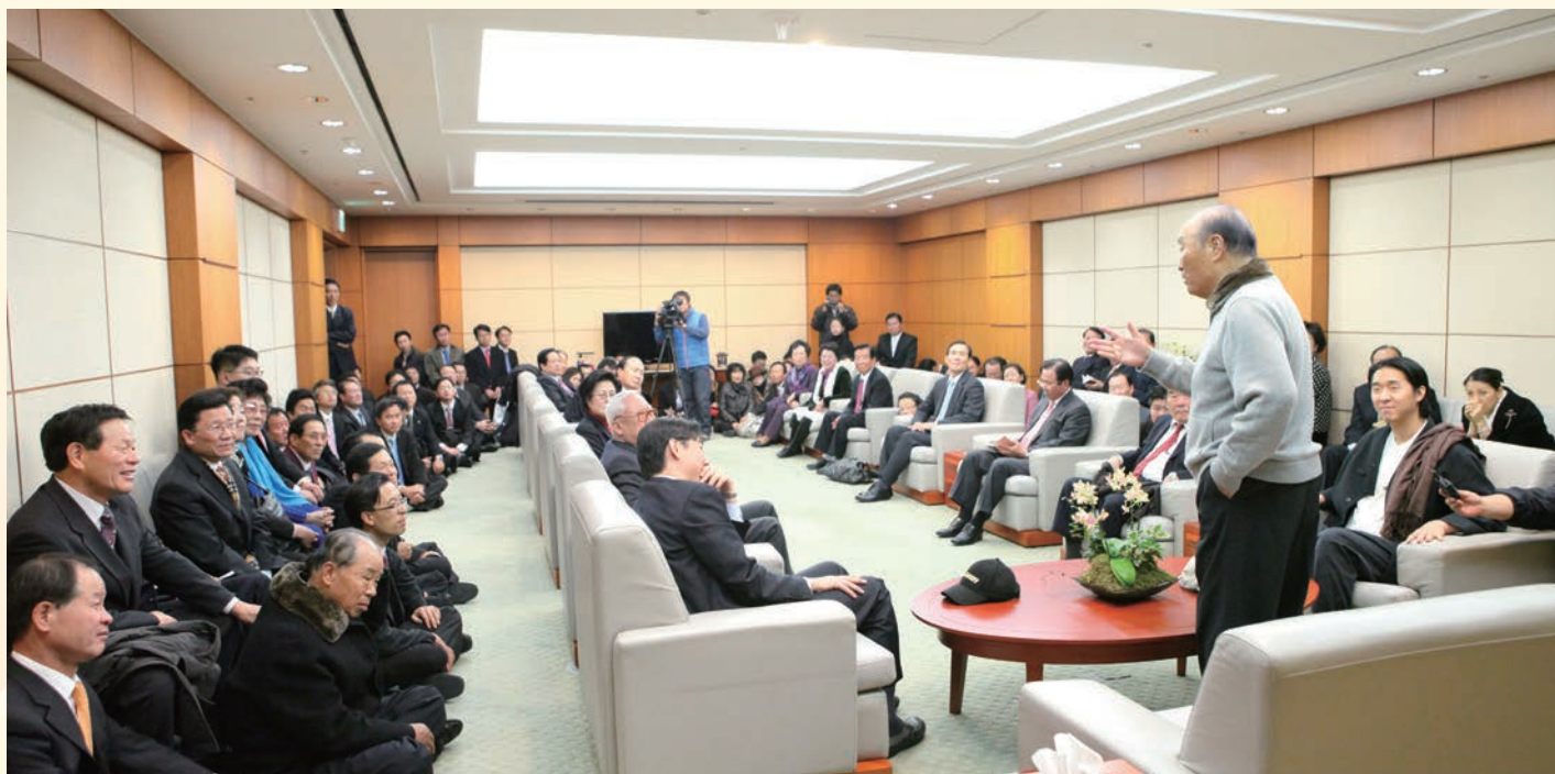
True Father speaks to members at Incheon International Airport on his arrival in Korea on November 17, from where he journeyed on to Yeosu to meet with the Ocean Leaders Workshop participants. Four days later, he left for America again.

ter over all problems on earth and in heaven. People who can't do that will fail. They will disappear.