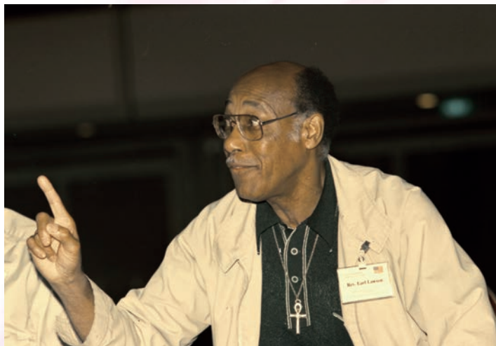
Ministers would challenge what they were hearing.