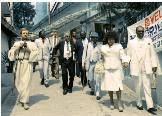
At the former headquarters church in Cheongpa-dong