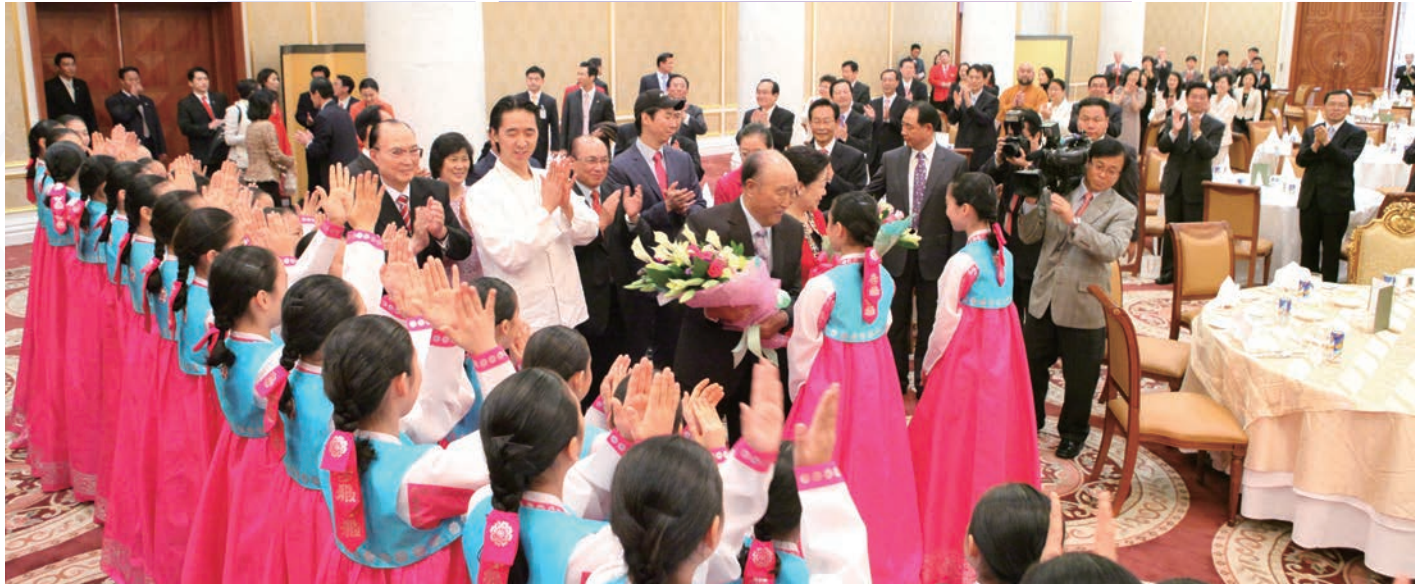
The Little Angels meet True Parents at the Peace Palace after completing the second leg of their sixteen-nation tour.

sentative veterans onstage, and the moving performance was brought to a close.