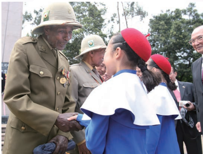
Ethiopian Korean War veterans are greeted by Little Angels at the Korean War memorial in Addis Ababa.

After everyone sang the Ethiopian national anthem, medals engraved with True Parents' names were presented to repre-