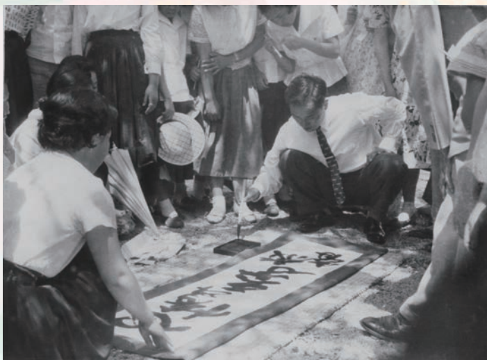
June 1960: Father writes a message, an early one in a long tradition of conveying key concepts through calligraphy.