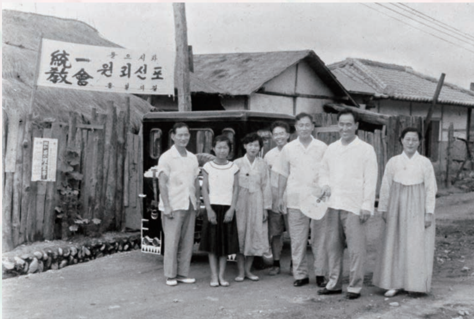
During his twenty-one-day tour coinciding with the 1960 summer witnessing campaign to proclaim the Divine Principle, Father visited the Gangneung Church on Korea's east coast. The banner reads [large letters] "Unification Church Declaration of the Principle." In small letters, above it reads "Please listen" and below "The way of unification." The poster on the fence is likely one of the 18,000 printed for the nationwide campaign.

During the next three years, the apostles on earth and the apostles in heaven need to combine their efforts to fulfill their responsibilities. In the past, good spirits wrought miracles only when all the right conditions were met, but that will not be the case from now on. During this time, all spirits need to be mobilized.