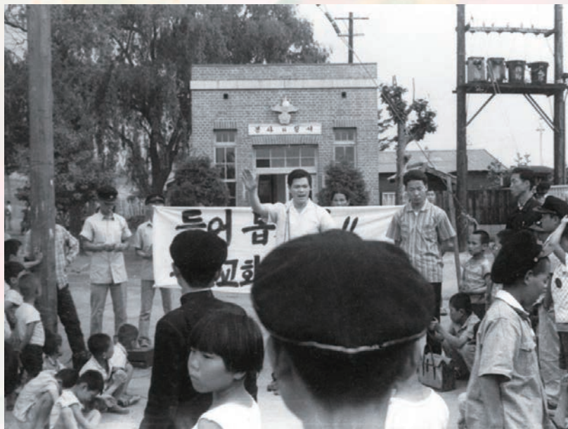
Street preaching during the 1960 summer witnessing campaign

The witnessing campaign was a two-sided educational program that brought together the enlightenment movement to awaken people’s intellectual wisdom, while the Divine Principle developed their internal wisdom.