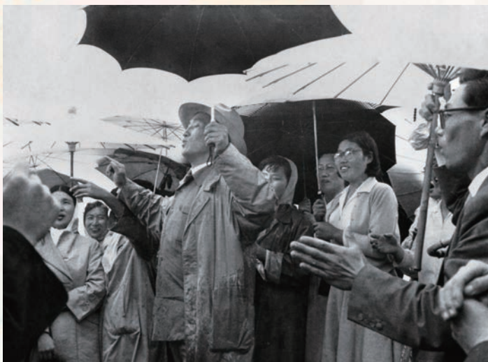
True Father holds an outdoor service with members in late June, 1960 (which in Korea is the rainy season).