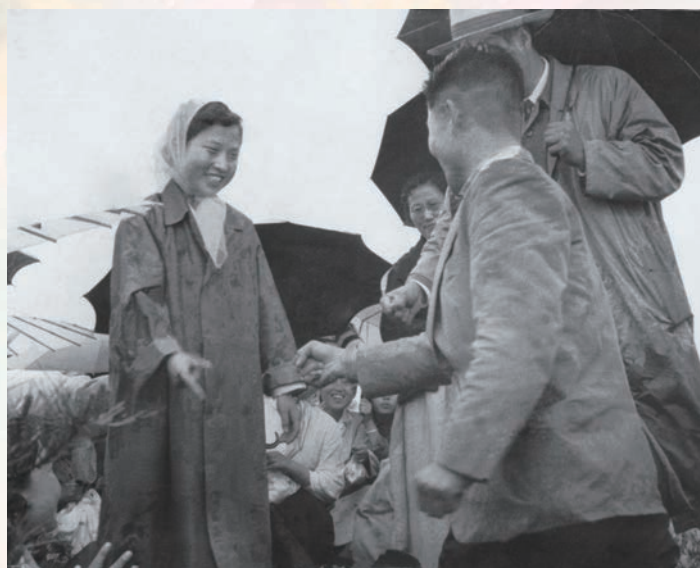
Rock, scissors, paper on a church outing in 1960; the third player, at back, is True Father

ruined; he asked her to take good care of the missionary.