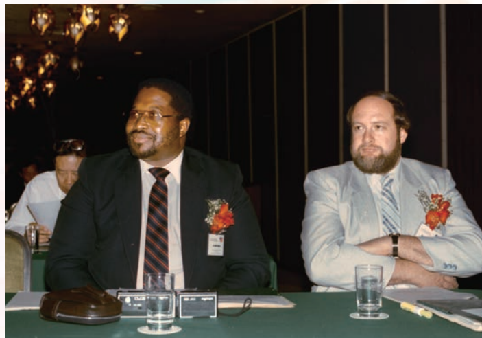
A broad spectrum of Christian leaders attended ICC in Korea.