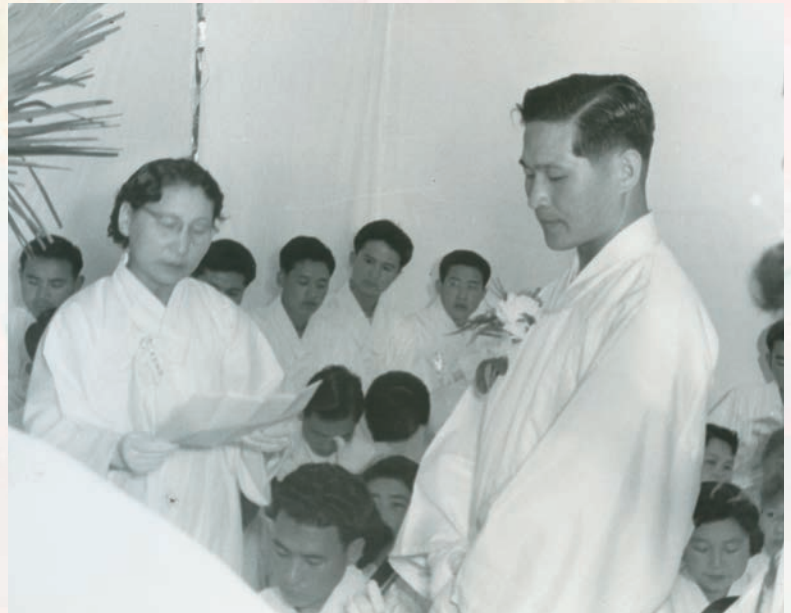
In speeches, songs and poetry, the significance of the Three-Couple Blessing Ceremony was hailed.