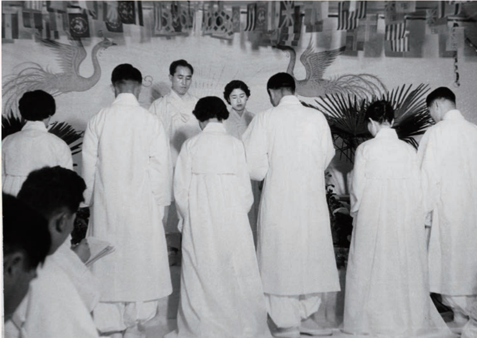
The blessing of the first three couples, on April 16, 1960, just five days after their own Holy Wedding, was the first that True Parents conducted for members.

In the evening, True Parents danced with the three couples, and dined at the same table with them.