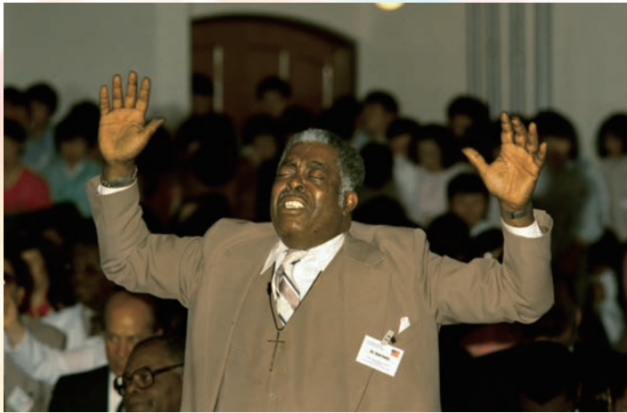
ICC conferences included time for religious observance.