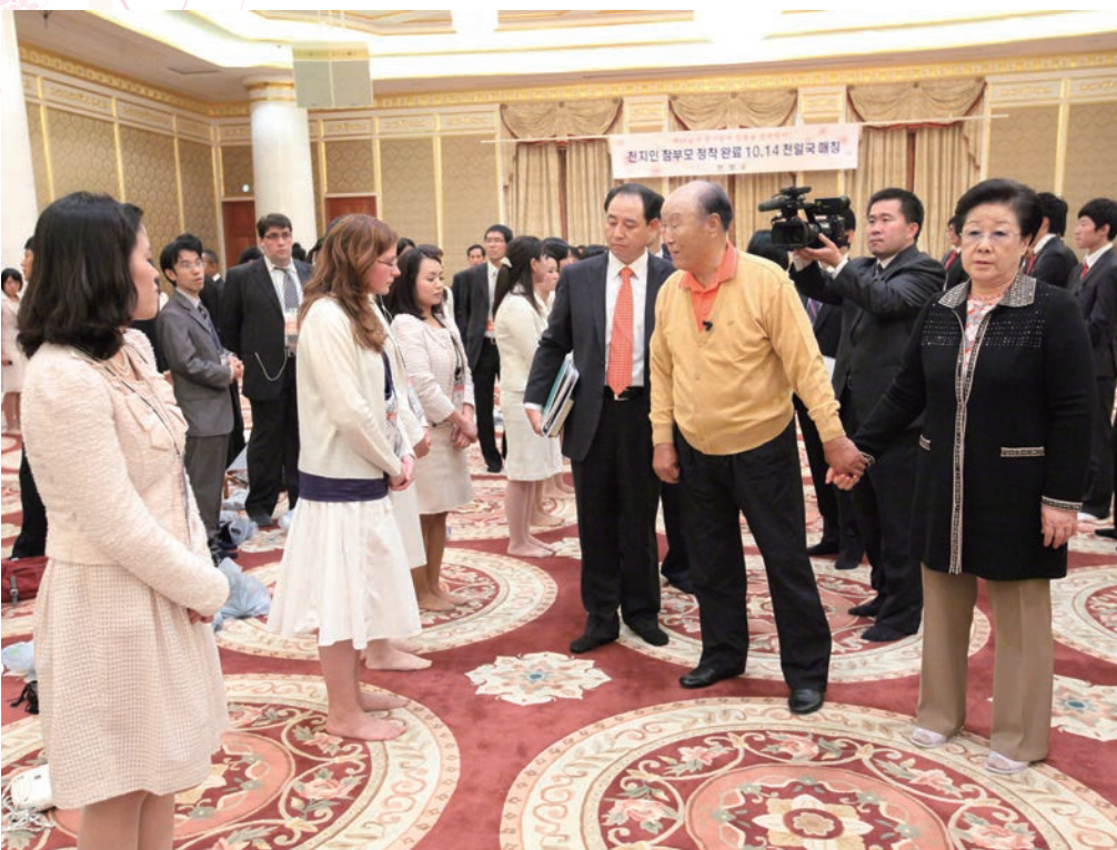
True Parents at the October 7 matching at Cheon Jeong Peace Palace, at which young second-generation members were asked to discover the spouse God had prepared for them

all the observers who were concerned about the candidates' heightened stress levels over how they could actually do what Father was asking them to do, she said, "Please Father, these young people came here because they trust you, and they really want you to match them."