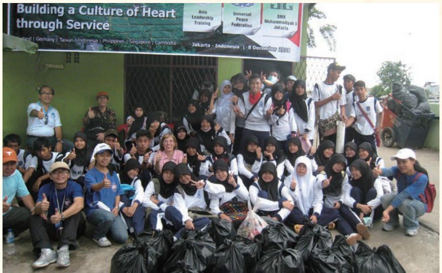
Left: The Asian Leadership Training team members going out to witness; Right: Young Indonesians relax after hours of cleaning