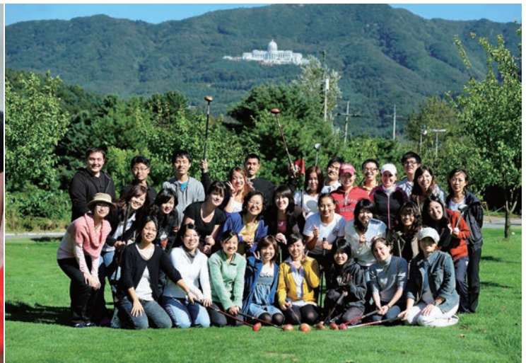
Left: Appreciating Korean culture is an intangible aspect of learning the language: a student learns Korean cooking; Right: That the institute is situated near the Cheon Jeong Peace Palace is one reason our church members are likely to be drawn there.

I wanted us, as students, to do something together in order to learn from each other, share about our lives and the experiences we have had with God and True Parents as first- and second-generation members. That is how Let's Inherit True Love (LITL) came into being. I began it as an after-class student activity to help create a true family atmosphere in our school. Through this program, we have shared stories of our lives of faith, decorated the student lounge, written a joint letter to Daemo nim, and gone mountain hiking, among other things. I strongly believe that True Parents' language and the culture of true love they are teaching are inseparable parts of building one family under God. LITL was aimed at overcoming the language barrier through doing something inspiring together.