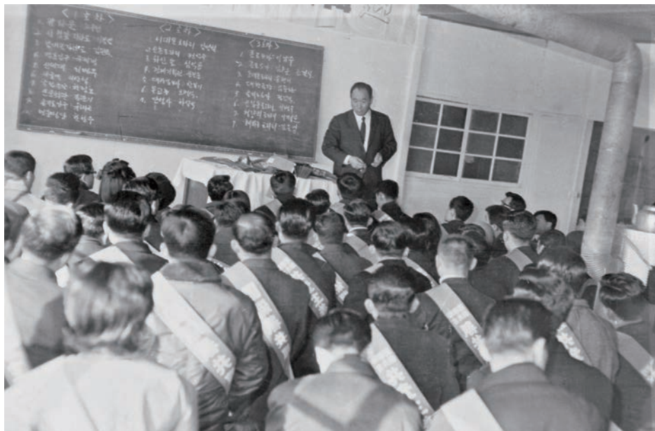
Father speaking at the fourth workshop for witnessing leaders; on the blackboard are three lists of members' names matched with locations, probably for witnessing.

In order to make you into ultimate victors, Heavenly Father is forging this path and giving you training over a period of three years. YW