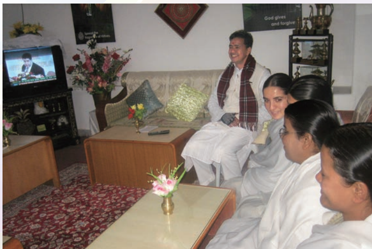
A locally organized viewing area for Nepalese citizens to experience the Original Divine Principle lectures, and Nepalese Unificationists in holy robes as their national leader presents True Parents' teachings to the nation