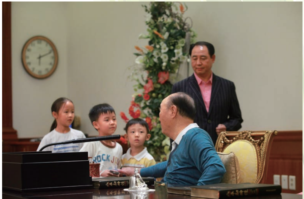
The champion of hoondokhae with his grandchildren; How many of us can say we did three hours of hoondokhae just a few days after being in a horrific helicopter crash?