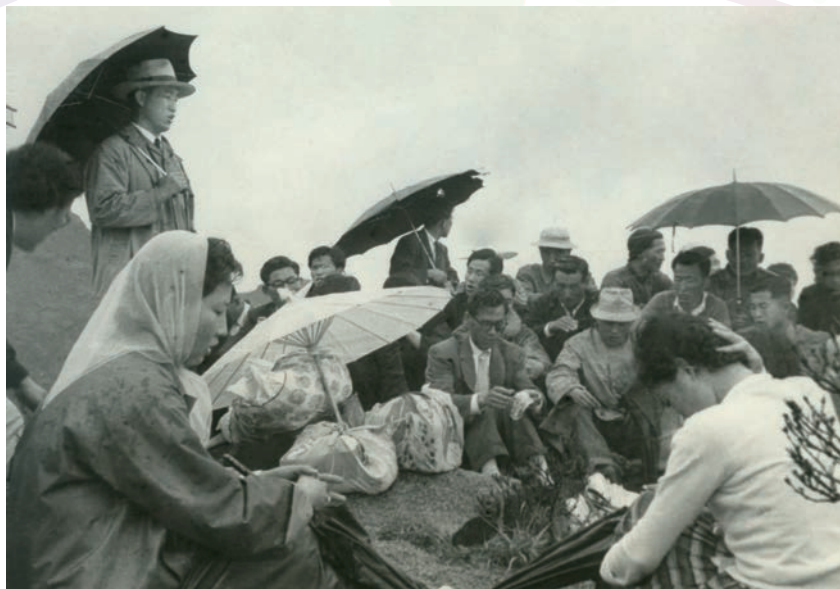
An outdoor service in the summer of 1960

He called the students one by one to his office and tried to persuade them, saying that the Unification Church was a heretical and perverse religion. When they didn't agree, they were suspended from school. A third of the students gave up the church, and the principal suspended the remaining students from school. Those who still persisted in going to the church were expelled. These young people chose this path with firm resolve because they would not betray the providence or abandon the honor of being a Seonghwa student member.