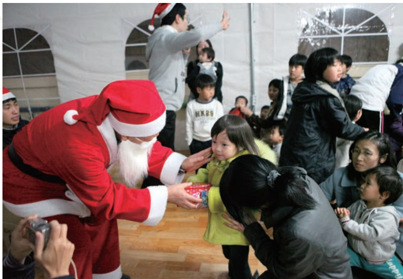
Families were urged to come to the workshop, which included Christmas Day. Fortunately, Blue Sea Garden was on Santa's itinerary.

Only when we are in tune with them can we move with