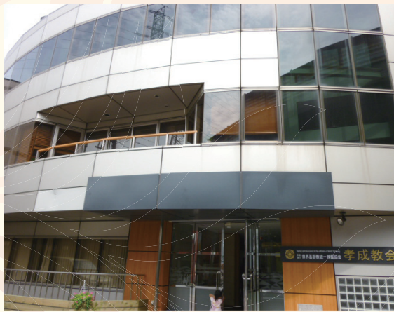
The Unification Church in Kousei is our most recently established church in Japan.