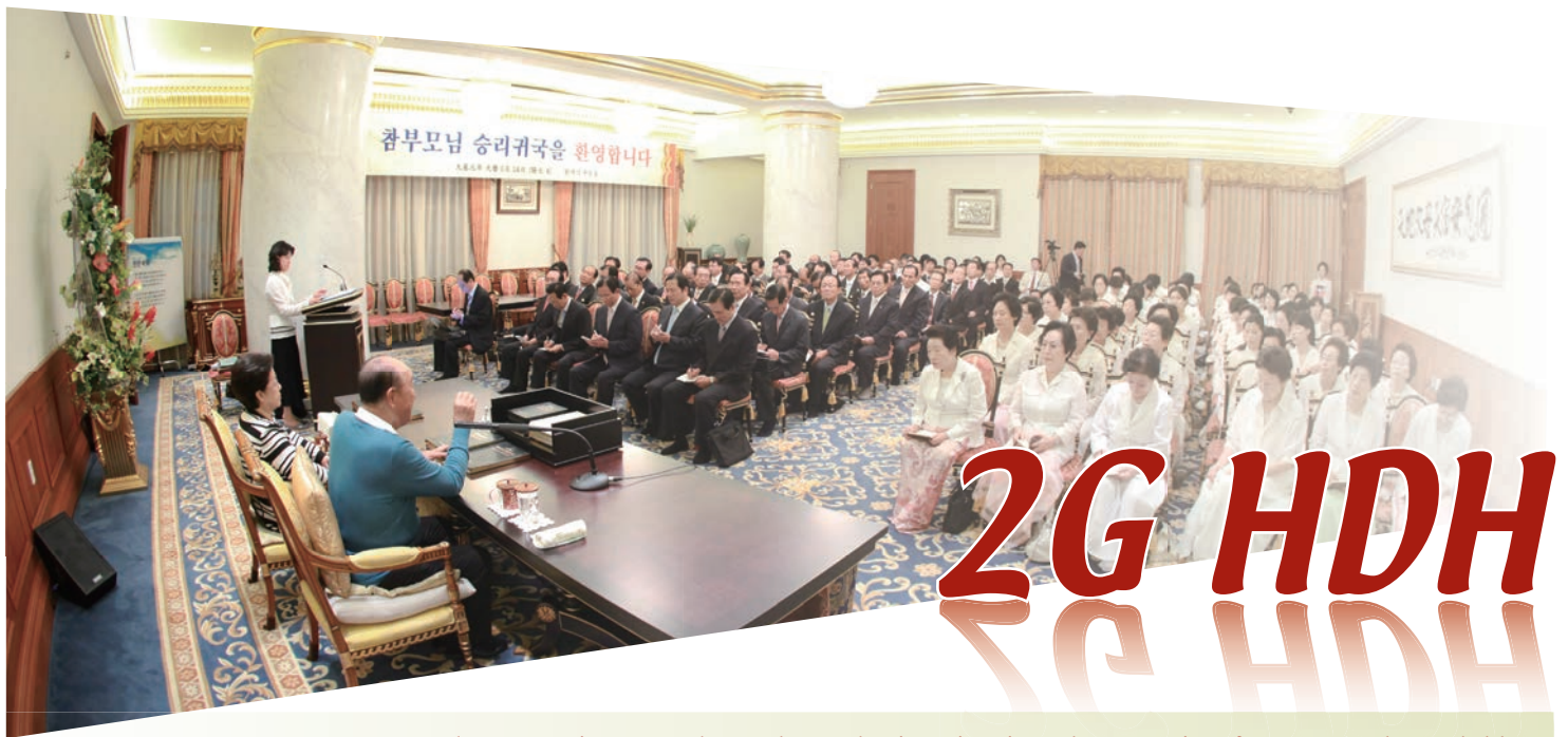
Second-generation members share the inspiration they receive from 5 AM hoondokhae.