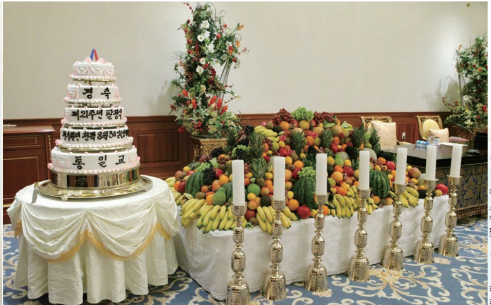
The Day of the Settlement of the Eight Stages was celebrated at hoondokhae on October 7, 2010, at the Cheon Jeong Peace Palace. The eight stages are those at which the Messiah had to succeed. They are the individual, family, tribe, people, nation, world, cosmos (spirit and physical worlds), and God. Hyung-jin nim is currently emphasizing the value of prayer covering all these levels. We are meant to inherit the victory that True Parents have won.