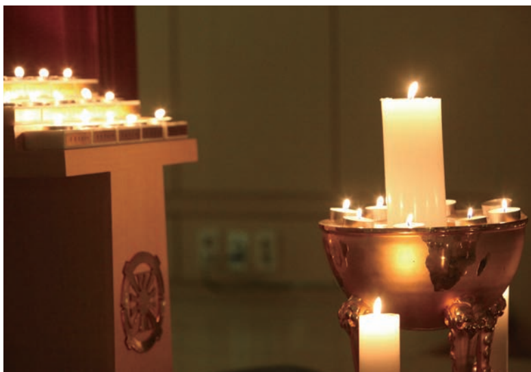
Candles lit to symbolize the inheritance of the true love of God during the morning Cheon Bok Shik [Heavenly Blessing Ceremony] in Yeosu