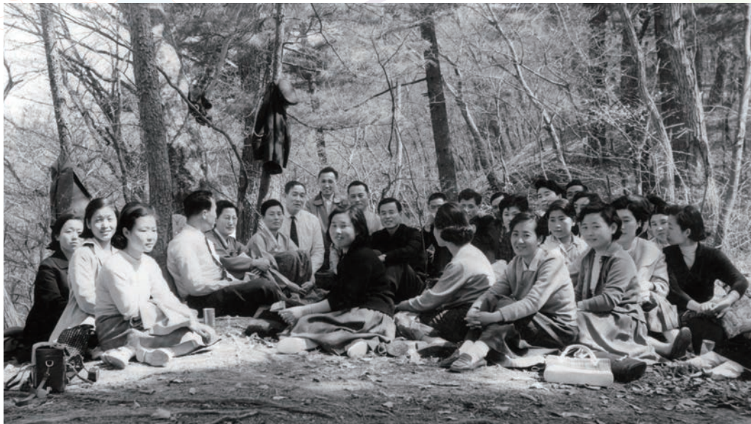
True Father, leaning against a tree, with members at an outdoor service in 1961. Occasional outdoor services are still a Korean church tradition.

You have heard of the Indemnity Stick Ceremony, haven't you? In the past married men and women betrayed one another and did many other bad things. Those mistakes must be corrected once and for all. Since the mistakes were made with that general area of the body, you have to be struck on