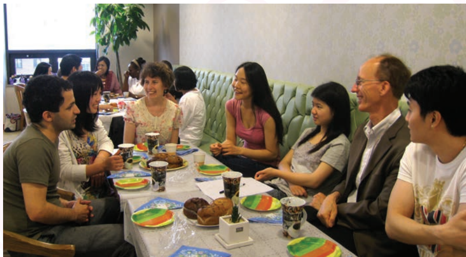
IWK integrated a Seminar on Principles of Love and Peace (to which men were also invited) into its Coffee Mornings.