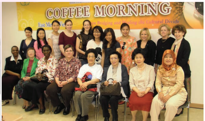
People from a wide spectrum of backgrounds are attracted to IWK events, where they meet our members in a low-pressure atmosphere.