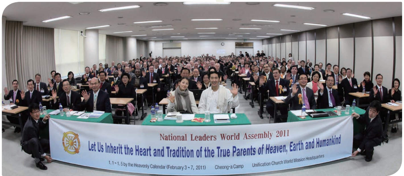
The National Leaders World Assembly 2011 was held in Korea following on from the True God's Day celebrations. Two hundred leaders from all nations convened to receive True Parents' guidance for the year, hear testimony and exchange ideas.