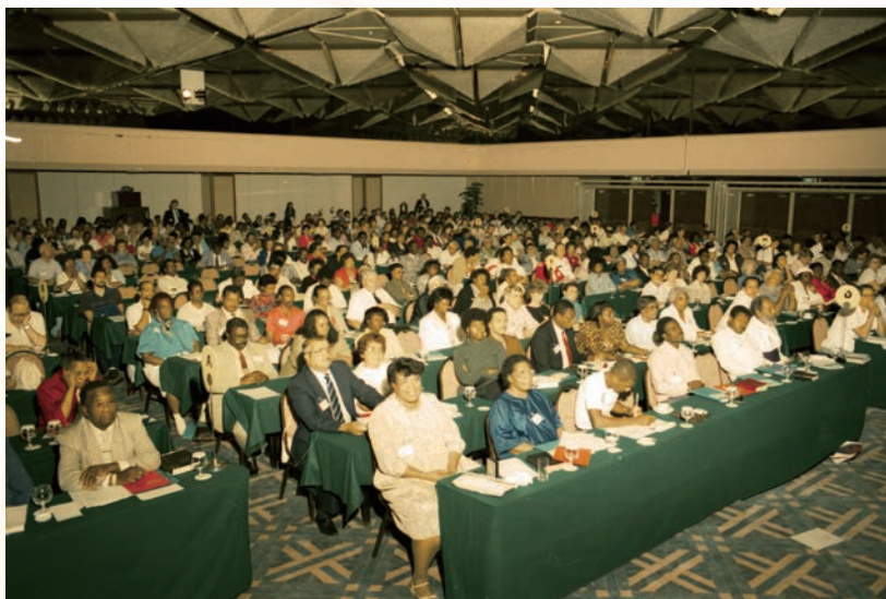
Some of the ICCs had hundreds of participants

Generally, throughout the conference proceedings, the warm embrace of God's most loving spirit was a visceral experience for all. It was undeniable that God was in our midst and was binding us together. It was a presence that pervaded all our activities, lectures, discussions, and tour excursions. There was an undeniable presence of the Holy Spirit permeating the atmosphere.