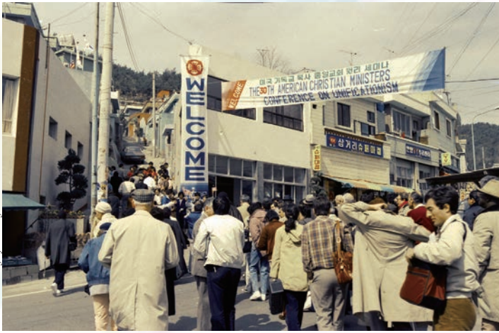
ICC participants visiting historic church sites in Busan