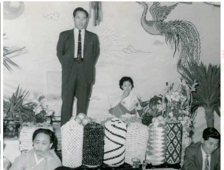
May 15, 1961: The banquet for the thirty-three couples, with True Parents, following the Blessing Ceremony