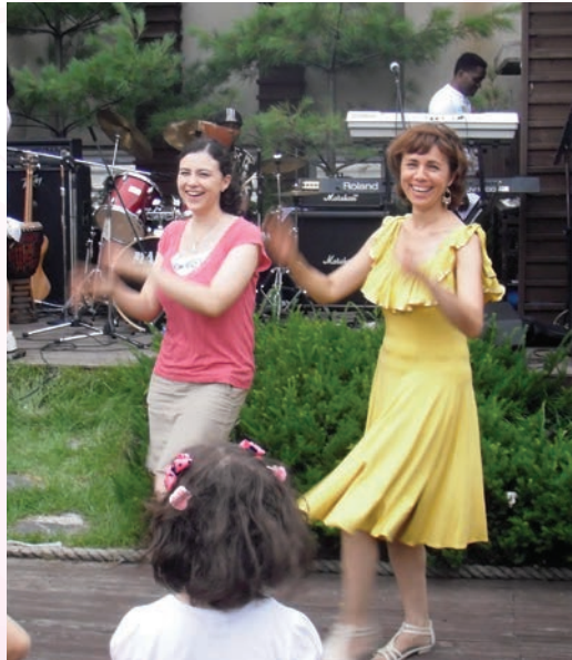
Like its Coffee Morning, other IWK activities—this cookout for example—include dancing.