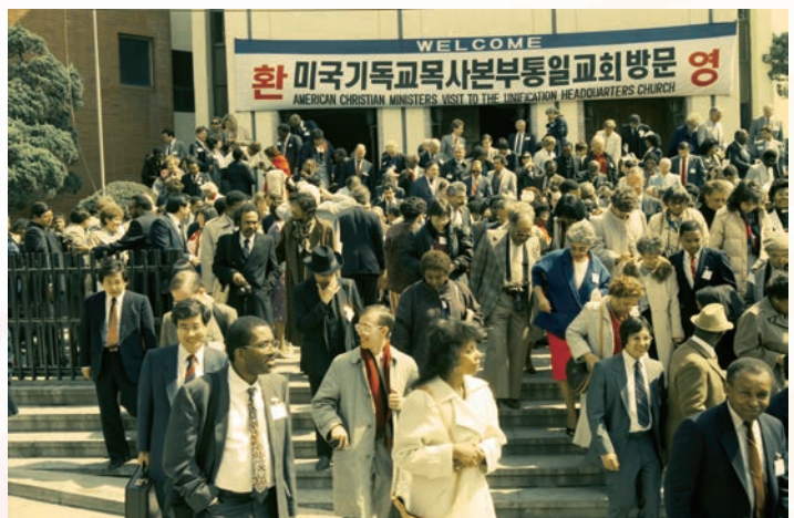
At the Headquarters Church in Seoul

Unfortunately, this constant, unwarranted fear of conversion took root in America. It even became vogue within our own movement to warn lecturers that if we taught the Principle too persuasively and passionately, we were guilty of encroaching into the danger zone of "trying to convert them." It was thought by some, whom I think overreacted, that I was too evangelistic with the ministers, too adamant about the truth of the Divine Principle. Many counseled that we should just present "our theology" for the ministers' consideration; a report so that they could be aware of what we believed. Many times I was asked to "tone it down," but each time I stood in front of the ministers, tasked with giving the truth of the Divine Principle, something came over me, compelling me. It