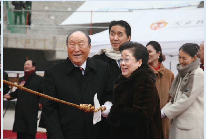
February 4: True Parents raise a plaque at the Peace World Center marking the near completion of this stadium at Cheongpyeong