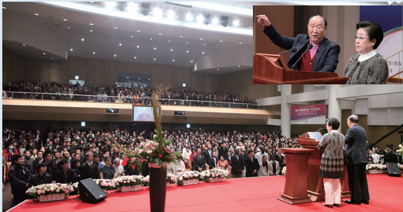
True Parents suddenly announced they would come to Sunday service at Cheon Bok Gung on February 6

I will never abandon you; I will take responsibility for you and protect you, so let's achieve the liberation and freedom of the kingdom of heaven on earth together. Let's be thankful for