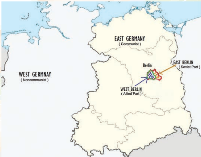
Left: A famous enclave, post-World War II West Berlin, was occupied by non-communist nations deep within communist East Germany. Right: Similarly, first generation members are like a godly enclave in satanic territory; whereas, blessed children were born into God's lineage, as were Adam and Eve; if blessed children fall, their circumstance is similar to fallen Adam and Eve's.

The first generation members joined the church after having felt limitations in life and as a result of pondering and exploring many points. Blessed children are born into the church; in their adolescence when they begin to explore life, it is natural for them to have questions about the church, or to wish to see other worlds. The process of doubt and conversion in faith during adolescence has been one of the oldest research topics in religious psychology, and it is a universal phenomena seen among many religions. That is why it is very natural for blessed children, who have grown up in the church, to harbor doubt about the Unification Church in their adolescence. It is thought that going through a process of doubt and conversion