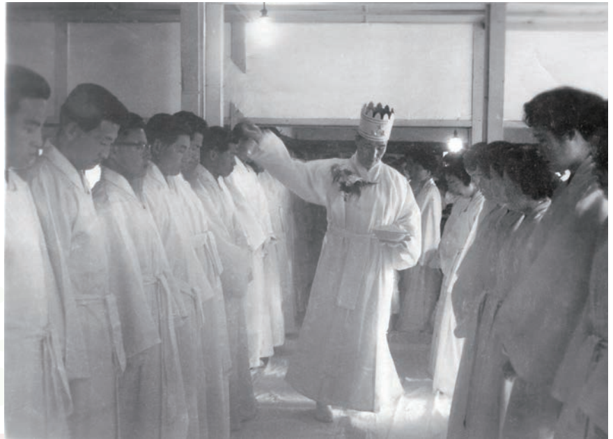
True Father sprinkling holy water on the thirty-three couples; the thirty-six couples comprised three groups: virgins, those who had experienced unfulfilled love, and married couples.