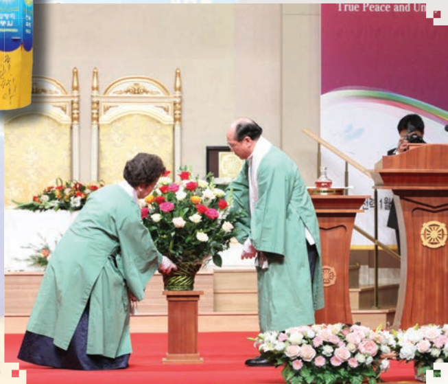
Facing page: True Parents arrive at Cheon Bok Gung for the Cheon Bok Ceremony that launched the Cheon Bok Festival.