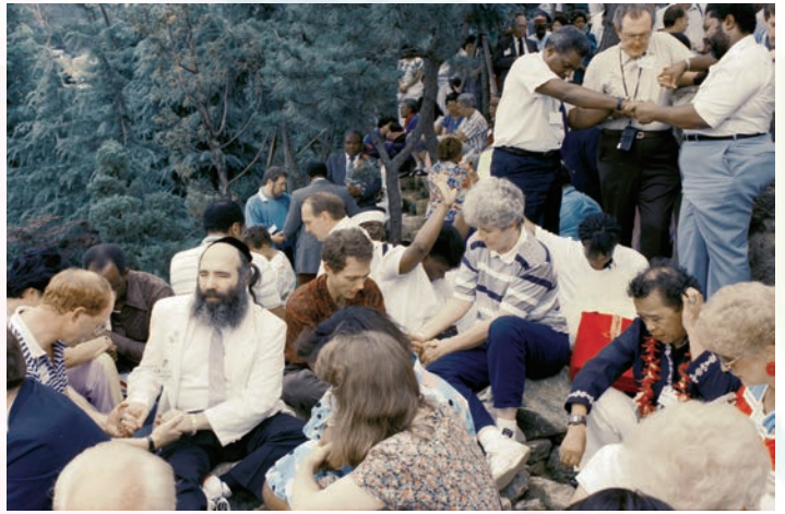
Prayer at the Rock of Tears, where Father prayed in the 1950s

Thus, fasting, cold showers, or all night prayers in the high hills around the Sheraton Walker Hill Hotel made up my constant, daily practice for almost three years. There were times when I would pray for hours on the mountainside next to the hotel and only finish ten minutes before I was to begin my lecture. I would sit on a rock and look down the mountainside into the parking lot of the Sheraton. I could see the conference