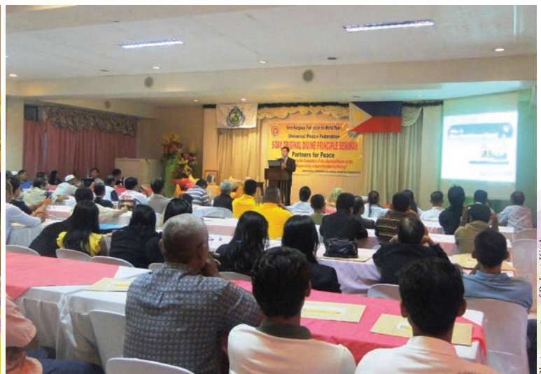
Left: 90 percent of the participants were Christian, 7 percent Islamic and 3 percent from indigenous religions; Right: The regional president speaks to the participants at the Original Divine Principle workshop in the Philippines.