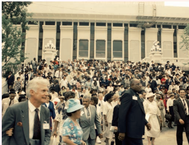
Visiting the Little Angels Performing Arts Center (now the Universal Arts Center) to see the Little Angels perform

It was another one of those moments that I was mentioning before. The spirit of God appeared in our midst and it was one more reminder for each minister that these manifestations, if they were to be understood, would require something more than what their doctrines could reveal. They could not avoid the thought that if Rev. Moon was not of God, how could it be that Rev. Moon brings us so many spirit-filled encounters such as these? Each and every experience made teaching the Divine Principle that much more powerful and undeniable. TW