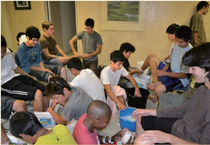
Washing each other's feet to experience the value of serving

didn't help that my parents were Japanese and I was growing up in America, a culture which was foreign to them.