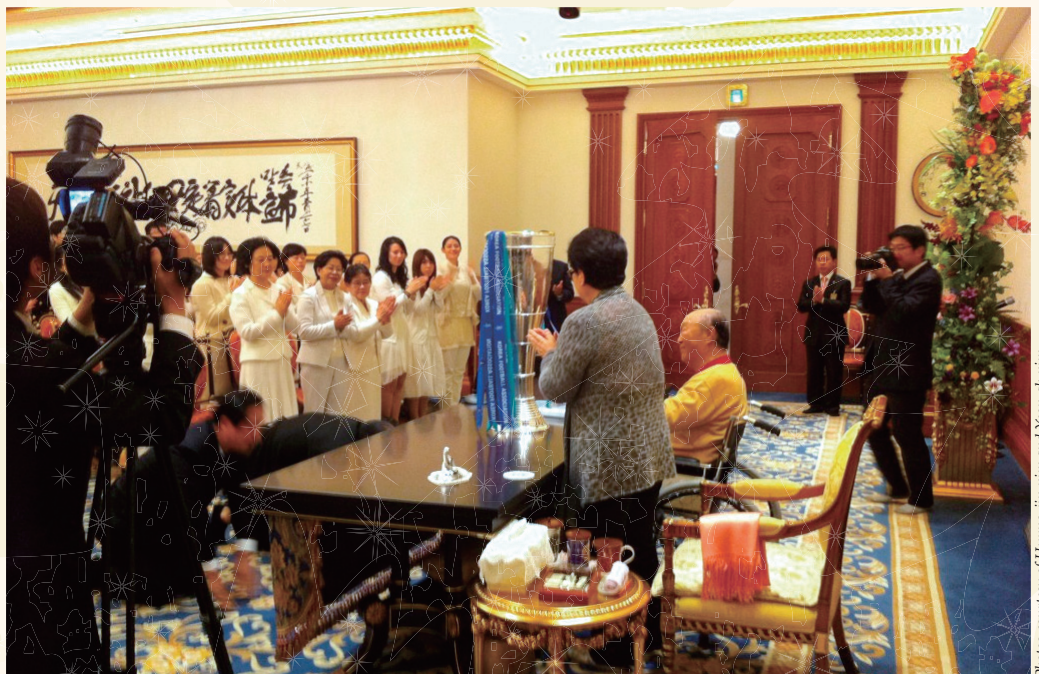
Seongnam Ilhwa's 2011 Football Association (FA) Cup champions' trophy is presented to True Parents during hoondokhae on October 16.

The Chinese character hwa (化) [to become] which incorporates the character in (人) mean-