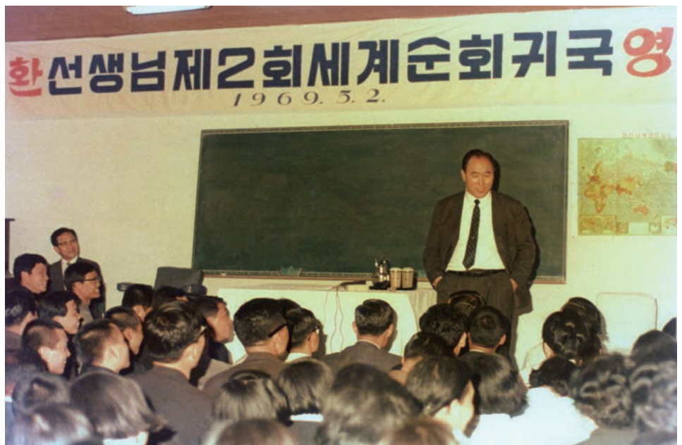
Welcoming Father back to Korea from the second world tour, May 2, 1969

The United States cannot even think about retreating in the fight against communism. I have emphasized the need to work in every way possible to defend the battle line in America. It is up to CARP and the Federation for Victory over Communism to carry out this work.