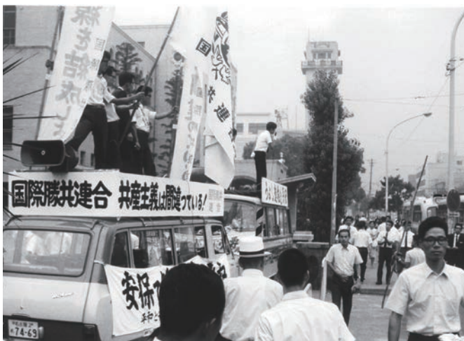
Victory Over Communism activities in Shizuoka, Japan in August 1969