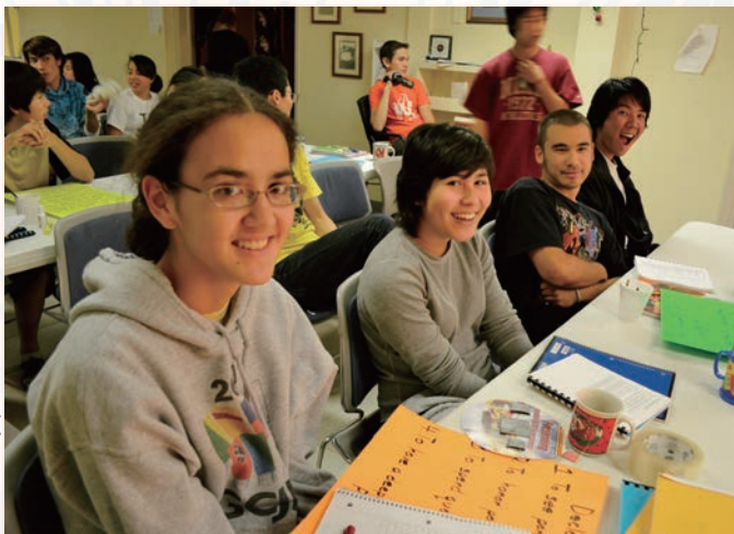
Big smiles at a Blessed Teens Academy internal workshop

At first I was still very, very lazy and it was not easy... you know, very basic things like serving others, respecting my elders, loving my teachers, etc. I started with simple things, getting a glass of water or a plate of dinner for others, visiting them and