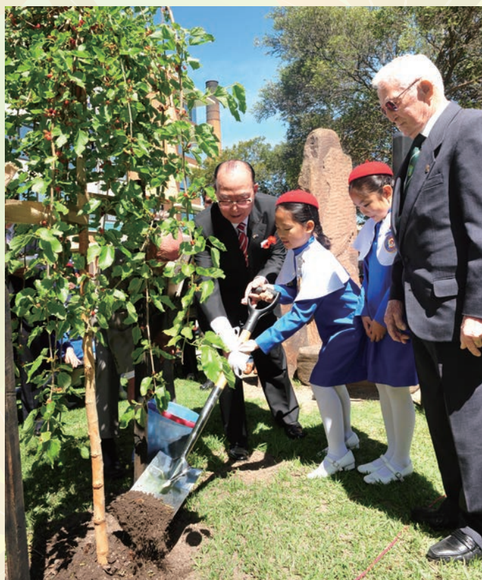
Inscription: This tree was planted by the Little Angels Korean Folk Ballet during their Australian tour to honor the sacrifice and bravery of the Australian forces who fought to defend a people they never met and a nation they never knew.

What is more, the Unification Church members gained a deeper understanding of True Parents' deep conviction and love for humankind. Our members were uplifted, delighted, and re-charged with a burning desire to share their faith again, to witness to True Parents' unending commitment to world peace, and to save every single person on earth. TW