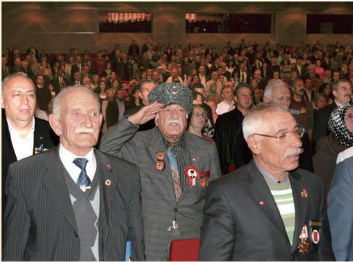
Turkish Korean War veterans at the performance in Istanbul