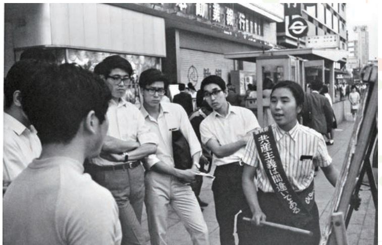
A Japanese university student giving a VOC lecture in 1969