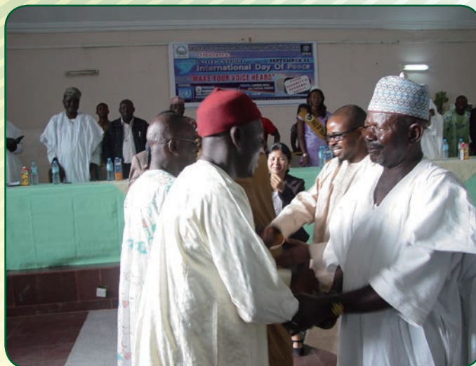
Christian and Muslim leaders exchanging contact information and making friends