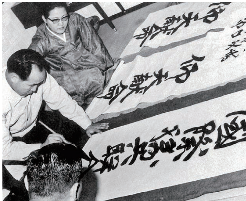
Left: True Father with church officials at a factory operated by our church members, January 11, 1969; Right: Father writes in calligraphy to mark the founding of International Federation for Victory Over Communism in January 1968.