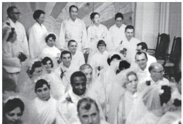
The thirteen couples blessed on February 28, 1969, in Washington DC in the 3-stage, 43-Couple Blessing Ceremony—which included 22 couples blessed in Japan and 8 in Germany.