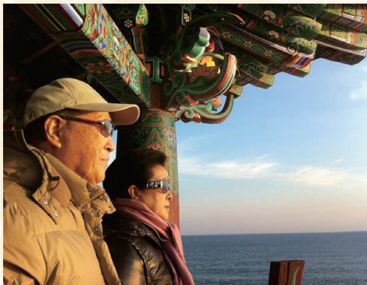
On November 15, True Parents visited Naksansa, a Buddhist temple overlooking the sea on the east coast of Korea.

I sacrificed my children for the sake of the world. I probably have the record of having sent the most children to the spirit world during my lifetime. What, then, becomes of the Republic of Korea and the world? Who would want such a parent? The satanic world would not want such a parent. The heavenly world desires such a person. That world will not disappear. It is eternal. You go to that world because it is eternal. JW