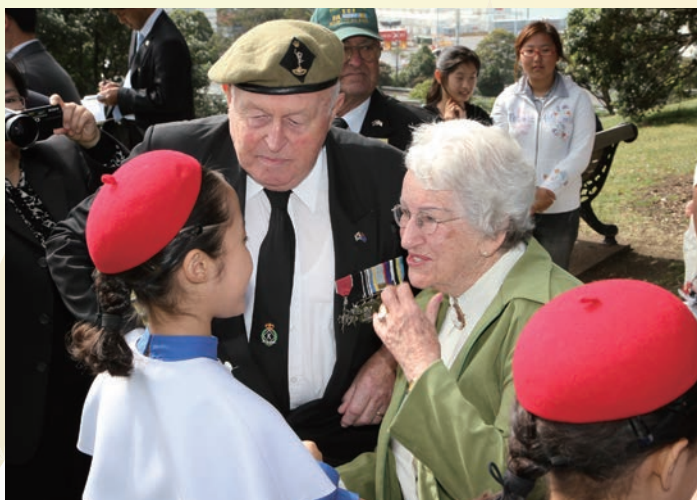
Veterans and their families attended the wreath-laying ceremony at the Korean War Memorial at the Parnell Rose Gardens in Auckland, New Zealand.

Initially, the Korean government was not supportive of the idea that Rev. Moon's group, the Little Angels, was going around the world, dancing and singing for the Korean War veterans. But what happened? After the first leg of the tour, the governments