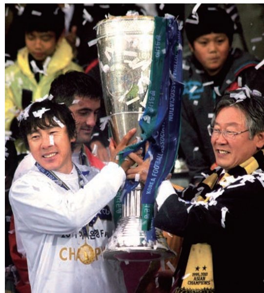
The Ilhwa Cheonma Football Club won the Korean Football Association (FA) Cup on October 15 with a 1–0 win over Suwon Samsung. The FA Cup is a knock-out competition.