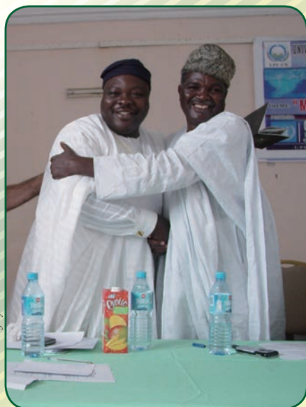
A Muslim and a Christian embrace in forgiveness, in Jos, the frequent scene of interreligious violence.