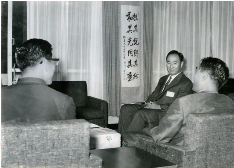
True Father attended a conference, Research Meeting on New Religions, at Academy House in Seoul in September 1968, at which he spoke and spent time with other religious leaders.

wrestling, victory or defeat is decided only after the match is actually held, isn't it? Retreating without even having a match is a defeat. You are making this proposal because you are not strong enough." In that way, I suppressed all his pessimistic feelings. He seemed very weighed down, perhaps because there were many problems. He must have been very worried.