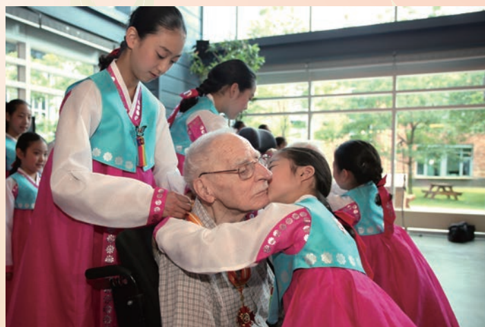
The Little Angels visit a veterans home in Canada

To each performance we invited the Korean War veterans and their families, and also prominent members of society.