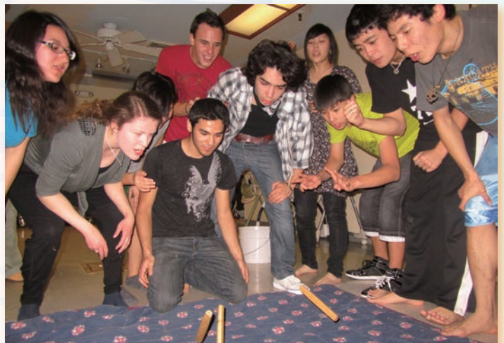
An intense game of yute on God's Day

That's what we at BTA are here for, the staff and teachers and the students that end up staying longer. Their purpose is to stay and pass on to others what they have learned. Everything is oriented in that direction. We have kind of a "village" concept. We have two grandmothers living in the house; we have parental figures. We have both first- and second-generation members. My wife and I (from the second generation) are