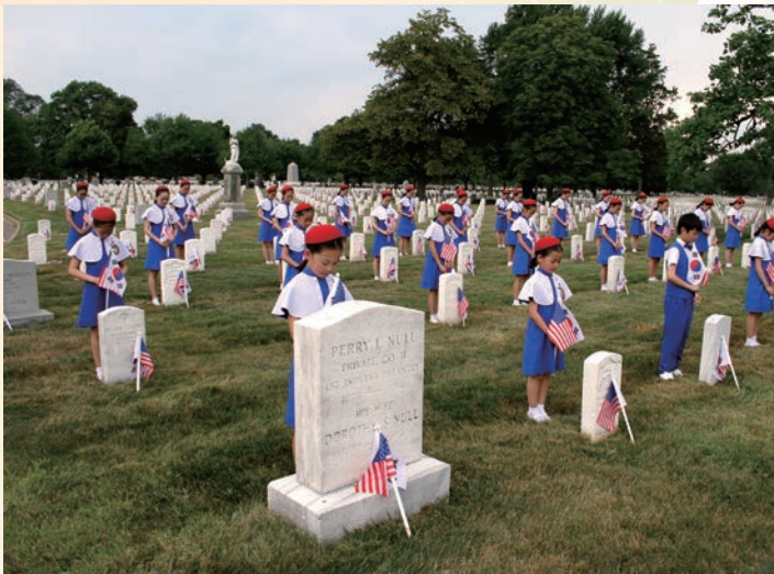
The Little Angels tend war graves at Arlington National Cemetery, the United States, on June 24, 2010.