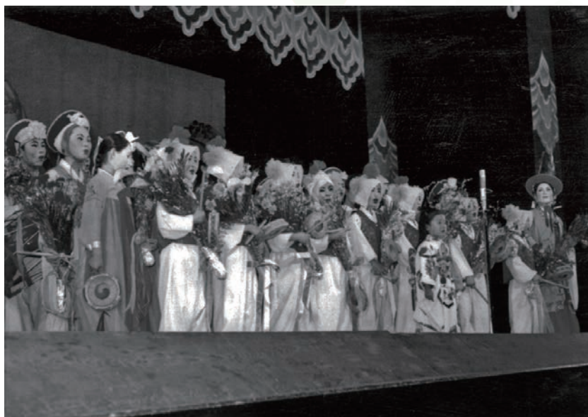
The Sunhwa Children's Dance Troupe (later known as the Little Angels) during their tour of Japan in 1969

To them, I might have looked insignificant, as if a whiff of wind could blow me away, but as the times change they come to realize that I am not who they thought I was. Now, in fact, I was in a position where I could feel sympathy for them. The fact that they received me and are now even recommending the truth of the Unification Church to others shows that they have as good as bowed their heads before us.