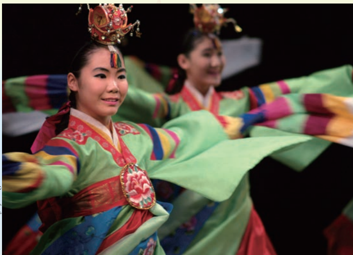
Performances included Korean traditional dance and touching renditions of native songs of each country visited.

nals because they had fought against communists. Some committed suicide, some hid in the mountains, and others changed their names. To survive, these Ethiopian soldiers had to sell their medals. Do you know how much they could get for one medal? A dollar. That was the miserable situation they faced. We hadn't known about this. I wept together with them.