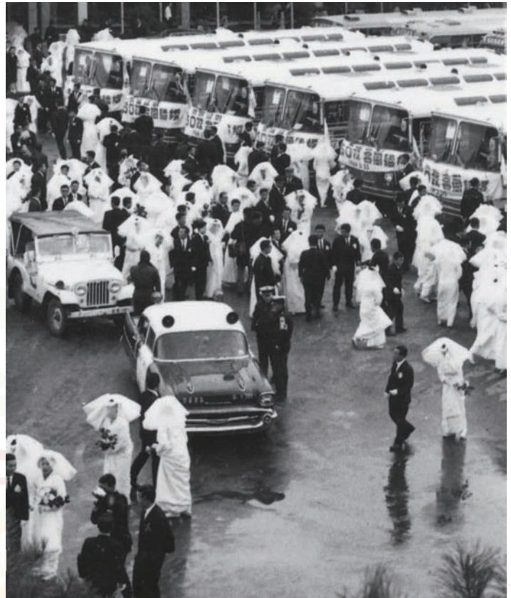
In 1968, 436 couples took part in the 430-Couple Blessing Ceremony in Seoul.

Kuboki were restored, which served as an important turning point in Japan's restoration. Sasakawa came to the ceremony and thus established a standard on which we could begin to carry out our plan to put an end to communism.