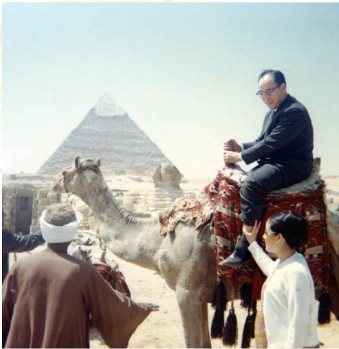
True Father riding a camel in Egypt, True Mother by his side, during the second world tour in 1969