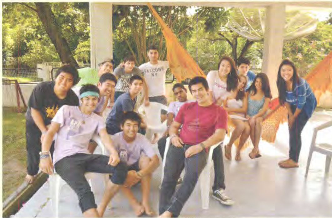
GPA members participating in an international service module in Guyana take a moment to send smiles around the world.

gram. 2 Another module is the Fund-raising Module, where they experience being on a mobile fund-raising team, going through different levels of fund raising while traveling across the United States. The third module is the Overseas or International Service Module, which includes up to twenty-one days of overseas experience. Mostly, we've been working in South America, Central America and the Caribbean. This time, for the first time, we've come out to Asia, with this trip to Japan and Korea. 3