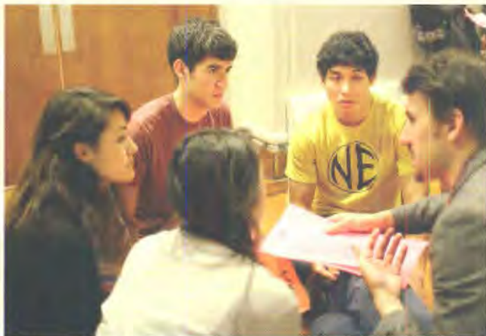
GPA members discussing "love languages" at the Lovin' Life youth group, Junction, as part of their Leadership Module