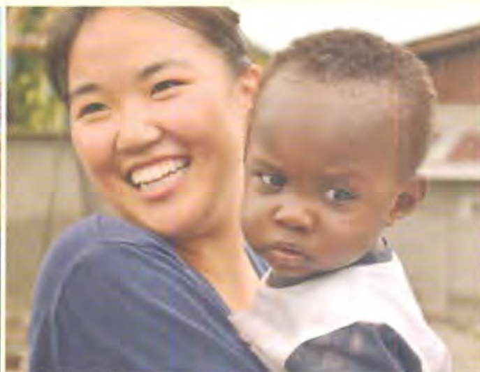
Left: GPA members on a leadership module workshop with the theme "Creating a Life You Love," at the Morning Garden estate in Gloucester, Massachusetts. Right: A GPA member serves in Guyana