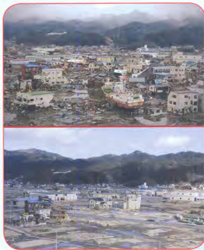
A comeback! A year after the tsunami, remarkable progress has been made in the central populated areas to clear up the devastation. GPA supported this effort.

family. Isn't it natural for family members to help one another?