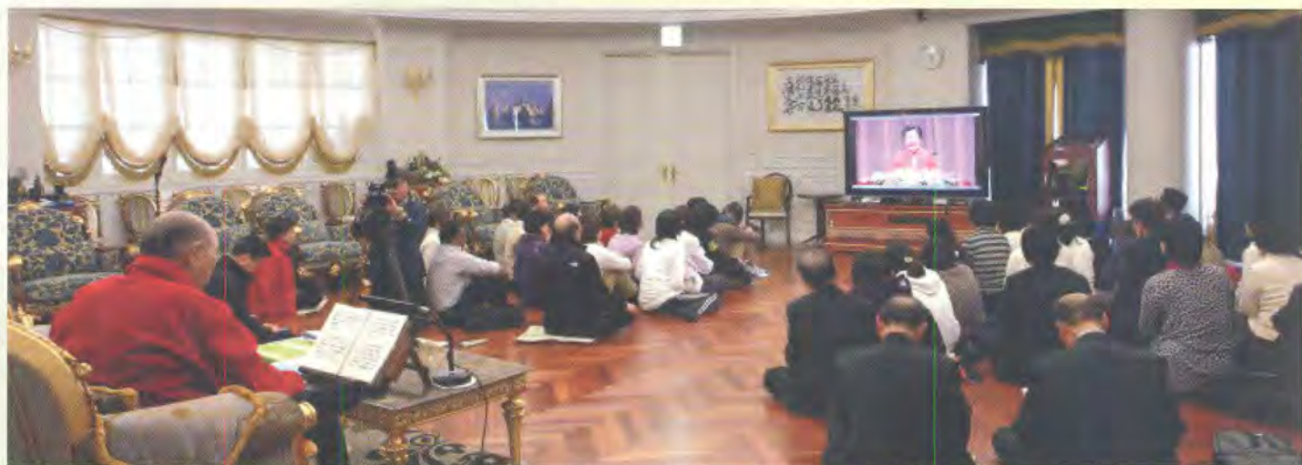
Father, on Geomun Island, watches True Mother giving her speech in Kumamoto on March 8 with members of the True Family, church leaders, staff members and local church members

The audience in Kumamoto numbered 3,700 members, including some in wheelchairs, who longed to see True Parents. After her speech had concluded, two people were in an anteroom waiting for True Mother. These were not members. They had never heard Divine Principle. In response to a revelation to fold cranes for world peace and the salvation of mankind, they had each made a thousand origami cranes. When