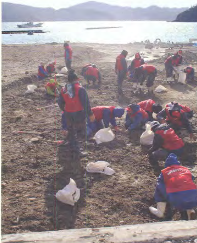
GPA volunteers pick up debris left by the tsunami a year before.

community. It's a great experience, especially for Americans second-generation members to see how privileged they are. They don't realize how fortunate they are until they develop relationships with people in other countries, many of them third-world countries, and actually stay there, working side-by-side with people from the local community. We do this for three weeks, and find out what it is like to not have running water, air conditioning, and other luxuries that we take for granted at home.