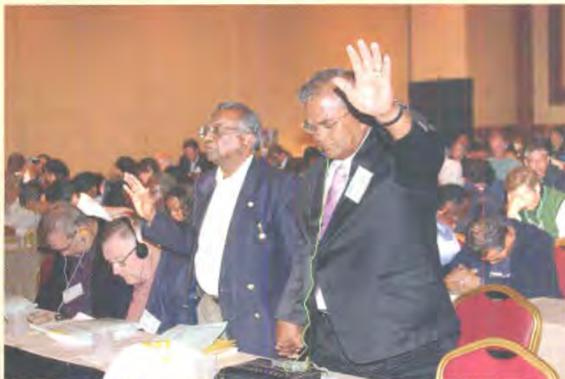
The OSDP workshops welcome faith leaders from various traditions and a wide range of denominations.

In teaching the Principle to ministers, our emphasis is always based on John 16:25, where Jesus said, "I have said this