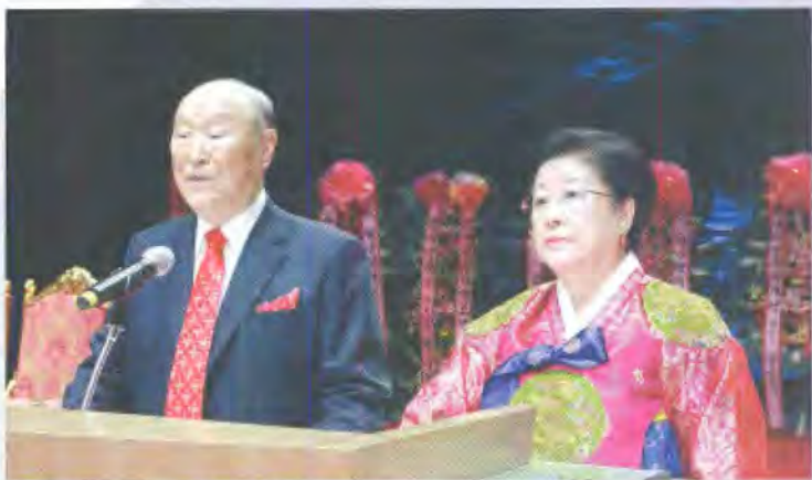
Above: Father's calligraphy reads "True Parents of Heaven and Love, the House of the Original Homeland of Heaven and Love"; Father and Mother took turns to read Father's speech; Center: The professional production of a musical depicting Father's life has a remarkable musical score and high drama; Bottom: With True Parents, a line of dignitaries, local and church, cut the tape to open the Cheongshim Peace World Center, where the Blessing Ceremony was held.