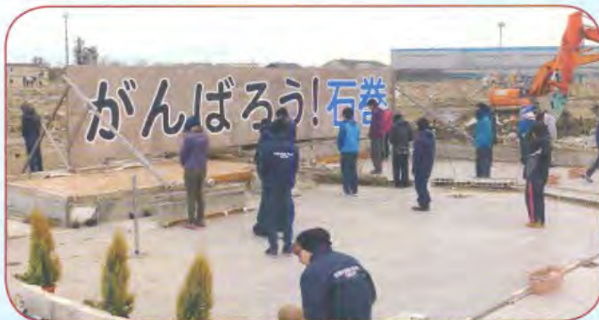
Prayer at a makeshift memorial. The writing says "Fight on! Ishinomaki."