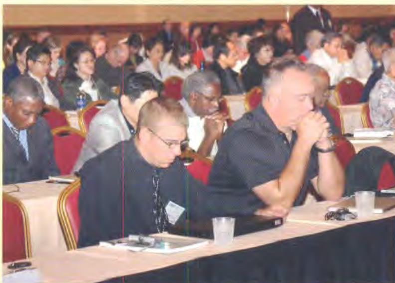
Pastors at the Original Substance of Divine Principle workshop in Las Vegas in October