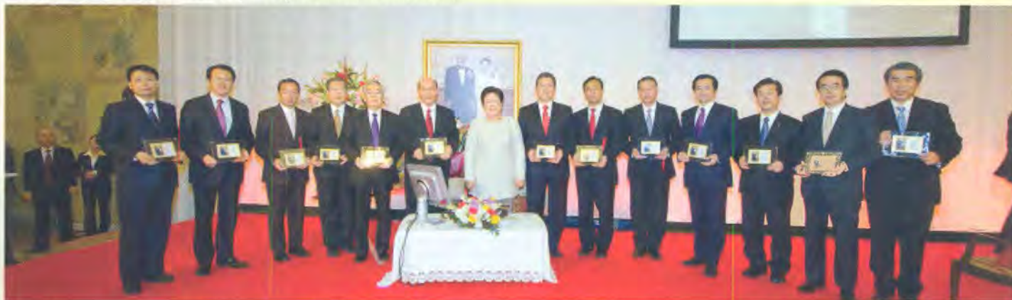
Top: A plaque of appreciation is presented to True Mother in Nagoya; Bottom: Leaders receive from True Mother color photographs of True Parents at their 1960 Holy Wedding.