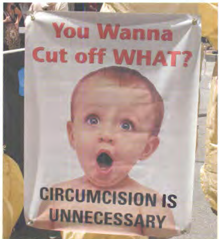
An anti-circumcision protest march in San Francisco, California

After a long, hellish, serpentine route that had been the indemnity history of immeasurable loss and suffering, we are finally on the threshold of the settlement era of Cheon Il Guk, where the promise and the healing embrace of our Heavenly Parent await us all, to be cherished in joyous gratitude. However, as our Heavenly Parent is the parent of all people, not only should we work to restore ourselves as individuals but we should also work collectively with our siblings, that is all humankind, to grow together and to go arm in arm to the promised land, the kingdom of heaven, Cheon Il Guk, at the center of which is the Heavenly Parent’s absolute heart, love and truth. As we embark on our road back to healing and peaceful settlement in the heart of our Heavenly Parent, we must necessarily sepa-