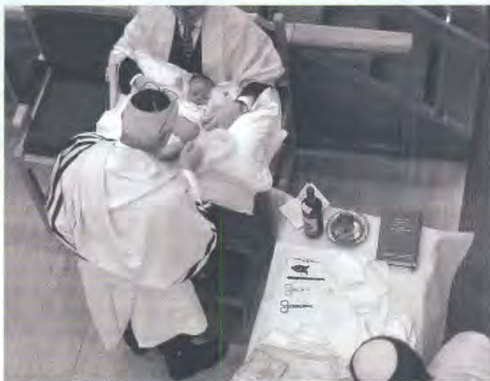
Generally performed on the eighth day after birth, circumcision, for Jews, is a religious rite.

Circumcision 9 was never a custom in Korea in times past, but it became a cultural norm beginning around the 1950s with the influx of United States' military personnel and American Christian missionaries, who brought their own moral interpretations regarding the practice. 10 As time passed, although the practice of circumcision has diminished drastically in the United States