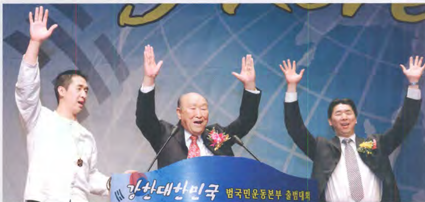
United voices of mansei for God's strong homeland

aspects of God's providence dealing with the Pacific Rim Era that I have announced.