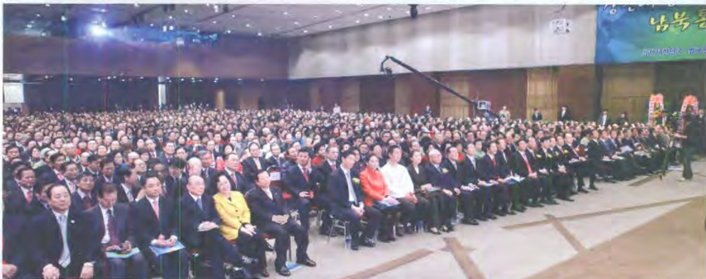
The 63 Building Convention Center hosted a crowd of 2,300 for the launch of the National Campaign for a Strong Korea.

Ladies and Gentlemen: I am well aware that this rally today is a launch ceremony paving the way for the Strong Korea movement to actively carry out its campaign throughout Korea. Therefore, on this occasion I will explain something of the profound providential plan God has had for the Korean peninsula throughout history. I will also speak about some