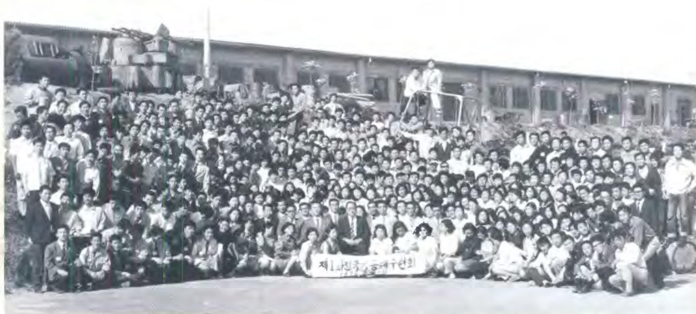
Father joins participants in marking the completion of the first national workshop for the Korean mobile team, May 31, 1972.

They said, "Pay ₩150 million." In about six months, they said, "Then, take it at just ₩120 million."