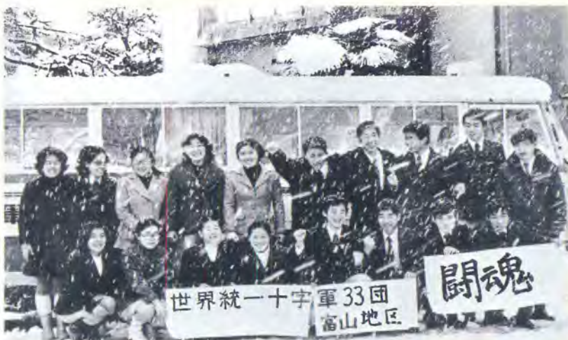
A mobile IOWC team of Japanese members braving the winter elements in their native land in December 1972