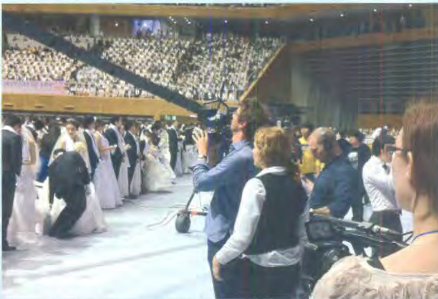
"Thousands of couples... are about to be married by the ninety-two-year-old Korean man they believe is the Messiah." The documentary was straightforward and the Blessing Ceremony looked spectacular on film.

Once the production company had returned to the United Kingdom, editing took place, after which the program was viewed by us for fact-checking purposes prior to its transmission. The UK broadcaster, Channel 4, is notoriously over-the-top in many of its commissions and its insistence of the title "Married to the Moonies" 5 was clearly to attract attention and