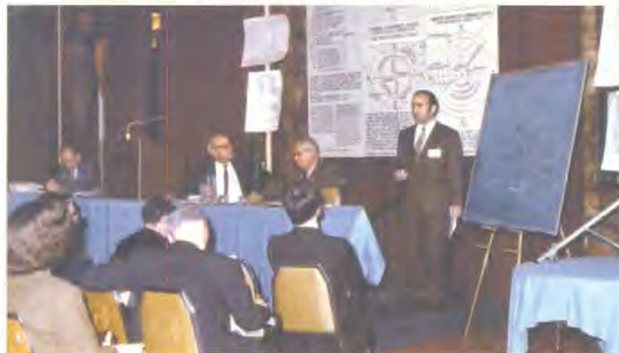
The first ICUS was held in November 1972 at the Waldorf-Astoria Hotel in New York City.

Why are we doing this? It is for Korea. That is to say, Korean residents in Japan are getting involved in Chochongnyon 1 and in propagating Kim Il-sung's Juche 2 ideology. So, at a time like this, it's clear that Korea is a cultural nation and an ancient culture that even the Japanese are impressed by.