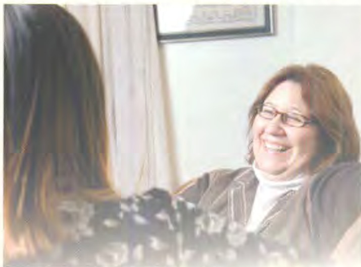
"Natural witnessing means to build relationships with friends... based on a life we love." — I'll Walk With You

I'll Walk With You encourages readers to discover their "why"—what attracted them to our church and motivates them. It also helps readers understand their own personal witnessing style—our Heavenly Parent works through each of us in a unique way, using our distinctive talents and gifts.