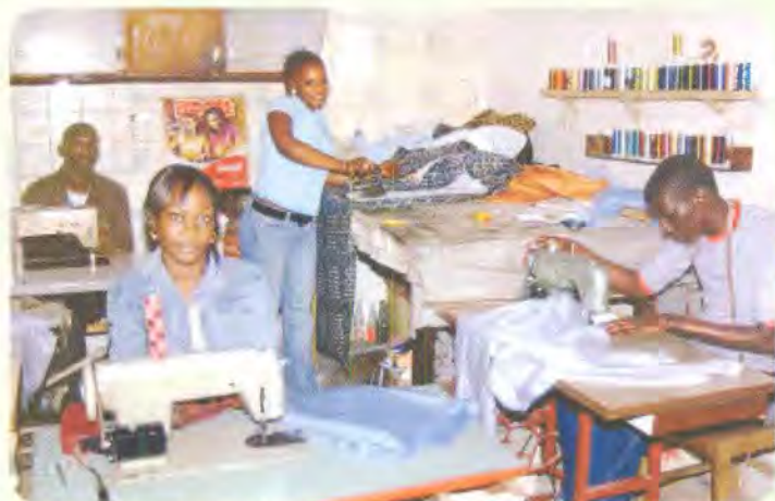
Left: Training in a tailor's shop run by Jamoo, a WFWP project to help Senegalese women help themselves. Jamoo means "bringing peace" in the local Wolof language. Right: Students at Jamoo begin by learning the basics of dressmaking.

The WFWP headquarters' committee and the prefectural committees reviewed proposals and chose which projects to fund. Fund-raising activities were planned and conducted. Though the needs were great—much greater than our grassroots efforts could address—we focused on educational projects with our limited abilities and resources because we believed in the importance of not only giving fish but also teaching how to fish. This is essential to empowering the peo-