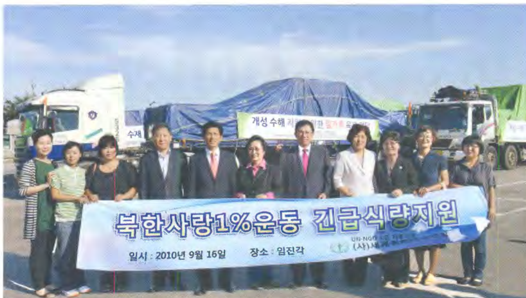
The WFWP 1% Love Share Project sending food to North Korea in September 2010; Last December a similar donation was sent to institutions in the vicinity of True Mother's hometown.