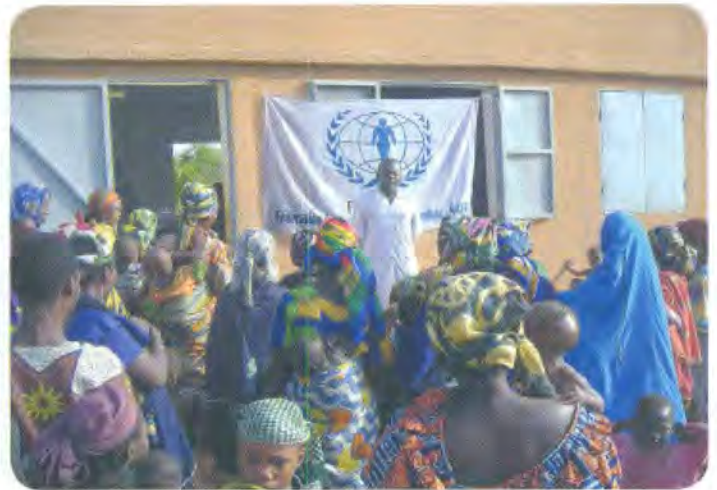
Left: WFWP, working with a sister organization, to provide goods in Nairobi, Kenya; Right: A doctor teaching women how to prevent Malaria; 90 percent of deaths from Malaria occur in sub-Saharan Africa.