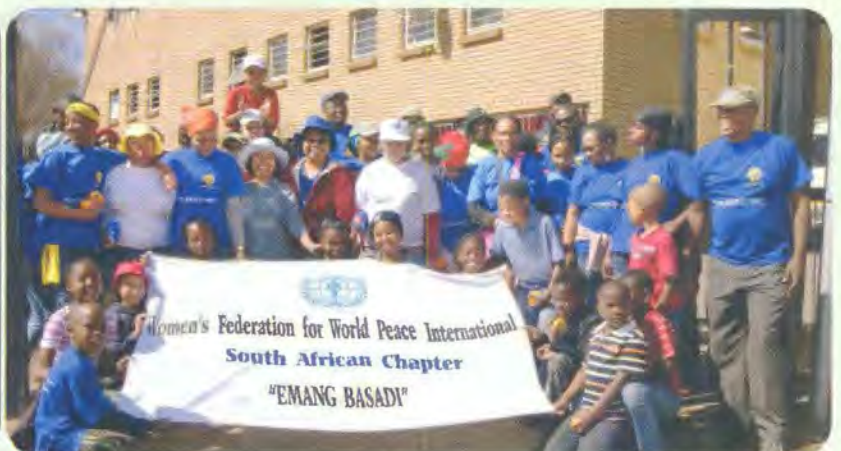
Left: WFWP donating mosquito nets; the World Health Organization recommends long-lasting insecticidal mosquito nets to help combat malaria; Right: WFWP South Africa working with a women's human rights group that began in 1986 in Botswana