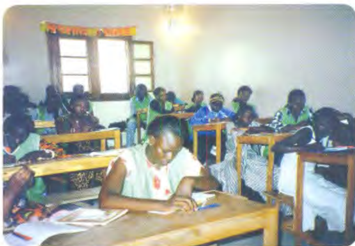
Left: A WFWP class on morality for young women; Right: Fédération des Femmes pour la Paix Mondiale (WFWP in French) providing medical aid, via a mobile clinic, to the needy in Niger.