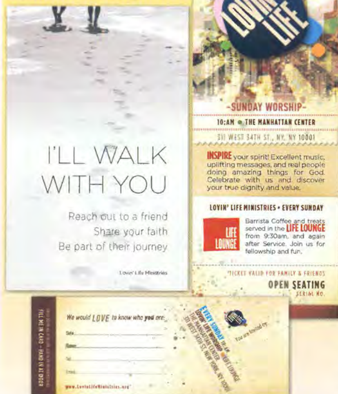
The cover of the booklet, and the obverse and reverse of tickets Lovin' Life created to invite people to services

The group was very grateful for a clear and simple diagram and explanation of the educational track called From Guest to Member in the mentoring guidebook, which provides goals and directions, as well as identifiable steps in the process of mentoring. Every person in the group has since stepped up to volunteer as "connectors" on Sunday