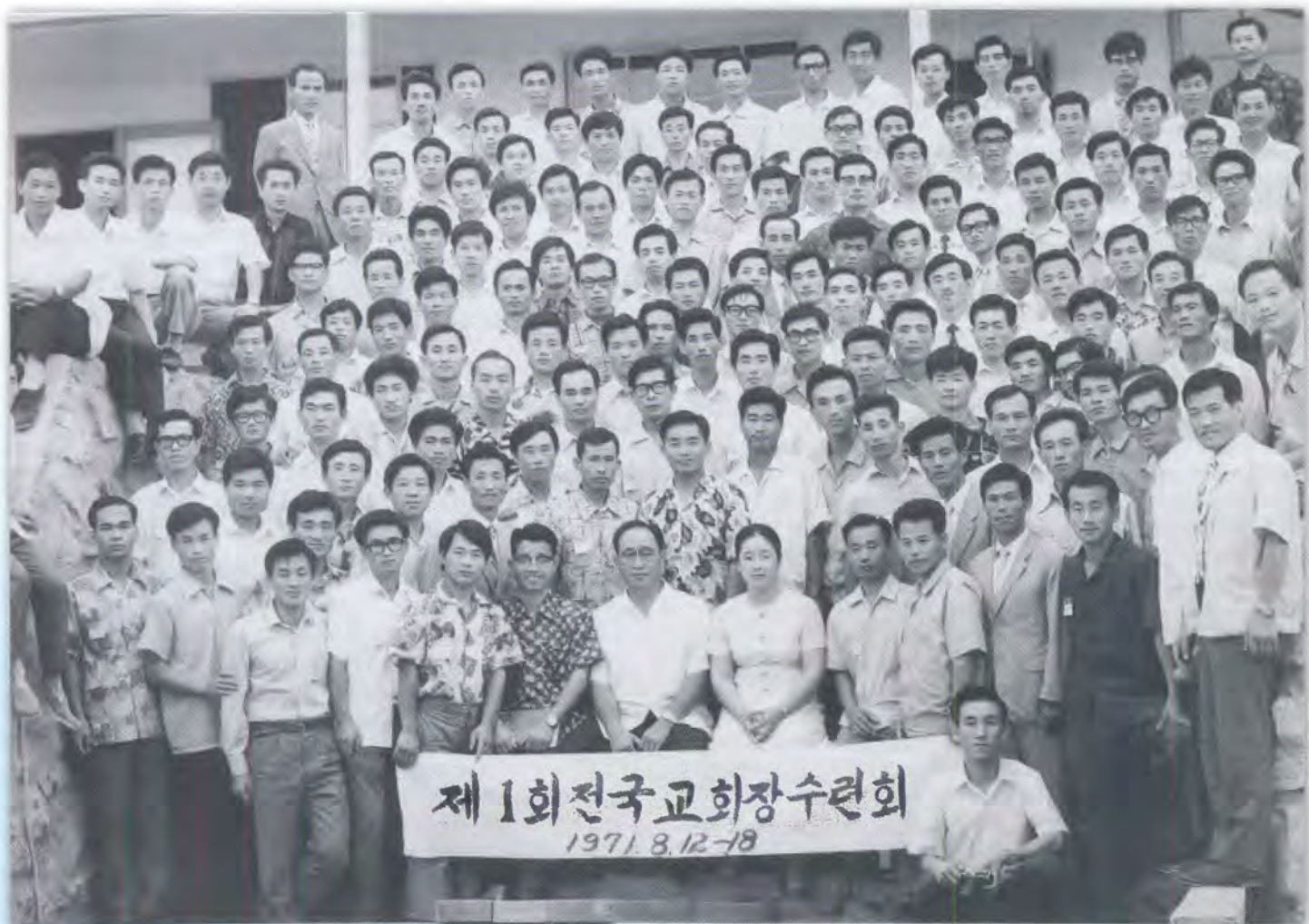
True Parents at Cheongpyeong with the young men who participated in the first workshop for leaders from throughout Korea

understand what I am saying? Only by doing that, can you be in a heart-centered position where you can become connected as family and as siblings, a connection where the starting point and goal are one. You must be able to complete the unaccomplished foundation, recover the lost land. You must all know that I have had all members sing "Urie So Wonun Tongil" since 1965 to prepare for this day.