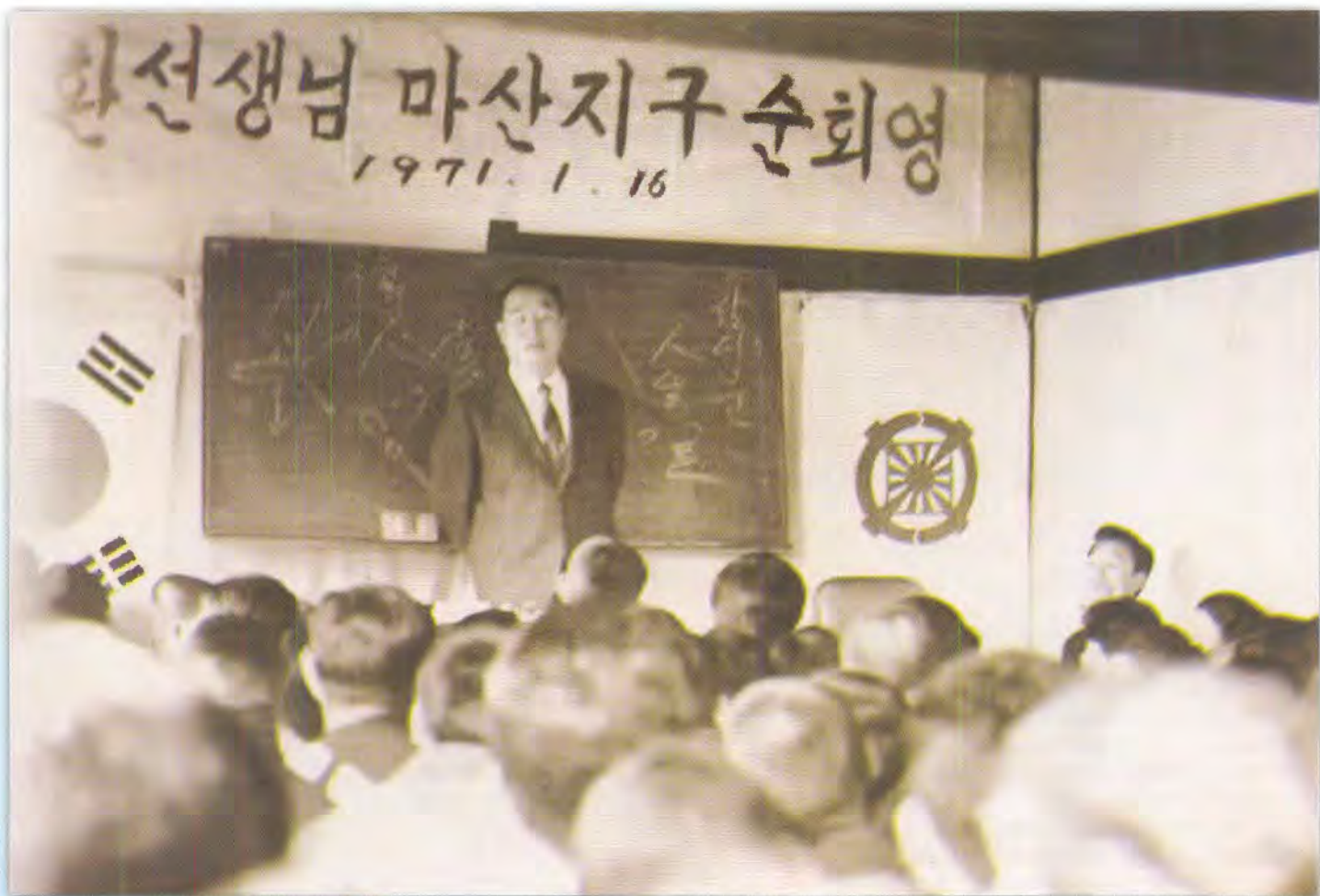
True Father visiting members near Masan, a town along the coast, about thirty miles west of Busan