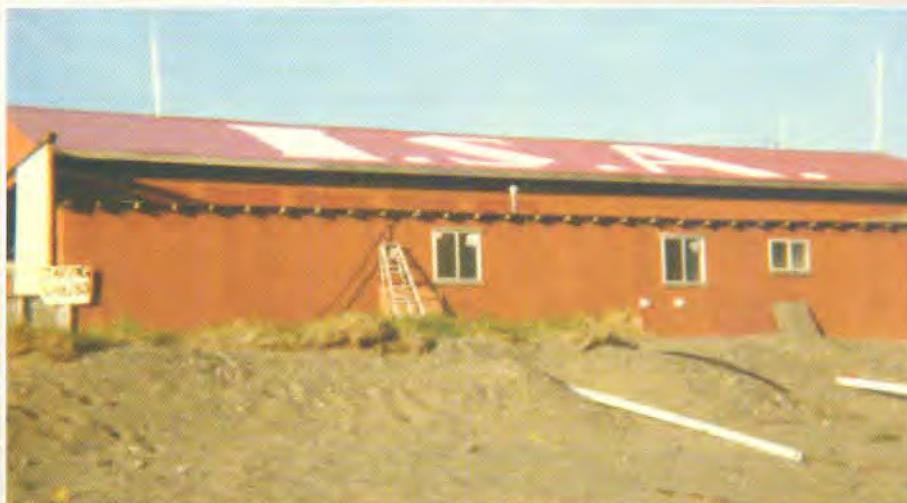
As much as 30,000 pounds of salmon a day would be beheaded, gutted and packed in ice here to be flown to the main plant on Kodiak island.