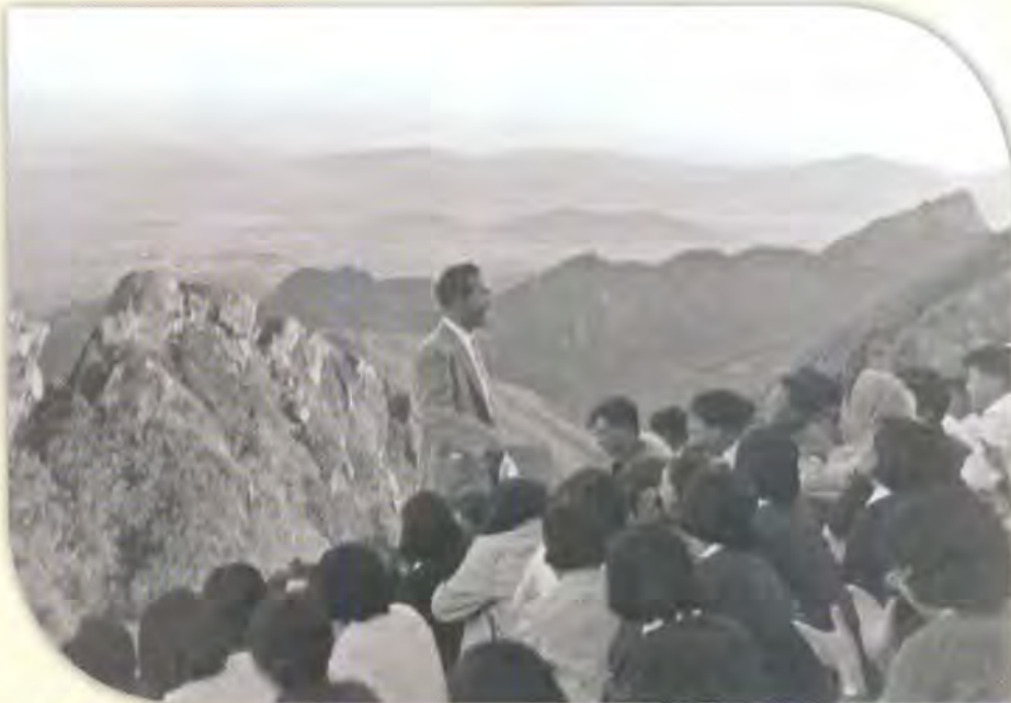
Father in the early days at a Sunday service amidst nature; many members were poor in those days, but they found delight in the spirit and loved True Father.