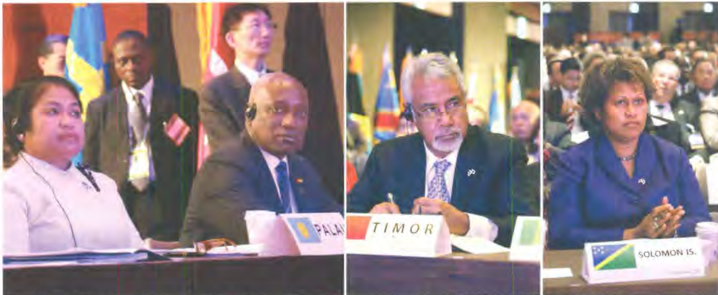
From left: Debbie Remengesau, first lady of Palau; Alcino Pinto, president of the National Assembly of São Tomé and Príncipe; Kay Rala Xanana Gusmão, prime minister of Timor Leste; Helen Fono, wife of the deputy prime minister of the Solomon Island at UPF World Assembly 2013

conventional weaponry, which is inferior to South Korea's as a result of North Korea's economic hardships. In diplomatic terms, the so-called nuclear card enhances Pyongyang's status and is a vital deterrent to the United States, even forcing the U.S. to the negotiating table. Apparently, Pyongyang's objectives have been achieved to some degree.