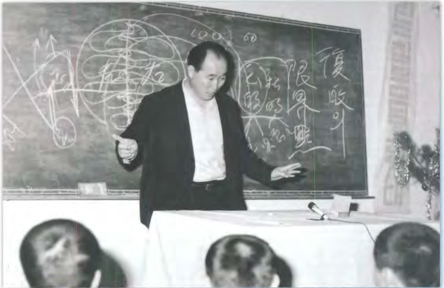
Father instructs a Sunghwa Students' group in 1971. He'd laid the groundwork during the previous seven years so that Korean restoration could be done by the members after Father departed for the U. S. to prepare the worldwide level at the end of 1971.

through our sacrifice as owners can a time of happiness dawn. Isn't that correct? If there's anything blocking our progress, we, the owners, must remove it. How can we remove it? The answer is quite simple. Once your hearts overflow with concern about how to restore and instantaneously liberate North Korea, you can never repress that desire even if you try to. The problem, however, is that many people have become indifferent to the North Korean situation, to whether it perishes or not, as long as South Korea is well off. This corrupt trend must be eradicated and a new people's movement bringing in a new climate must be proposed. Thus, the problem lies in how to provide the appropriate motivation to take a stand on Korean reunification. From this perspective, I personally feel that our members are the ones that can lead the way because you are in the very precious position of being able to inherit from my parents and my siblings. This is the original, heartrending story rooted in God's love and the heartrending story of restoration through indemnity. My family was sacrificed instead. You must understand this. My family was sacrificed because I came south. My parents and my siblings were in that position. My sorrowful heart cannot be relieved unless I set foot in the north again and weep in front of my parents' graves for not demonstrating the love of a devoted son and for not fulfilling my duty toward them during their lifetimes. You must understand this.