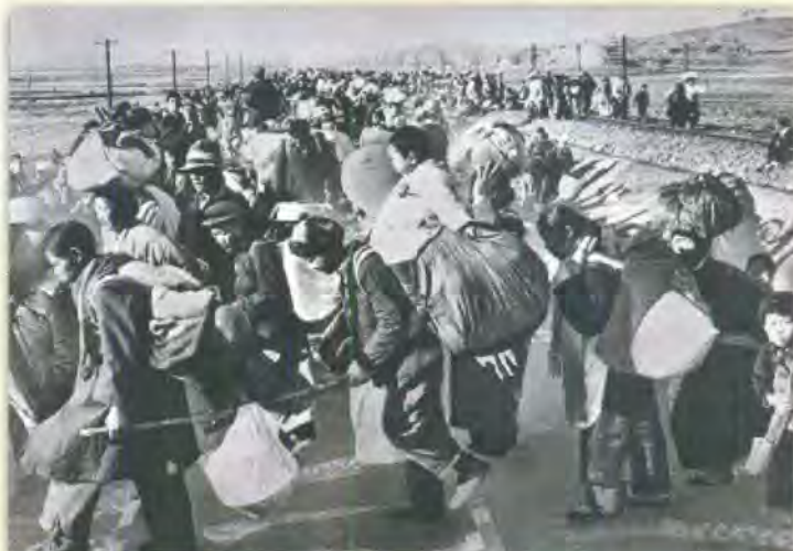
Refugees flock to Busan after the war broke out. Busan is one of the few cities in South Korea that North Korean troops never occupied.