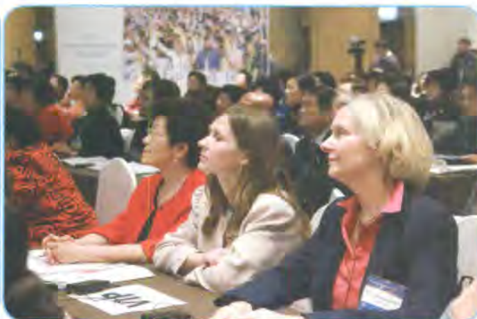
Woman leaders from various religious and ethnic backgrounds met in Korea for the Global Women’s Peace Network Assembly.