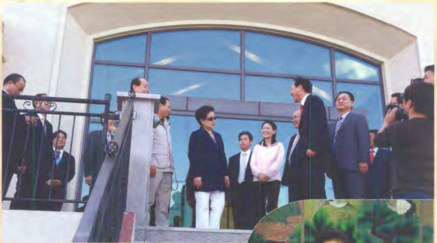
Above: True Mother visited the Ocean Resort and spoke to leaders there, on May 13; Below: Mother at the International Garden Exposition Suncheon Bay Korea 2013, near Yeosu on May 14. The exposition, which the Ocean Resort sponsored, is open for six months and features a variety of gardens in an area favored by outdoor photographers for its scenic beauty.