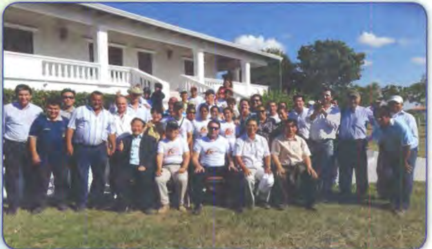
After eating, President Franco personally thanked the kitchen staff. The president's visit was the culmination of sweat and toil to fulfill a challenge Father gave to Japanese national messiahs on August 1, 1999.