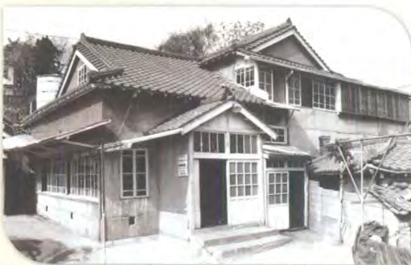
The first Cheongpa District church, where True Parents' Holy Wedding was held, was purchased on October 7, 1955.