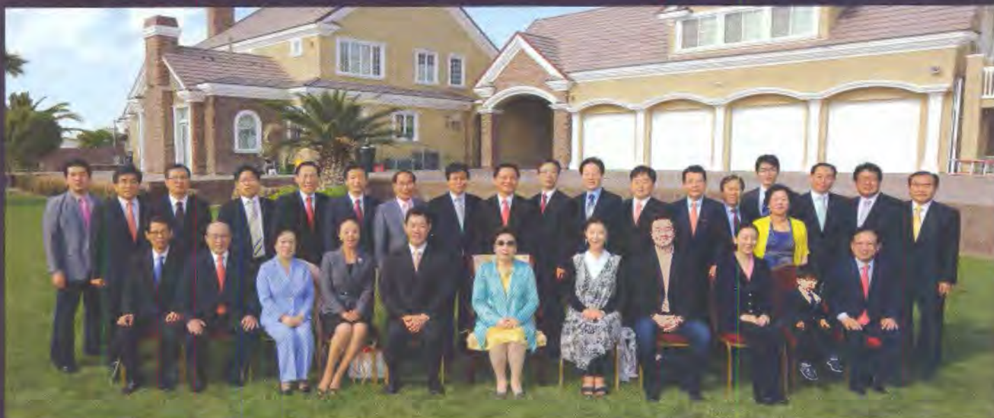
Providential organization leaders with True Mother and other members of the True Family on the occasion of the fifty-third anniversary of the True Parents' Holy Wedding, which was celebrated at Cheonghwa Palace in Las Vegas on April 25.