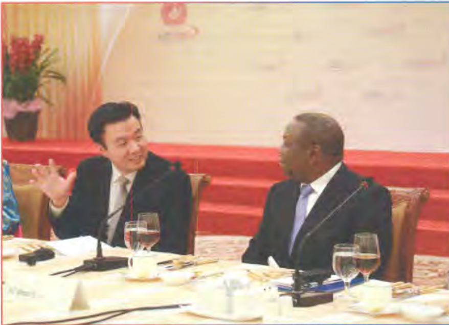
In-sup nim in conversation with Prime Minister Tsvangirai at a special banquet True Mother hosted at the Cheon Jeong Peace Palace for special guests from UPF World Summit 2013

ously sleeping giant into a promising destination for business and leisure and a centre for global attention.