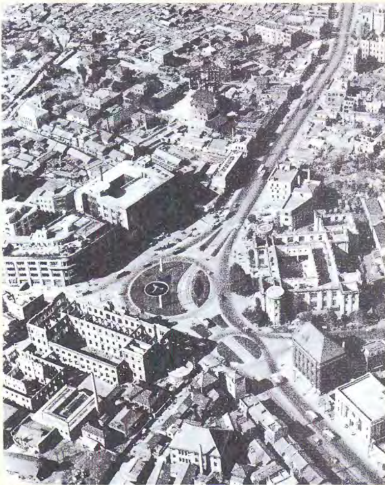
What had been a central shopping district in Seoul in 1954 not long after Father made a first attempt to set up a church in the capital city

bought some side dishes and hurried on my way, running all the way up until I was out of breath. I was quite shocked to see what was awaiting me. Everything in the room, including the Bible Father cherished most, was completely torn and lying on the floor in heaps. I went into the kitchen and saw a lump of rice that had swollen from soaking up water and a caldron broken in half was rolling around. She had flung all the bowls down the hill.