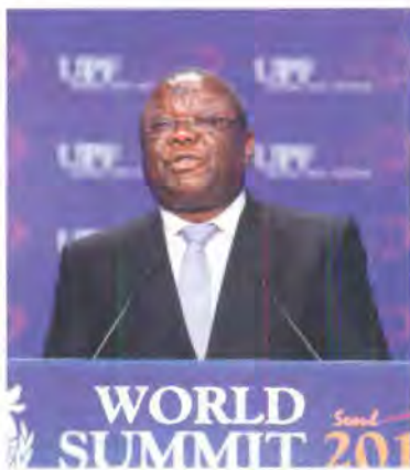
Prime Minister Tsvangirai giving his presentation, the text of which appears here, on February 23 in Seoul.