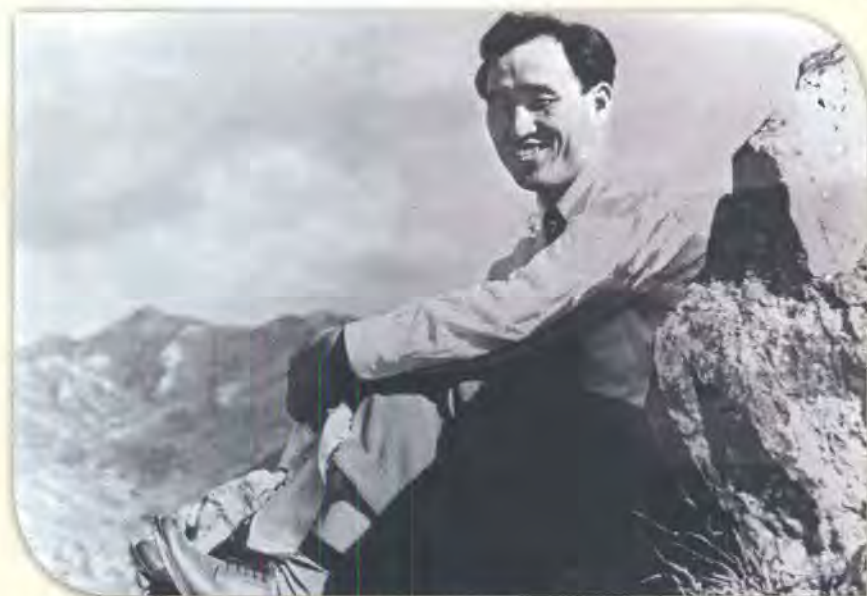
Father enjoying his freedom not long after his release from Seodaemun Prison

Creditors constantly kept asking for their money. I was in a completely tight position. Four months passed in this manner. I was so heavily in debt, but I never regretted it nor blamed it on anyone. I did not feel any pang of conscience because I did it for the God's will and voluntarily. At times, I even got loans with a 30 percent interest rate. My heart was at ease no matter what other people said. The only painful part was not being able to pay back the money.