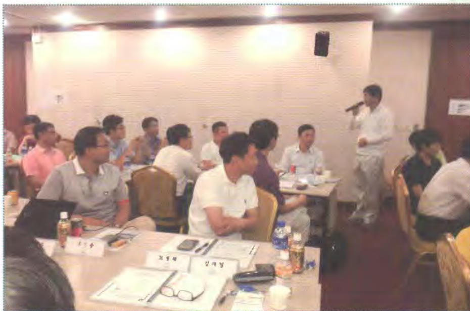
Employees of the Tongil Foundation and their affiliated companies are learning how to practice parental love, children's love, sibling love and conjugal love.

needed supporters. Whether the leading people in those businesses, who had received home group education, were members or non-members, they took on the role of supporting those home groups within their companies.