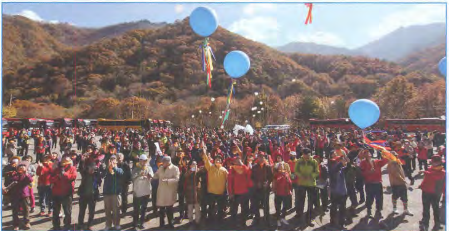
Fairly high peaks are features within and around Korean cities. UPF Korea conducts outreach through its own hiking clubs.

It is easy for you to say True Parents are the Messiah, but a listener has the choice to believe it or ignore it. You might proclaim it, but as an educator, I have to help those people that have listened to these proclamations to understand what they meant. That is why we need lecturers. That is why in a church you have the original text, for example, the Bible, but need a pastor to explain it, to help people understand what the Bible is about. That is why we need lectures, education, pastors and