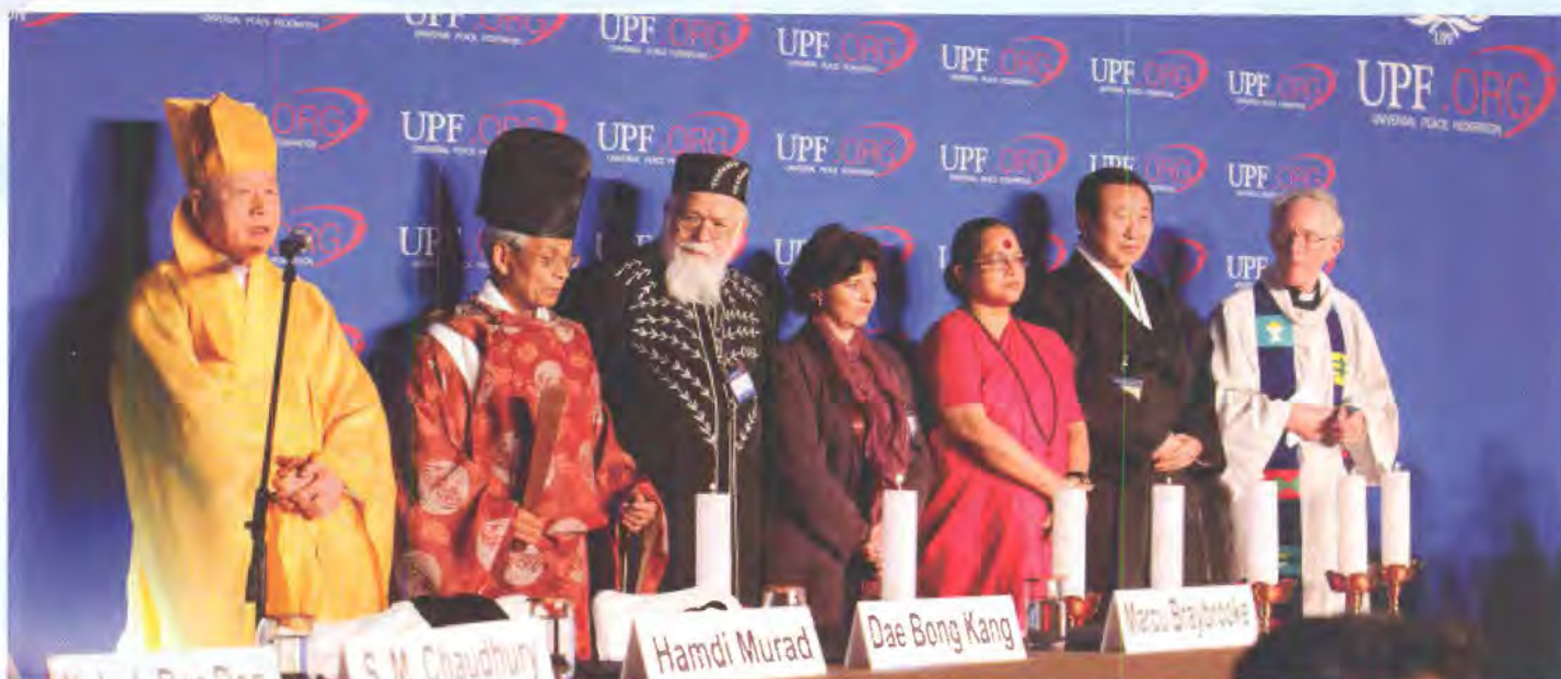
Leaders from a variety of faiths light a candle and pray at the International Leadership Conference. Engendering cooperation between religions is a core component of UPF’s mission.