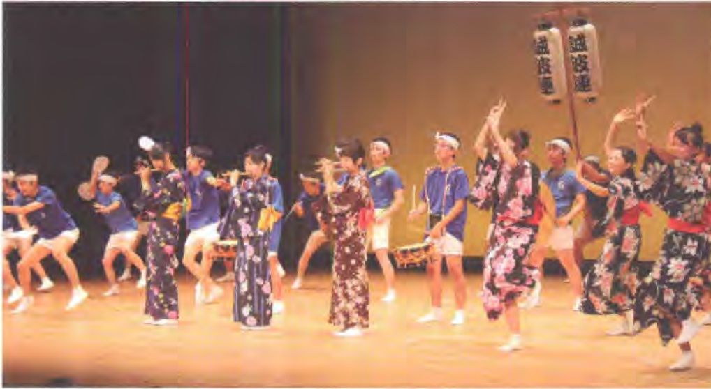
Young members play traditional instruments to enliven the audience at a regional rally.

This was adapted from articles in the Japan Unification Movement Weekly News.