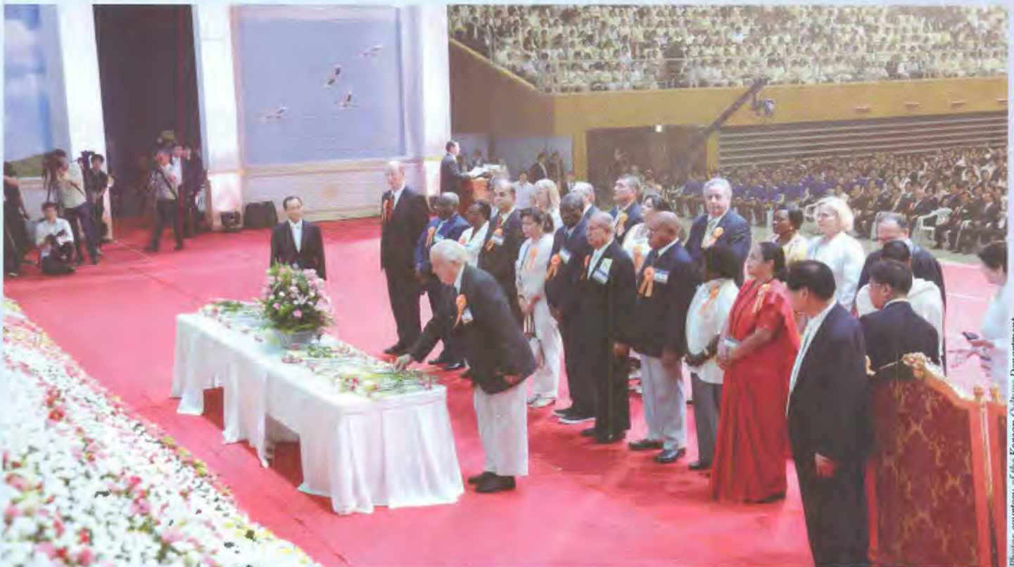
Members of the UPF family, Unificationists and others, pay their respects to True Father on the anniversary of his ascension.

In this context, religions are required to acknowledge one another and in the best-case scenario move along a spectrum from acknowledgement to tolerance, to dialogue, to mutual understanding, to mutual respect, to mutual appreciation and on to cooperation. Increasingly, those who engage in this process are exposed to transformative insights, leading some to develop hybrid religious identities, attributed to a growing