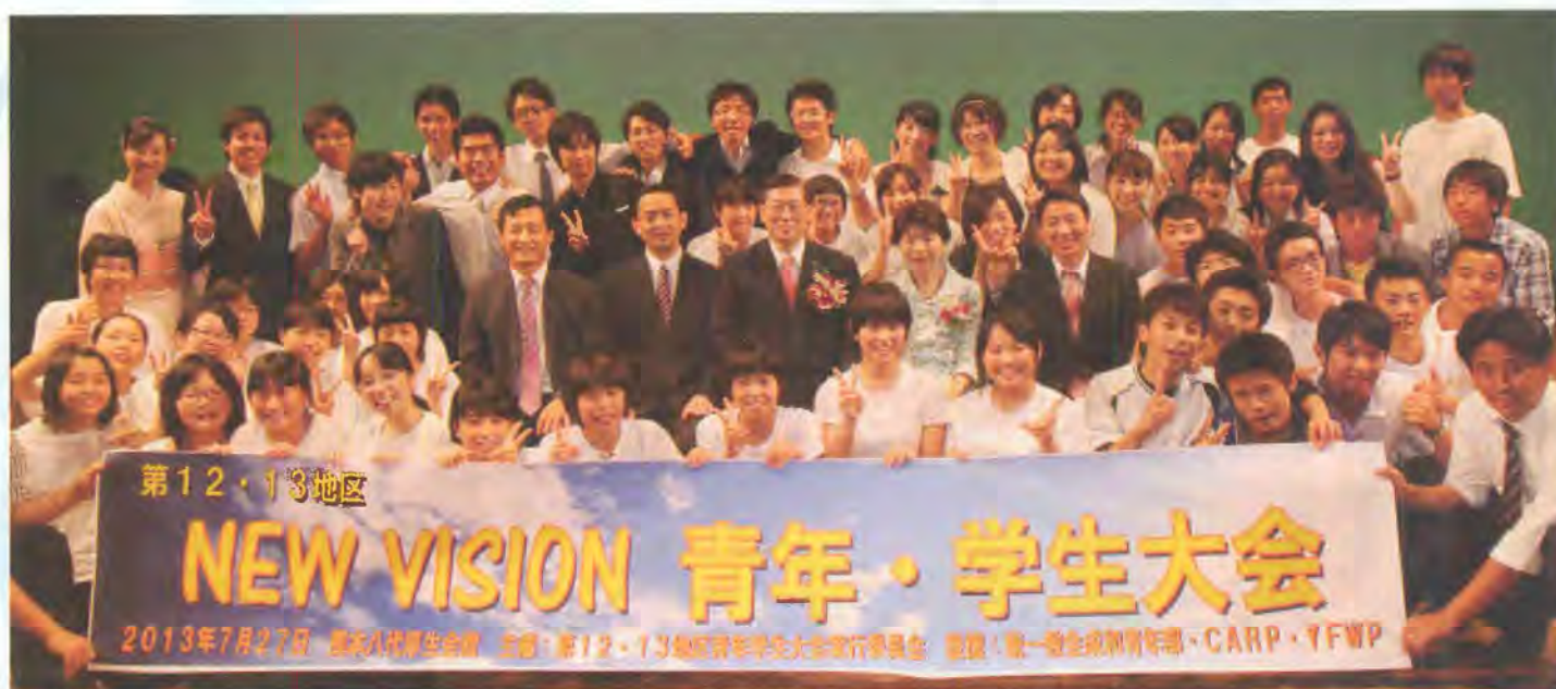
Japanese National Leader Tokuno Eiji and his wife Hisae at a joint rally for regions 12 (North Kyushu) and 13 (South Kyushu)

movement values self-initiated activities for genuine internal growth. Education on faith in the family and church is undeniably different from school education. Therefore, it is necessary to enable young people to express their thoughts, to plan and to practice varied activities that they can implement in their lives and local communities through the harmony of theoretical and practical education.