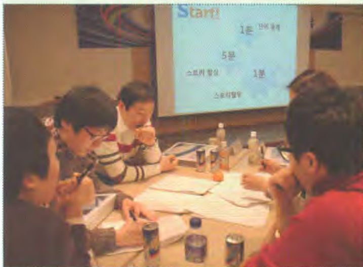
In the first round of Divine Principle education, Tongil Foundation employees learned the founder's worldview.

3 A publisher with education-related businesses that diversified and expanded overseas in areas such as solar power, construction and finance