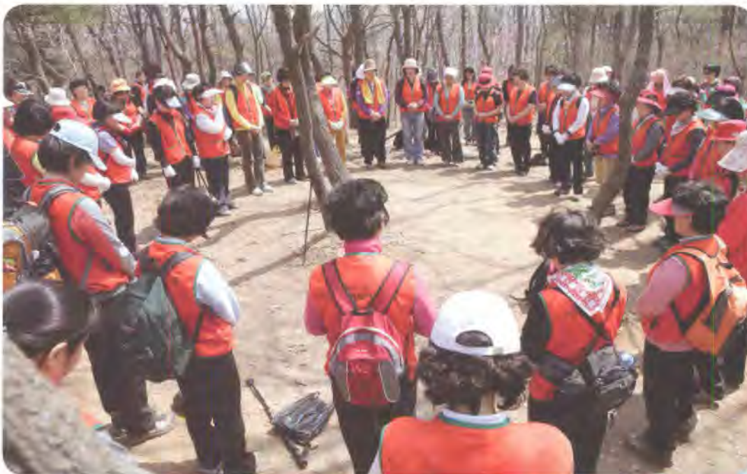
WFWP sponsors Loving Nature Camps, a way to help adults bask in nature's beauty.

however, it's very difficult to conduct these events. The local WFWP leaders are aware of this and when they have an event, they offer many conditions, such as 120 bows a day and breakfast fasting for forty days. After setting up those conditions, they call me to come and conduct the event. I am always grateful for the conditions they set. Whenever I meet the members, I am moved to tears. I believe that because those members are there and have set up conditions, the Women's Federation is where it is today. TW