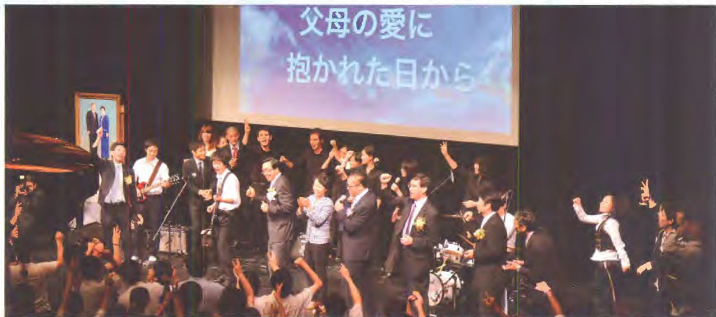
The line of the Japanese Holy Song they are singing in unison is “Life begins on the day you are embraced by Parents’ love.”

Only when a believer realizes the truth personally and practices love, does the truth take root in the heart. This is why our