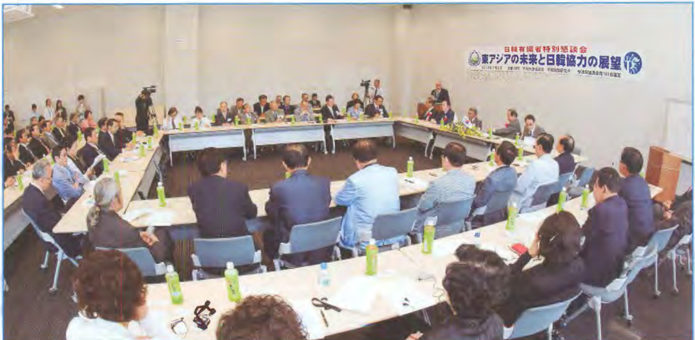
Top: Japanese and Korean church luminaries at a conference in Japan (pictured below) for members of the Japanese Diet

We even published a book that compiled all the reflections of the peace ambassadors on what they felt about the church before the education and after. We could not include everything. Most of material covered the jobs and positions that the peace ambassadors held in society and what kind of biases they had held before they began to see Father in a different light, respect his work and desire to support and