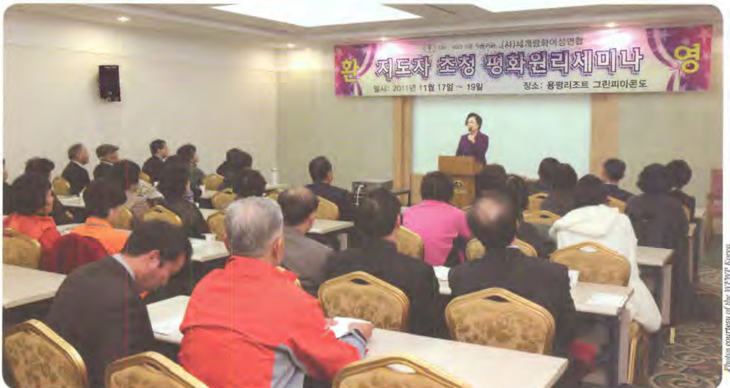
President Moon addresses the twenty-seventh Principles of Peace Workshop for Leaders in November 2011