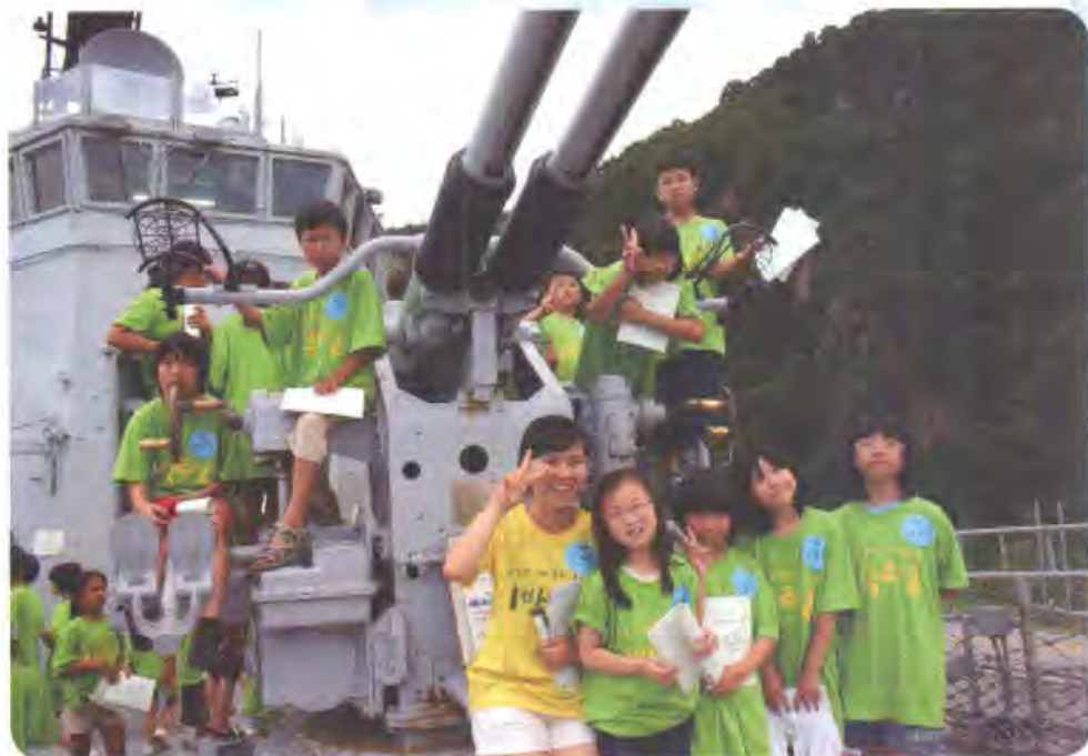
Young Koreans, at a WFWP-sponsored camp, are being encouraged to hope for and perhaps eventually work toward the reunification of the Koreans.

Once I gave a lecture in Hampyeong in South Jeolla Province, where the mayor came, as did the leaders of the local government's Women's Council. The council's past eight presidents came. They were awed by the lecture and inspired. The eighth president of the Women's Council was the branch leader of WFWP in that city. The others looked down on her even though she was then the leader of the council. After hearing my lecture, they were so moved and curious. They wanted to