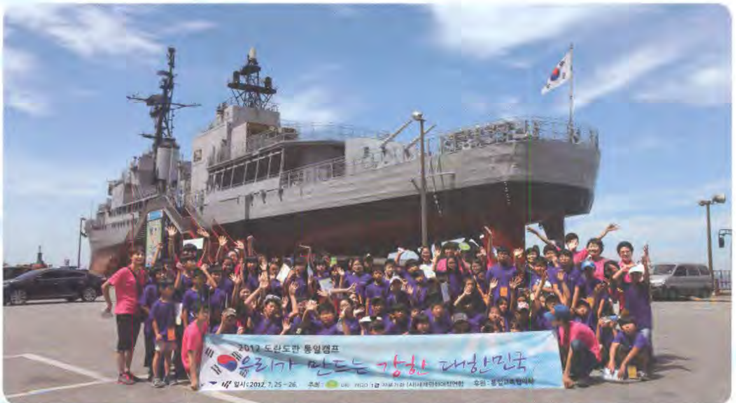
A WFWP sponsored excursion took children to the ROKS Cheonan, believed to have been sunk (costing the lives of forty-six sailors) by a North Korean torpedo on March 26, 2010. The South Korean Navy later raised it from the seabed.