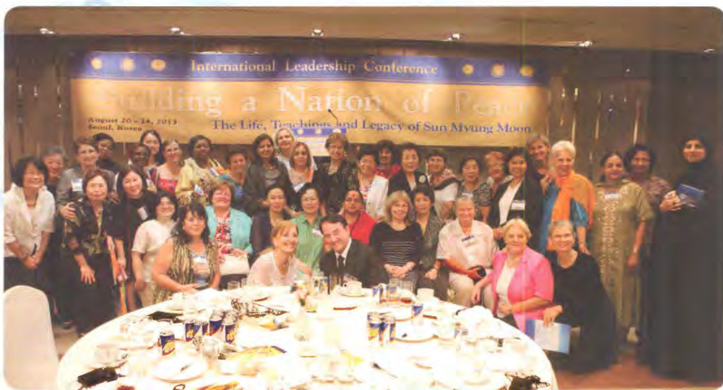
Members of WFPW's extensive international family meet during a 2013 International Leadership Conference.

I think the time has come to start teaching people. The time has come. Because when people listen to lectures, and we have the best lecturers in Korea, the material deeply moves them. You asked what parts participants react to the most; all participants are moved when we speak about Father and his accomplishments. Many people ask, now that Father has passed away, what will happen to Father. You also have the True Children problem; many people ask if the Unification Church is now going to collapse. I strongly tell them, Don't worry. When they ask those questions, I usually say that even Jesus, two thousand years ago, was crucified between two thieves, all his disciples and followers having abandoned him. No one imagined during those days that his foundation would spread and become the main religion in most developed countries in the world. Of course, if we make mistakes, it causes prolongations and indemnity has to be paid. That is painful, but the foundation will continue spreading. Father said that there would be