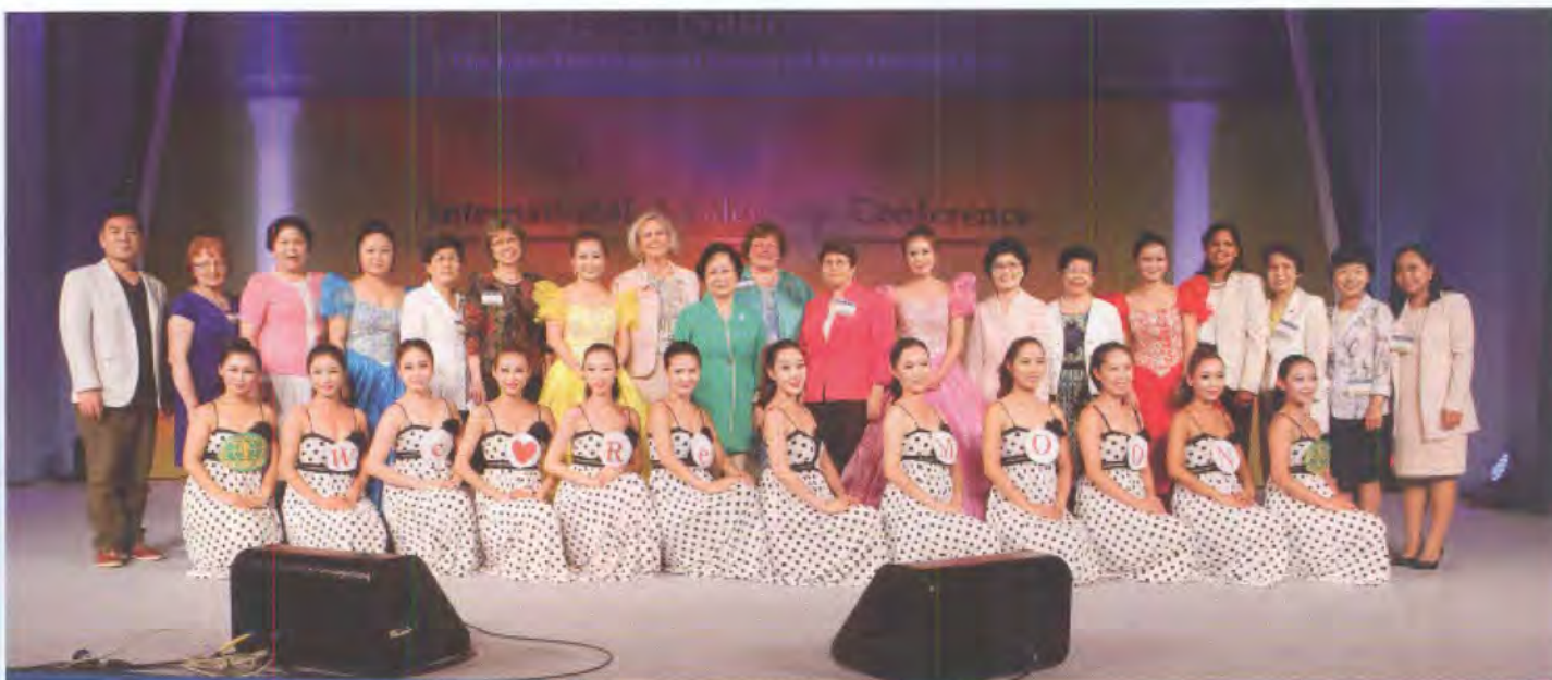
WFWP took part in the recent UPF International Leadership Conference. In the front row are the Pyongyang Folk Arts Group, comprising refugees from North Korea.

the blessing has not only been affirmed but encouraged, and practiced. Along with instruction about purity and fidelity, Holy Wine Ceremonies, blessing education and participation in the Blessing Ceremony have always, always been part of UPF educational programs.