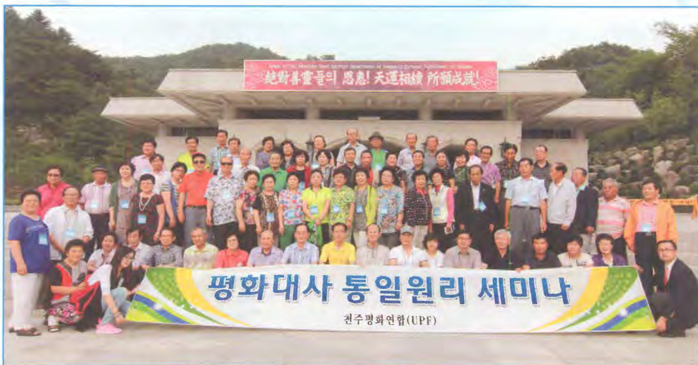
The fourth Divine Principle workshop for UPF ambassadors for peace, at Cheongpyeong in 2013

When we look at Father's Seonghwa Ceremony, we learn that we had about thirty thousand members from Korea and about thirty thousand members from Japan that came to attend the ceremony and around fifteen thousand peace ambassadors. If we had not carried out this peace movement, no one other than members would have attended Father's Seonghwa Cer-