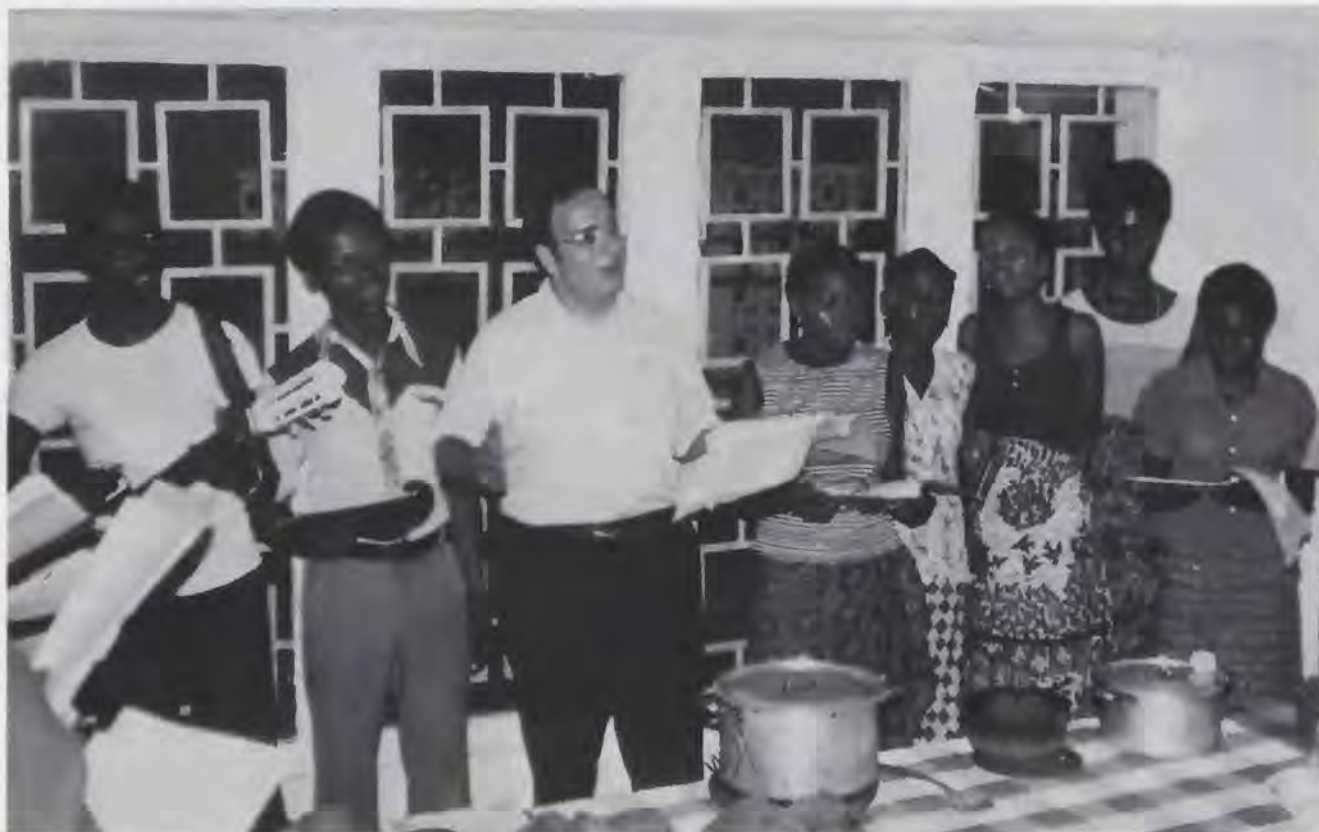
Raising the atmosphere before supper.

When I felt this, when I felt that I was standing there in True Parents' place, then I felt Heavenly Father's love for me. My love for the people returned, too. I wanted to reach out again, and continue to reach out and to love. From that point on, my resentment against the people, and my inability to reach out in love to the people, ceased, and I could begin to live internally again, spiritually. That is the second crisis of a missionary. I know I'm not alone in this either. I've shared this with