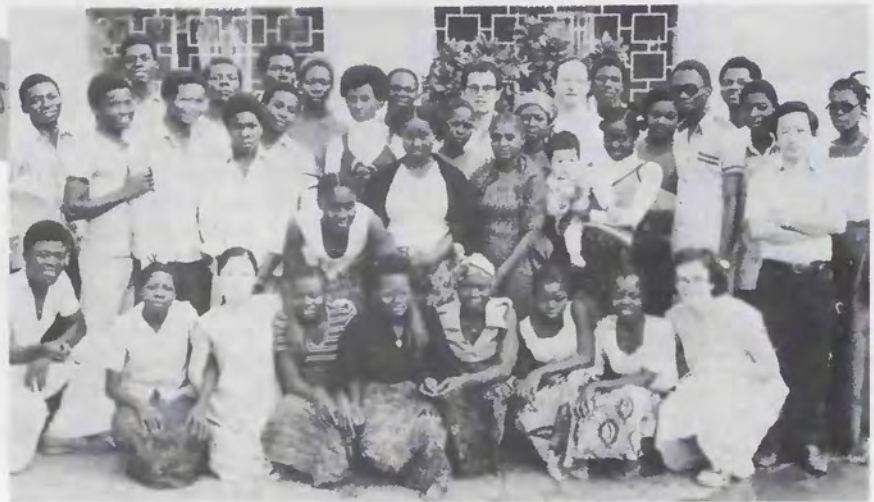
Gathering in front of the center before a lecture.