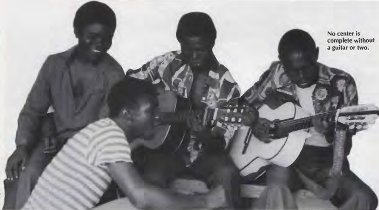
No center is complete without a guitar or two.

to grow. Right now we hardly do any witnessing and people are coming over, new people, every week. Our problem right now is that we have no financial foundation and we're all working to build one so we can expand our spiritual grace as well as our financial grace. But this is very hard to do in a Third World country.