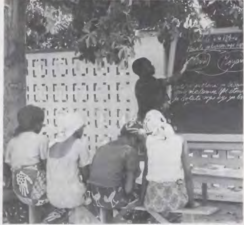
Lectures can be held outdoors all year round.

whole center together; we made a very strong determination on our Holy Ground. During this time of fasting we made a breakthrough internally, and we really got connected to our mission. We came home. It was during this time that members began to come, high quality people, wonderful people, strong Christians. The first member had been a Christian youth leader for five years, a leader of the Christian youth in the country. He knew the Bible so well, he had a good education, he plays the guitar and composes his own songs, and he became our first member.