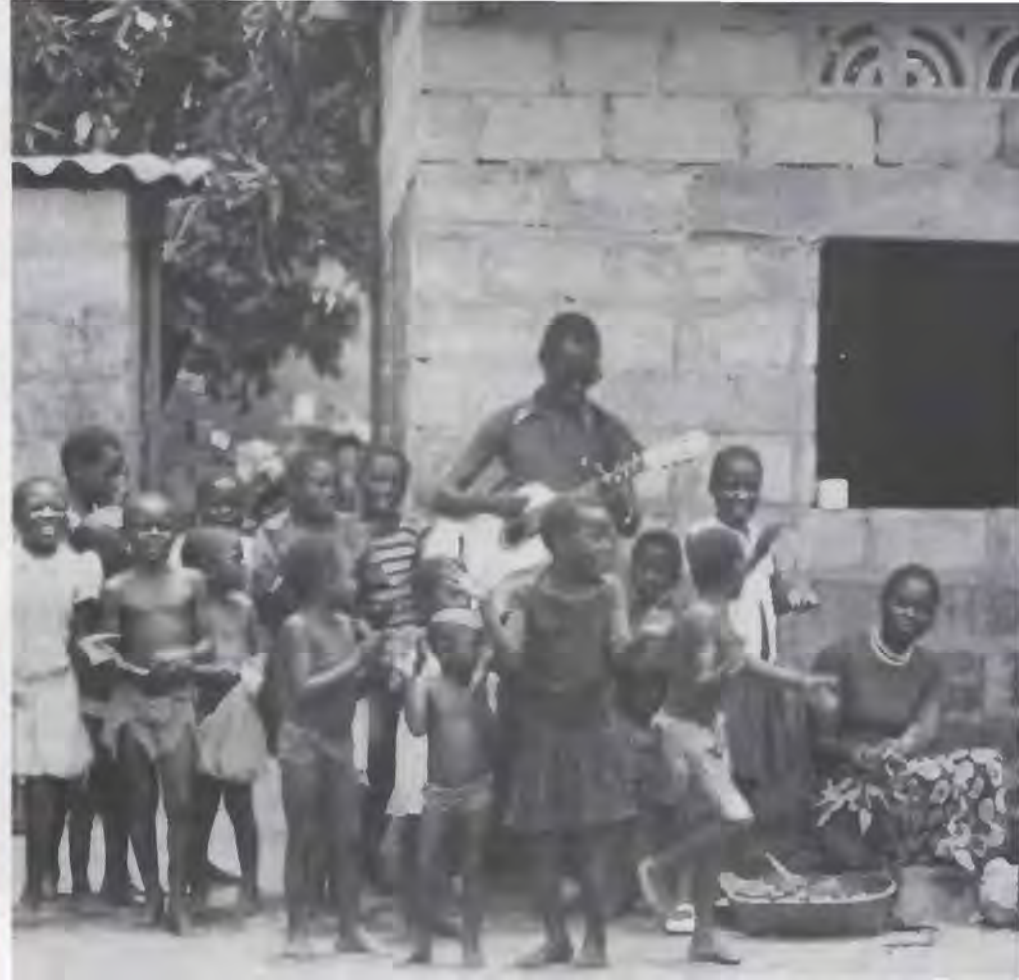
Music always brings a crowd of enthusiastic children.

And the first thing necessary, I think, in a foreign mission is to conquer this resentment, to eat up this resentment, to judge this resentment, to take it away. For me, it came over a bowl of beans, one day when I was sitting all alone. I still couldn't speak French well enough to communicate anything substantial, after I had been there for several months, and all I could afford to buy was some beans. All I could eat was beans every night. I'll tell you one of my weaknesses: I enjoy food. I enjoy eating it. One week of eating beans was pressing on a sore nerve with me. And then somehow the beans came to symbolize for me all the indemnity, all the physical indemnity of the mission. I looked at these beans with such resentment in my heart: "Why? Why am I in this circumstance? Where is God?" Anger. But then, all of a sudden I understood where that kind of feeling led. I could see that that kind of feeling was death, spiritual death, and if I felt that way I was a dead man spiritually. I said