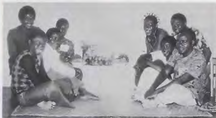
Zairean members around a holiday offering table.

We had a small center. Originally we spent six months searching for a new center. We couldn't understand why it was taking six months to find a new center. Well, for six months we searched and searched and searched, and every house was closed to us. We would almost find a house, and someone else would take it. We would almost have an apartment and then it would be closed off to us. Or