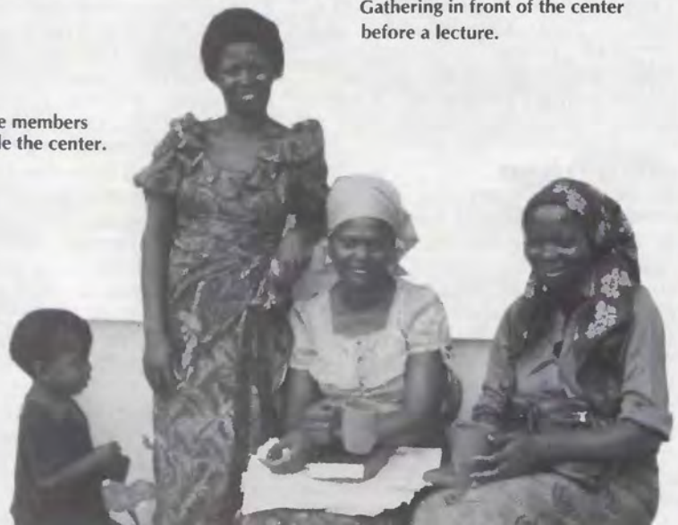
Native members outside the center.