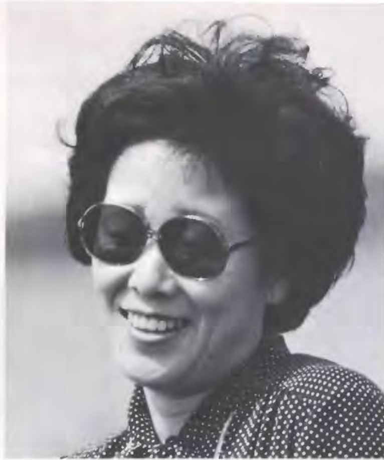
Seminary graduates volunteering for ocean church.

During the tedious hours of waiting for a tuna to strike, people complain and fight. But once a tuna bites, they are instantly united as one team. This is the unification spirit I am trying to promote. I want Unification members to come from all over the world to experience this.