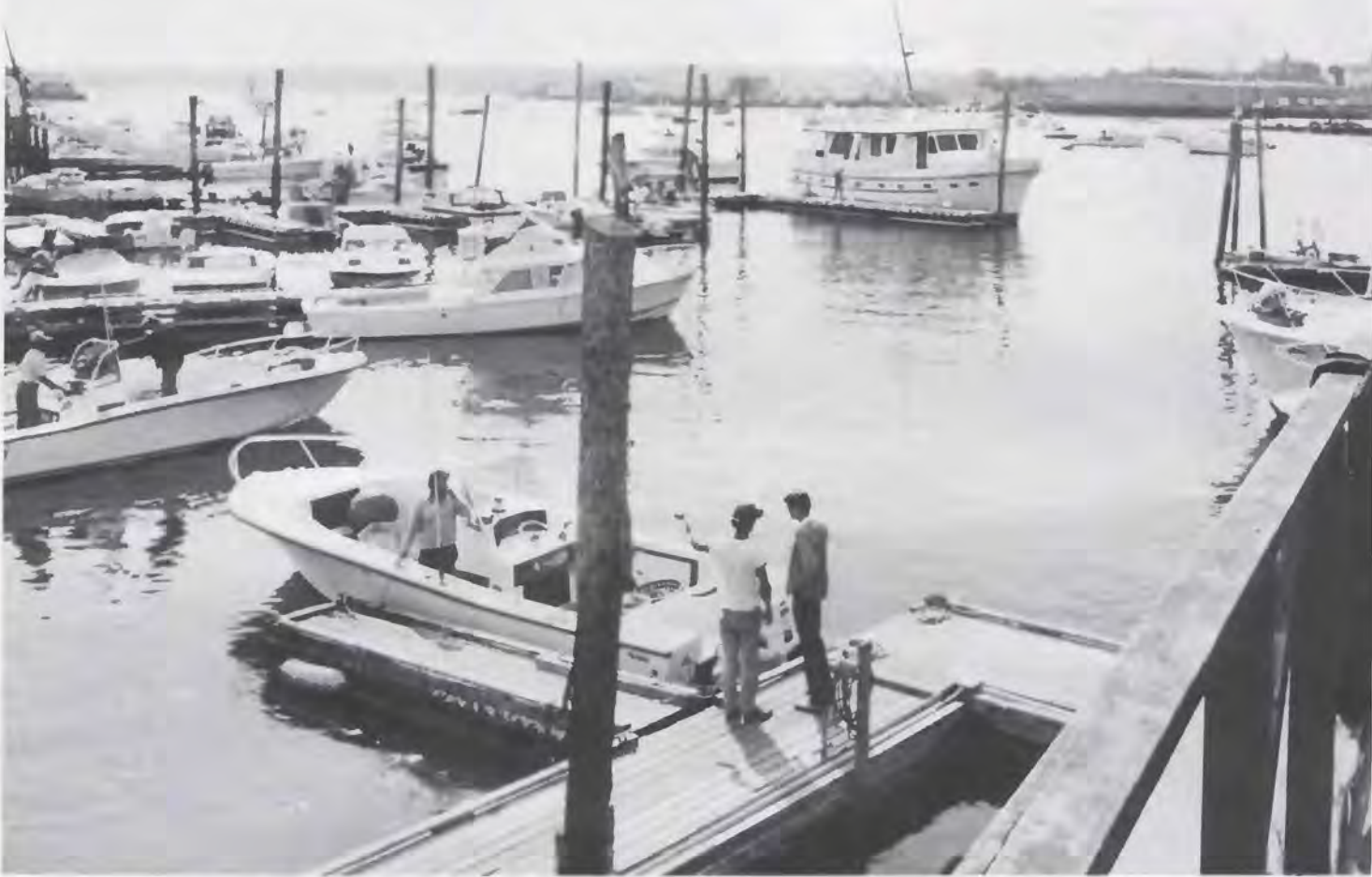
Father and Daikon check out family boats moored in the Gloucester harbor.

God has reserved one activity for us; everyone else has run away from it. Now all conditions are ready for our organization.