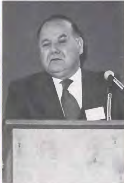
Dr. Isma'il al Faruqi, Professor of Religion at Temple University, Philadelphia, Pa. Originally from Palestine, he frequently visits the Middle East, promoting Muslim youth movements.

"The Unificationist challenge of faithlessness, materialism and secularism has made Muslims and Unificationists brother soldiers on the same front."