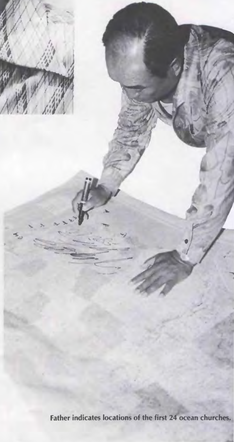
Father indicates locations of the first 24 ocean churches.