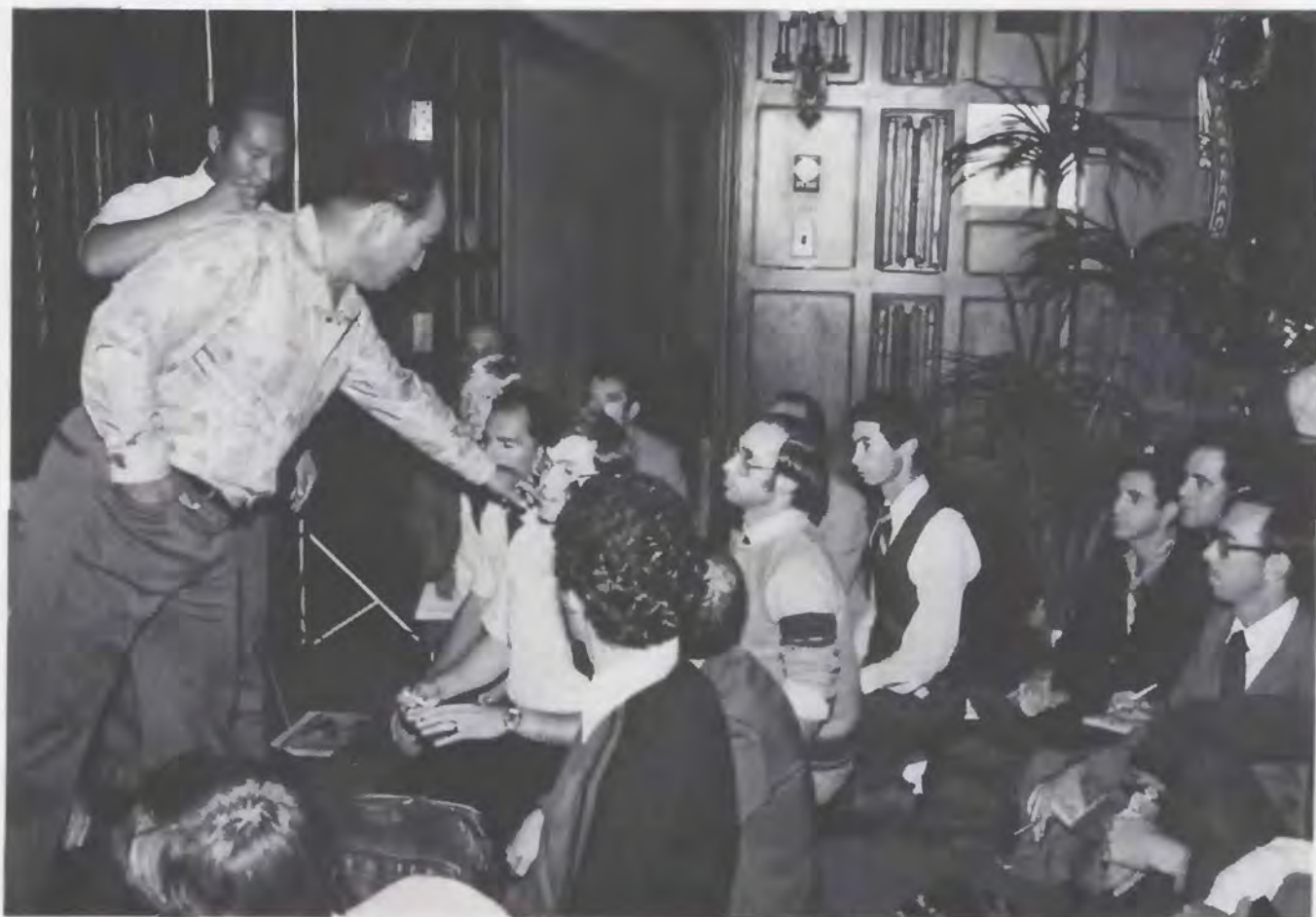
Father chooses new state leaders.