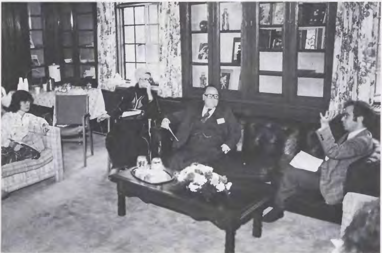
Dialogue continues in Barrytown lounge.