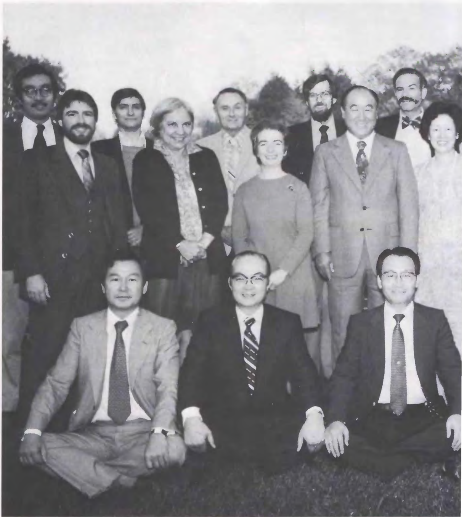
Father, Mother and the advisory board of NEW ERA, at East Garden.

"If you can taste God's love, your daily life is a revelatory life."