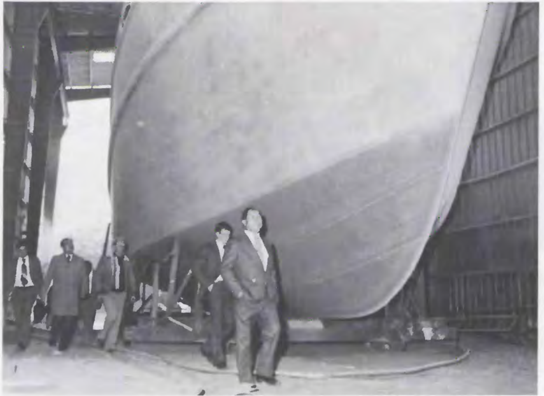
Father visiting Alabama shipyard in 1978.