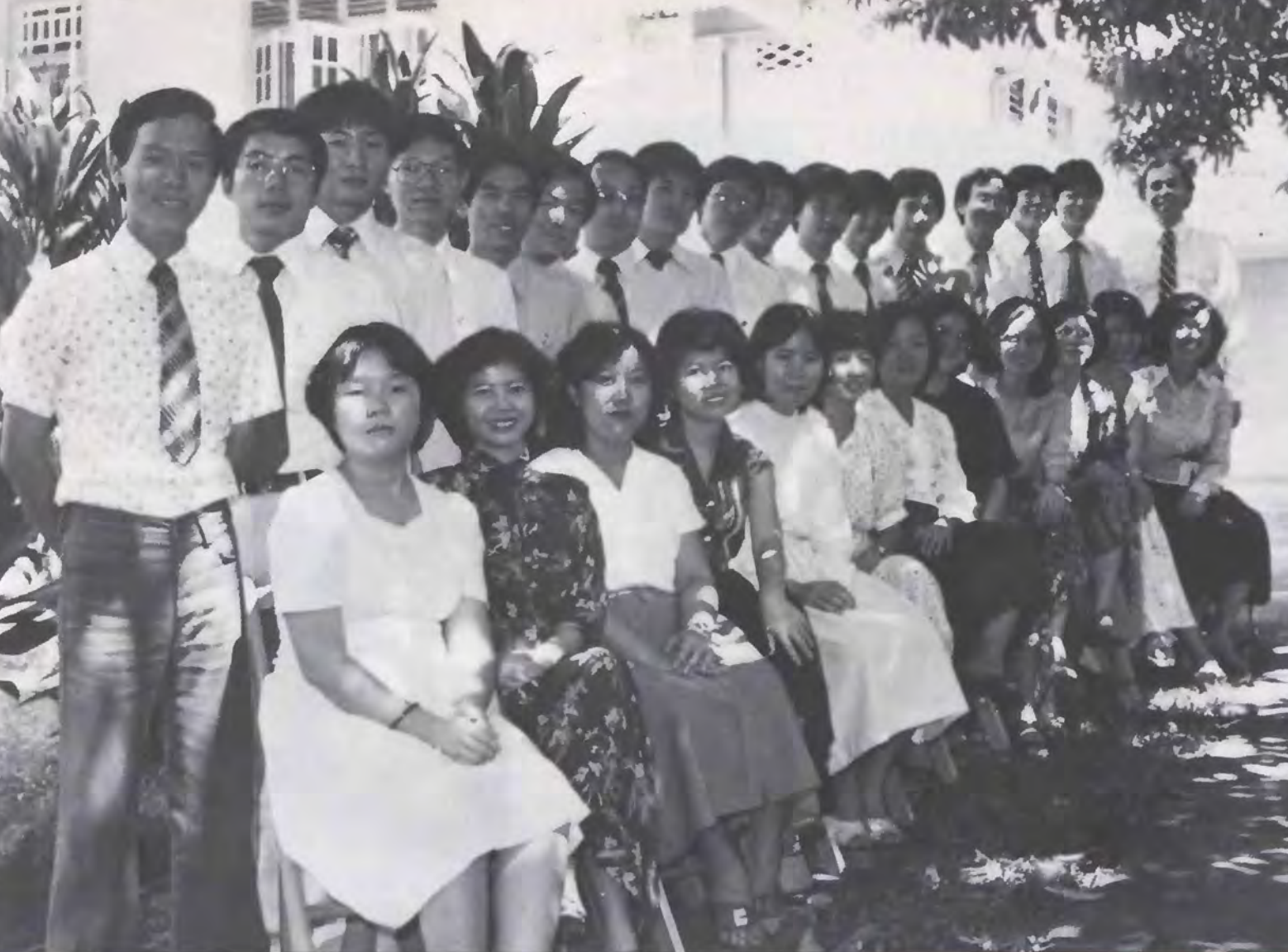
Singapore family in front of their home, "Far East Garden."