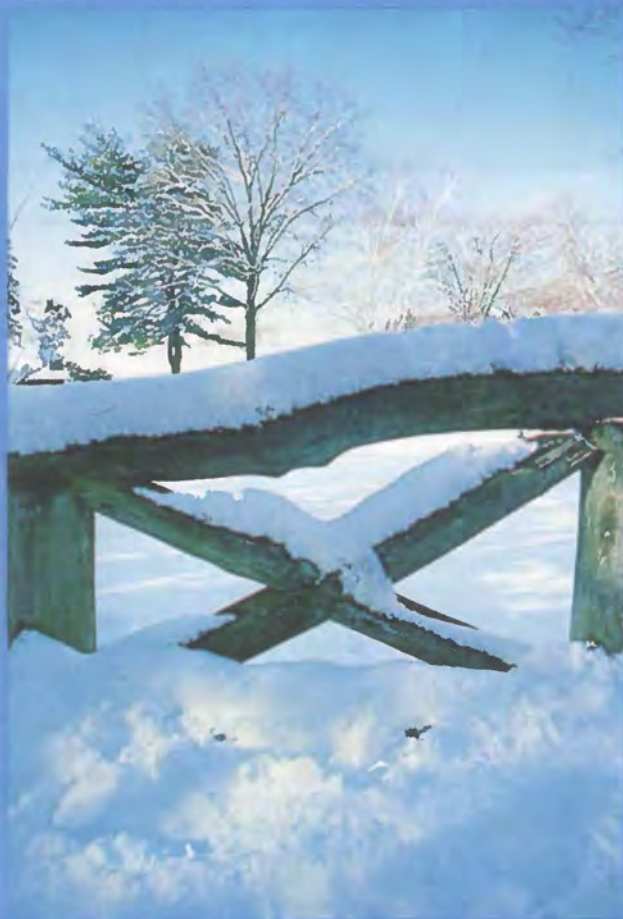
View from the little bridge over the lake.