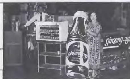
What Would God do in Singapore?