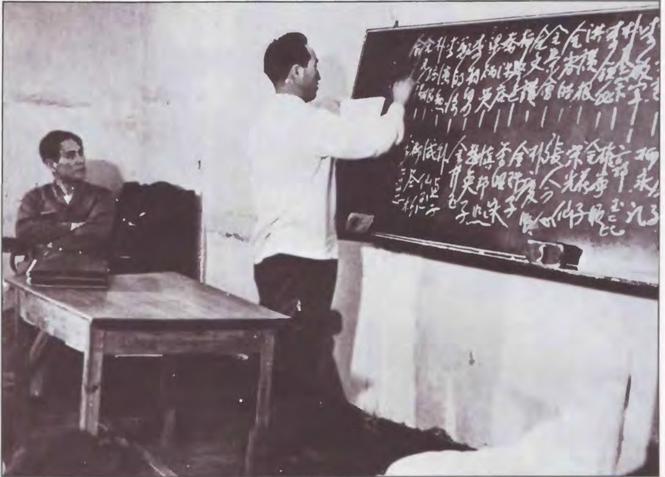
With Mr. Eu looking on, Father writes the names of the 124 couples blessed in 1963.

Can you die with your beloved? Can you forget the words of promise? Can you go over the hill which you believe impossible to cross?