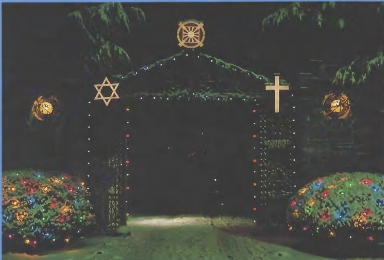
Holiday decorations at the front gate.