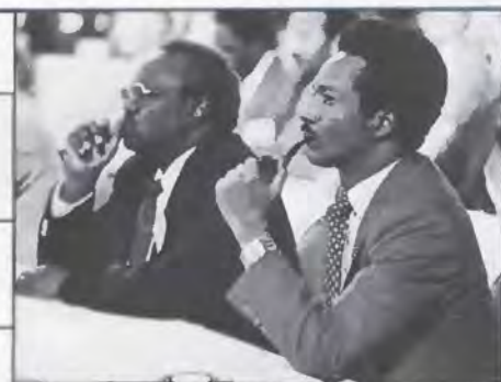
ICUS Scholars Search for Peace