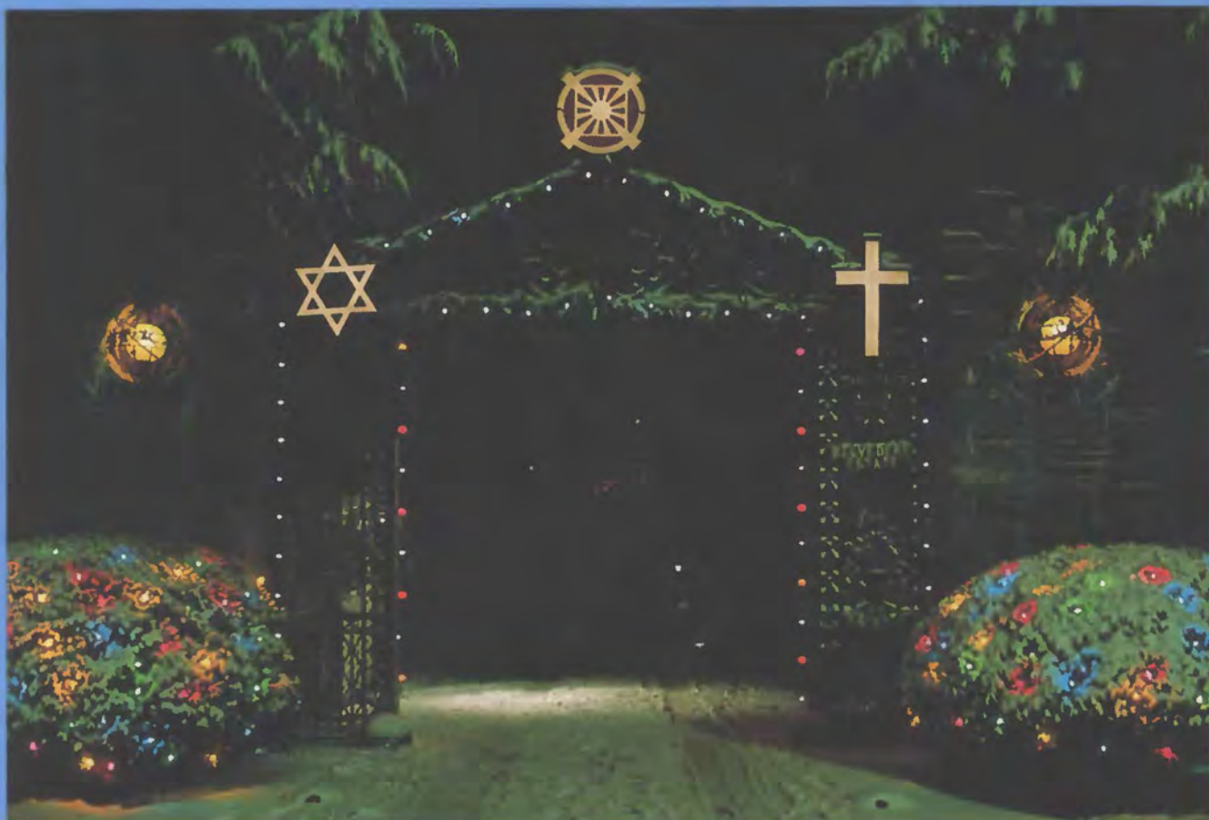
Holiday decorations at the front gate.