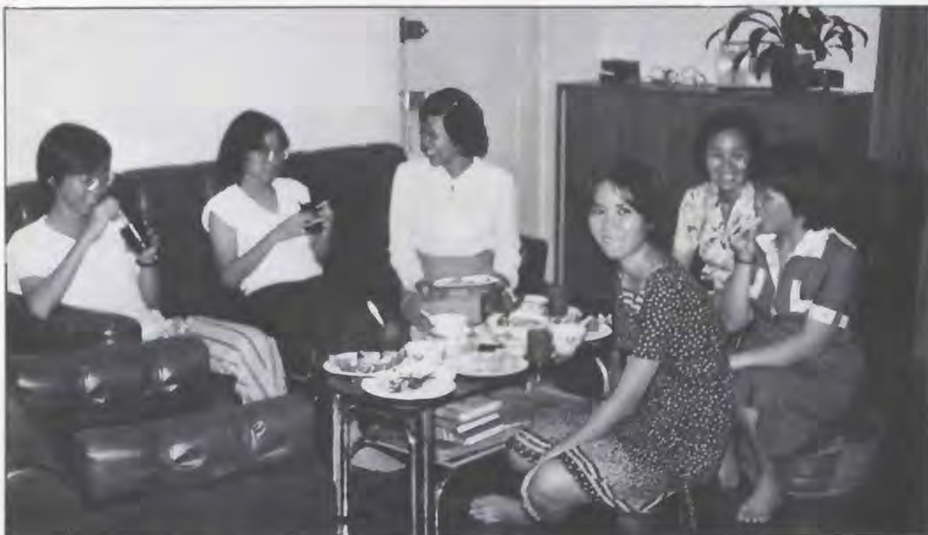
Fellowship in the Ang Mo Kio home church.

very friendly, but became suspicious when we revisited them. We need to become more popular among the neighbors, not for ourselves but in order to do Heavenly Father's will.