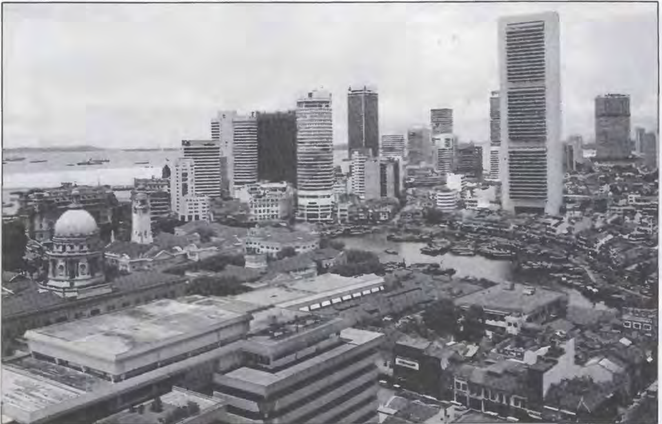
An over head view of skyscrapers and red rooftops, the harbor-city area of Singapore.

Until now, all throughout the world, we have always been hampered by the fact that it