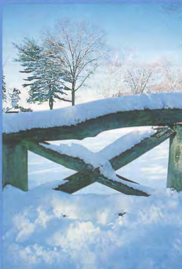
View from the little bridge over the lake.