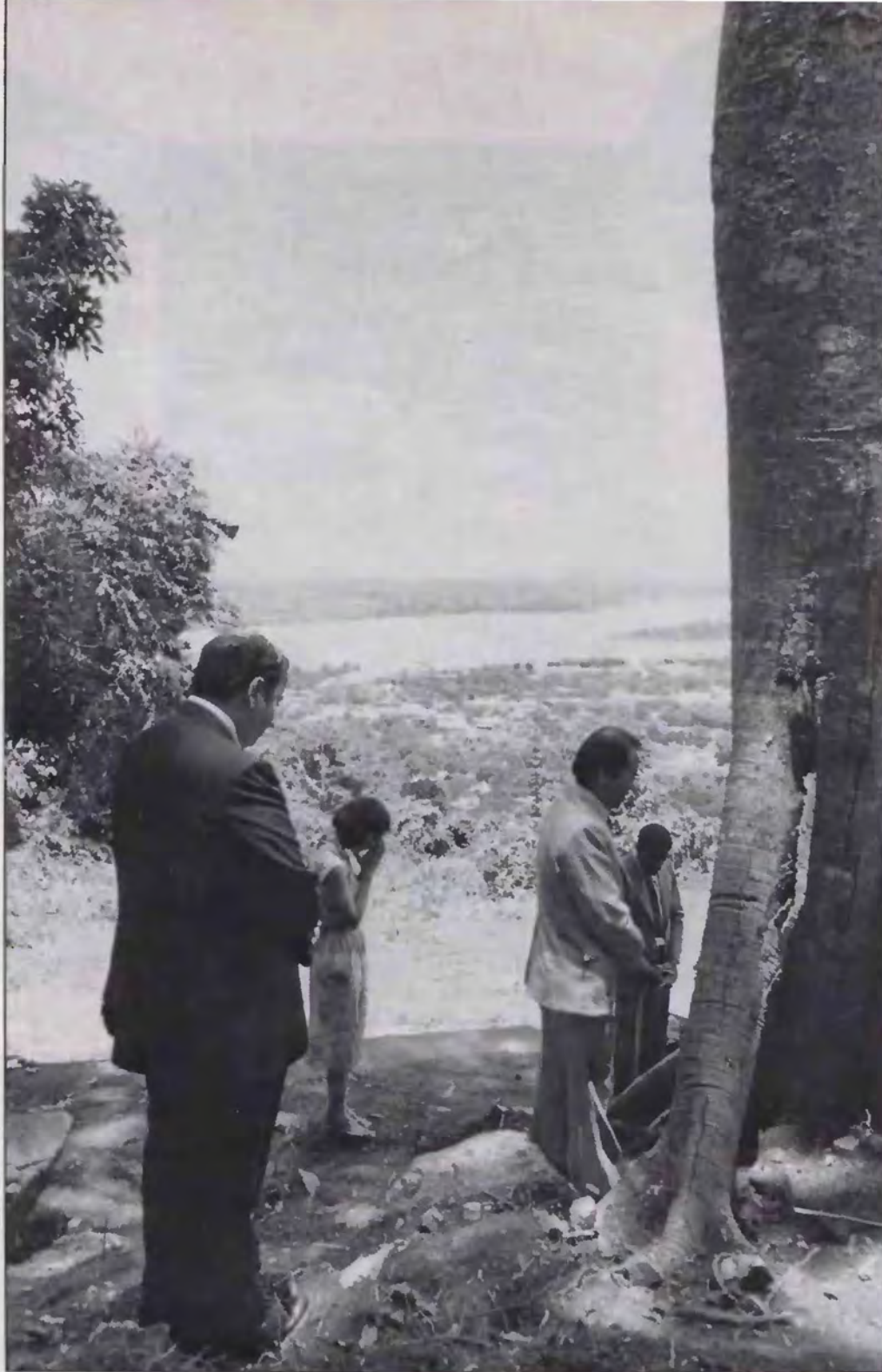
Holy ground overlooking Bangui.