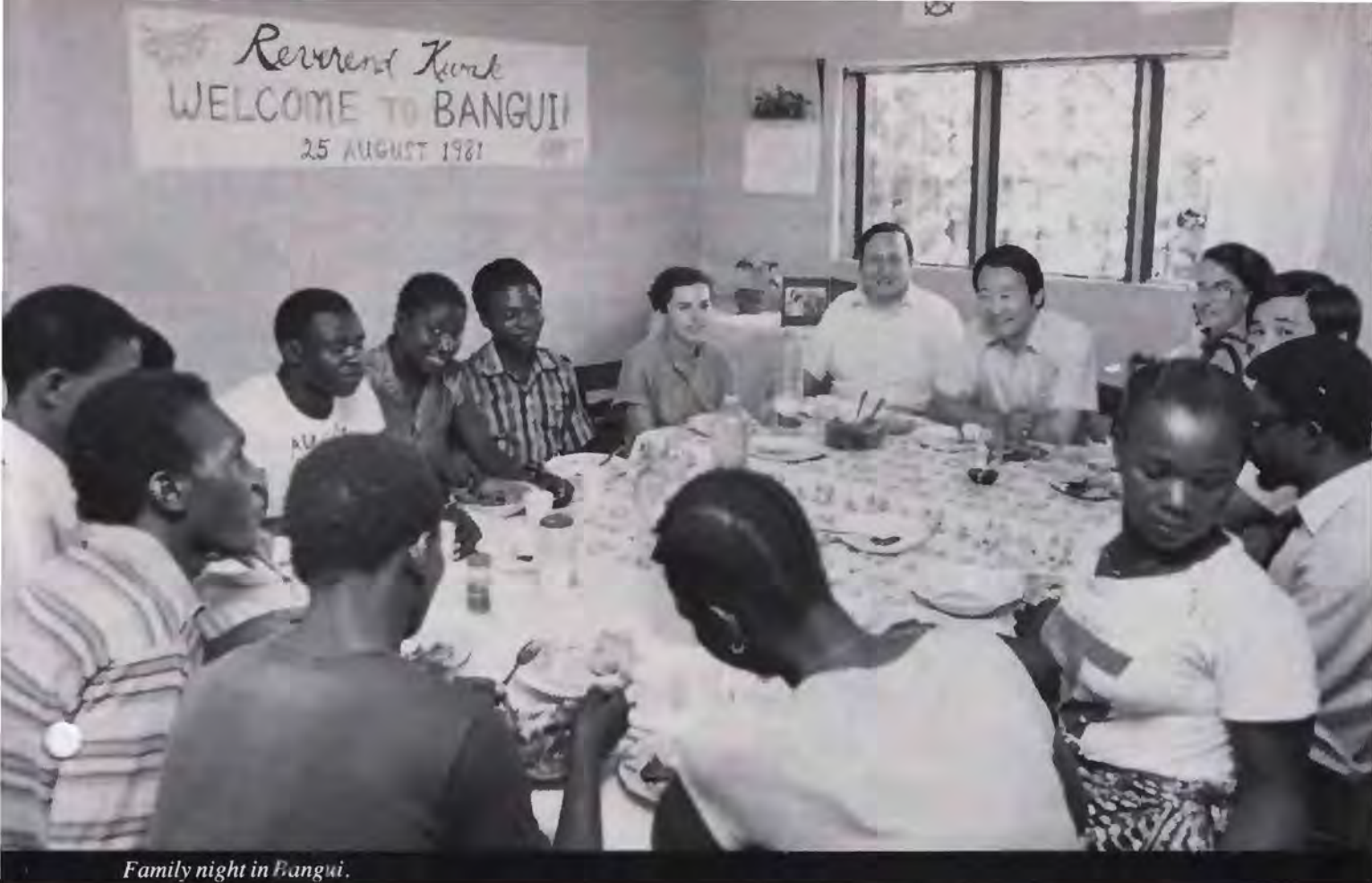
Family night in Bangui.

Christian missionaries. There are both Catholic and Protestant missions scattered all throughout the country; most seem to maintain some type of hospital or dispensary for the people in their area, as well as offering basic health or family education. But these efforts are far from adequate. Also, the education system is very inadequate and existing primary schools serve less than half the population. Less than 20 percent of the people under 40 are able to obtain a high school education and nearly all those over 40 are illiterate. Furthermore, job opportunities for the educated are extremely limited.