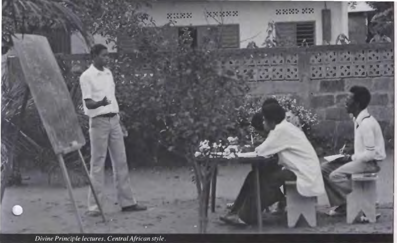
Divine Principle lectures, Central African style.

one cannot deeply understand culture, customs, and way of life. The Central African Republic is a French-speaking nation; that is, French is the official language, spoken in the government and by educated people, while Sango is the national language, spoken by nearly all the Central African people. So, when I arrived there, the conversation and atmosphere surrounding us were almost completely unintelligible. From the first day, I tried to speak my broken, high-school French, but rarely could other people understand, and even more rarely could I understand them. I so often felt that I was inside a plastic bag, and although I made sounds which I thought were intelligible, the people on the "outside" only understood these sounds as gibberish. So often I was nearly in tears, as people would ask, "What language are you speaking?" or say, "I'm sorry, but I don't understand Chinese."