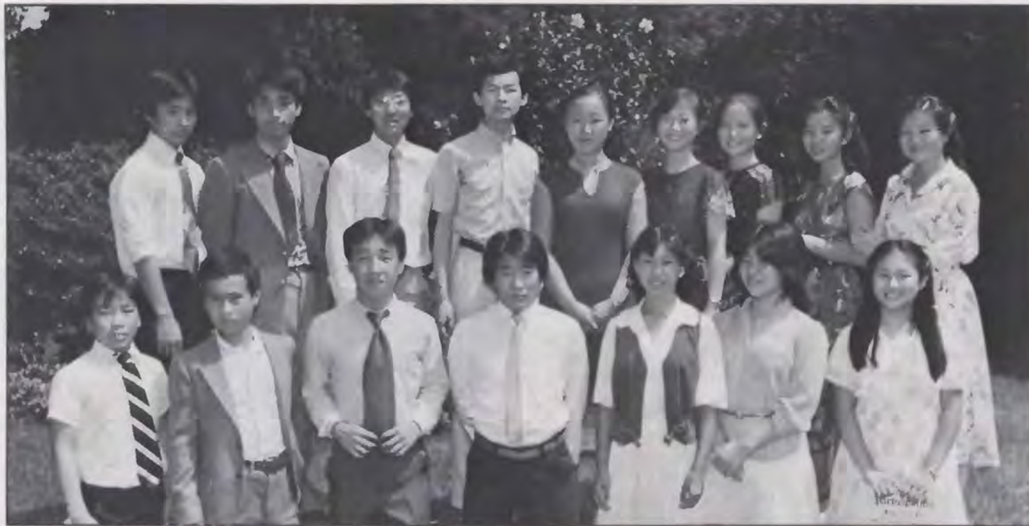
Some of the participants in last year's blessed children's workshop.

The blessing is something like a reservoir of water, and you are creating the channels that will lead the water into your lineage.