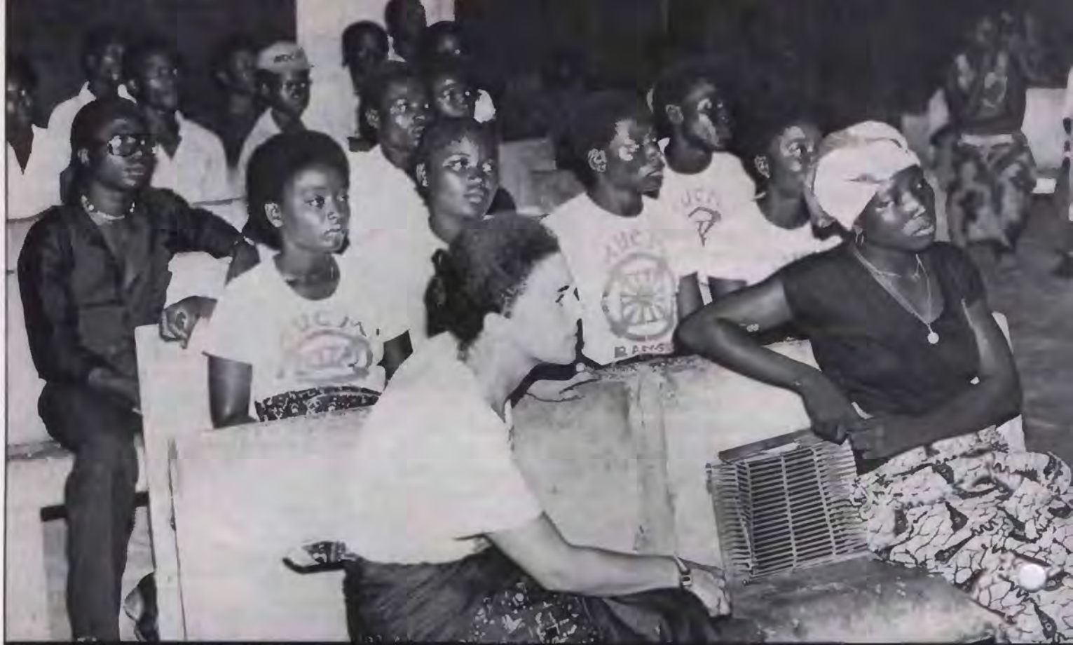
Part of audience at a public meeting.

I determined that I would somehow survive until love stirred, until love came from which wonderful spiritual sons and daughters would be born.