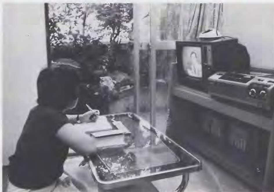
One guest watches Divine Principle video tape on the television.

Q: I heard one story about a man who is in your area. Can you tell us his testimony?