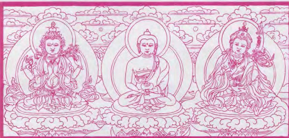
A Bodhisattva (representing the sacrificial ideal on earth), the Lord Gautama Buddha (the image of the ideal we all should become) and the Tibetan Guru Rinpoche, who introduced Buddhism to Tibet in the 7th Century A.D.