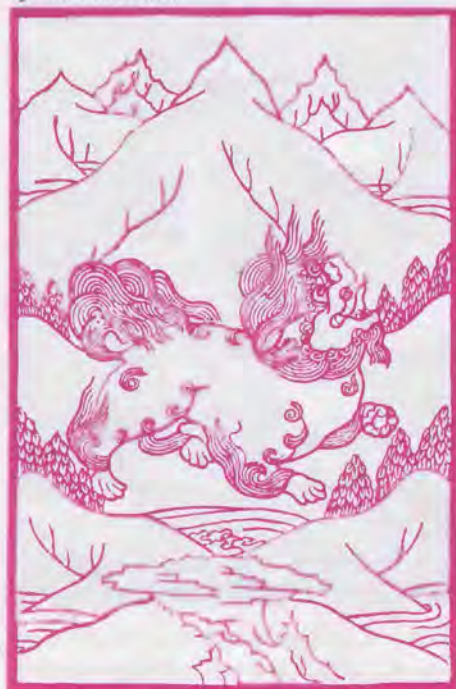
The white Tibetan snow lion, national symbol of Tibet.

including one of quotes by Buddha himself. Great struggles occurred within me in trying to comprehend what these fellows were talking about. "What attracted them to Buddhism?" I thought, "And why do they defend such seemingly absurd ideas, such as 'the negation of the ego,' the 'quest for emptiness,' and the meaning of 'the void, the non-void, and immaculate non-substance'! This is crazy."