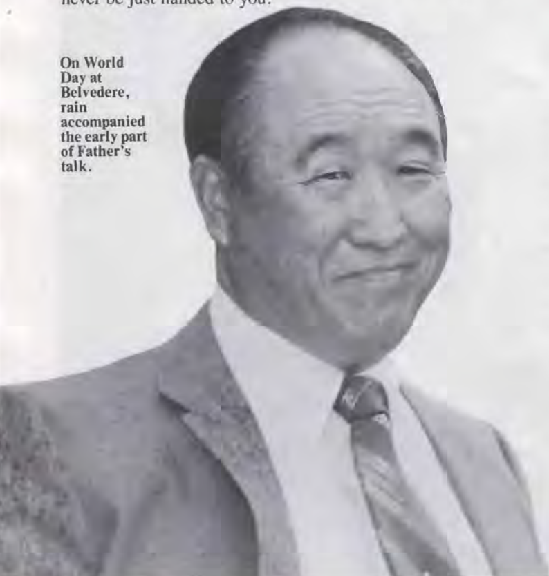
On World Day at Belvedere, rain accompanied the early part of Father's talk.

I never went and selected furniture for American leaders, and they wondered why not. It is because of this principle; your time will come. I must first take care of the family level, then the clan, then the nation... not the other way around. When you are building a house you build the foundation, then the lower level, then go up from there. When the 36 couples find themselves capable, the first thing they will do is find homes and furniture