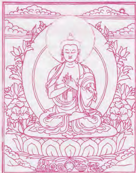
Gautama Buddha in the teaching position.

THE RECONCILIATION OF TWO GREAT RELIGIOUS TRADITIONS LIKE BUDDHISM AND CHRISTIANITY IS TRULY AN ALMOST INSURMOUNTABLE TASK.