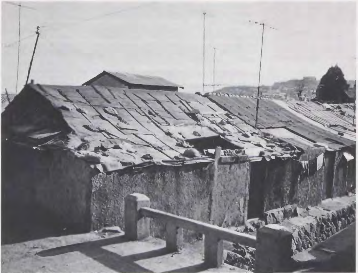
Houses similar to the one in which Father began writing Principle in 1951.