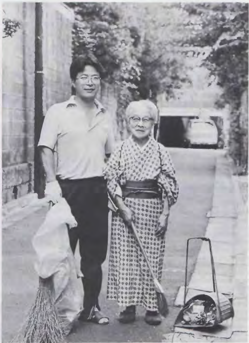
My first home church grandma!

We repeat it again and again, "Let's work for that purpose. We're not work-