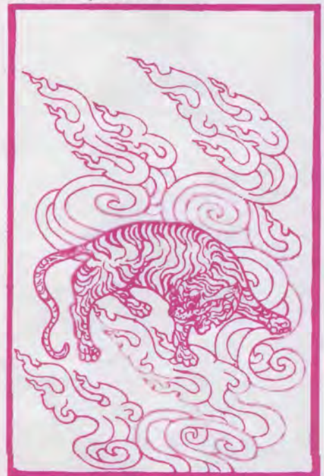
The Air Tiger, shown soaring high over the Himalayan clouds.

THE SAME MISINTERPRETION OF RELIGIOUS LEADERS' WORDS HAS OCCURRED IN EVERY RELIGION FOR THE SAME REASONS: IGNORANCE, PRIDE, ARROGANCE.