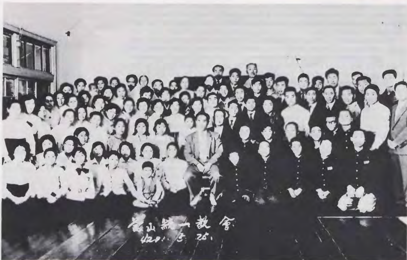
Unification Church members in Pusan in 1958.

MOST PEOPLE SPEAK TENTATIVELY, BUT FATHER WAS FILLED WITH CONVICTION